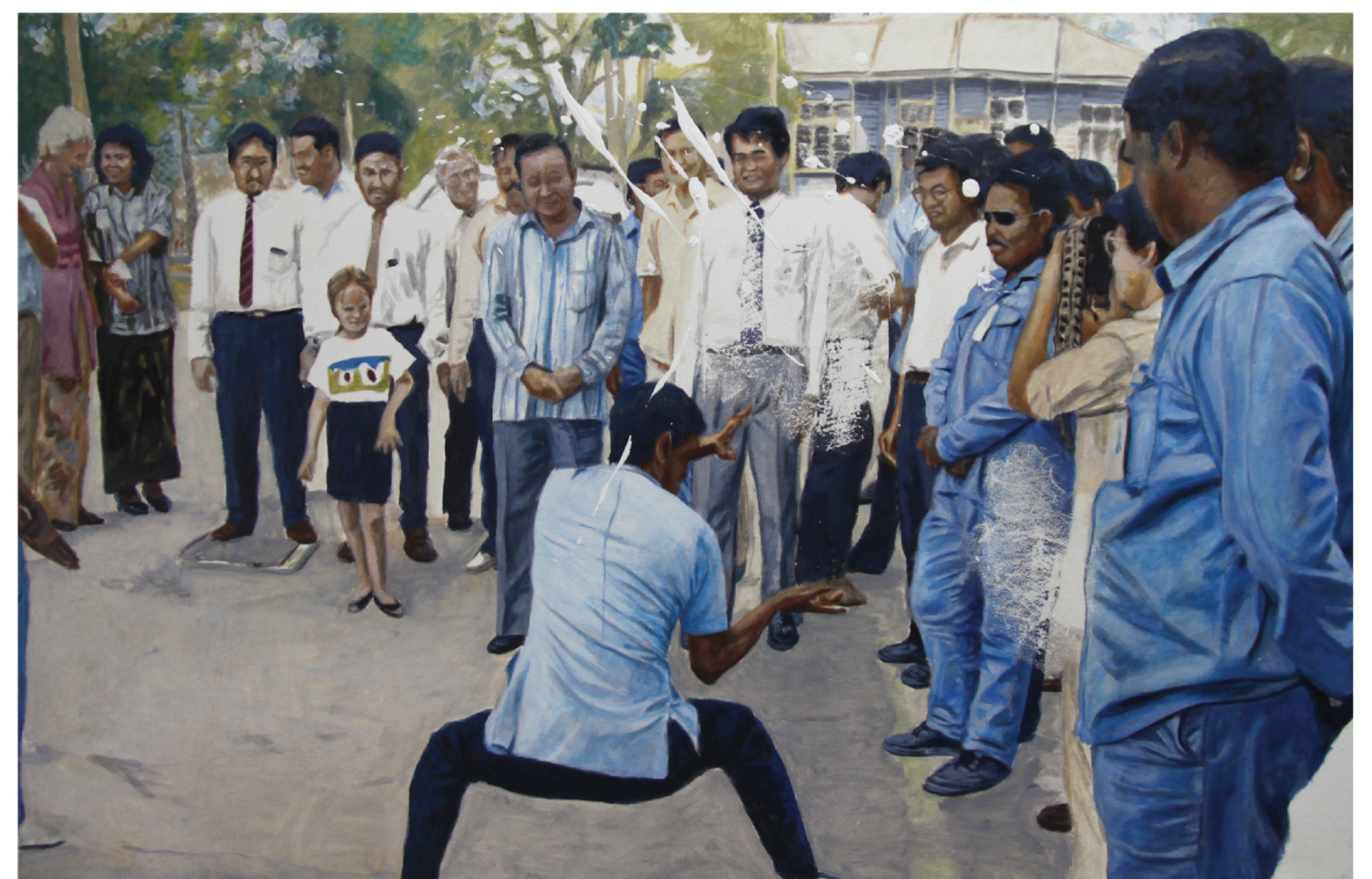
Emulation Subseries 1 of 3 - Abugit Spek Hitam