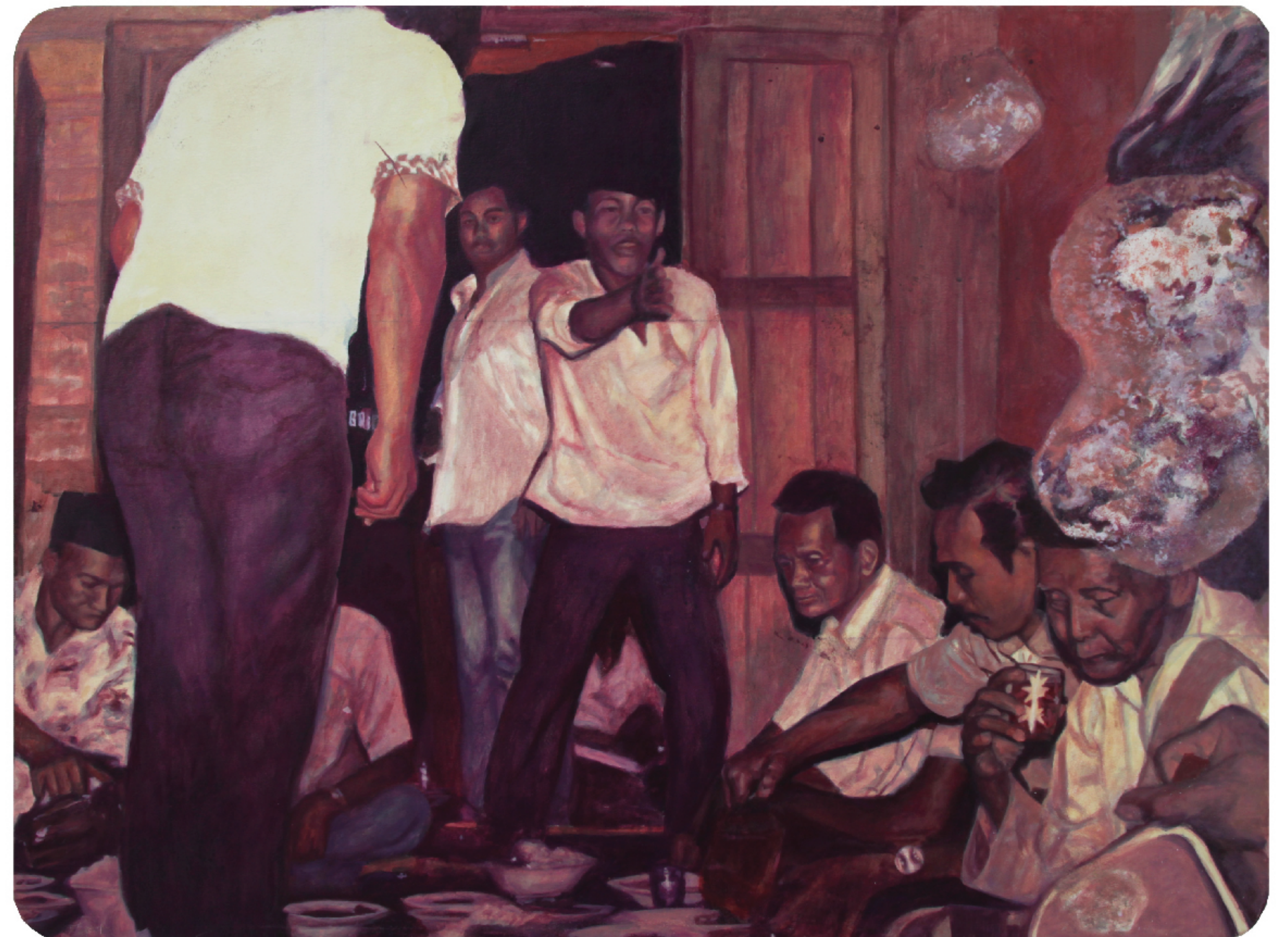
Samekom 1981, version 2 of 3