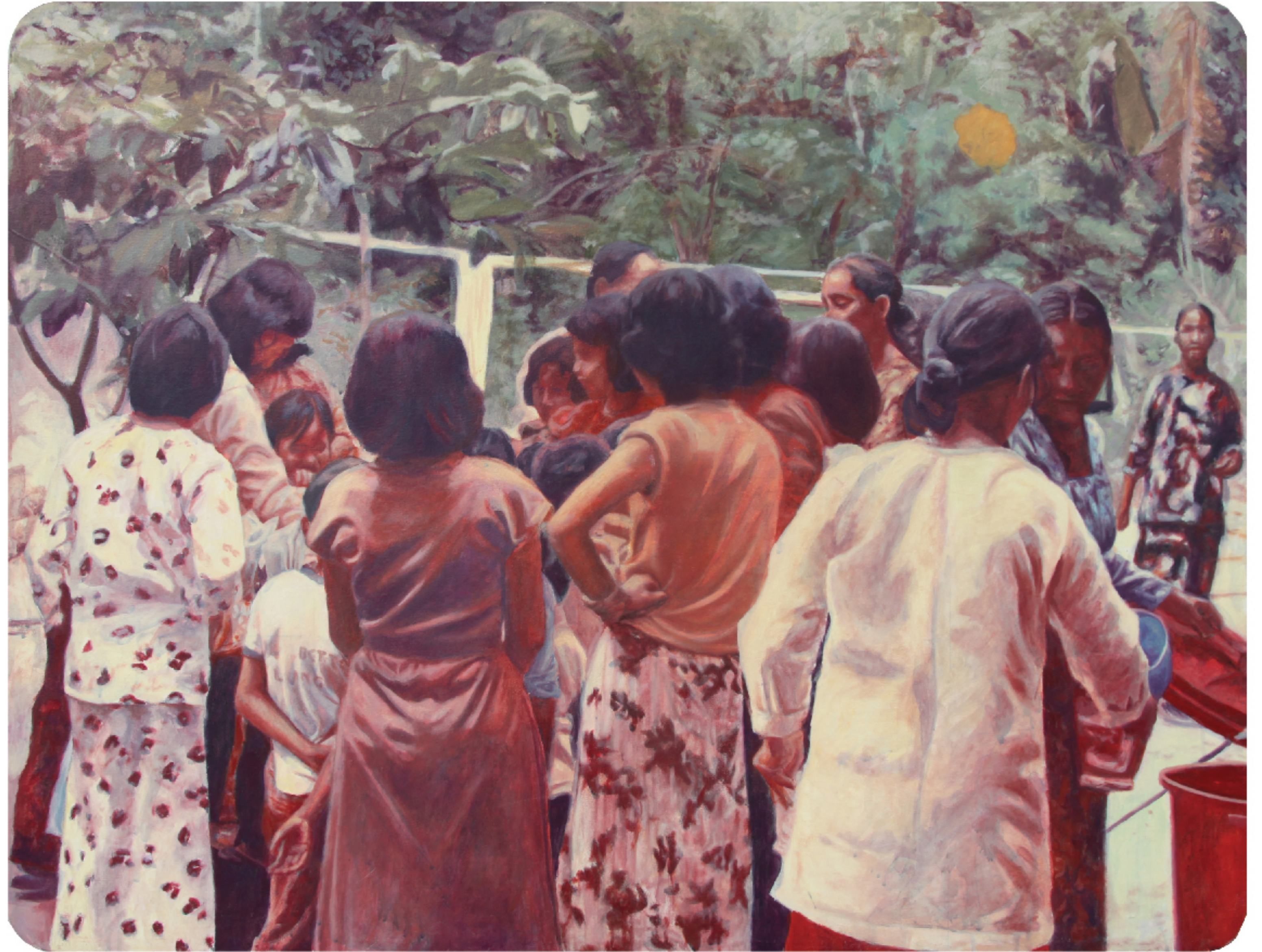
Birthday Backs 1981

Extending from the materialist stance of Sulaiman Esa and Redza Piyadasa's Mystical Reality , Amar Shahid hopes to reinstate discussions of formalism back into art criticism, with issues relevant to the local sphere of art and culture. In his latest artwork, Amar tends to question the definition of both two-dimensional and three-dimensional planes by suggesting unforeseeable ways to solve the equation.