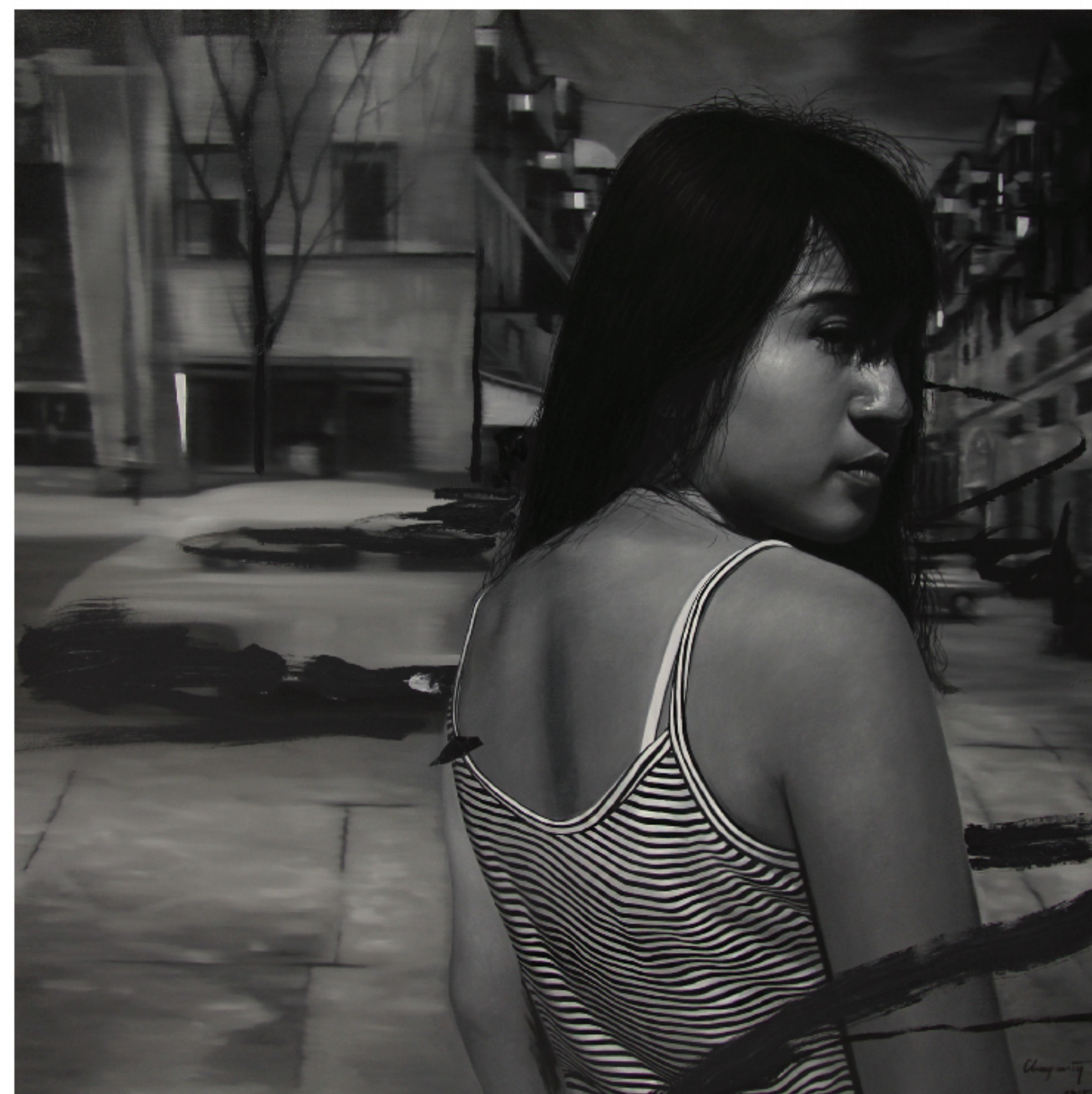
Women In City No.2

100 x 100 cm Acrylic & Oil on Canvas 2015