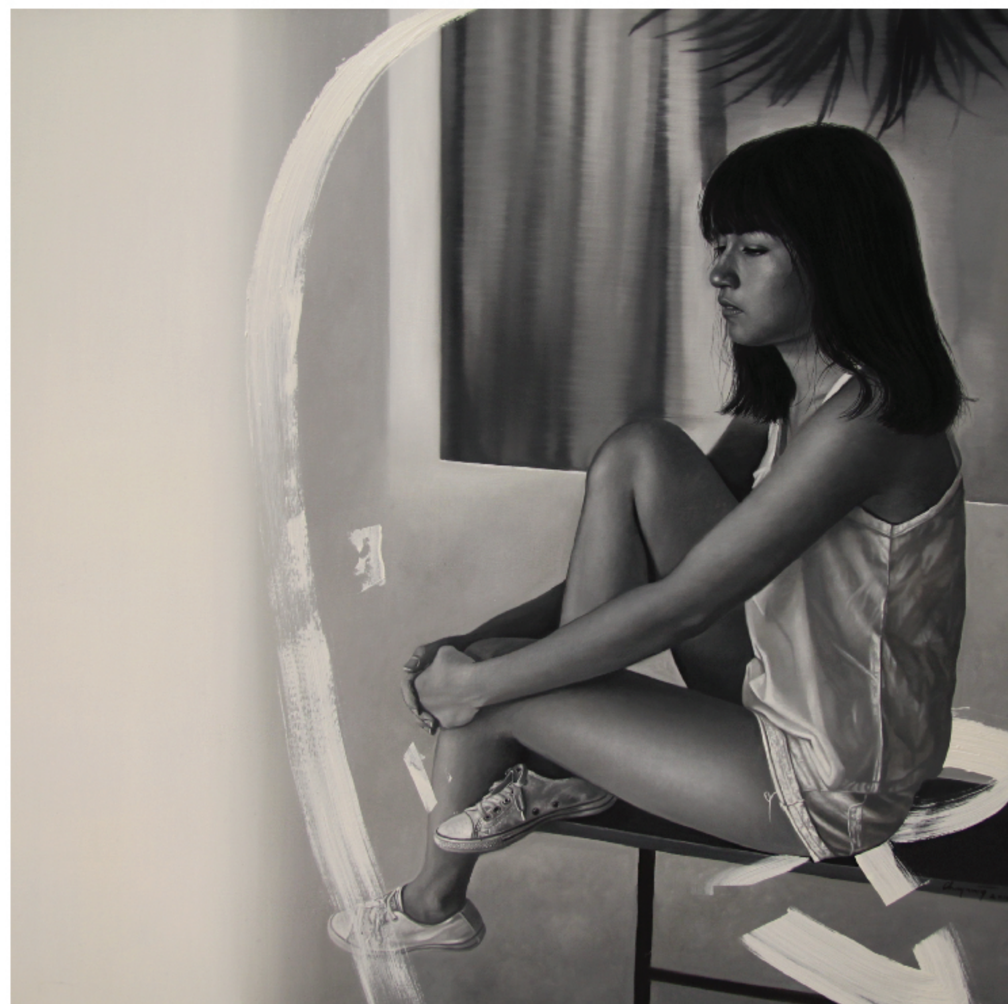
Women In City No.1

100 x 100 cm Acrylic & Oil on Canvas 2015