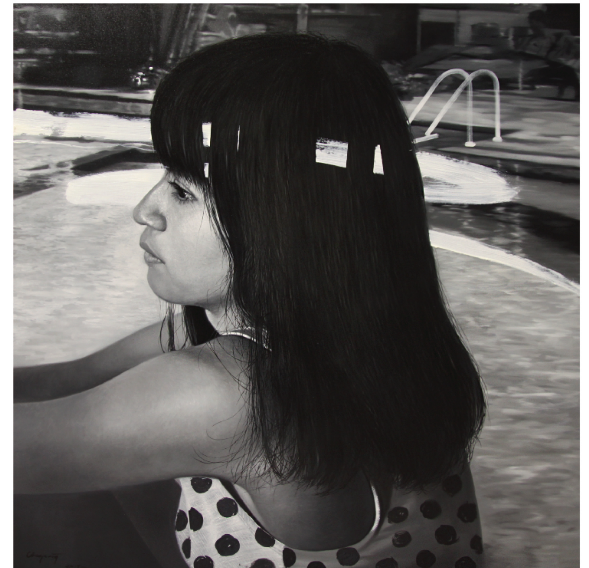
Women In City No.3

100 x 100 cm Acrylic & Oil on Canvas 2015