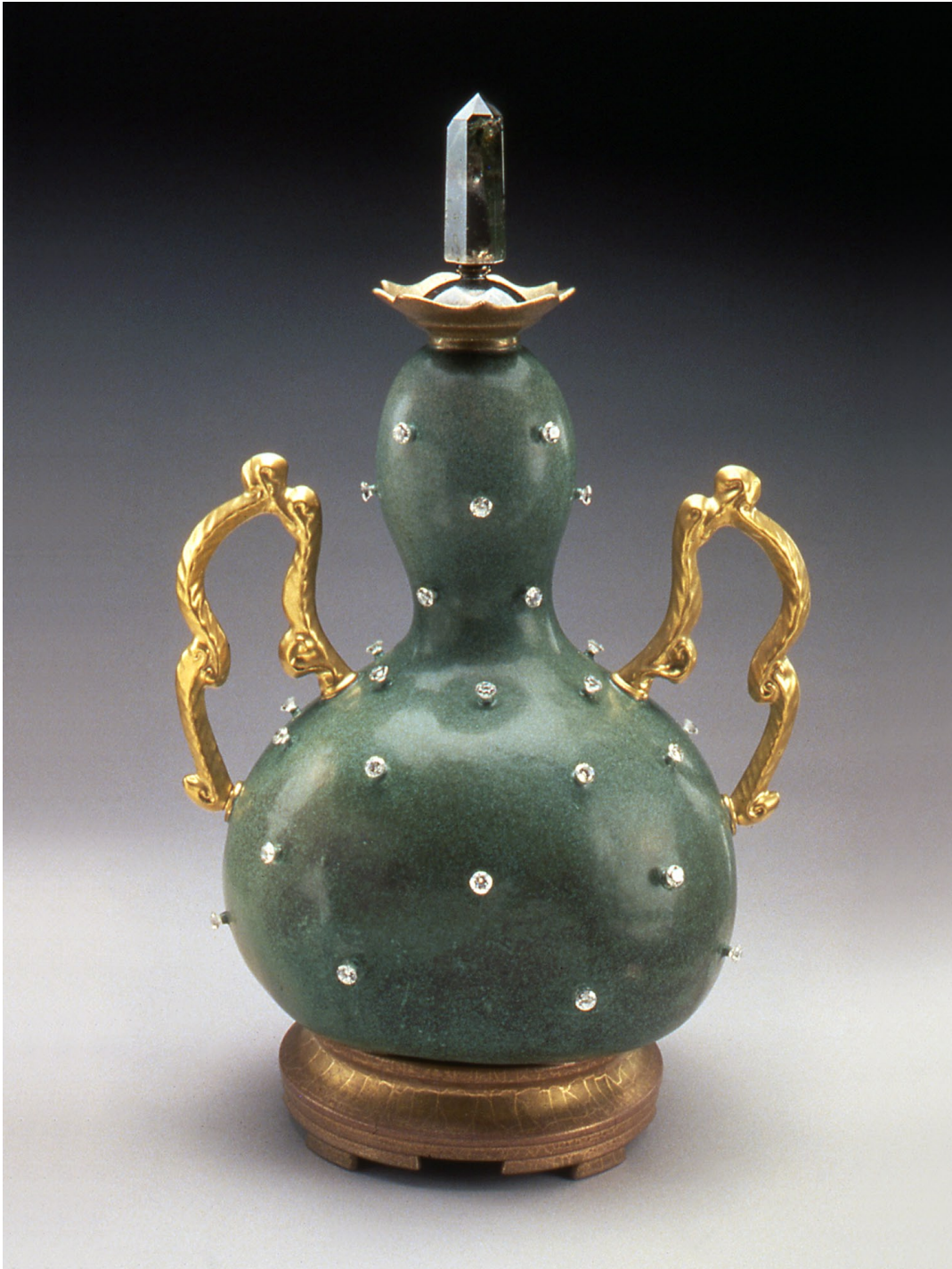
Shirley's Friend , 1989 porcelain, lusters, faceted cubic zirconia, and Brazilian phantom quartz crystal 21 x 13 x 9 ¾ inches