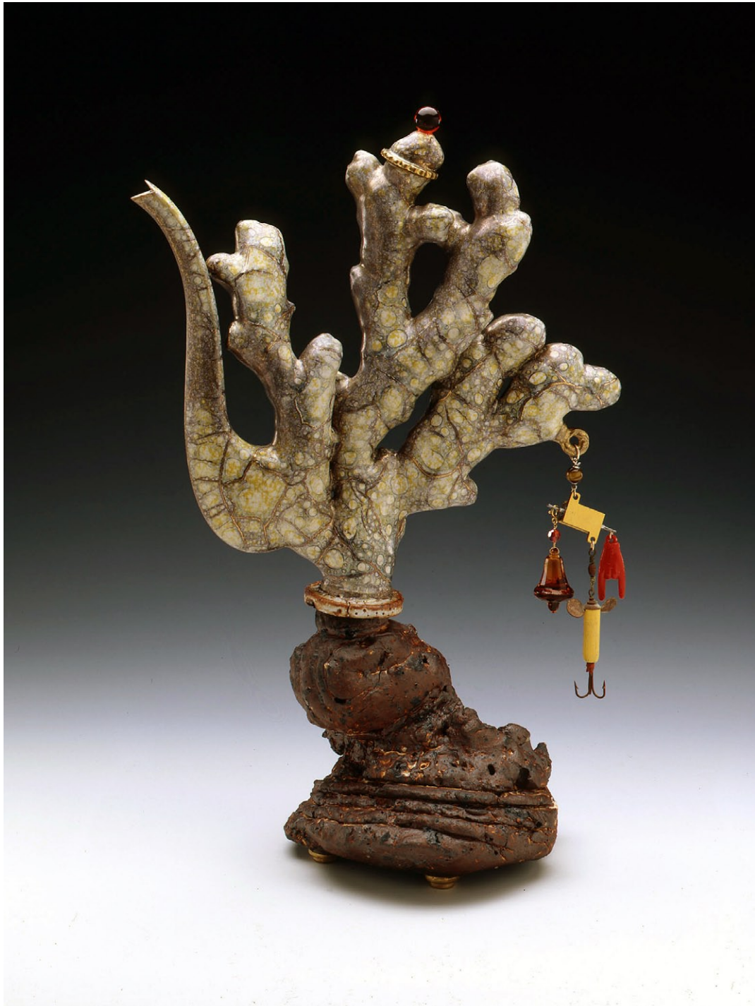
Untitled Ewer (San Gennaro) , 1994 porcelain, stoneware, and mixed media 14 ¼ x 9 ¼ inches