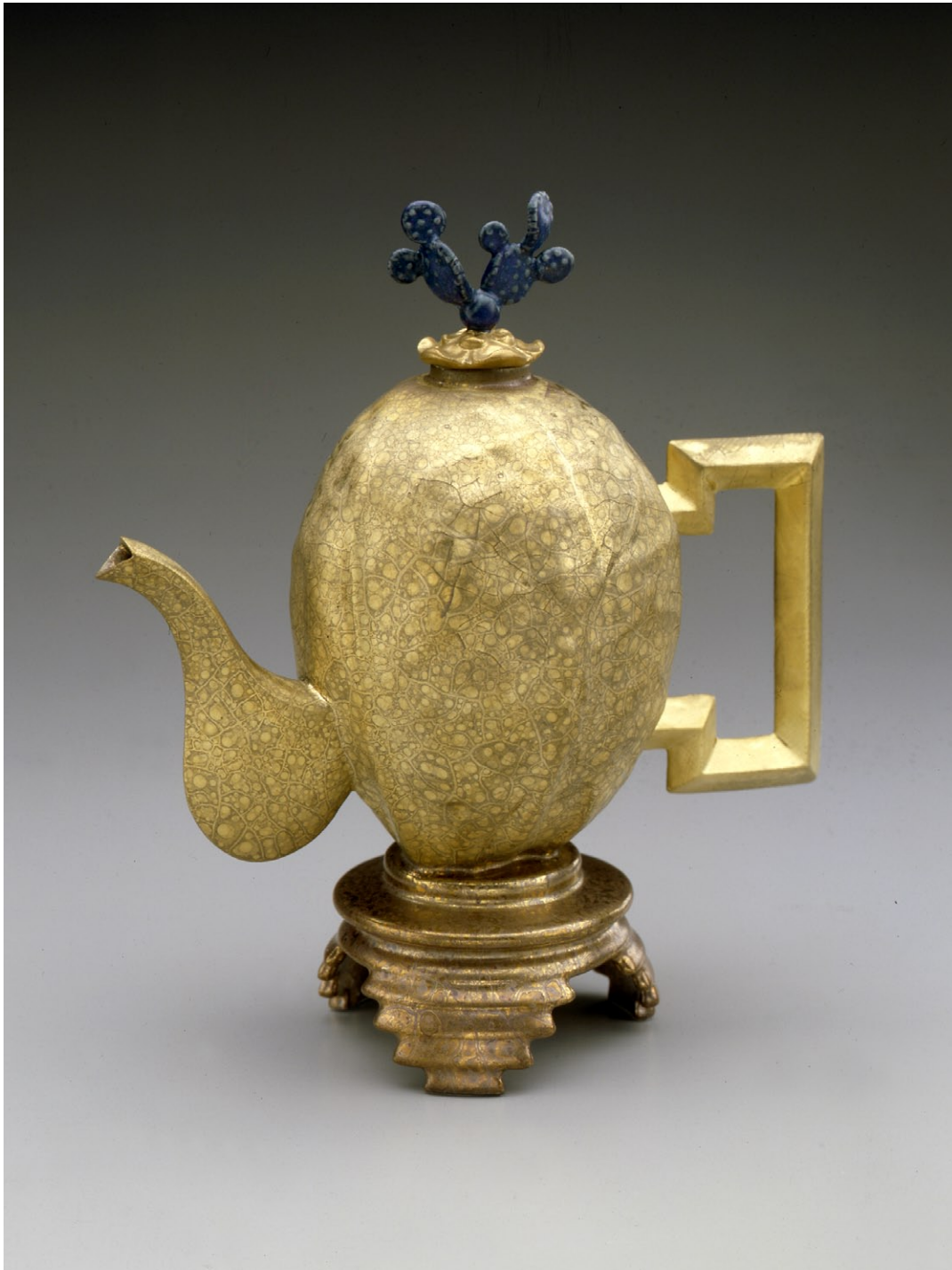
Gold Cabbage Teapot , 1990 porcelain 9 ¼ x 9 inches