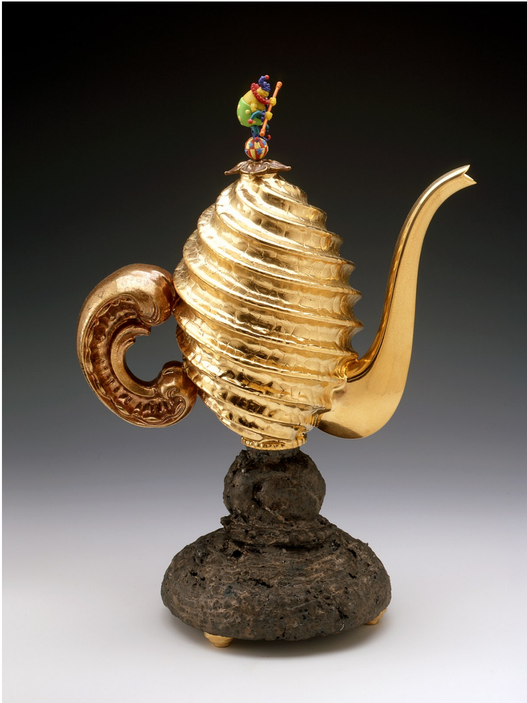
Untitled Ewer (Fungo-Bungo) , 2004 porcelain, stoneware, and mixed media 14 \frac{1}{8} x 8 \frac{5}{8} x 6 \frac{3}{4} inches