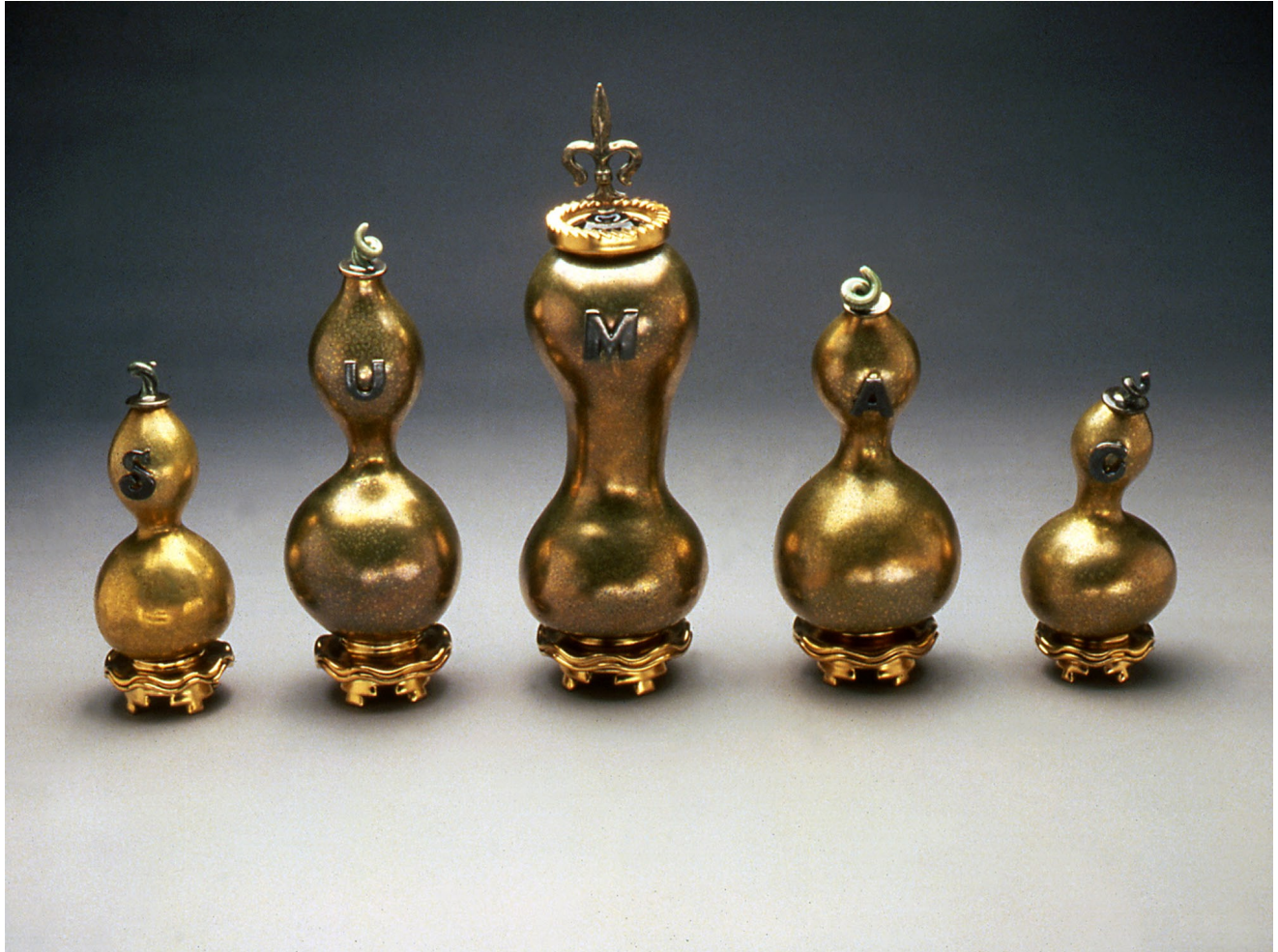
Amy-Yma (Camus-Sumac) , 1989 garniture of five porcelain gourds 15 x 30 x 4 ½ inches