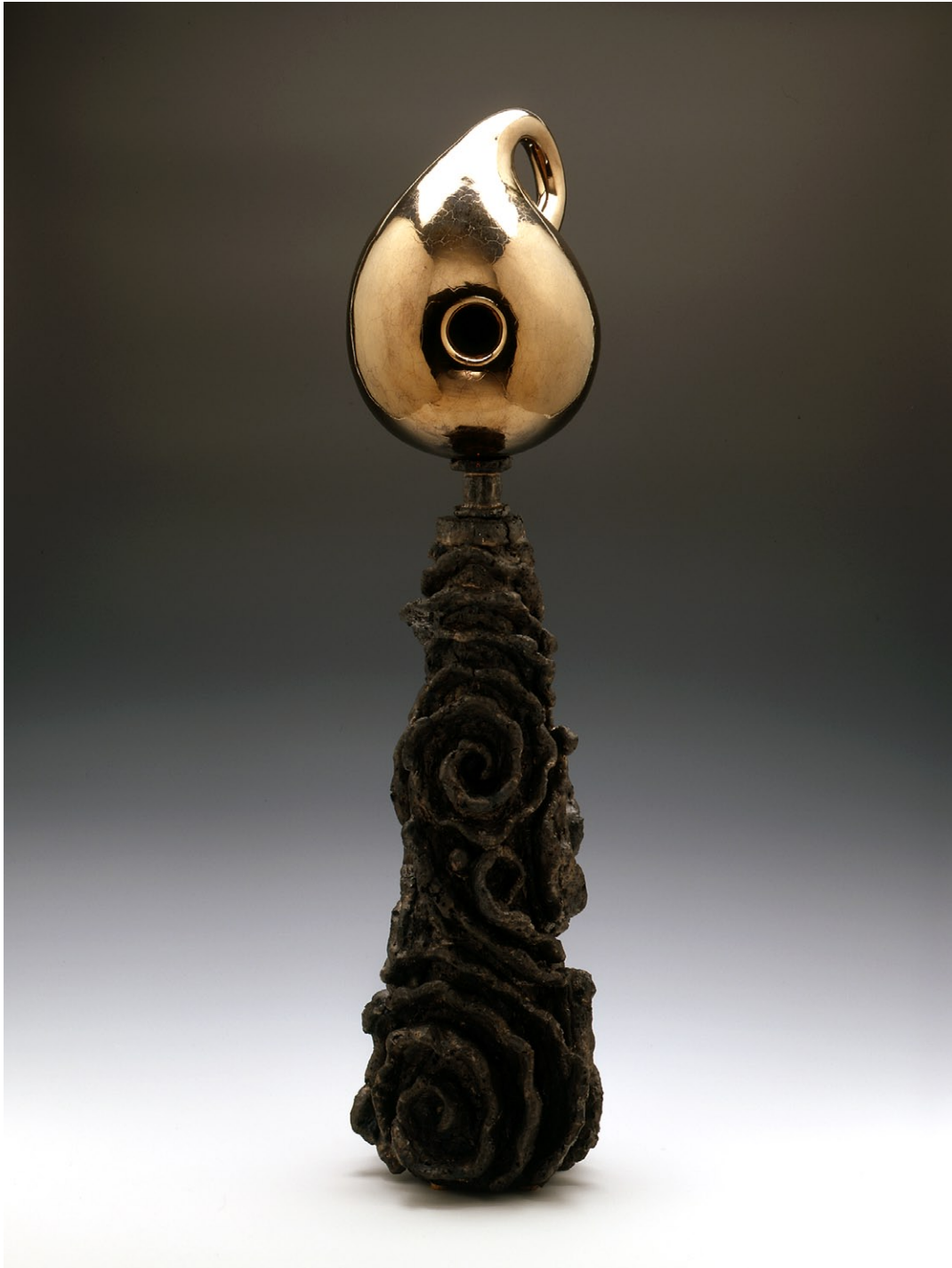
Golden Extremophile , 2004 earthenware and stoneware 33 ½ x 8 x 7 ¼ inches