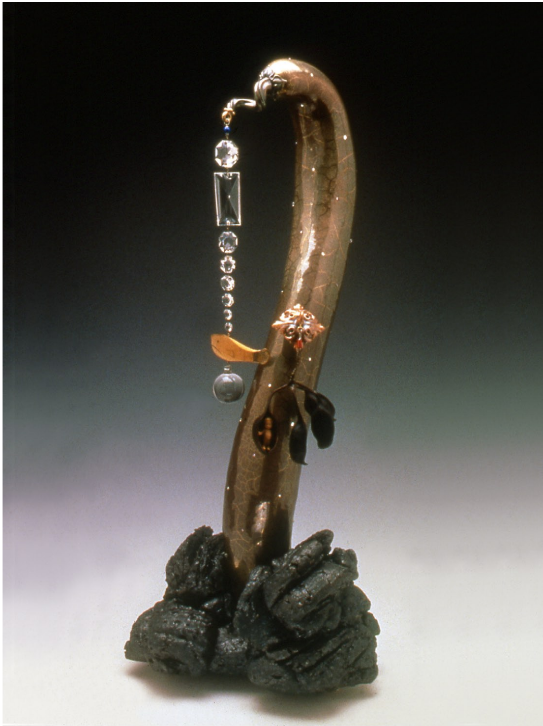
Come on Baby! Light My Fire Hydrant , 1993 porcelain, stoneware, mixed media 30 x 12 inches