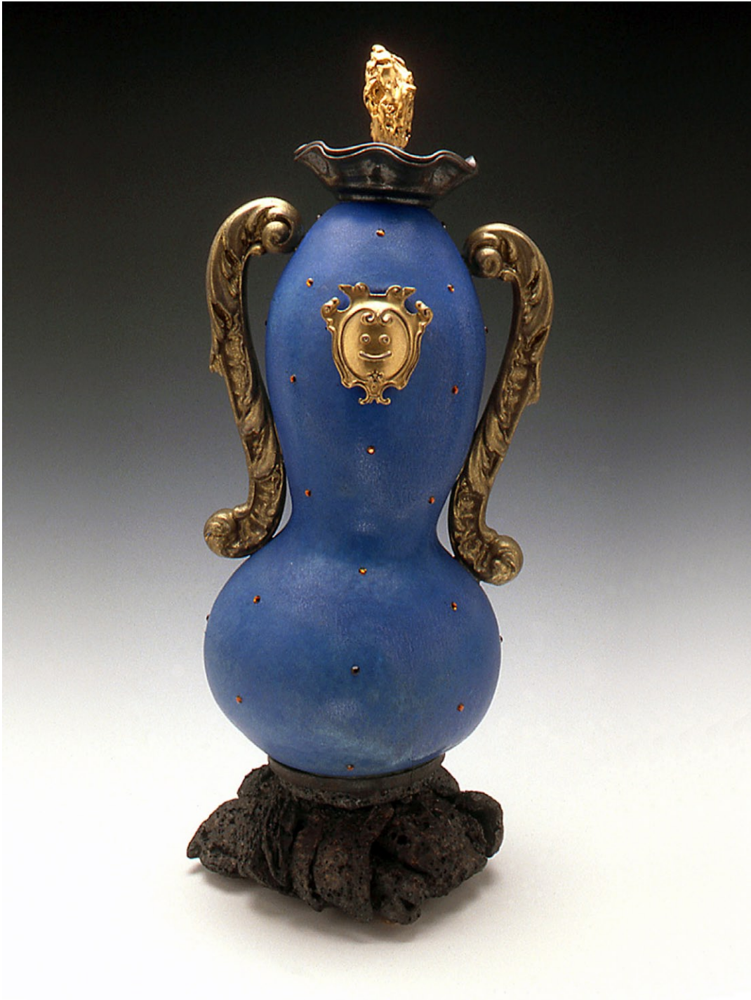
Clue: Book - Cheese - Ribbon , 1993 porcelain and mixed media 23 \frac{3}{4} x 9 \frac{1}{4} x 8 inches