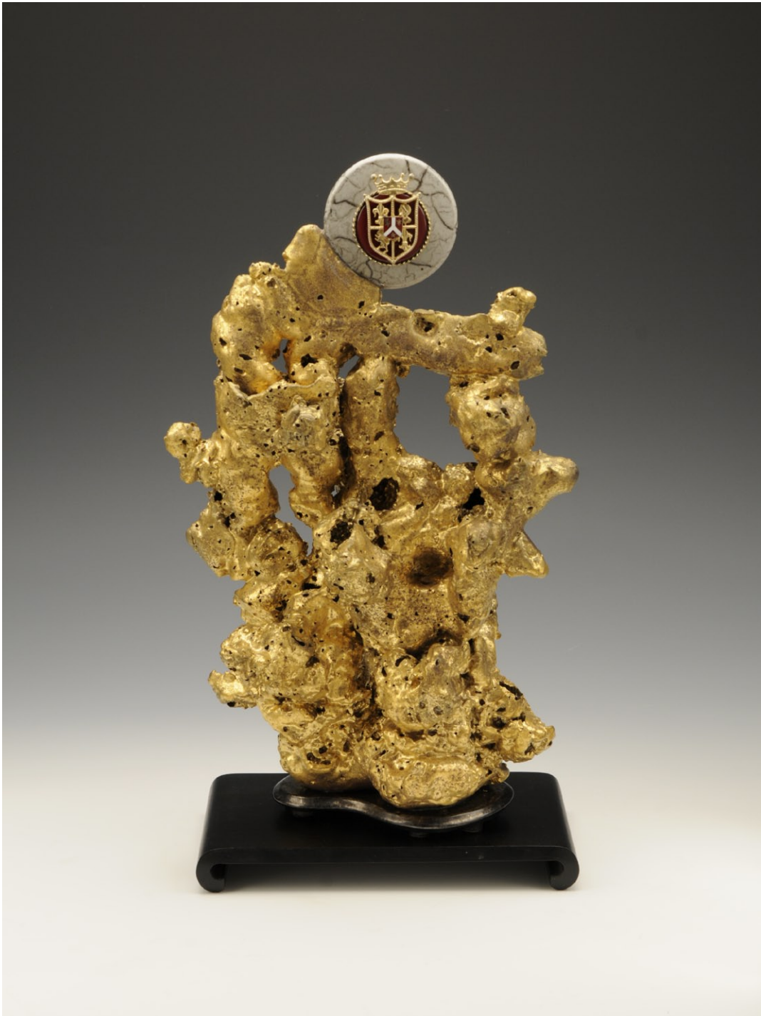
Welcome Stranger , 2011 porcelain, lusters and mixed media on Antique wood base 14 \frac{3}{4} x 8 \frac{1}{4} x 5 \frac{1}{4} inches