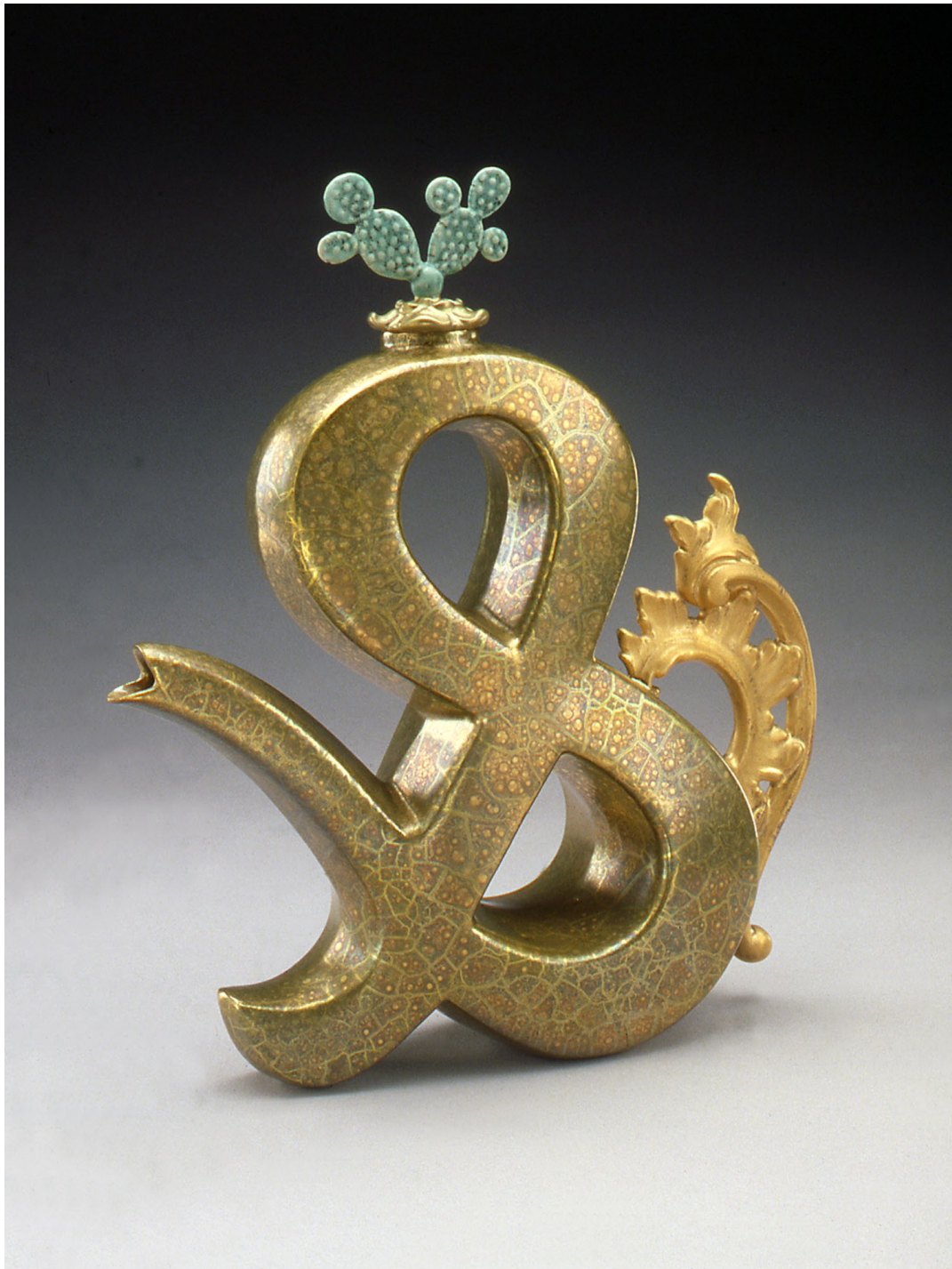
Untitled Ewer (Franklin Gothic Italic Ampersand) , 1989 porcelain 10 ¼ x 9 inches