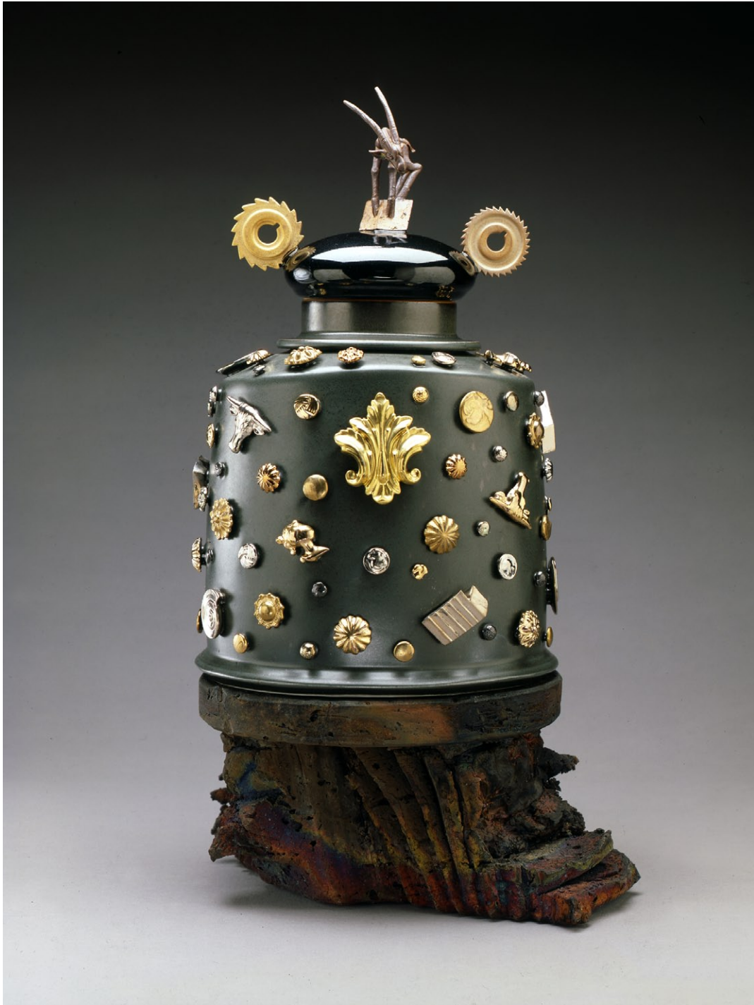
Untitled Covered Jar on Stand with Antelope Finial (Garth Vader), 1986 porcelain, raku, stoneware, and lusters 20 3/4 x 12 x 11 inches