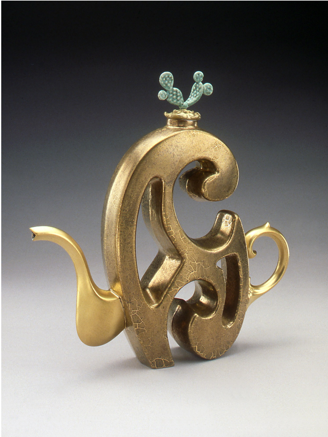
Untitled Ewer (French Curve) , 1987 porcelain and stoneware 11 ½ x 7 inches