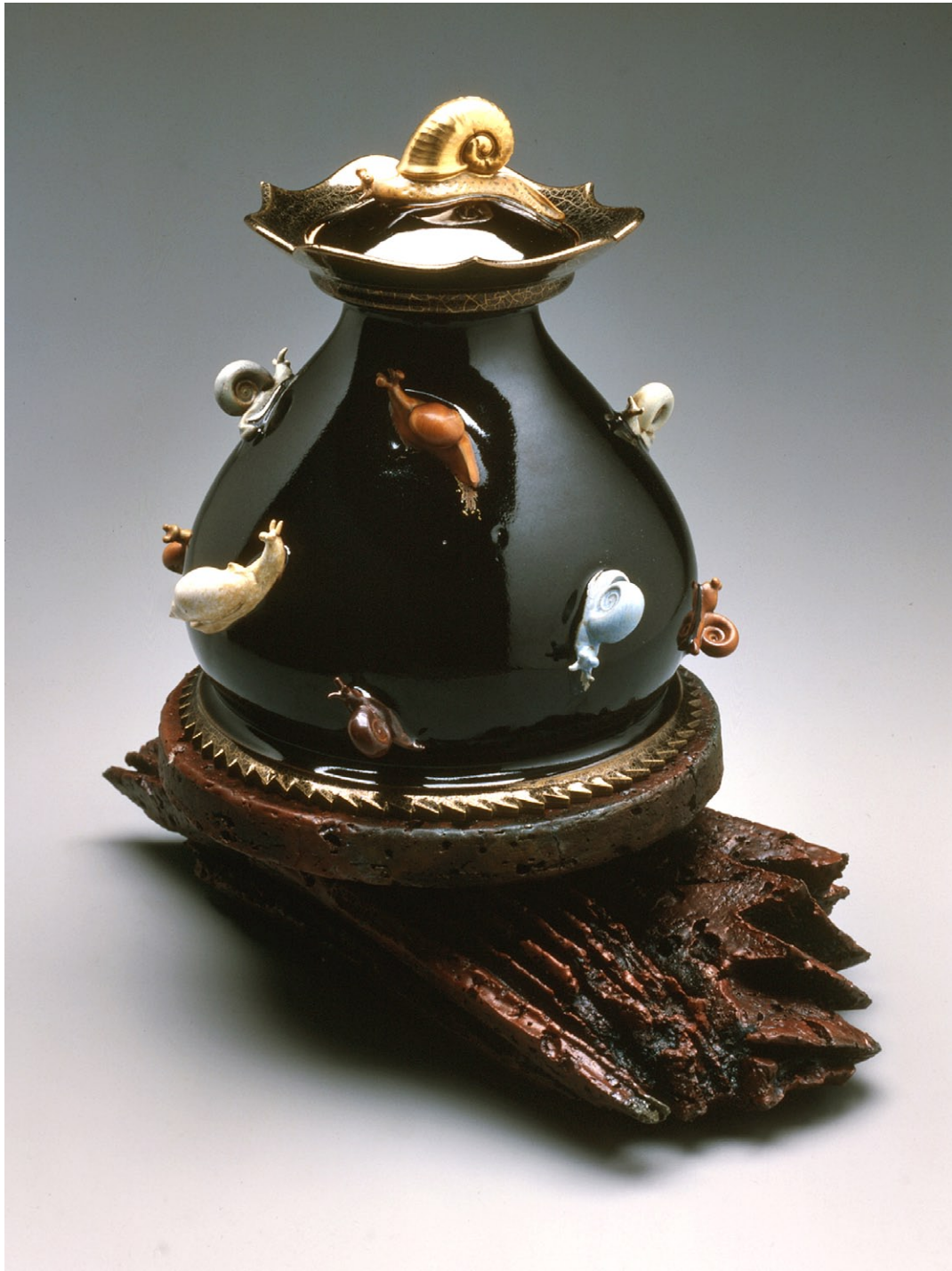
Untitled Covered Jar on Stand, 1987 porcelain, raku, and lusters 15 ½ x 16 x 9 inches