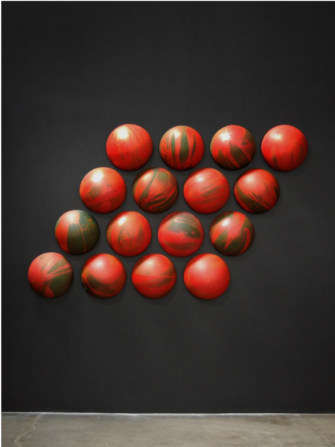
4 squared - Chrome Crystalline Array , 1968 earthware 50 ¾ x 82 inches