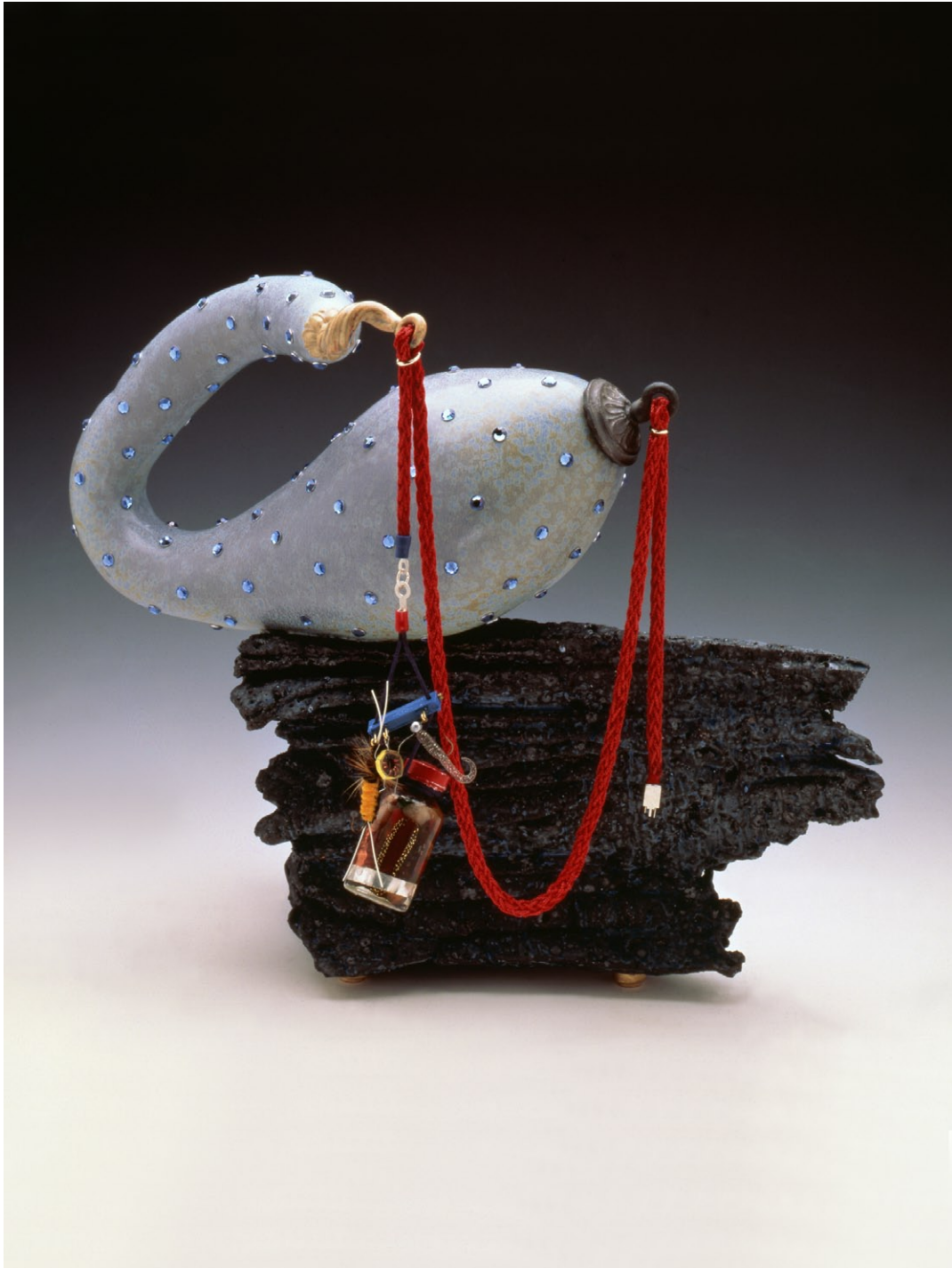
Sur le bout de la langue , 1991 porcelain, raku, lusters, blue sapphire rhinestones, and found objects 13 ½ x 15 x 11 inches