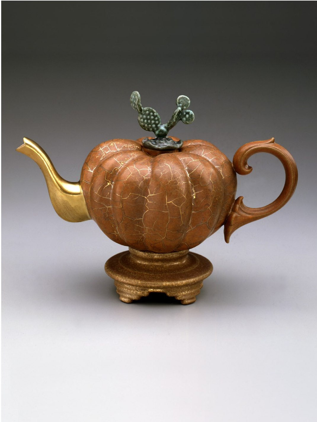
Acorn Squash Teapot with Gold Veining , 1990 porcelain 7 ½ x 9 ½ inches