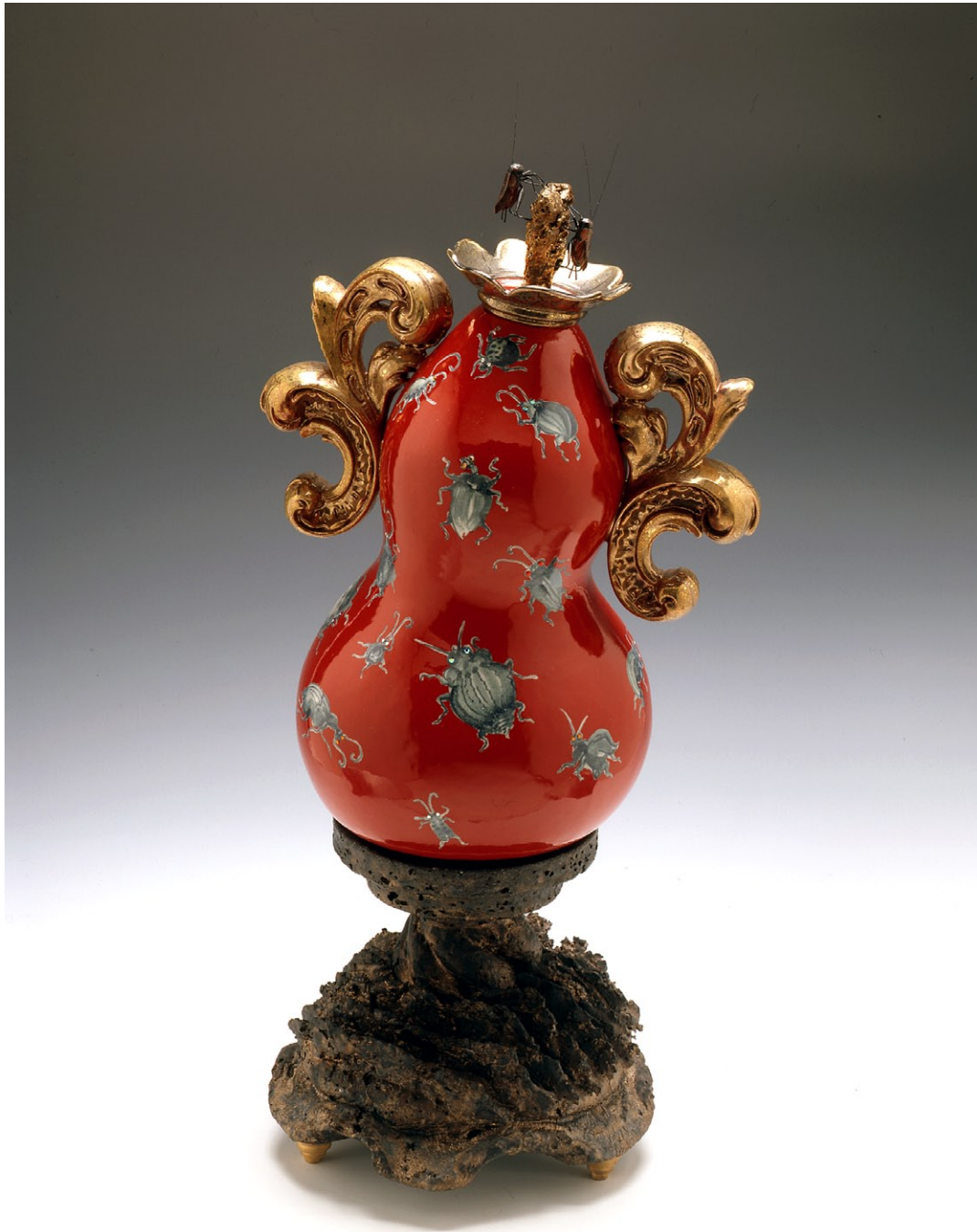
Le Rois du Monde Futur , 2004 porcelain, stoneware, overglaze enamel, lusters, and mixed media 26 ¼ x 13 ¼ x 10 inches