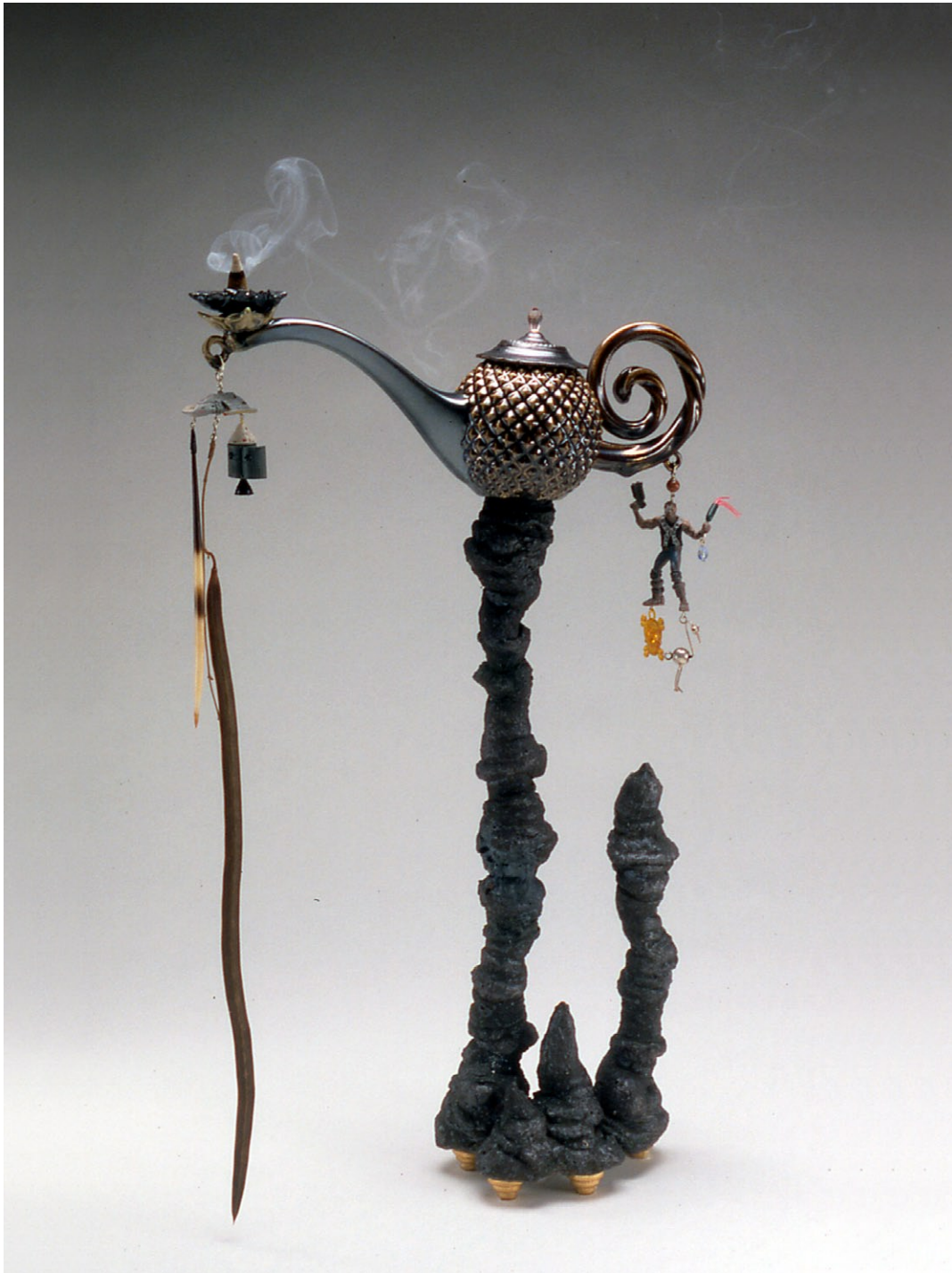
Hi-Fibre Crucible of Courage Magic Lamp , 1997 earthenware, stoneware, and mixed media 21 x 12 ½ x 4 inches