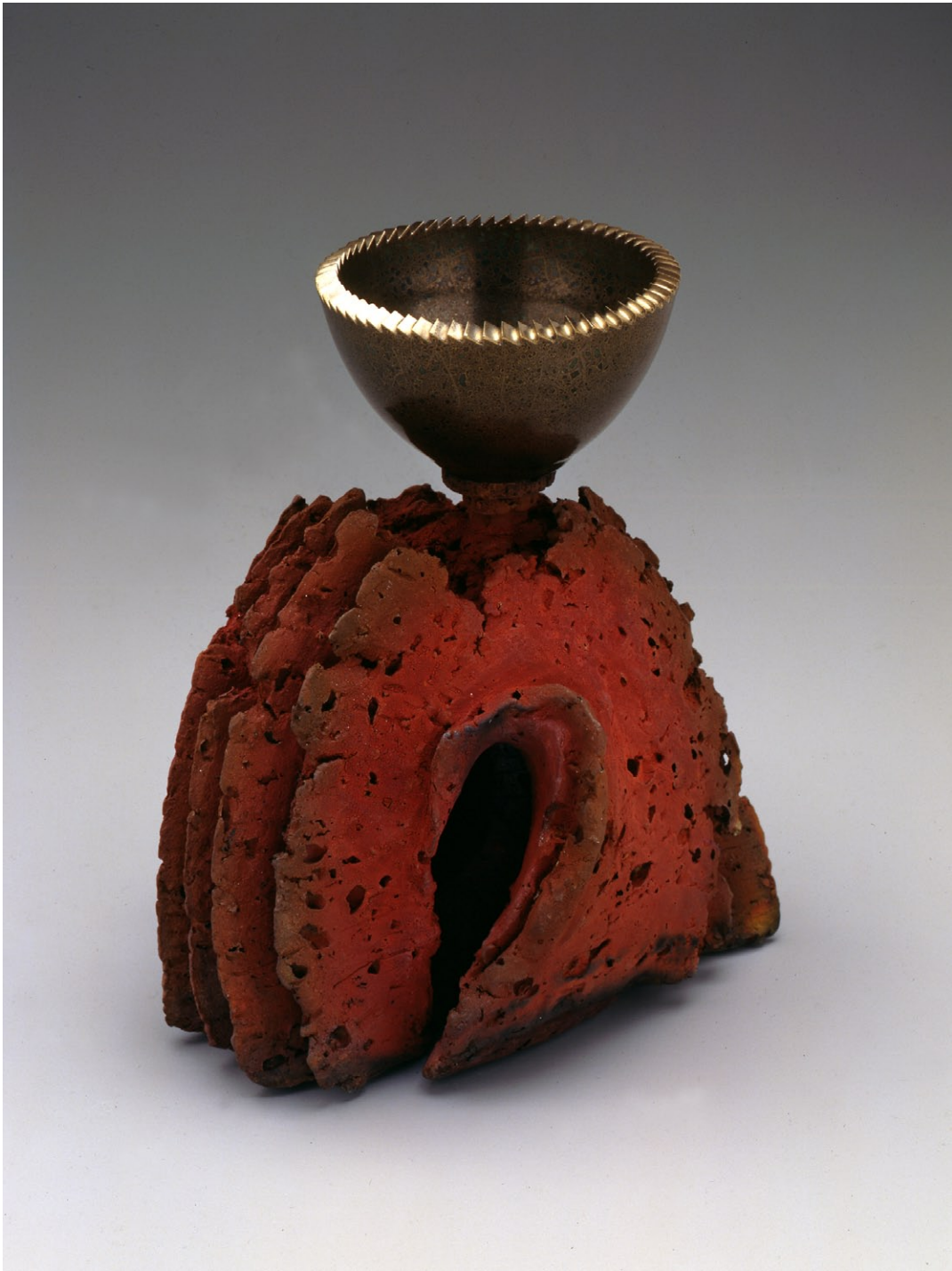
Untitled Mortar Bowl with Stand, 1987 porcelain, raku, and lusters 9 5/8 x 8 x 7 inches