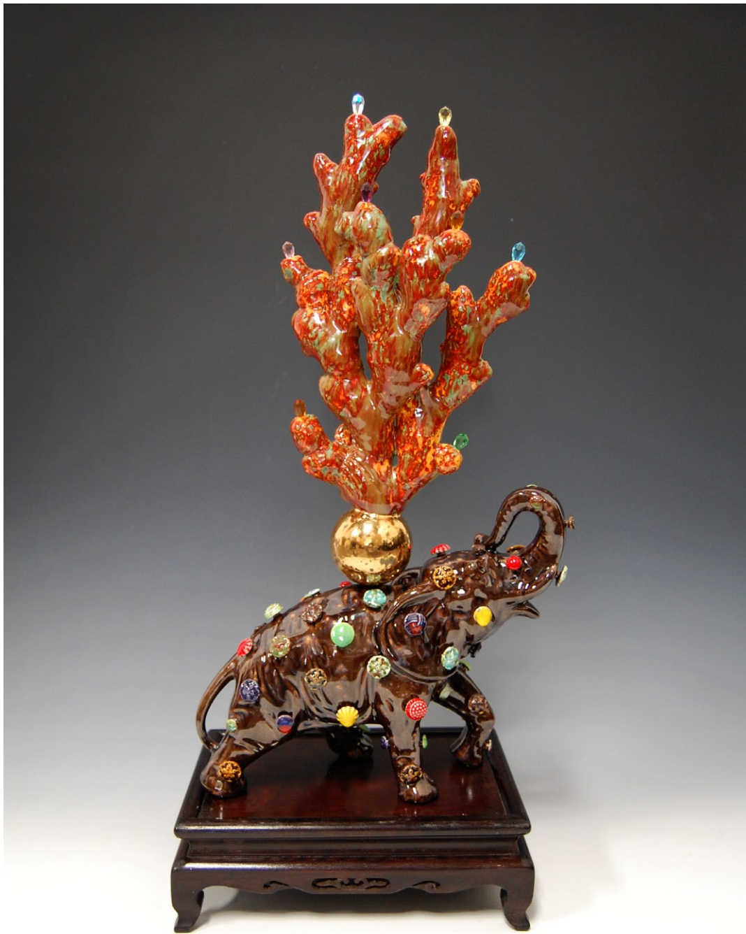
Dynamite-maki California Spider Roll, 2011 porcelain, lusters and mixed media on Antique wood base 22 \frac{3}{4} x 11 x 7 \frac{1}{2} inches