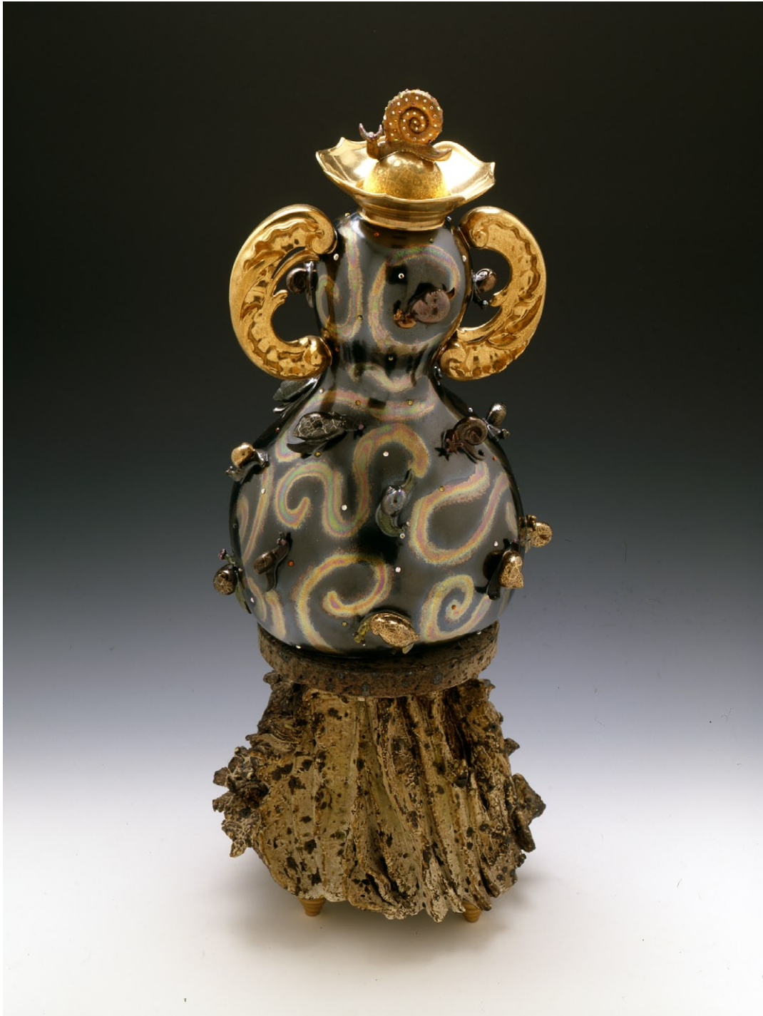
Shiitake Jamboree , 2001-2004 porcelain, stoneware, lusters, overglaze enamels, and mixed media 27 ¼ x 10 ¾ x 10 ½ inches