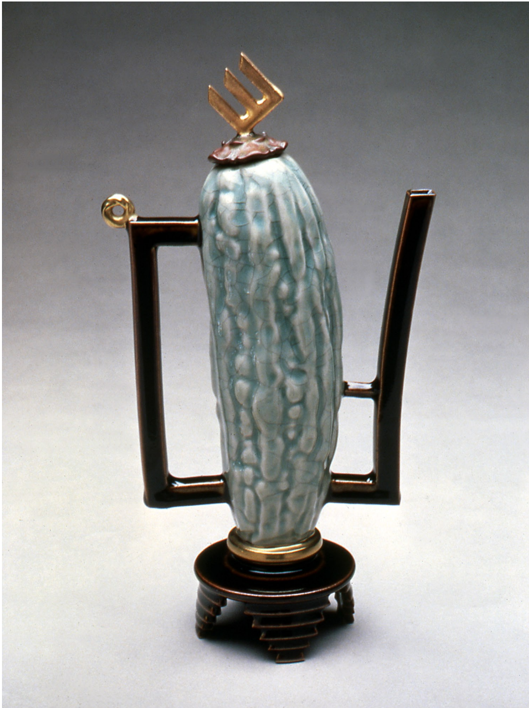
Untitled Ewer (Bittermelon) , 1982 porcelain and lusters 10 ¼ x 5 ½ x 3 inches