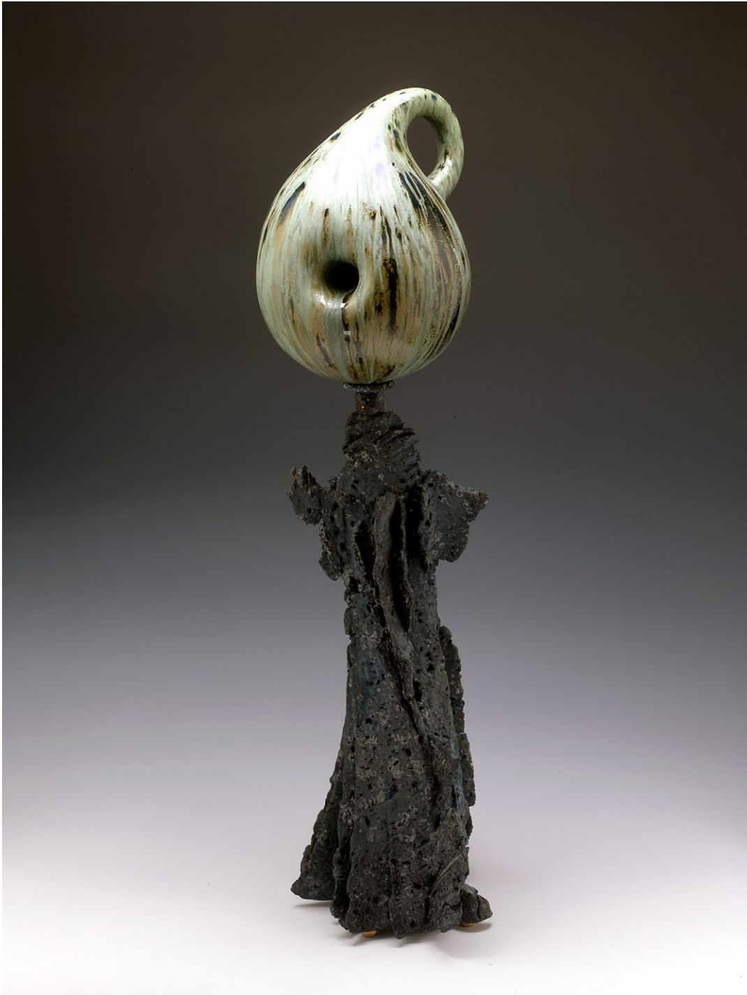
Green Extremophile , 2004 earthenware and stoneware 32 ¼ x 8 ½ x 9 inches