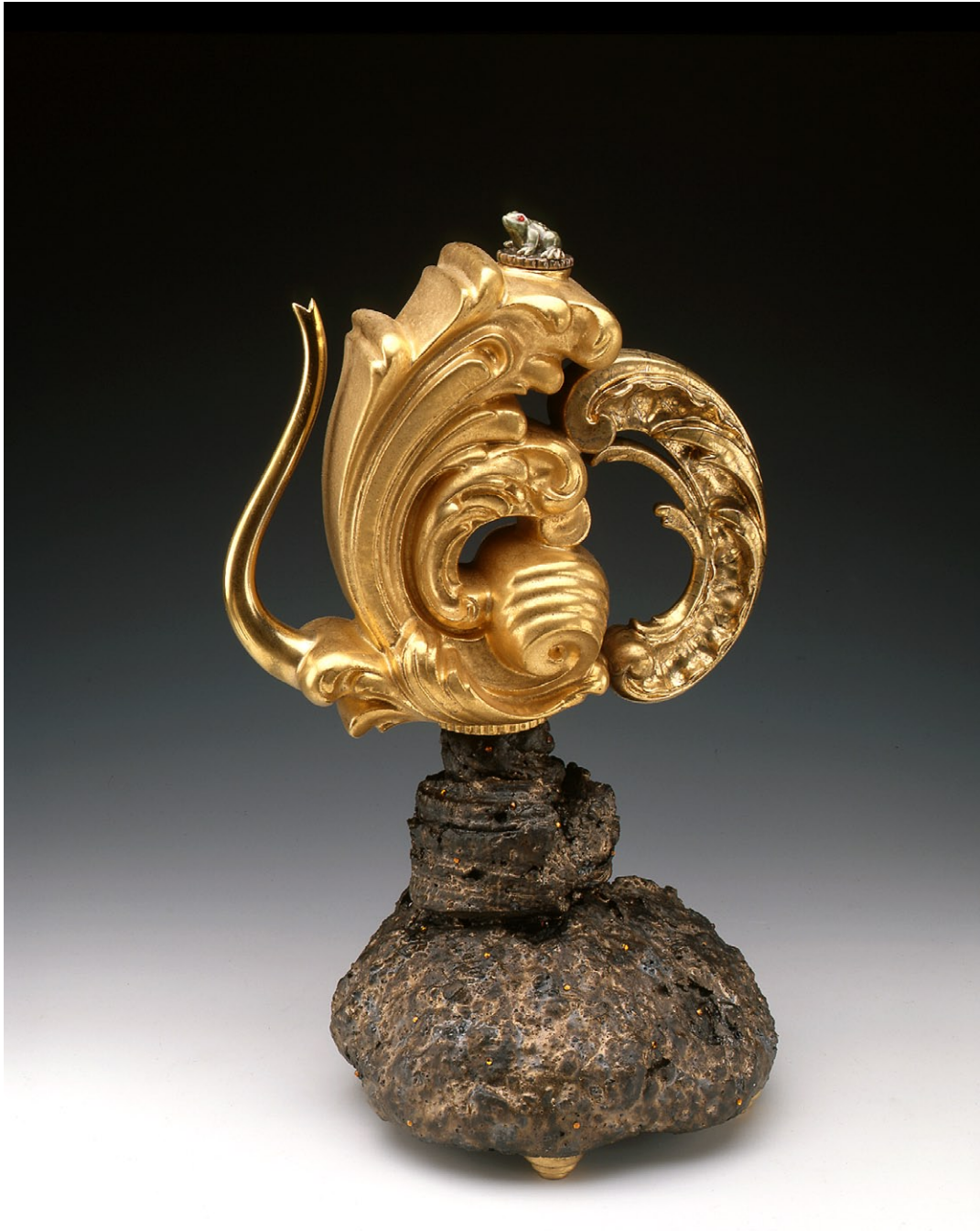
Untitled Ewer (Twanger), 2004 porcelain, stoneware, lusters, mixed media 14 1/8 x 8 3/8 x 6 3/4 inches