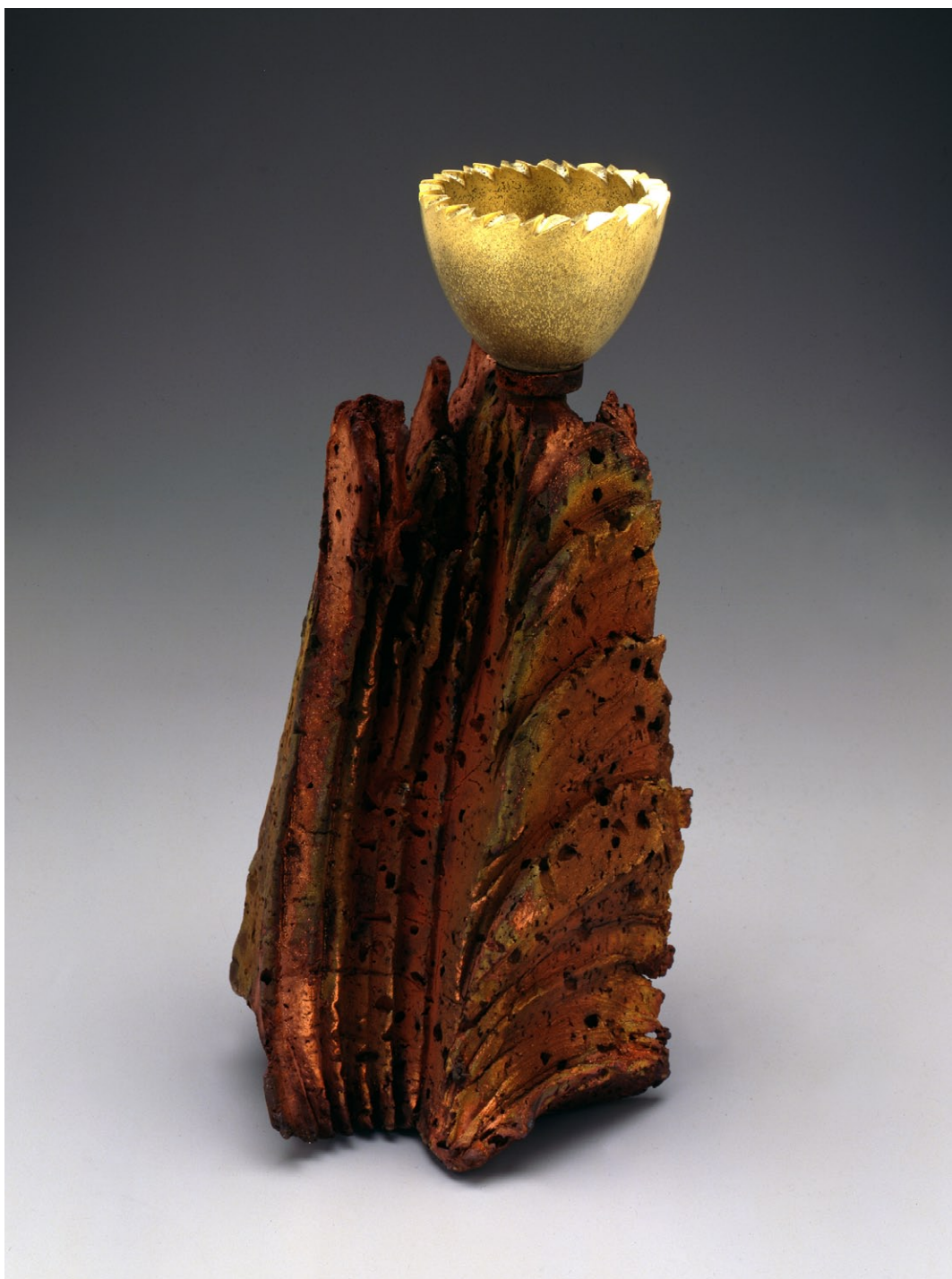
Untitled Mortar Bowl with Stand, 1987 porcelain, raku, and lusters 15 ¼ x 8 x 8 inches