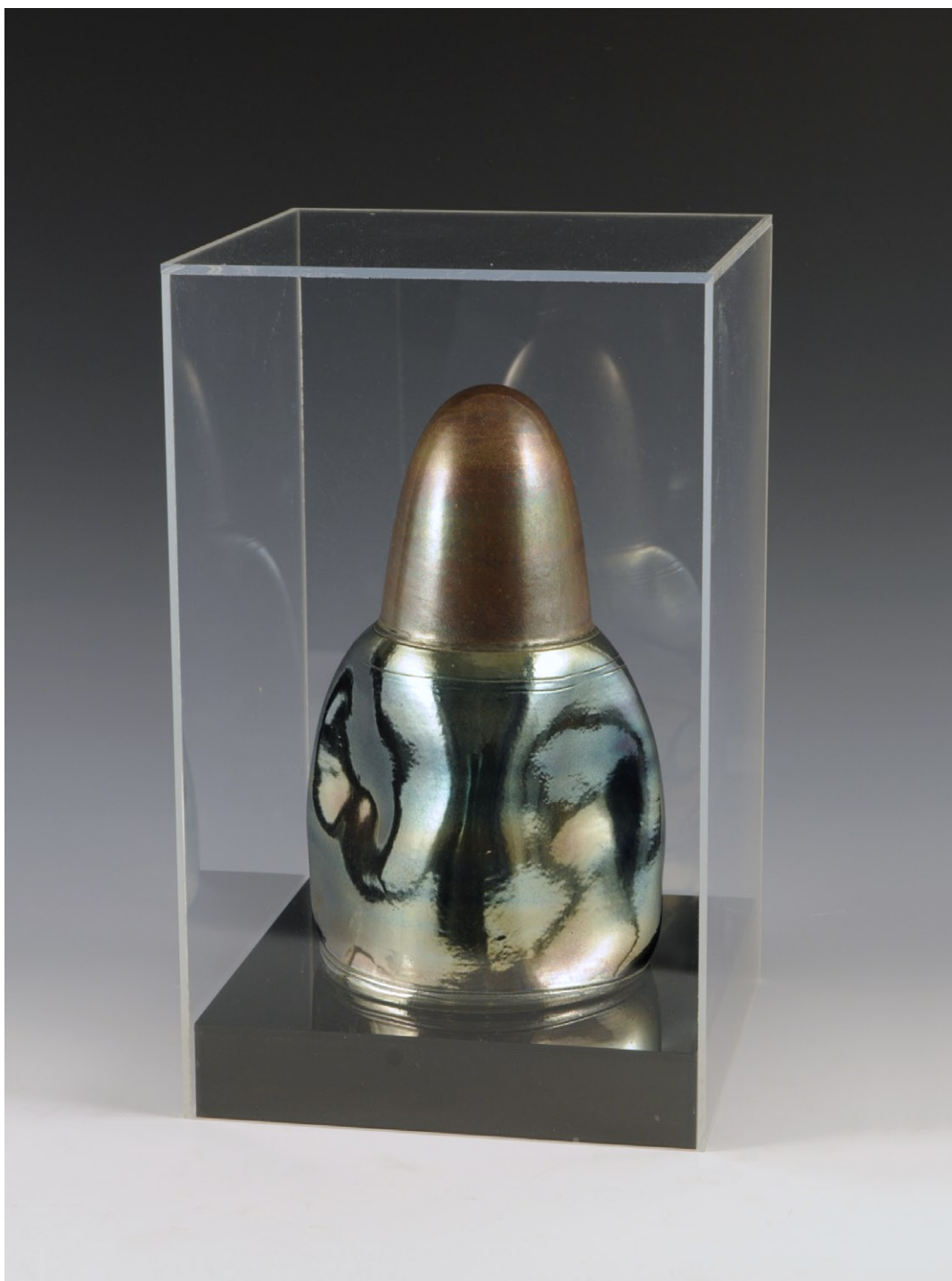
Lollycock (Bronze Dento) , 1968 porcelain, lusters and Plexiglas cover and base 14 ½ x 9 x 9 inches