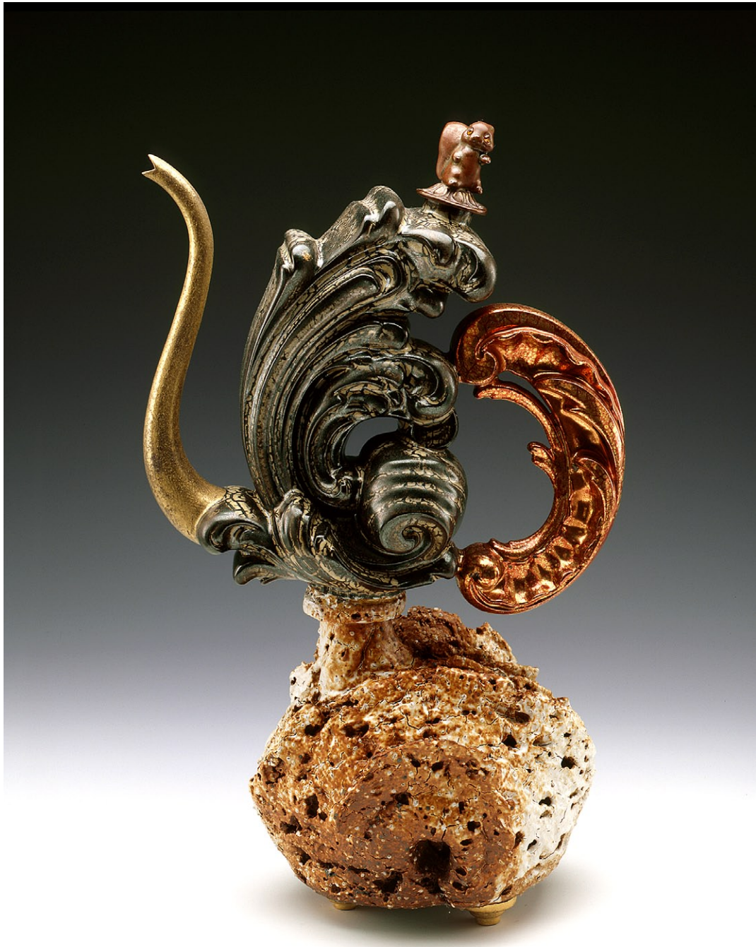
Untitled Ewer (BSD), 2004 porcelain, stoneware, mixed media 13 x 8 ¼ x 5 ½ inches