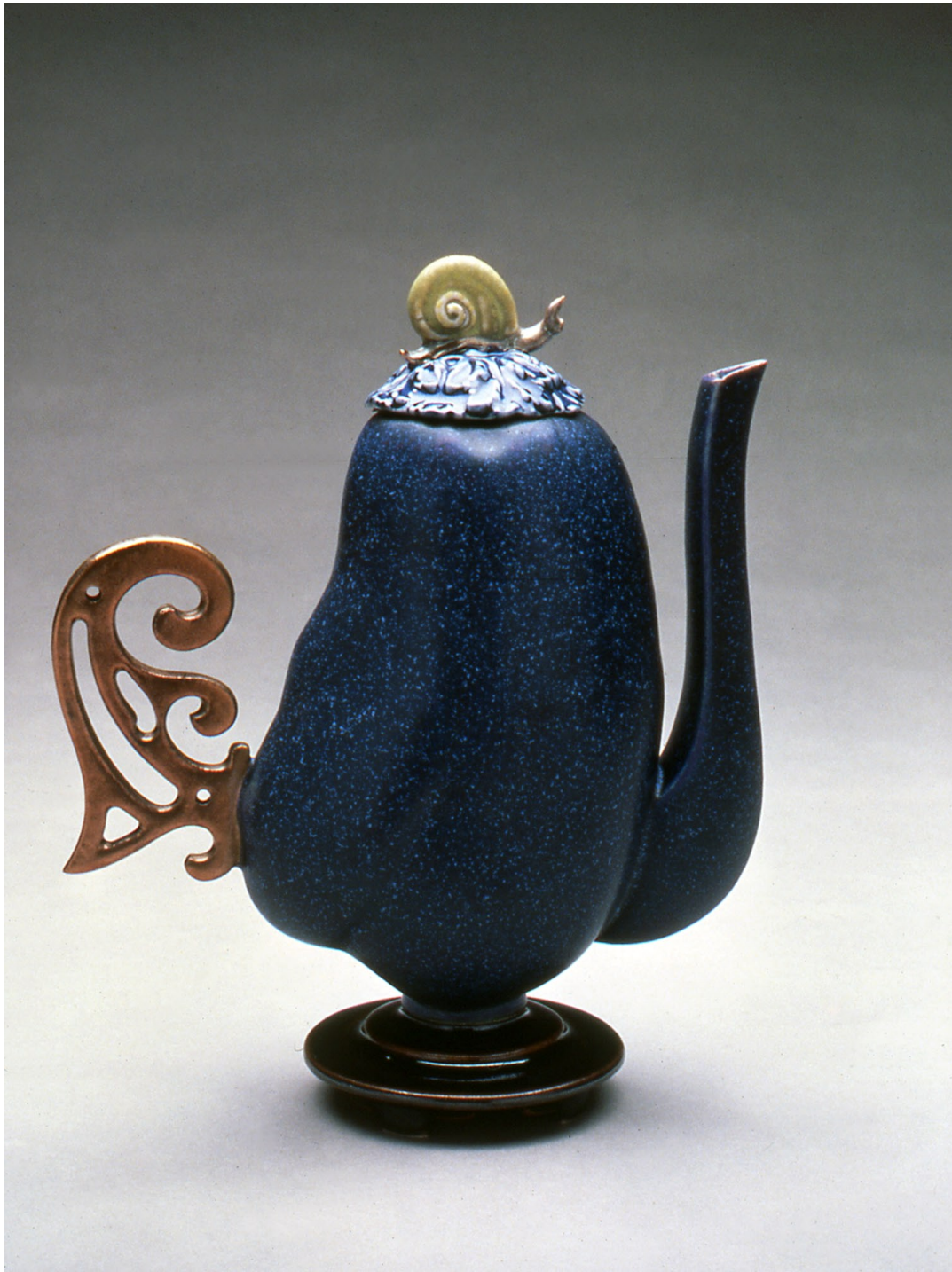
Untitled Ewer (Aubergine) , 1982 porcelain 9 inches high