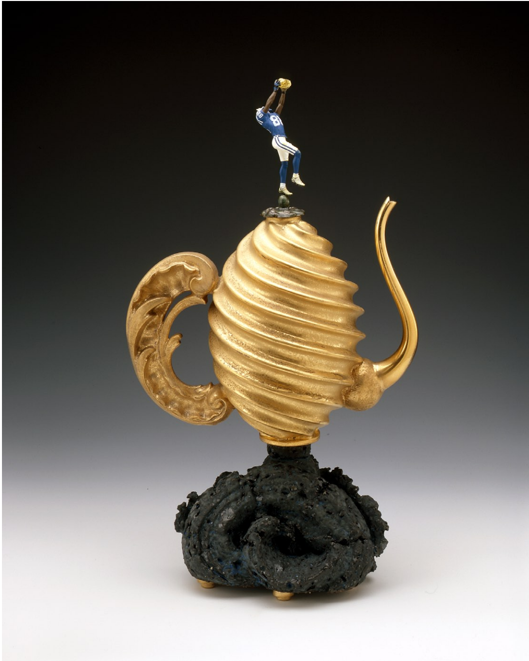
Untitled Ewer (Twister with Apatite II) , 2004 porcelain, stoneware, and mixed media 16 1/8 x 9 x 5 inches