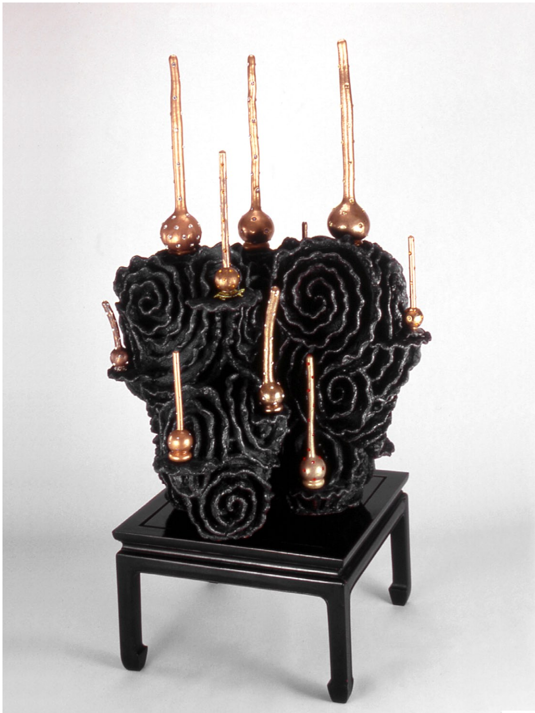
Nirvanarhea , 2002 ceramic and stoneware 63 x 32 inches