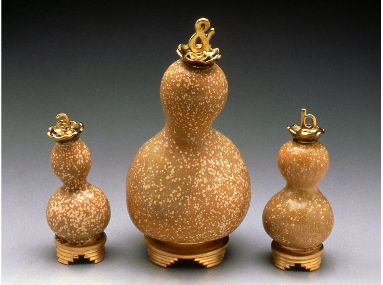
a & b , 1987 porcelain and lusters dimensions variable