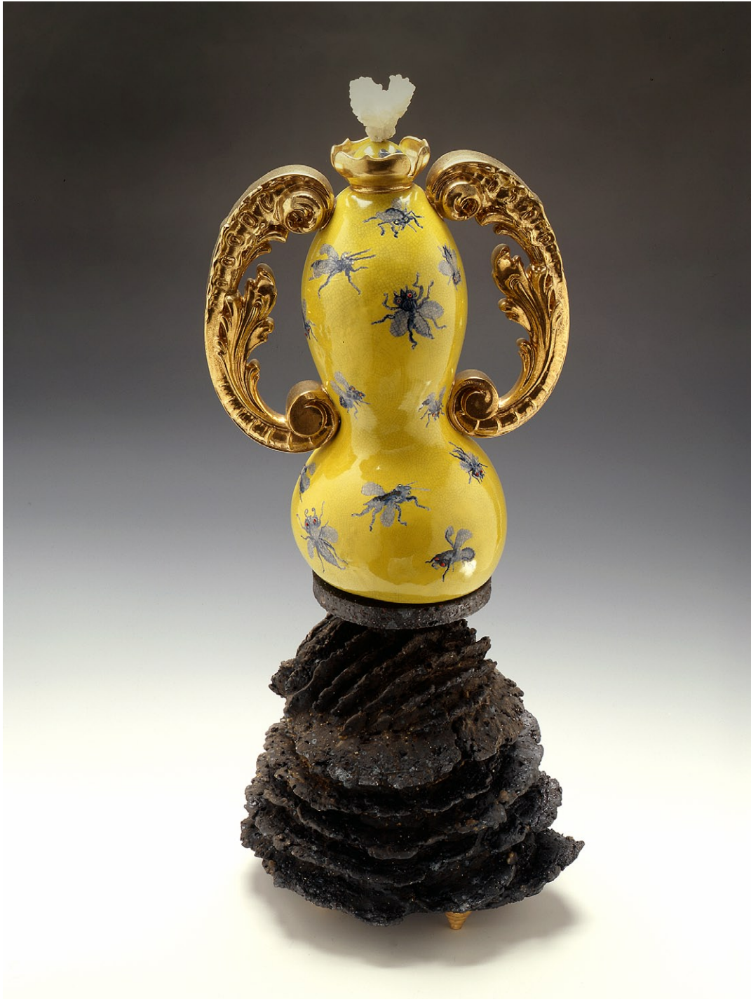
Sweet Dreams, 2004 porcelain, stoneware, overglaze enamel, lusters, and mixed media 31 ¼ x 14 x 8 ¼ inches