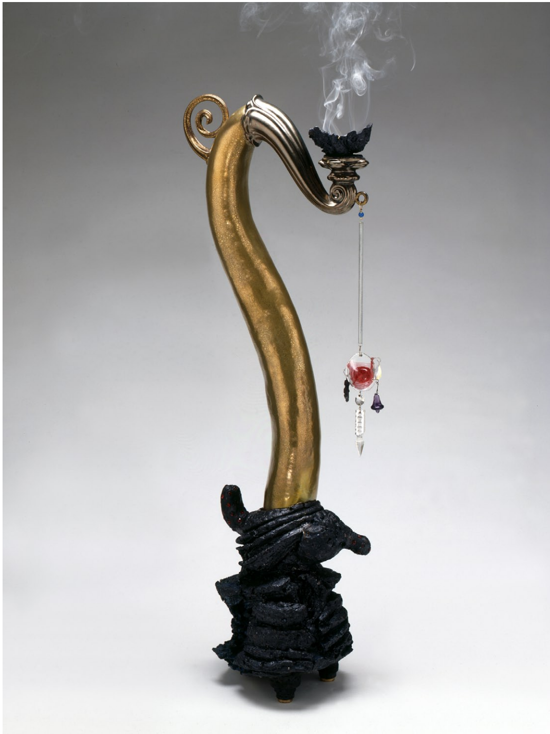
Bungee de Campostella , 1995 porcelain, stoneware, and mixed media 36 x 8 ½ x 12 ½ inches