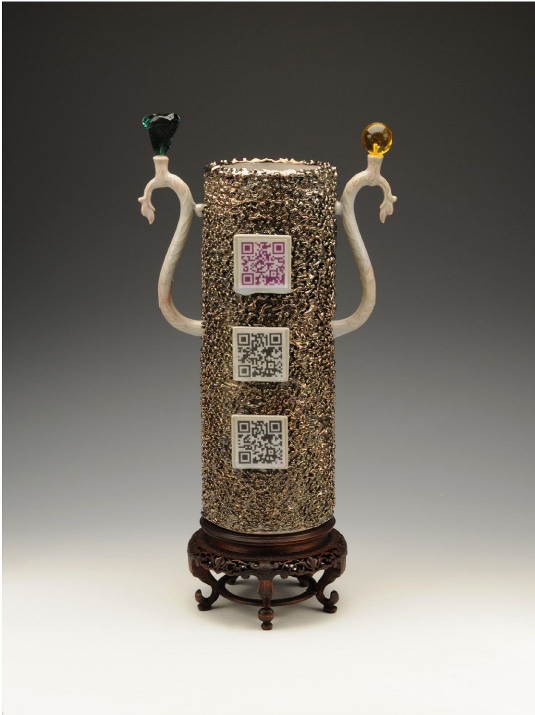
Holy Trinity- Fat, Salt, Sugar , 2011 (view 2) porcelain, lusters and mixed media on Antique wood base 16 ½ x 8 x 5 ¾ inches