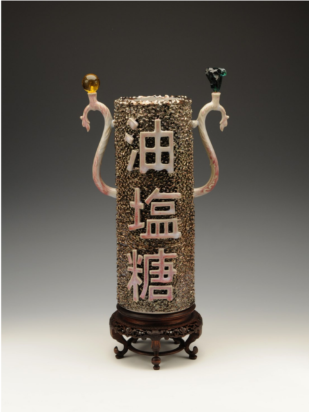
Holy Trinity- Fat, Salt, Sugar , 2011 (view 1) porcelain, lusters and mixed media on Antique wood base 16 ½ x 8 x 5 ¾ inches