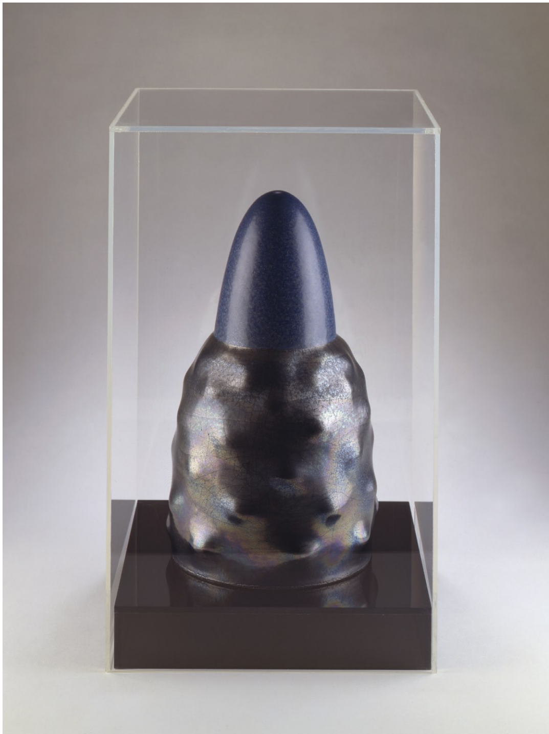
Lollycock (Dento) , 1968 porcelain, lusters and Plexiglas cover and base 14 ½ x 9 x 9 inches