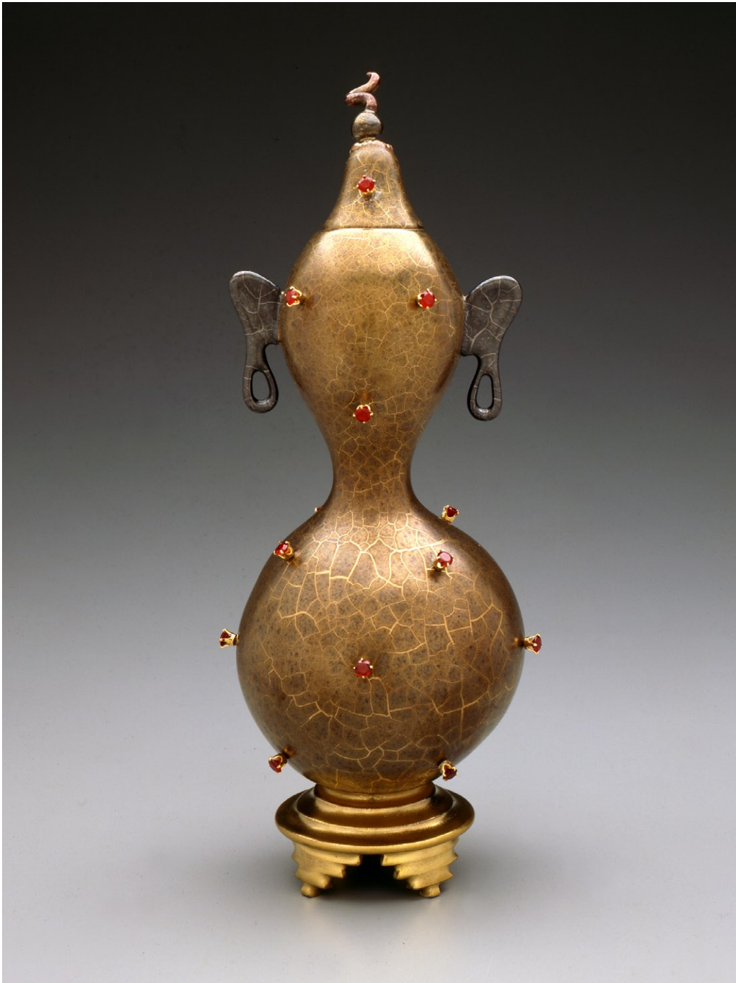
Untitled Covered Jar , 1989 porcelain, lusters, rubies, and gold 11 \frac{7}{8} x 4 \frac{1}{2} x 4 \frac{1}{2} inches