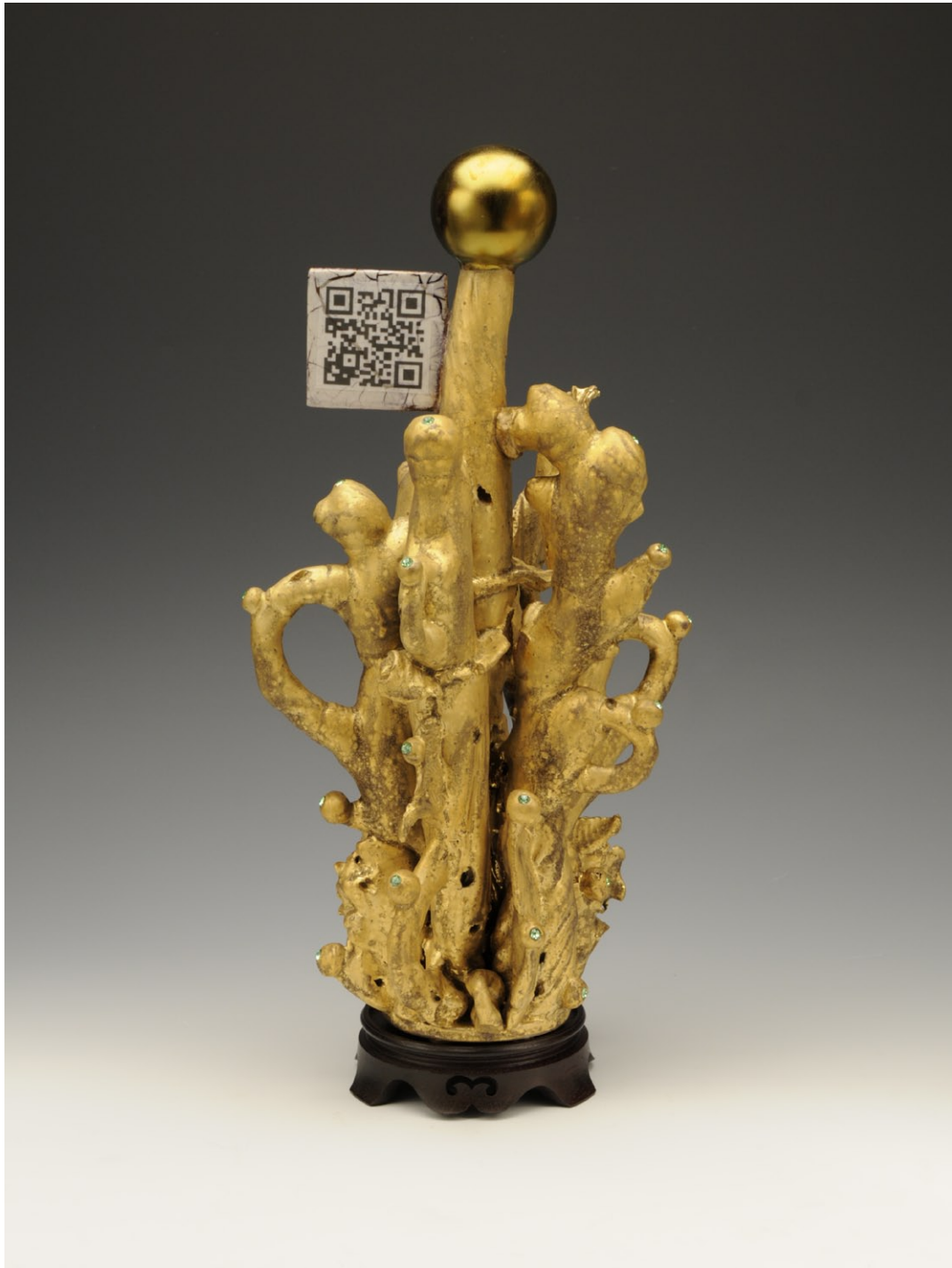
Outback Cathedral , 2011 porcelain, lusters and mixed media on Antique wood base 15 3 / 4 x 7 3 / 4 x 7 inches