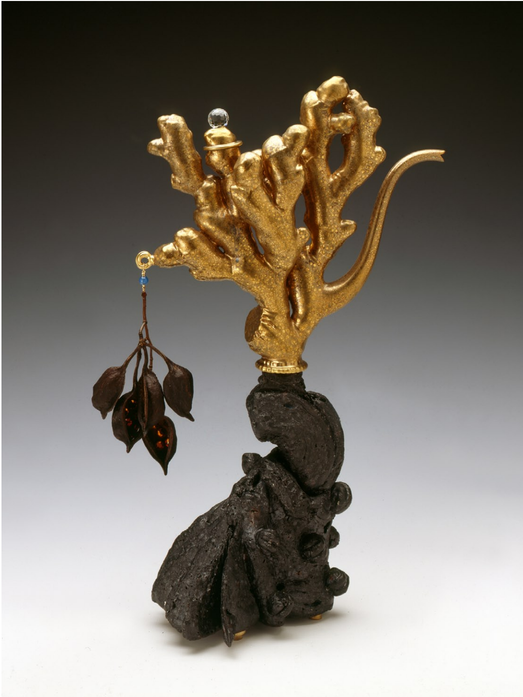
Untitled Ewer (St. Beverly Hills) , 1995 porcelain, stoneware, and mixed media 18 \frac{3}{4} x 10 \frac{7}{8} x 5 \frac{5}{8} inches