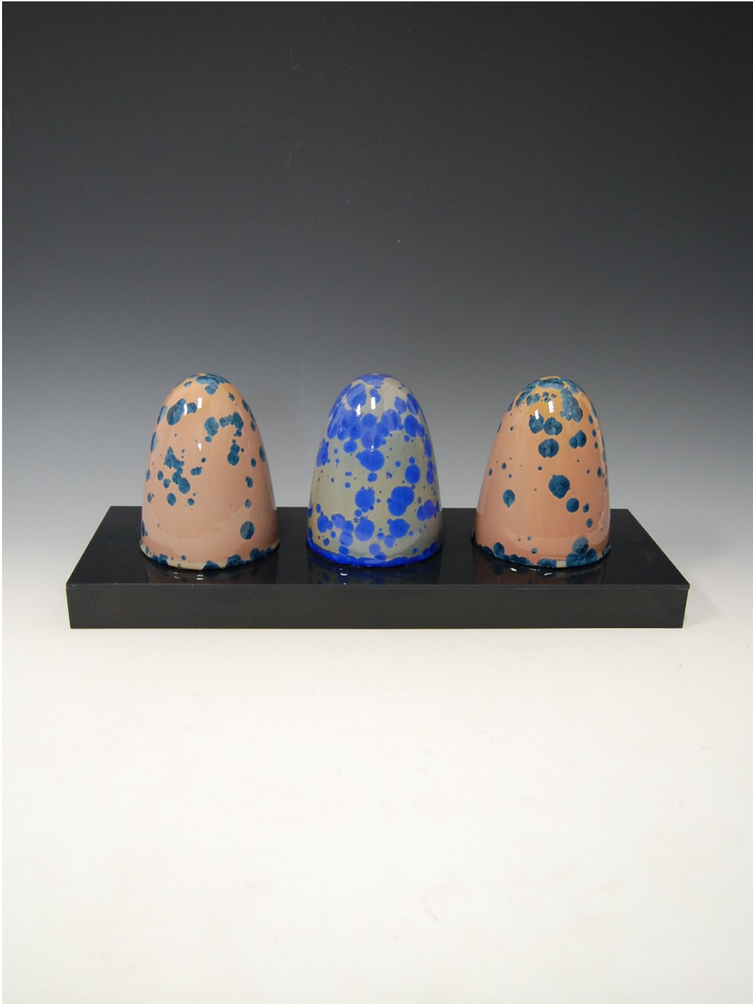
Untitled Crystalline Dome Set , 1968 porcelain and Plexiglas base 6 ¼ x 21 x 7 ½ inches