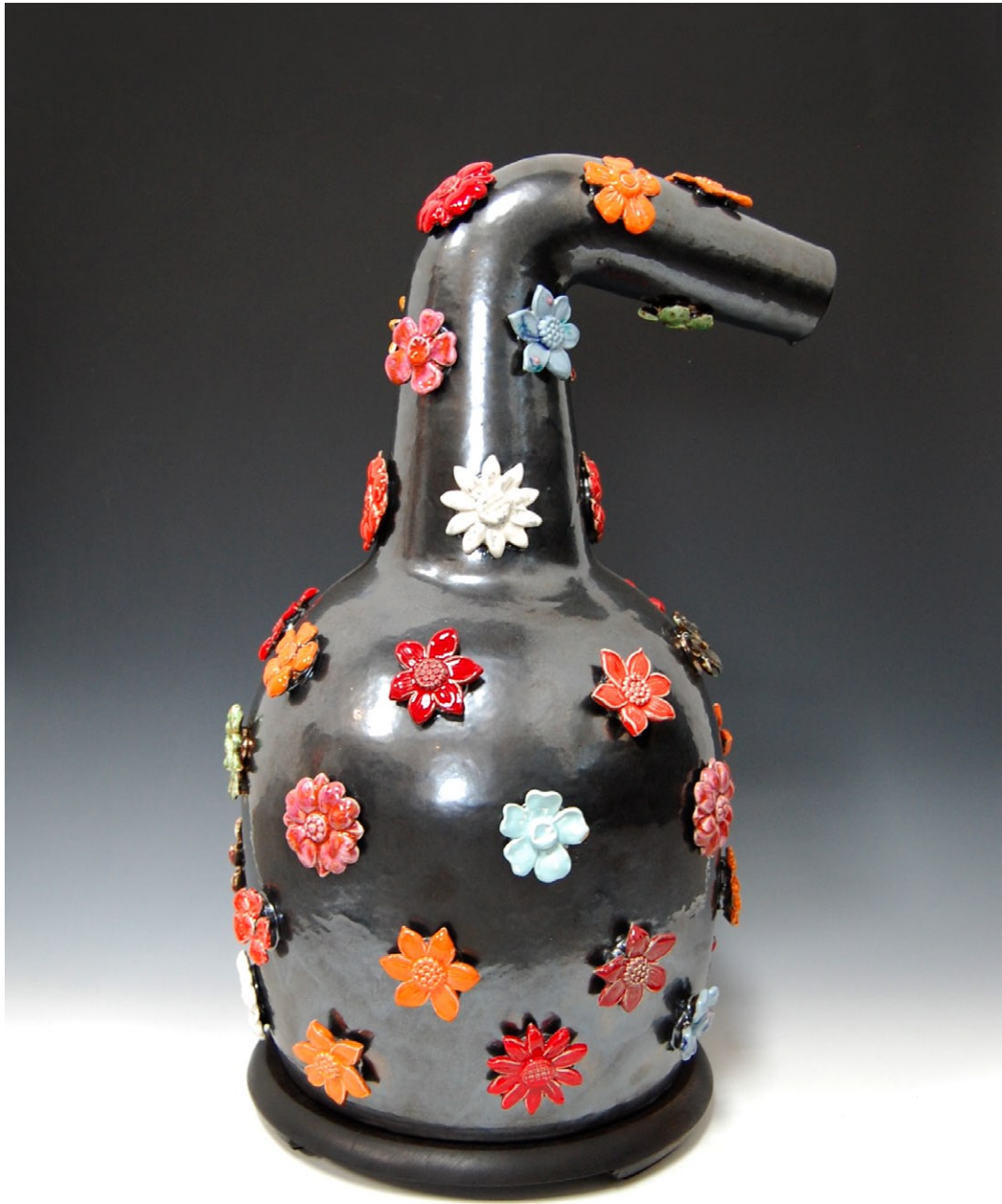
Springtime for Laphroaig , 2011 earthenware on wood base 29 x 18 ¾ x 15 ¾ inches