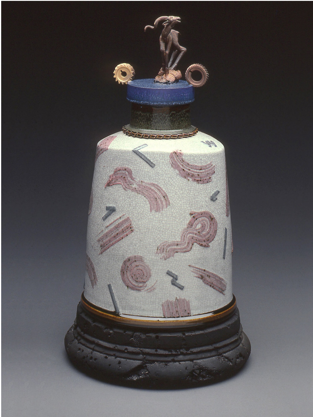
Untitled Covered Jar on Stand with Antelope Finial, 1980-1981 porcelain 22 5/8 inches high