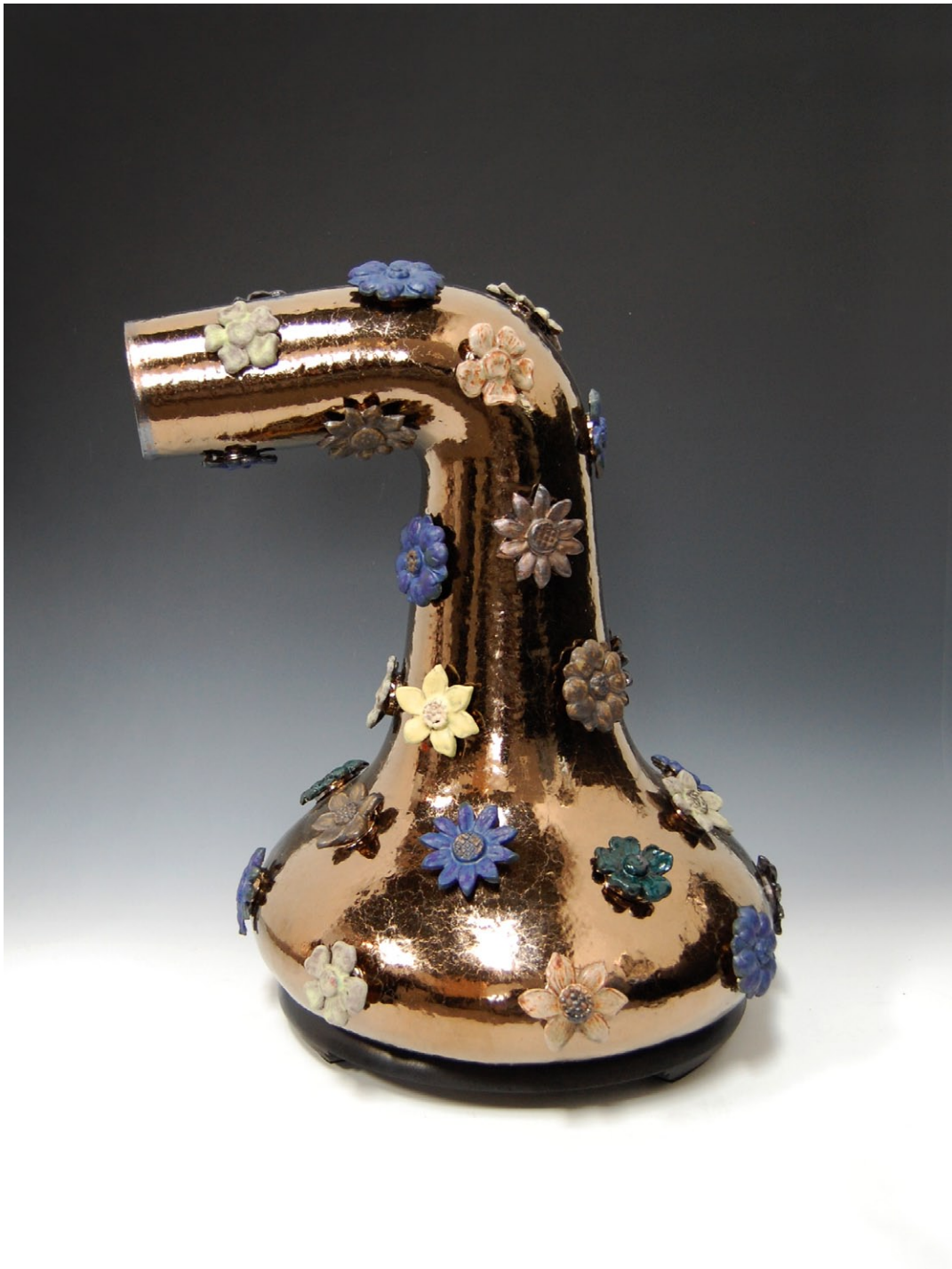
Bunnahbain Forever , 2011 stoneware on wood base 22 \frac{3}{4} x 19 \frac{1}{4} x 17 \frac{1}{4} inches