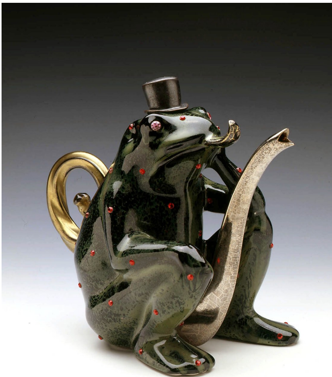
Irrational Exuberance , 2001 porcelain, noble metal lustres, and rhinestones 8 x 9 x 5 ¼ inches