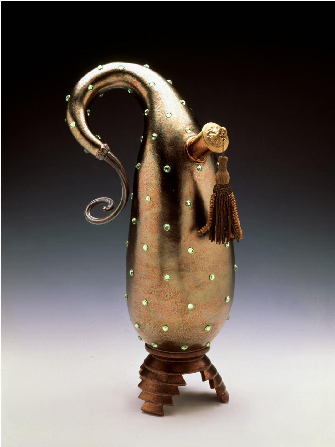
Caprideux Carquois , 1991 porcelain, lusters, and mixed media 16 \frac{3}{4} x 6 \frac{1}{2} x 8 inches