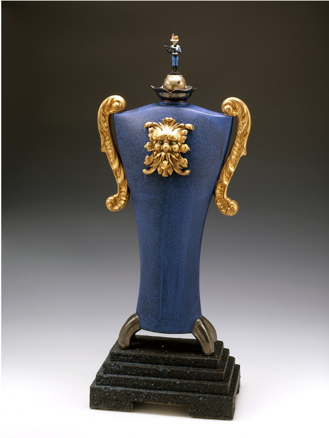
Bell of Tacos, King of Burgers, 2004 porcelain, stoneware, lusters, and mixed media 29 x 12 3/4 x 7 1/4 inches