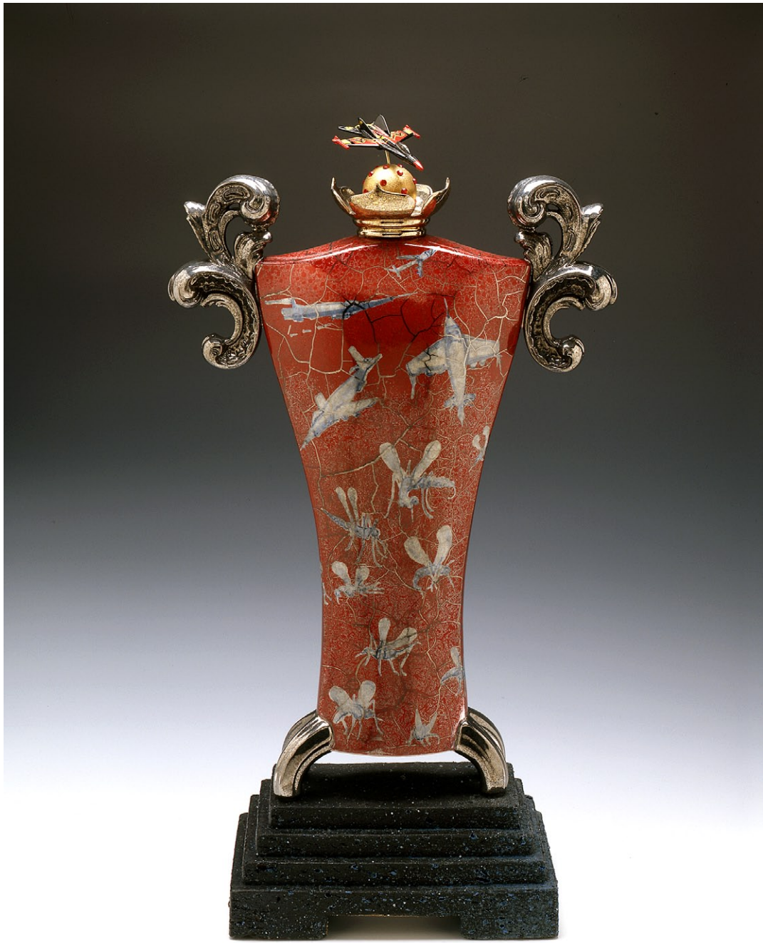
D'Nile , 2004 porcelain, stoneware, overglaze lusters, and mixed media 31 x 17 ½ x 7 ¼ inches