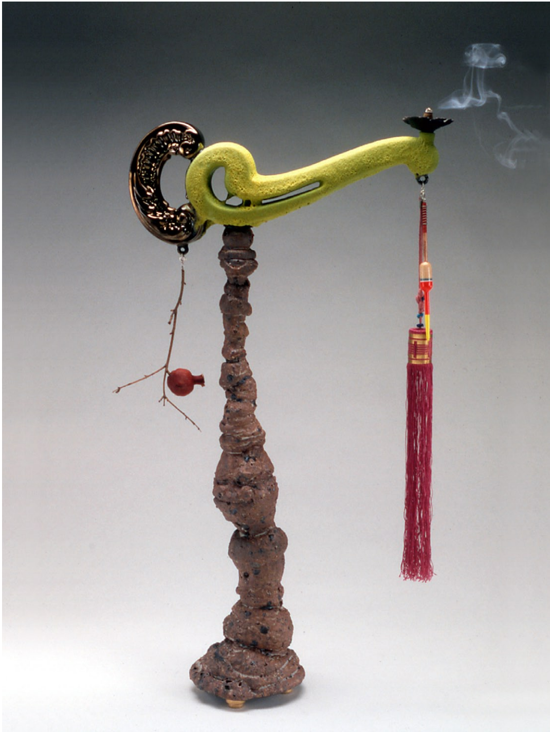
Hi-Fibre Double-Happiness Magic Lamp, 1997 earthenware, stoneware, and mixed media 26 ¼ x 15 x 5 ½ inches