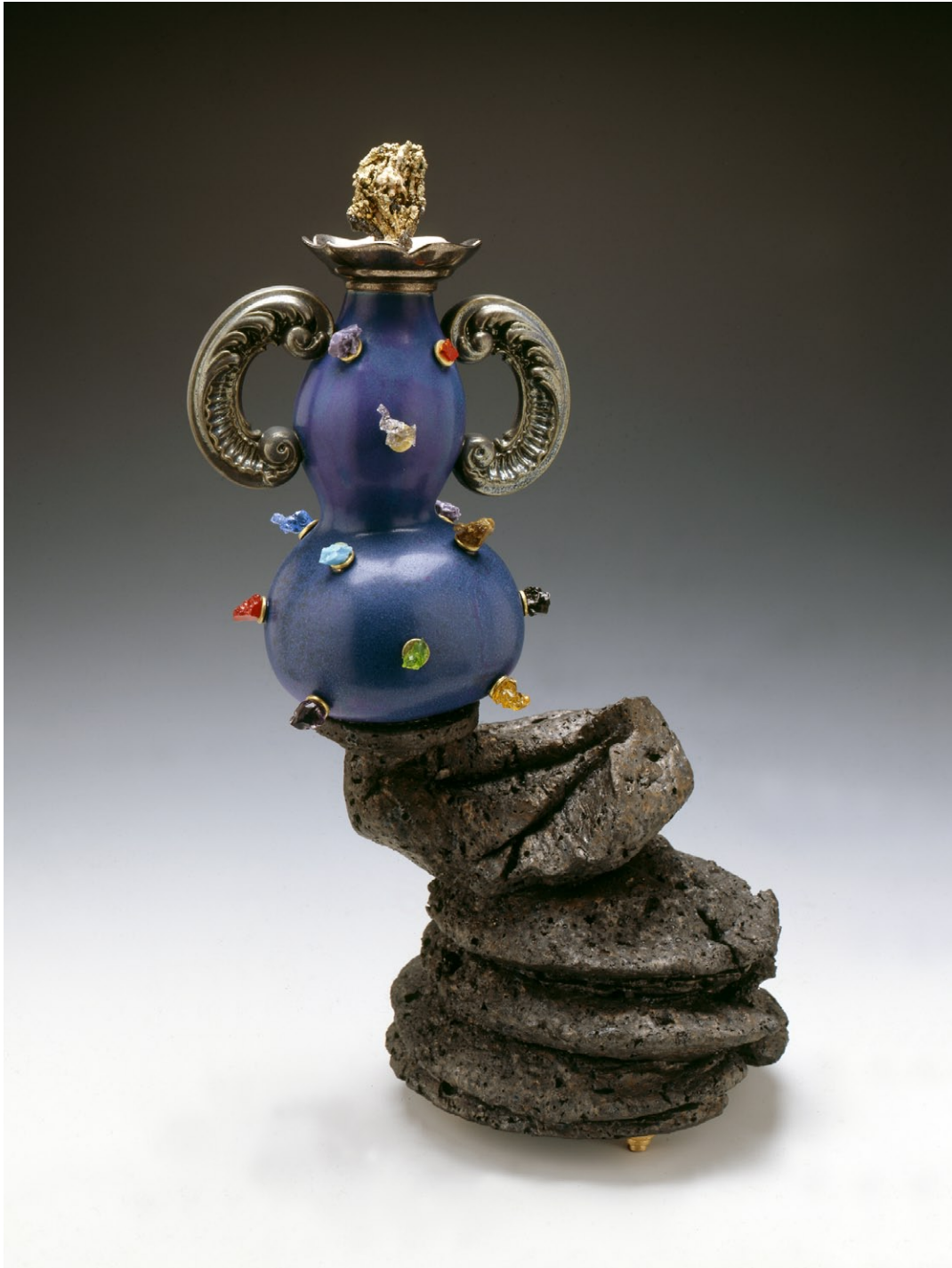
Untitled Jar (D.A. Moraine), 1994 porcelain and mixed media 26 x 14 ½ x 9 inches