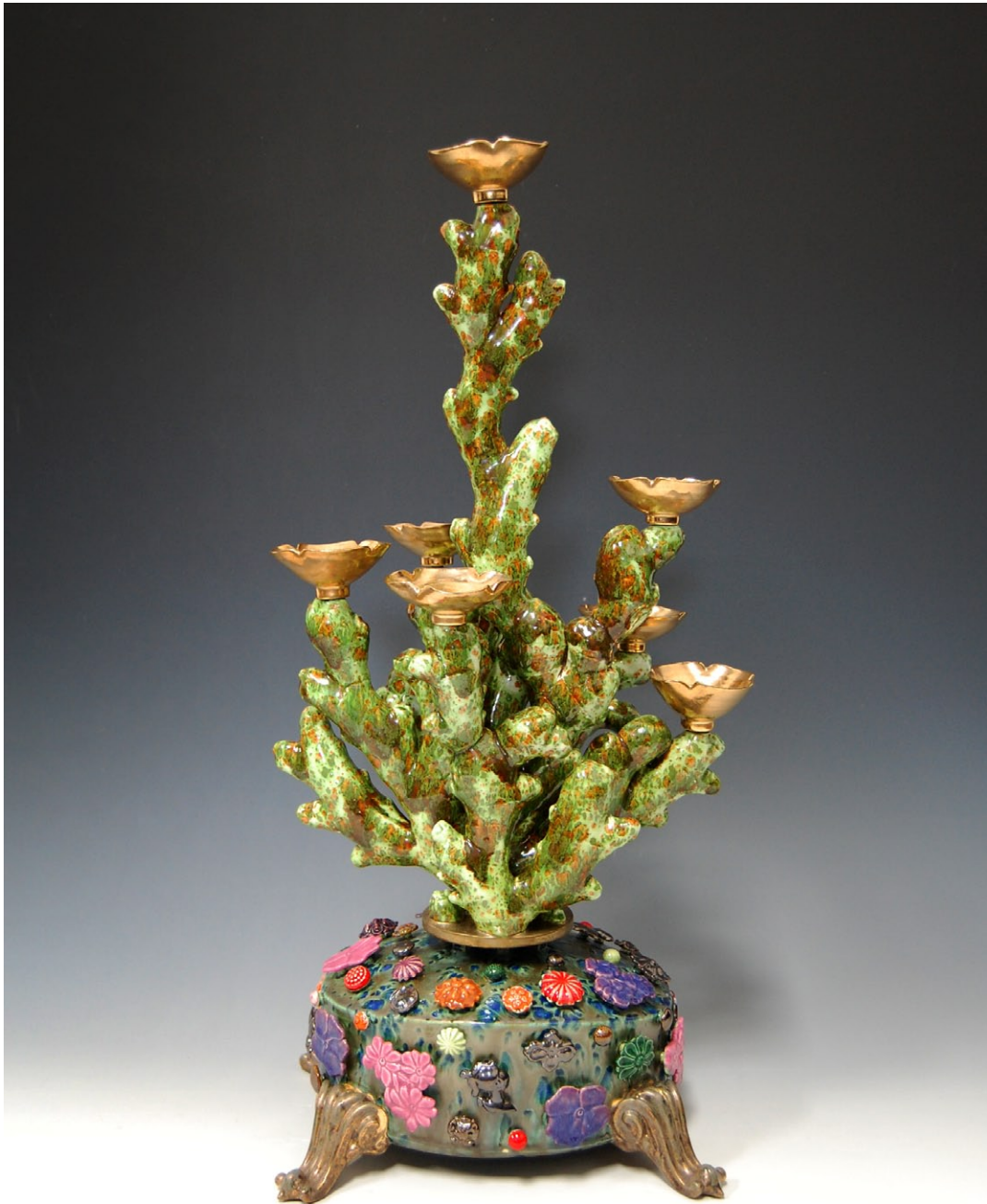
Juvenile Gavage à trois , 2011 earthenware and lusters 22 ½ x 10 ⅜ x 7 ½ inches