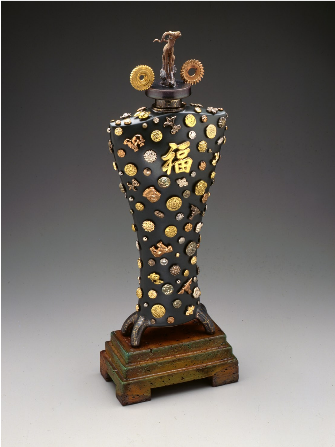
Untitled Covered Jar on Stand with Antelope Finial (Prosperity), 1987 porcelain, raku, and lusters 31 ½ x 11 x 6 inches