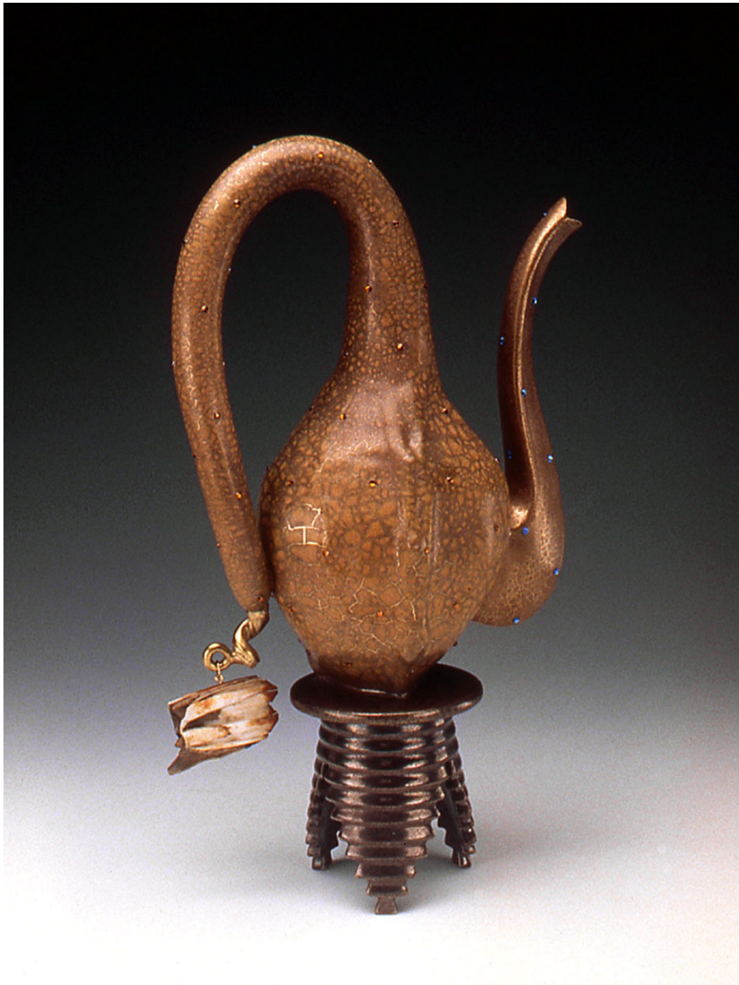
Untitled Mystery Ewer , 1992 porcelain, lusters, and mixed media 11 1/8 x 8 1/2 x 4 1/2 inches