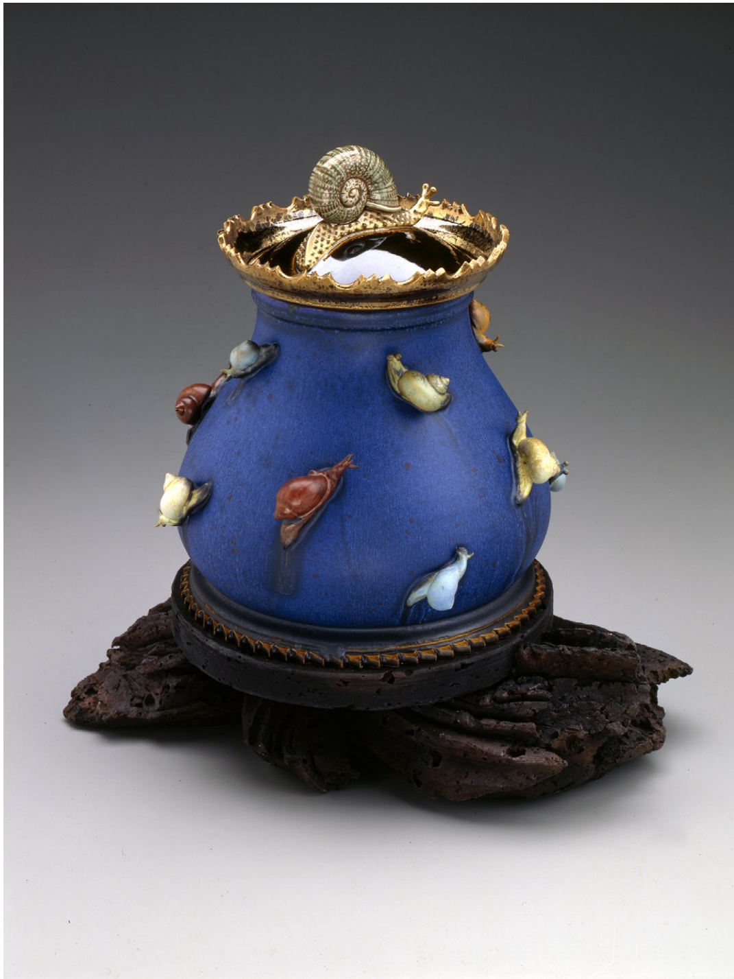
Untitled Covered Jar on Stand, 1987 porcelain, raku, and lusters 15 ½ x 16 x 9 inches