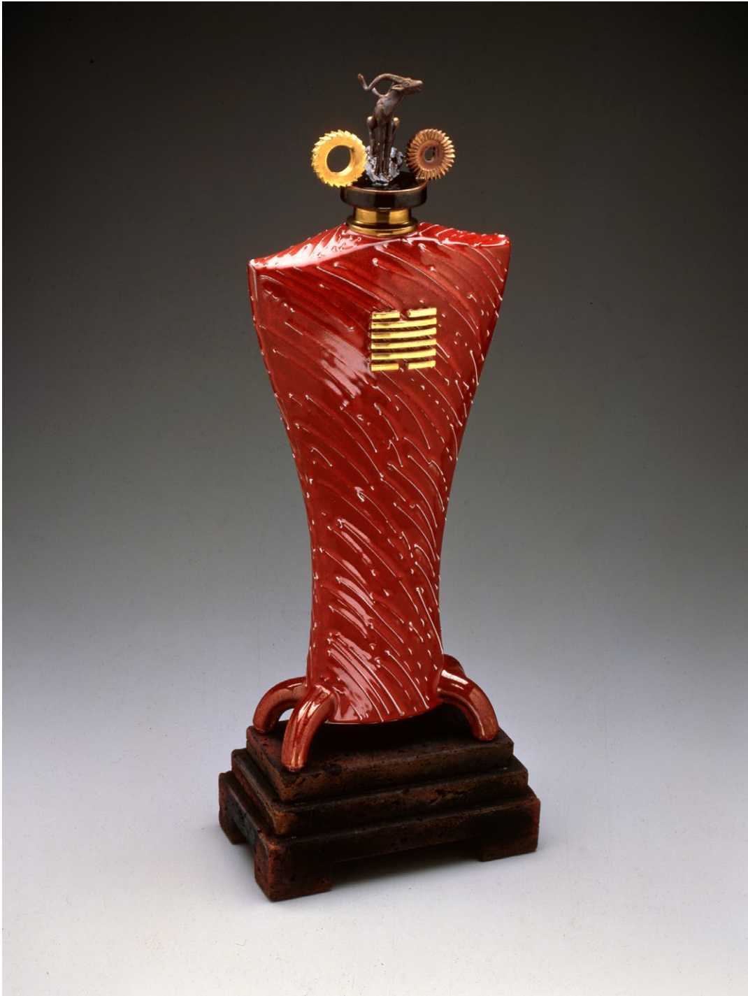
Untitled Covered Jar on Stand with Antelope Finial (Critical Mass), 1987 porcelain and stoneware 32 ½ x 11 x 6 inches