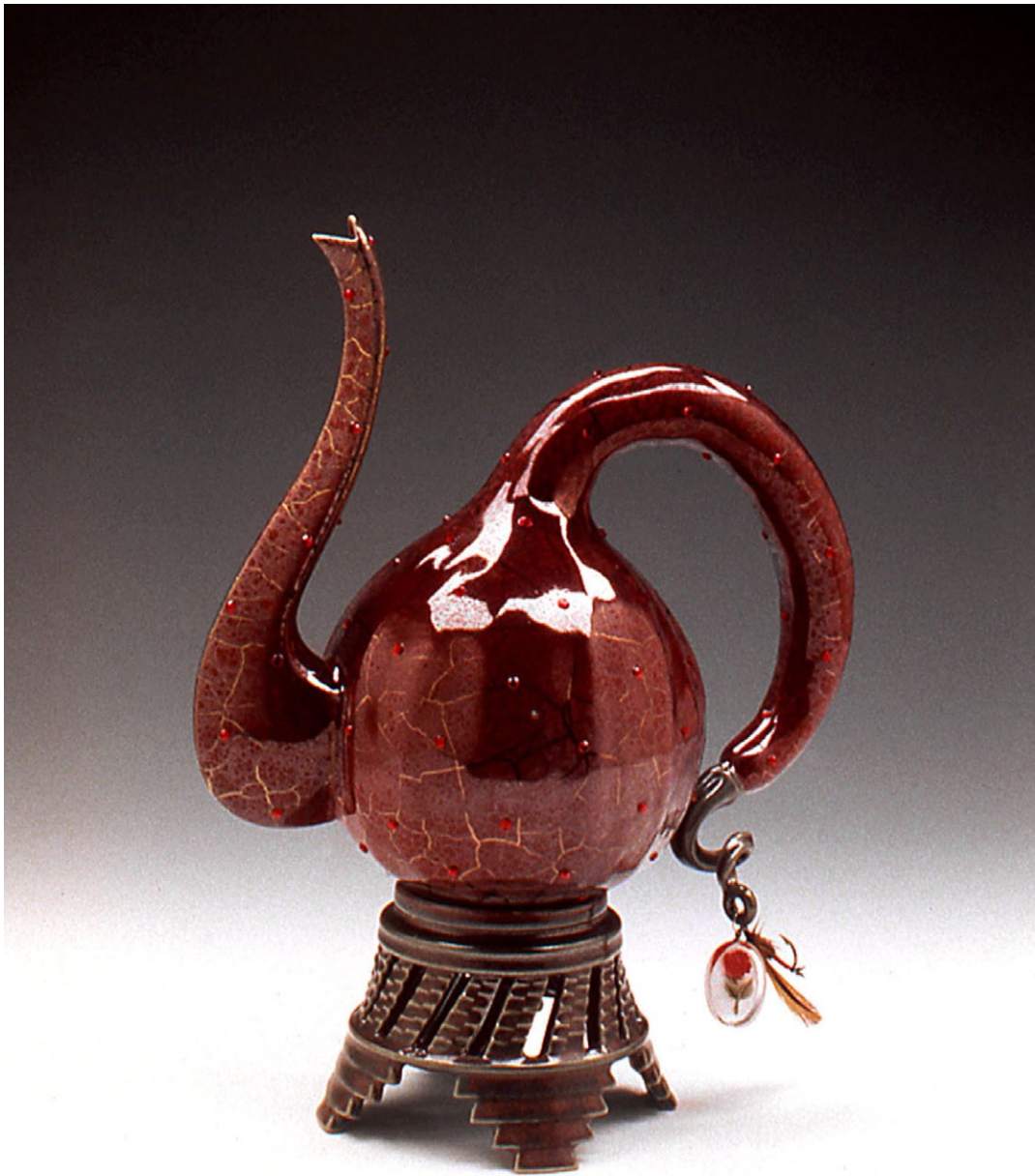
Untitled Mystery Ewer , 1992 porcelain, lusters, and mixed media 11 1/8 x 8 1/2 x 4 1/2 inches