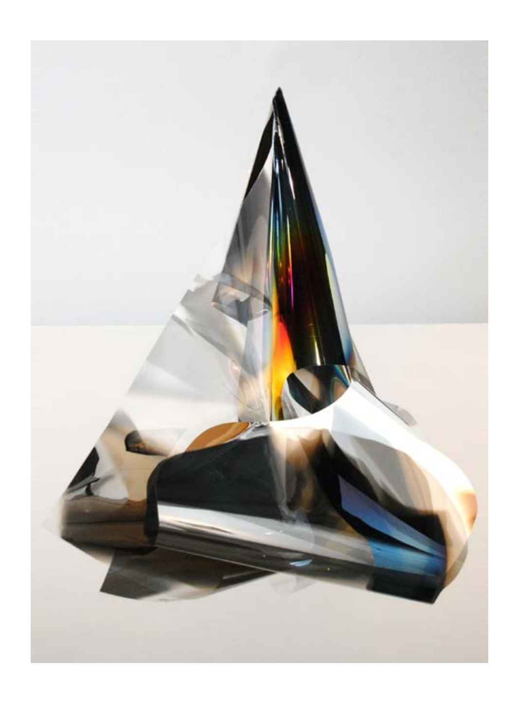
Larry Bell L.K.L. 5/15/13, 2013 aluminum and silicone monoxide on polyester film size variable (large)