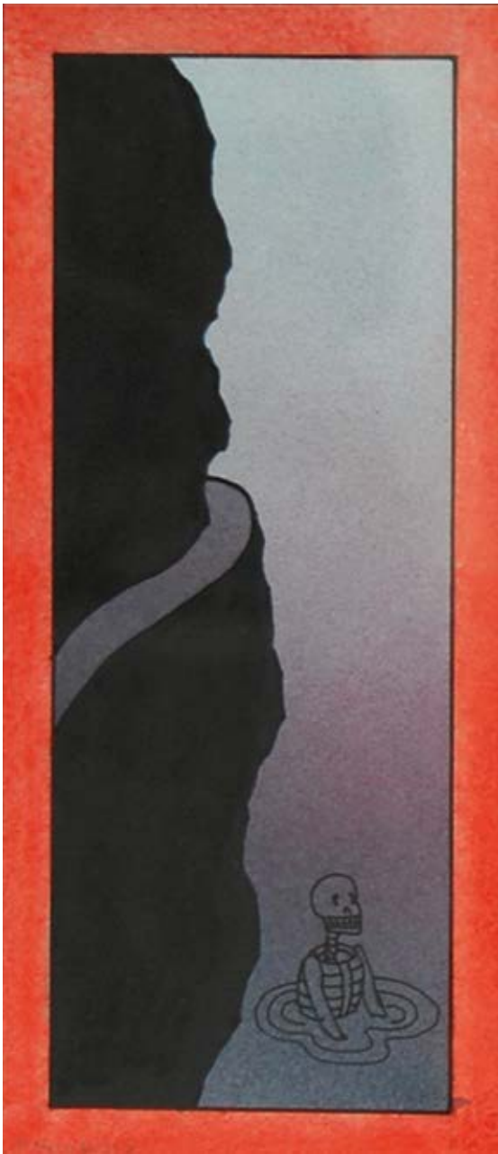
Ken Price Untitled Talisman , 1997 watercolor and ink on paper 8 5/8 x 3 3/4 inches