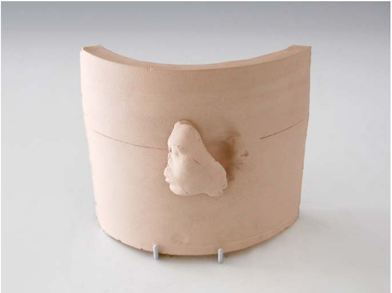
Robert Graham Untitled , 1975 ceramic 6 x 6 ½ x 5/8 inches