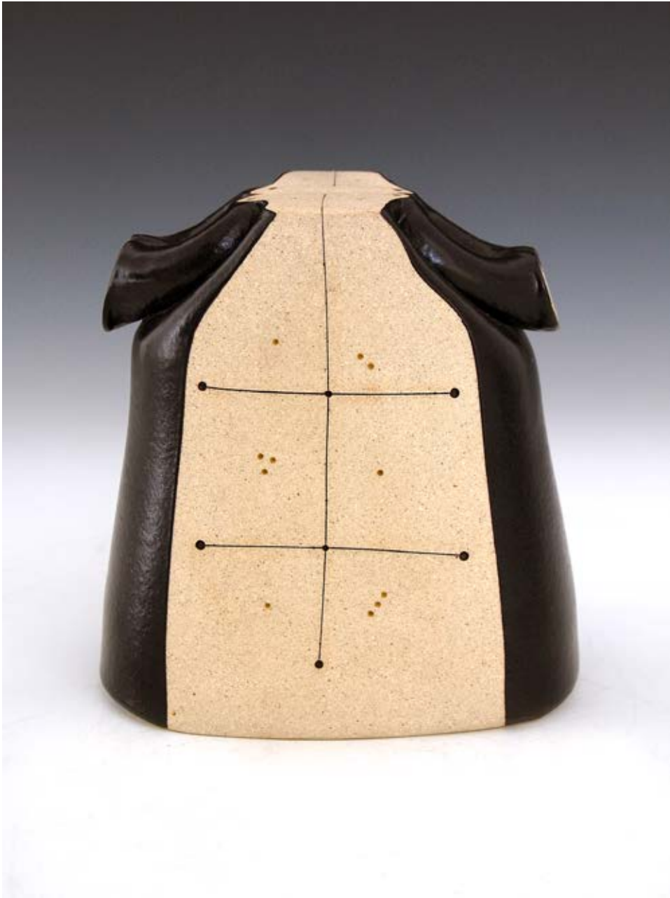
Gustavo Pérez Vase (06-83) , 2006 stoneware 5 ¾ x 5 ½ x 3 ⅞ inches