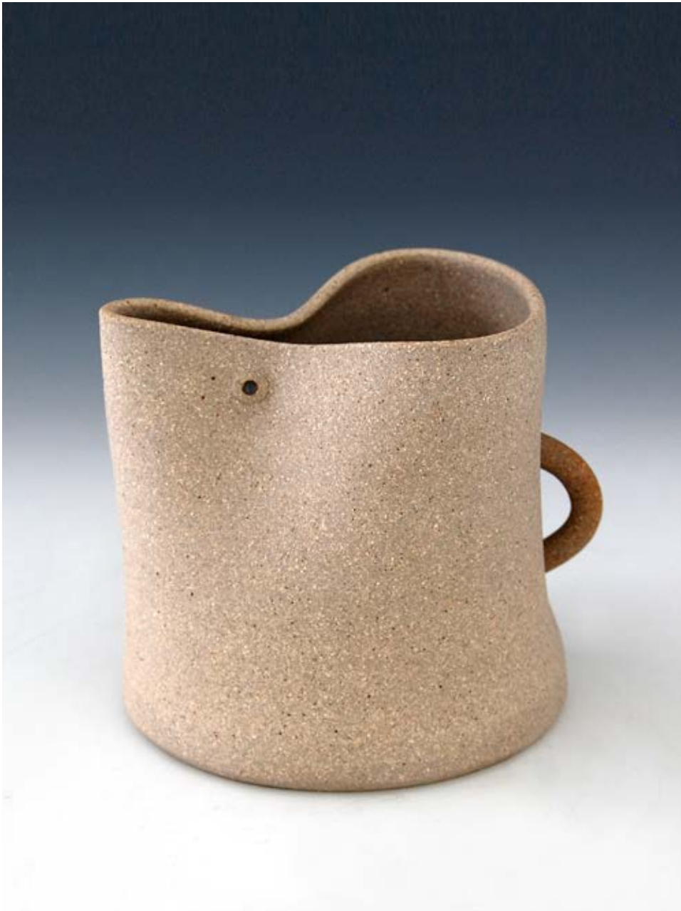
Gustavo Pérez Sin título (Vaso 2000-139) , 2000 stoneware 5 1/8 x 5 7/8 inches