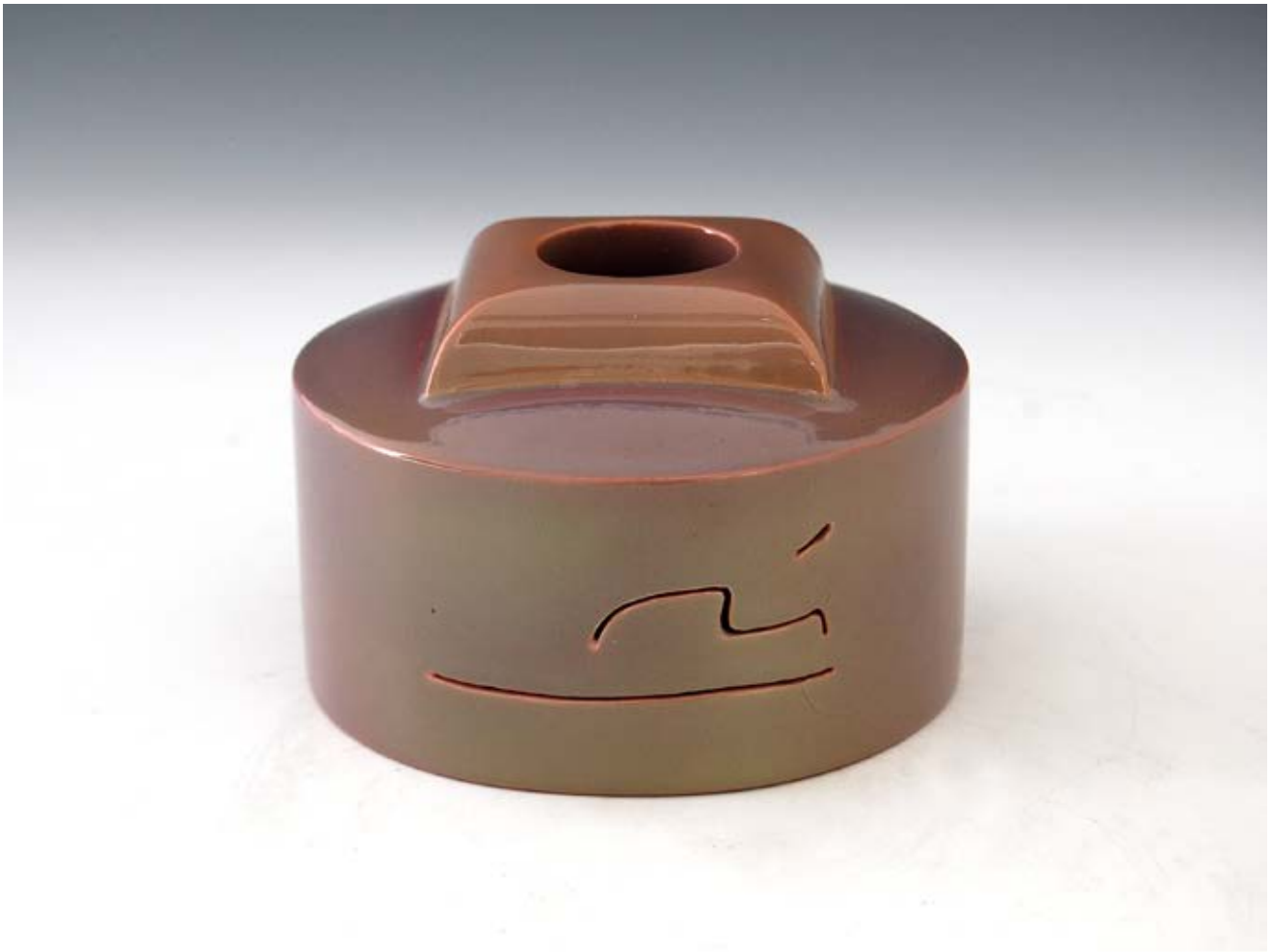
Ron Nagle Untitled Vessel , 1976 ceramic 3 x 5 x 5 inches