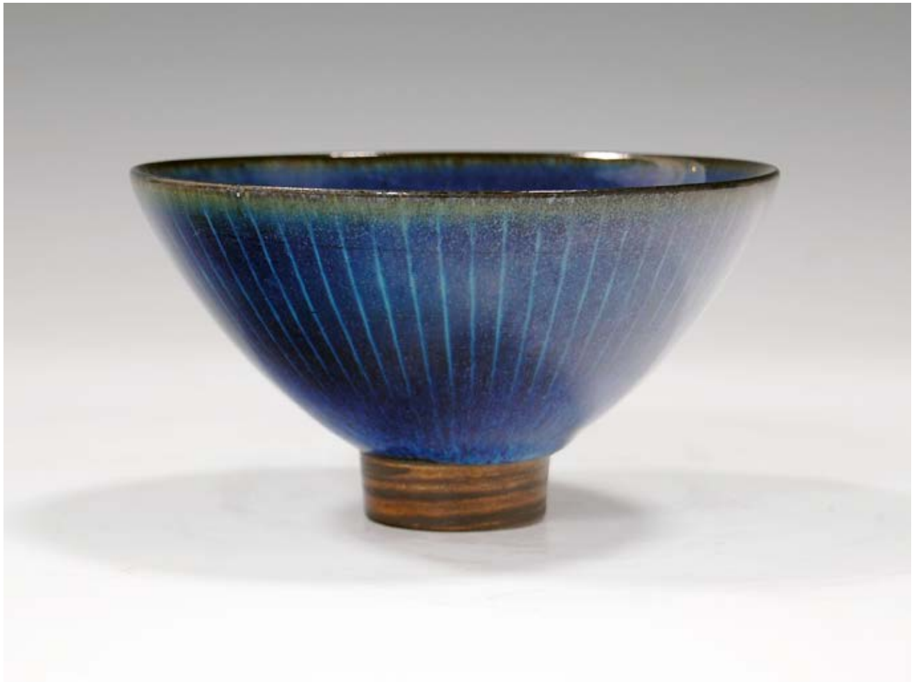
Harrison McIntosh Untitled Blue Bowl , c. 1994 ceramic 3 ¼ x 6 x 6 inches