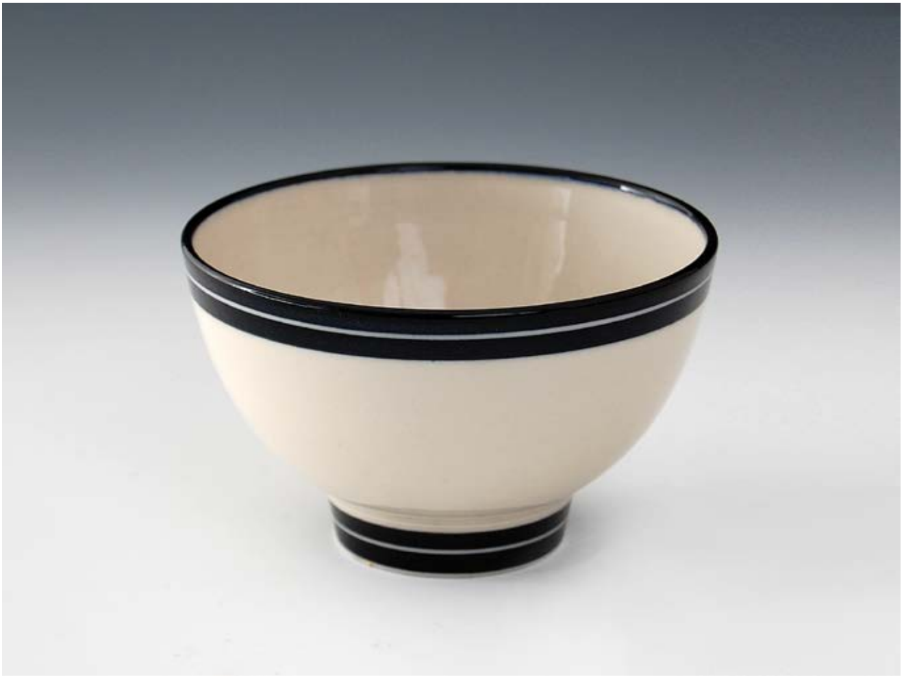
Roseline Delisle Untitled , 1983 porcelain 2 3/4 x 4 5/8 inches