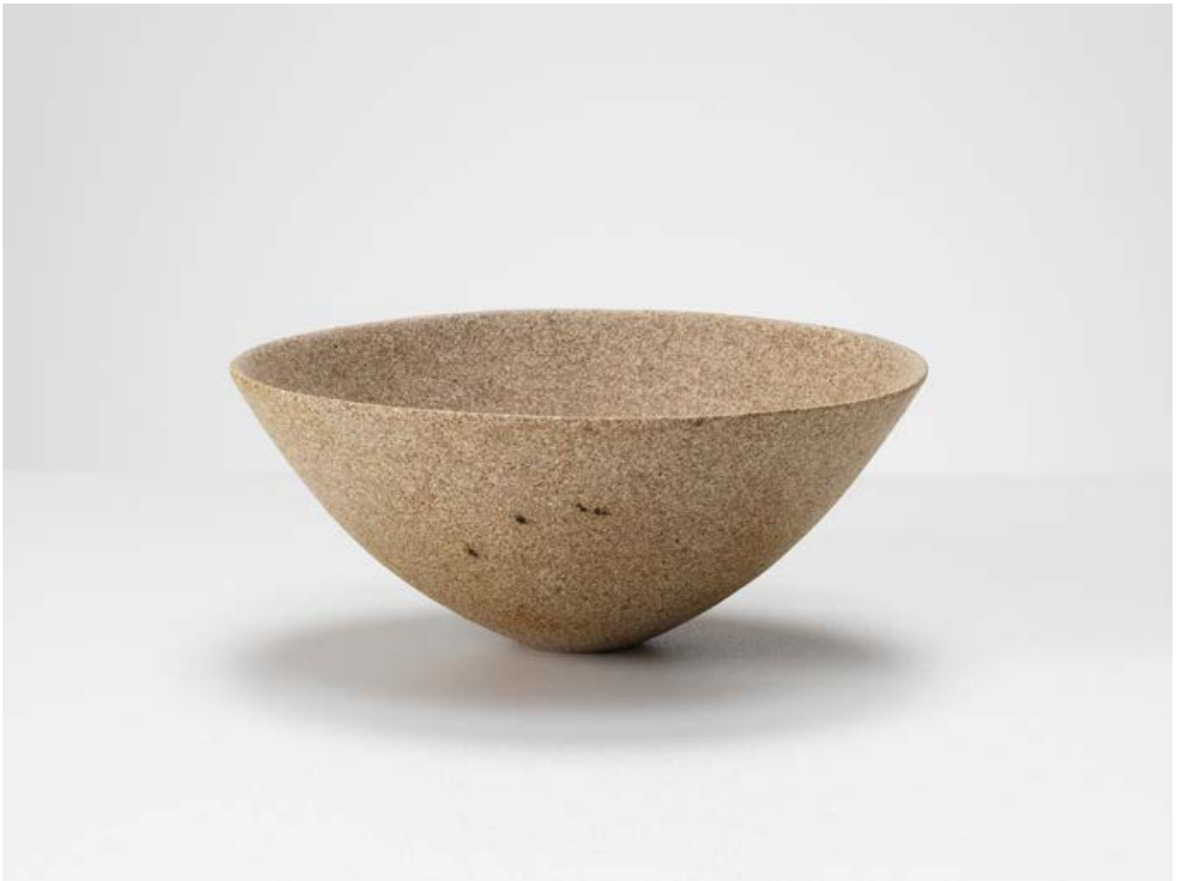
Jennifer Lee Rust grained, speckles , 2012 stoneware 2 ½ x 6 ⅛ inches