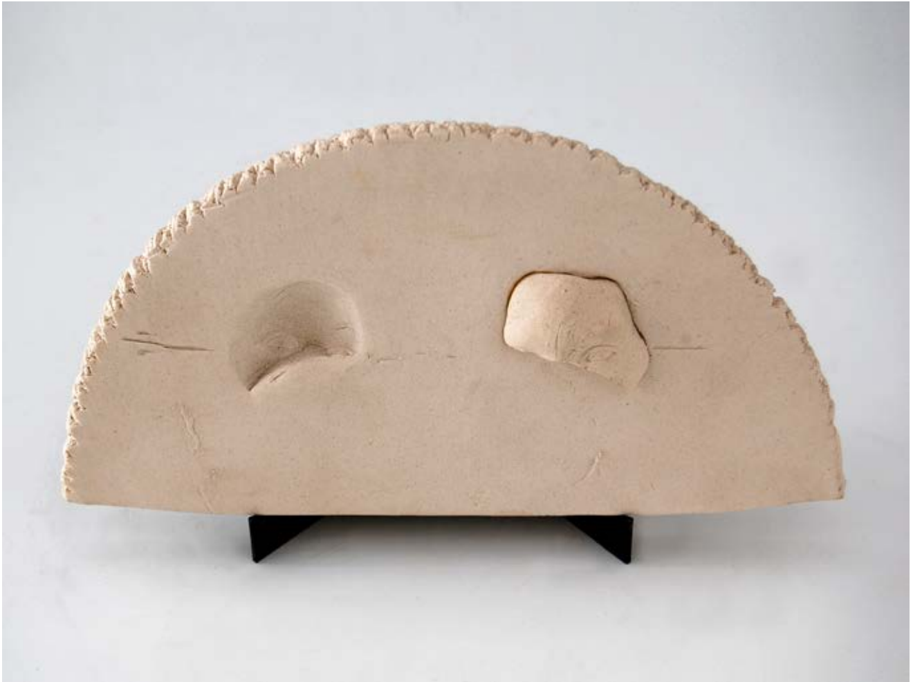
Robert Graham Untitled , 1975 ceramic 3 3 / 4 x 7 1 / 4 x 3 / 8 inches