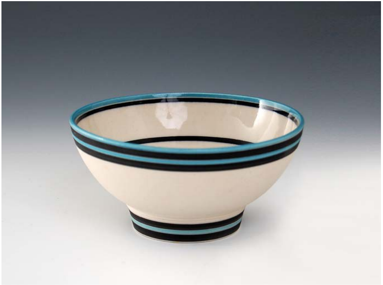
Roseline Delisle Untitled , 1983 porcelain 2 ½ x 5 ¼ inches