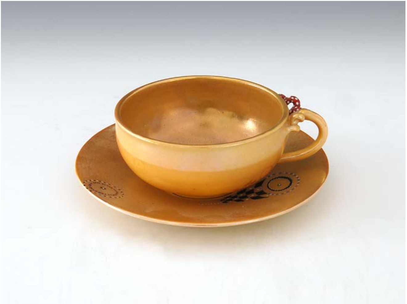
Ralph Bacerra Untitled , N.D. ceramic Plate: \frac{3}{4} x 6\frac{1}{2} x 6\frac{1}{2} inches Cup: 2\frac{1}{4} x 5\frac{1}{2} x 4\frac{1}{4} inches