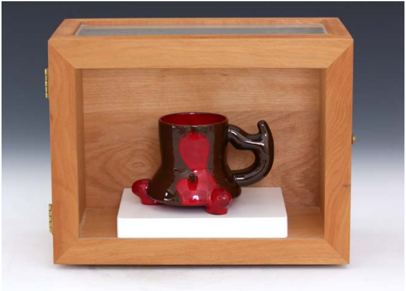
Ken Price Casper , 1993 edition 17/25 earthenware with hand-painted glaze in wooden display case 3 x 6 inches