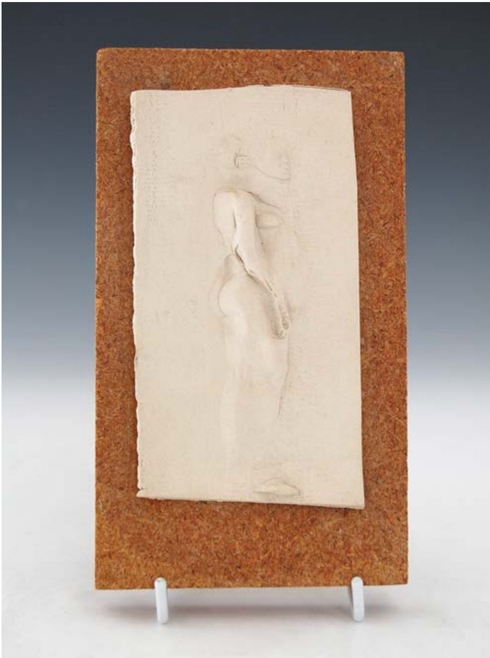
Robert Graham Untitled , 1975 ceramic 7 1/2 x 4 3/8 x 1 1/4 inches