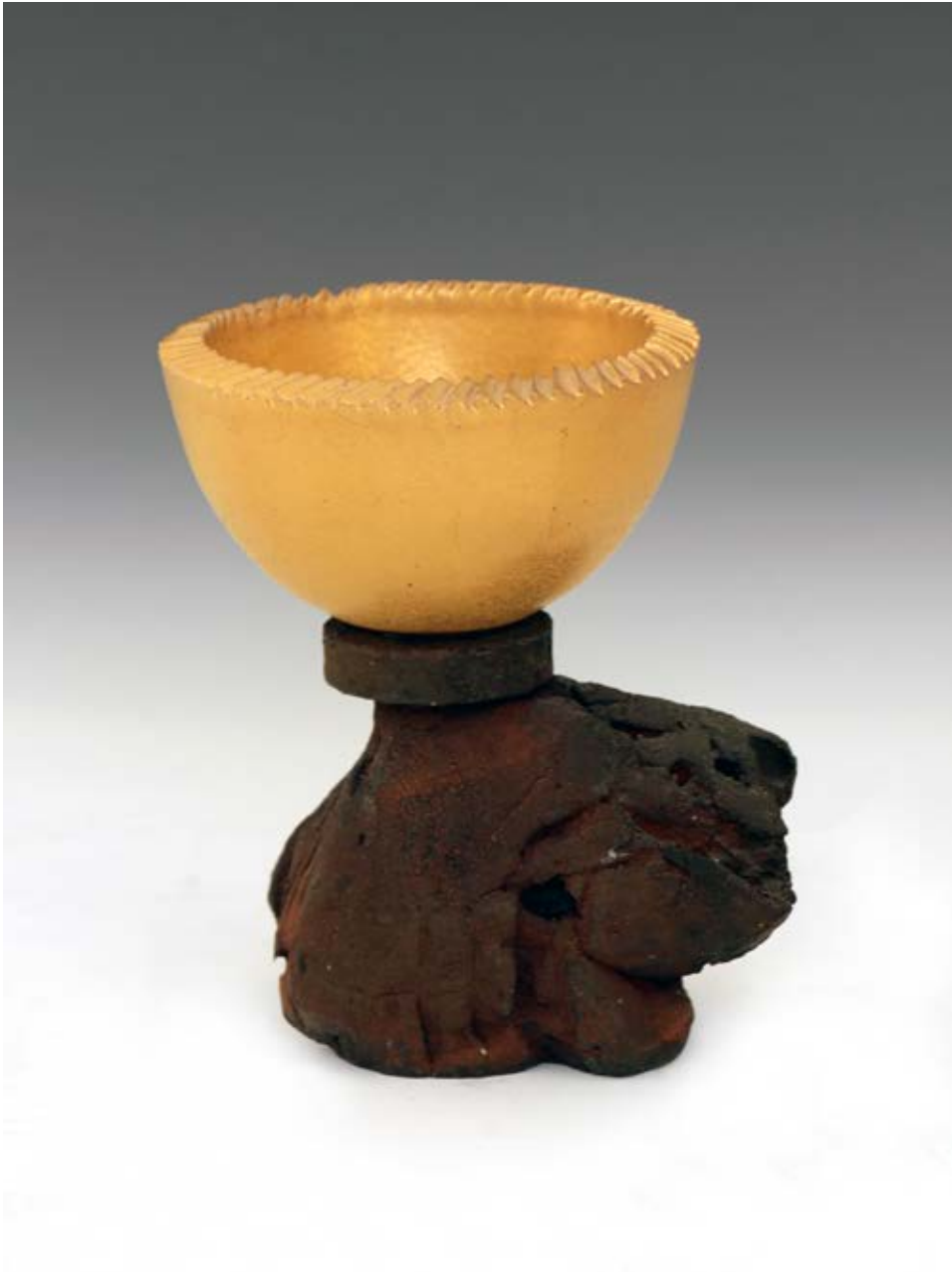
Adrian Saxe Gold Bowl on Stand , 1983 porcelain 3 \frac{3}{4} x 3 \frac{1}{2} x 3 \frac{1}{4} inches