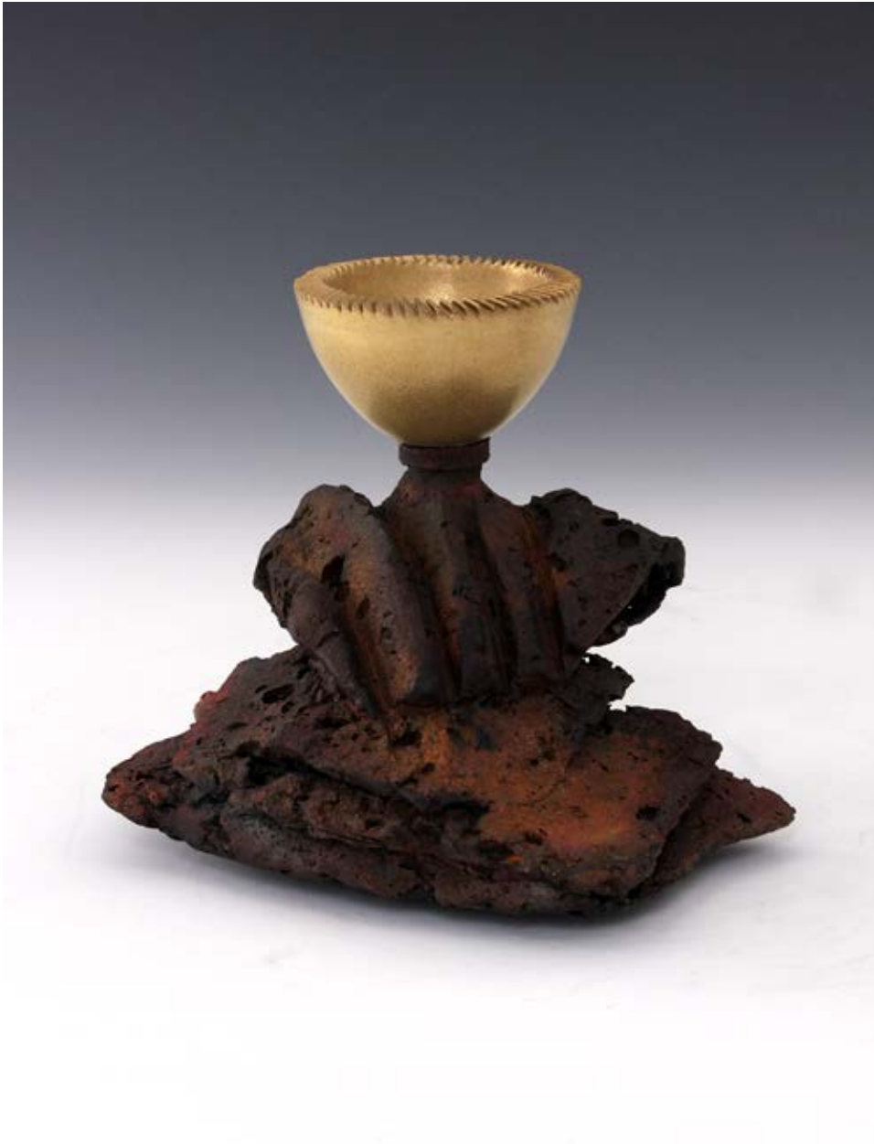
Adrian Saxe Untitled Mortar Bowl with Stand , 1984-1987 porcelain, raku, gold and lusters Overall: 6 ¼ x 7 x 5 inches Bowl: 1 ¾ x 3 inches Stand: 4 ½ x 7 x 4 ½ inches