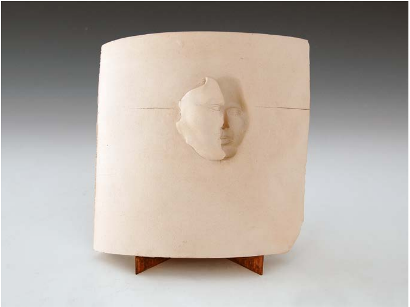
Robert Graham Untitled , 1975 ceramic 6 1/8 x 6 1/4 x 3/4 inches