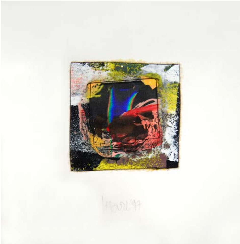
Larry Bell Fraction #2482 , 1997 mixed media on paper 10 x 10 inches