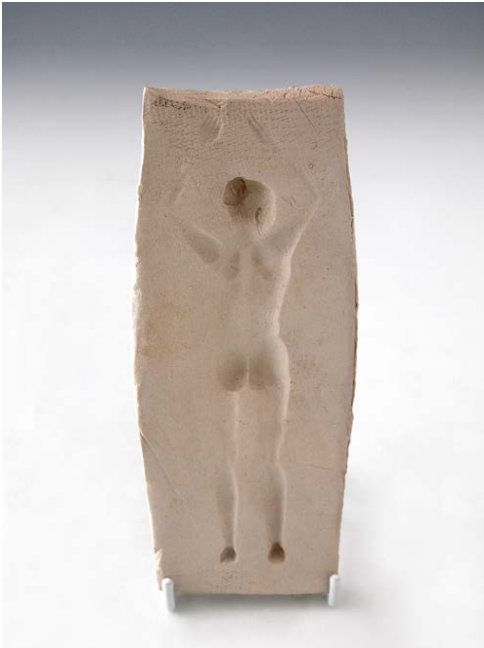
Robert Graham Untitled , 1975 ceramic 6 ¾ x 3 x ½ inches