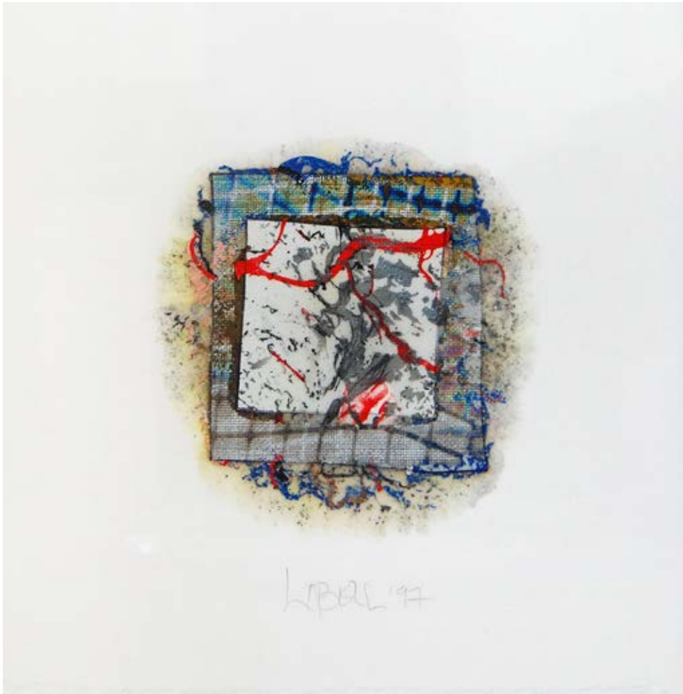
Larry Bell Fraction #2796 , 1997 mixed media on paper 10 x 10 inches