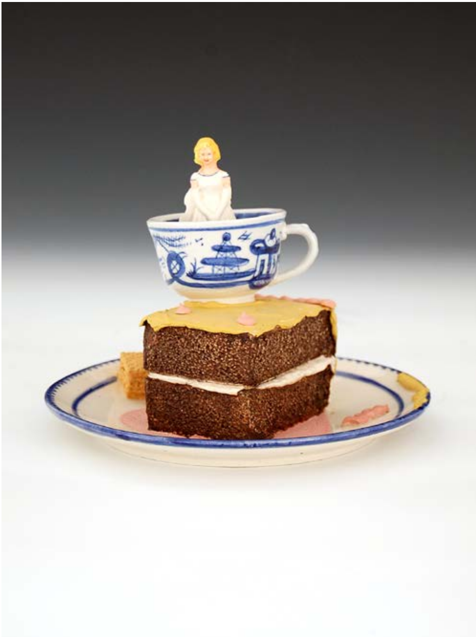
Richard Shaw Girl in Teacup , 2005 porcelain with underglaze transfers and overglaze decals 8 x 5 ½ x 8 inches