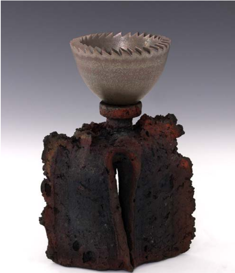
Adrian Saxe Untitled Mortar Bowl with Stand , 1984 porcelain, palladium, and multiple lusters, raku Overall: 6 ½ x 4 ¾ x 3 ½ inches Bowl: 1 ⅞ x 3 inches Base: 4 ¾ x 5 x 3 inches