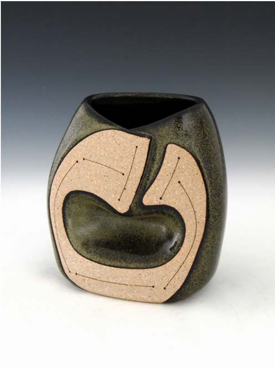
Gustavo Pérez Vase (06-532) , 2006 stoneware 5 ½ x 4 ⅞ x 3 ⅞ inches