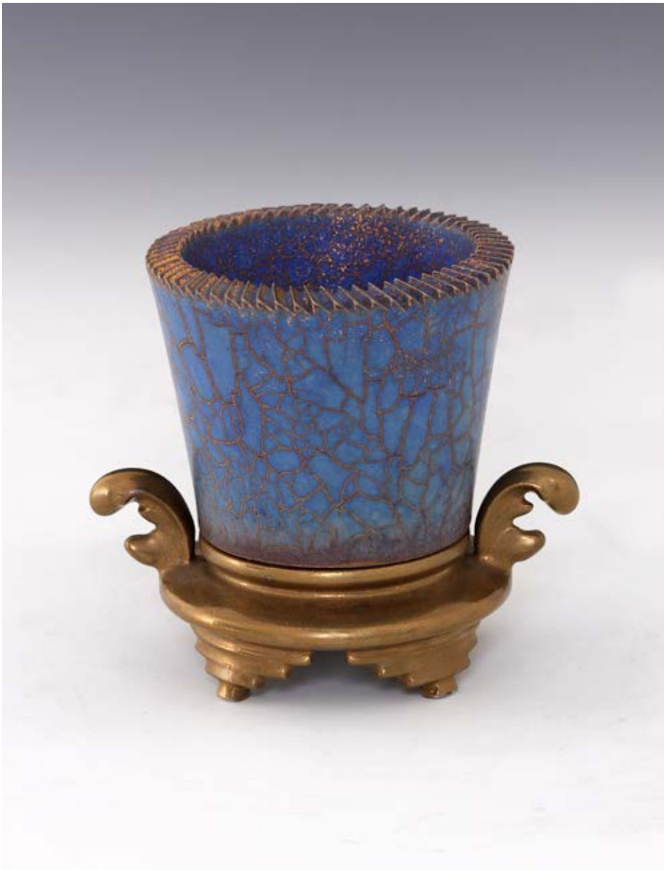
Adrian Saxe Untitled Beaker with Stand , 1983 porcelain, multiple gold lustres Overall: 3 \frac{1}{8} x 4 \frac{3}{8} x 3 \frac{1}{4} inches Beaker: 2 \frac{1}{8} x 3 \frac{1}{4} inches Stand: 1 \frac{1}{8} x 4 \frac{3}{8} x 3 \frac{1}{4} inches