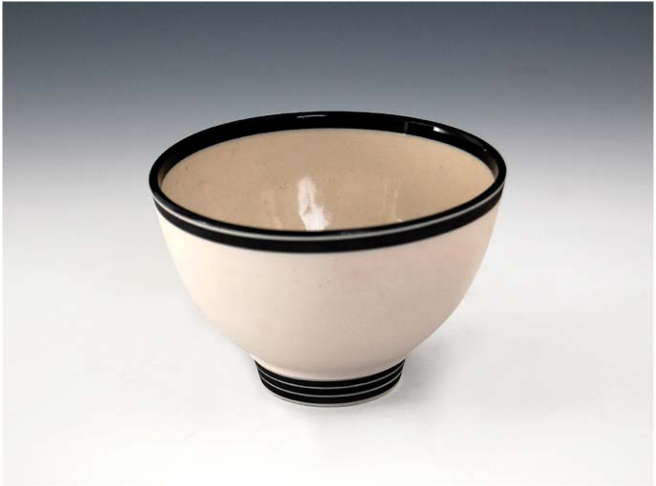
Roseline Delisle Untitled , 1983 porcelain 2 ¾ x 4 ½ inches