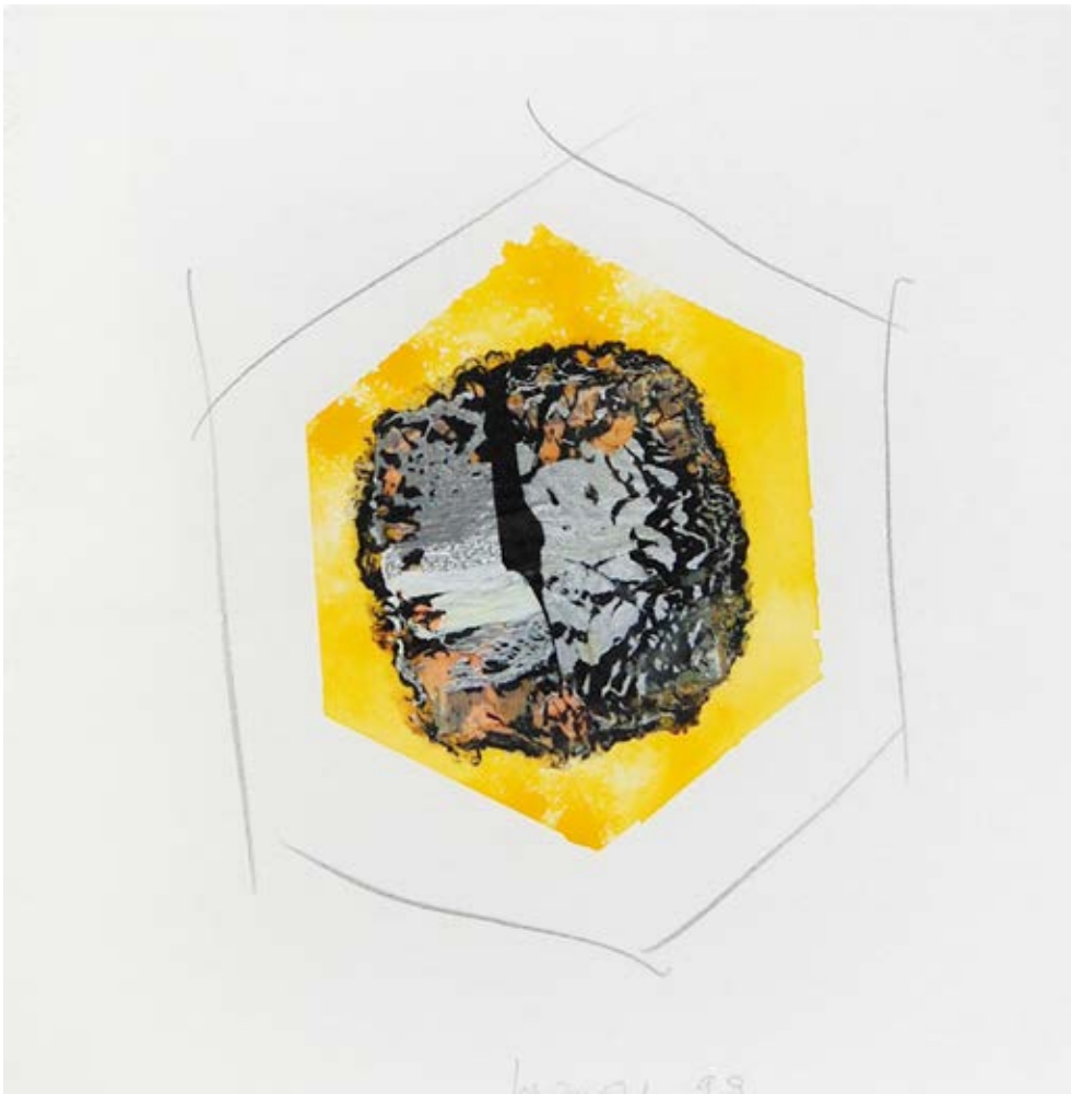
Larry Bell Fraction #5574 , 1999 mixed media on paper 10 x 10 inches