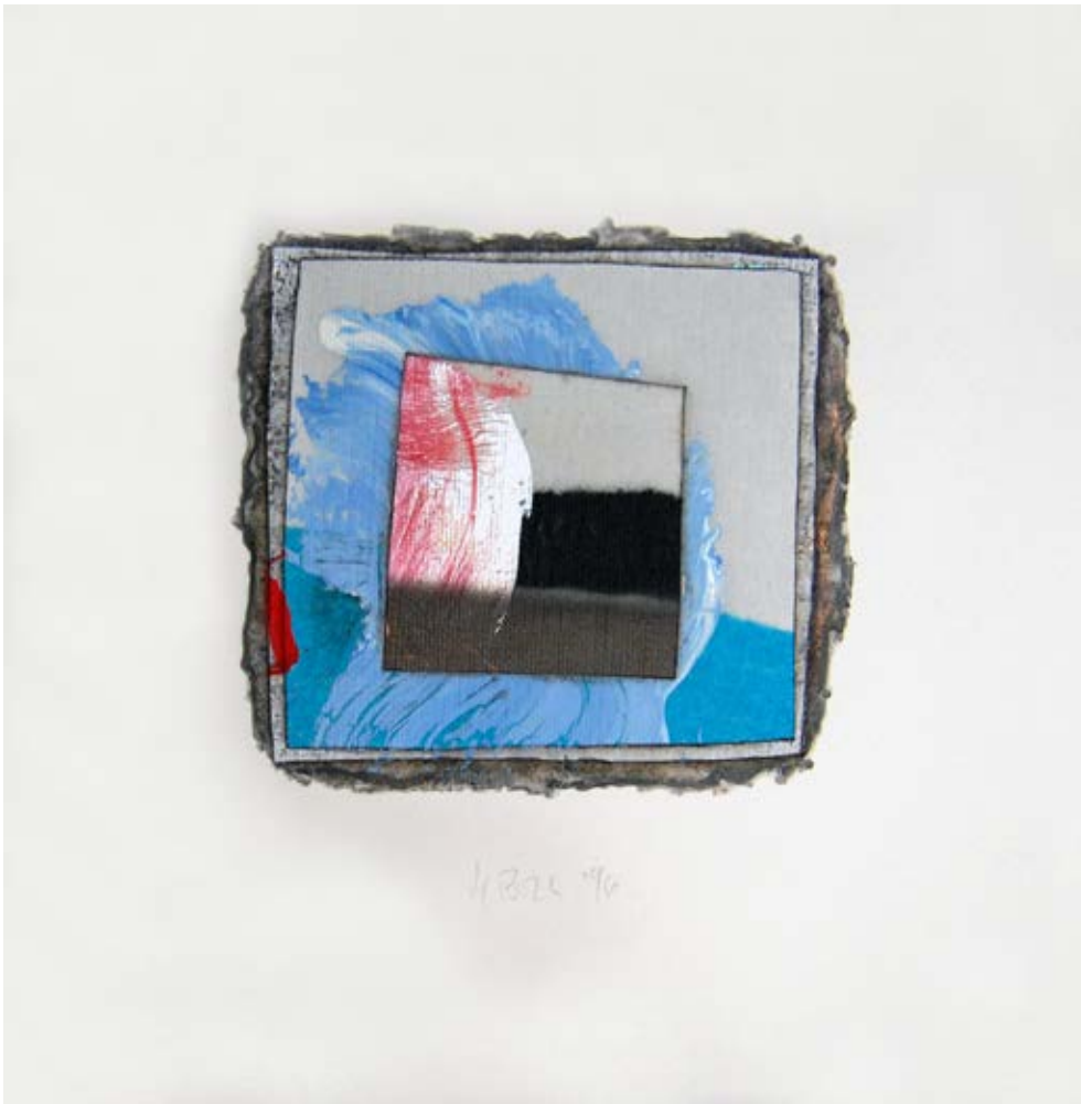
Larry Bell Fraction #1480 , 1996 mixed media on paper 10 x 10 inches