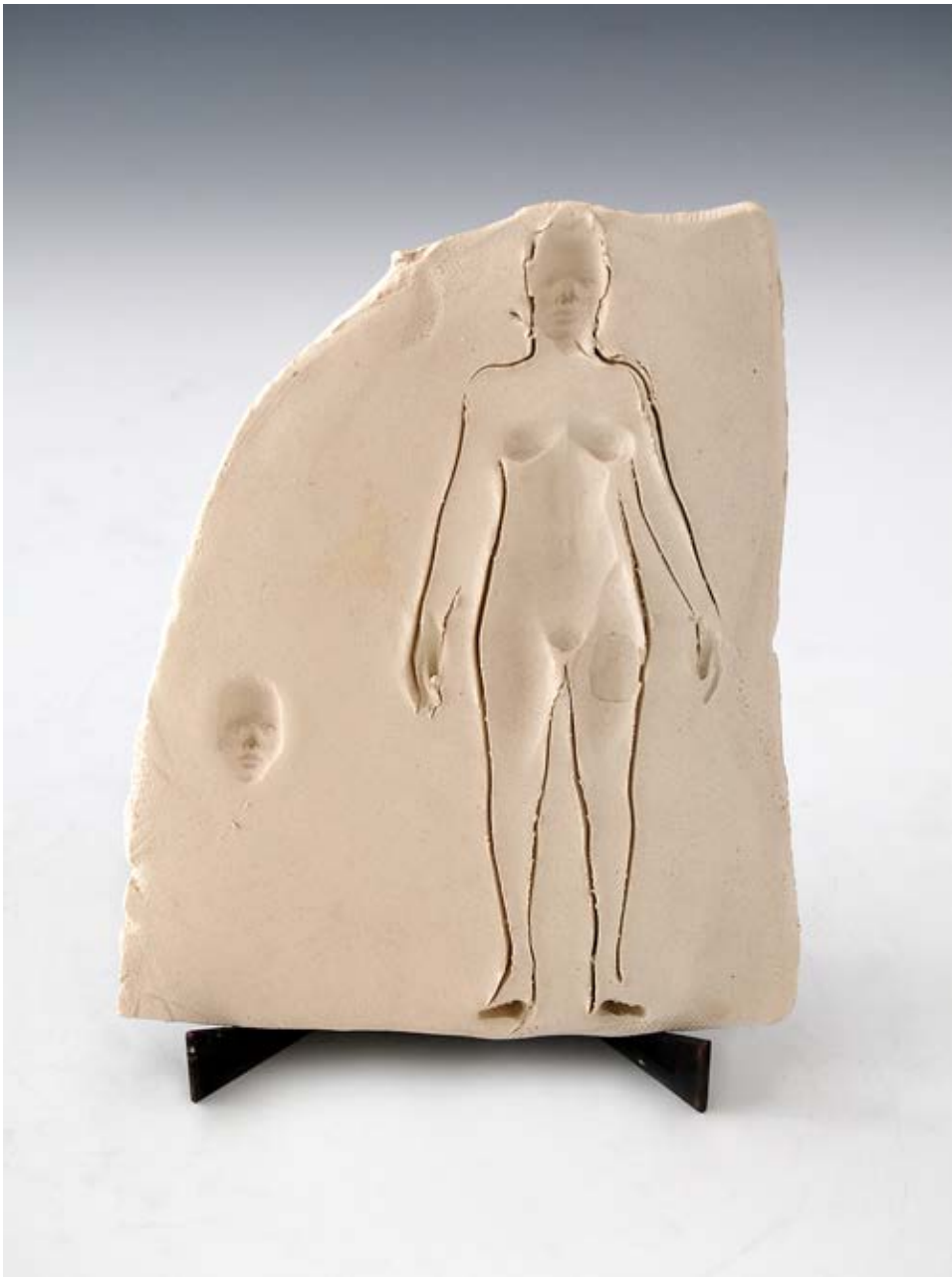
Robert Graham Untitled , 1975 ceramic 5 ½ x 4 ½ x ¼ inches