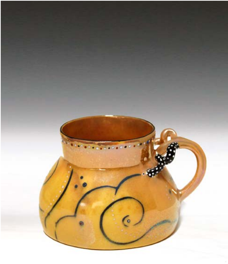
Ralph Bacerra Untitled , 2000 ceramic 3 ¼ x 5 x 3 ½ inches