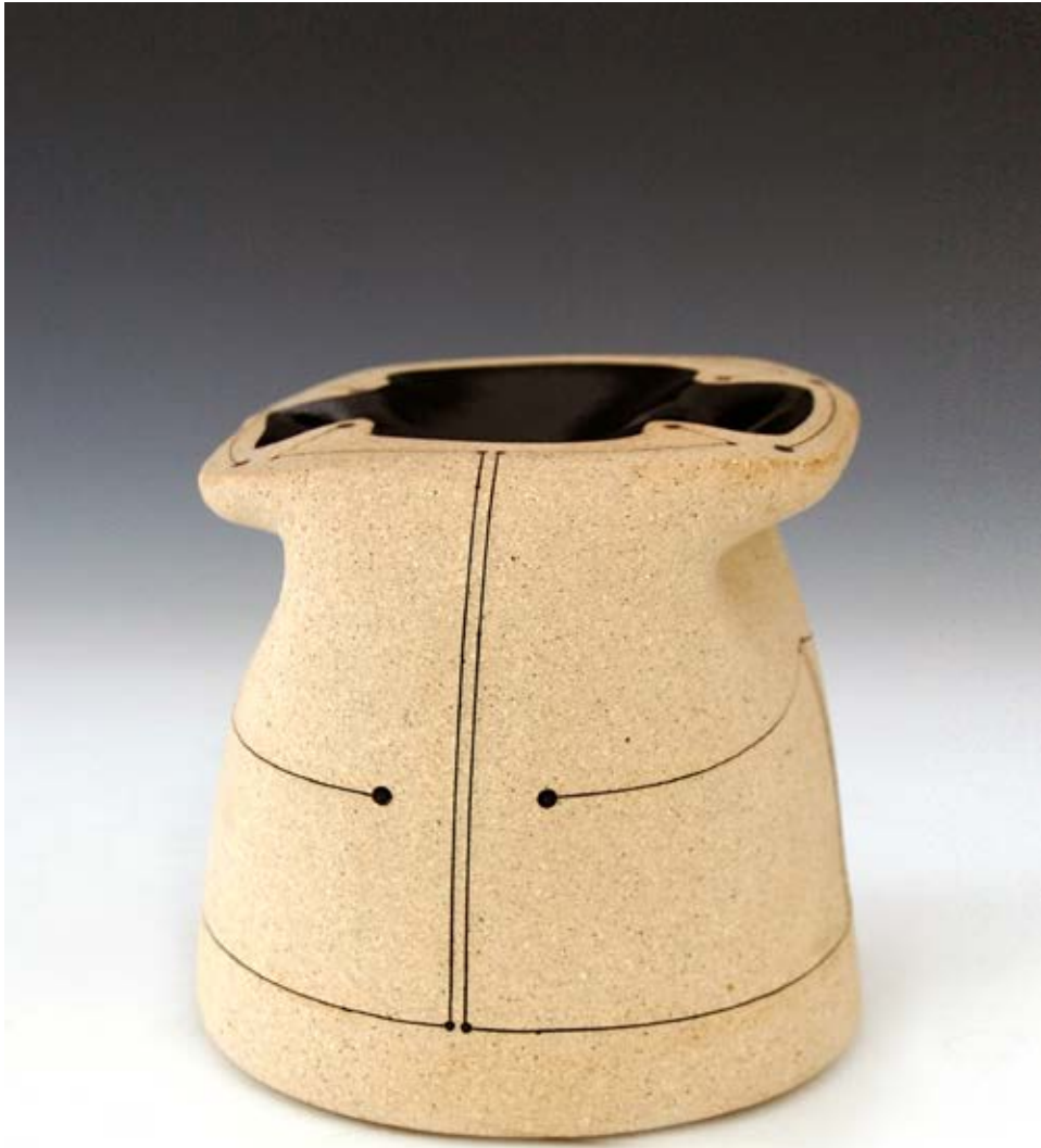
Gustavo Pérez Vase (06-89) , 2006 stoneware 4 3 / 8 x 4 3 / 4 inches