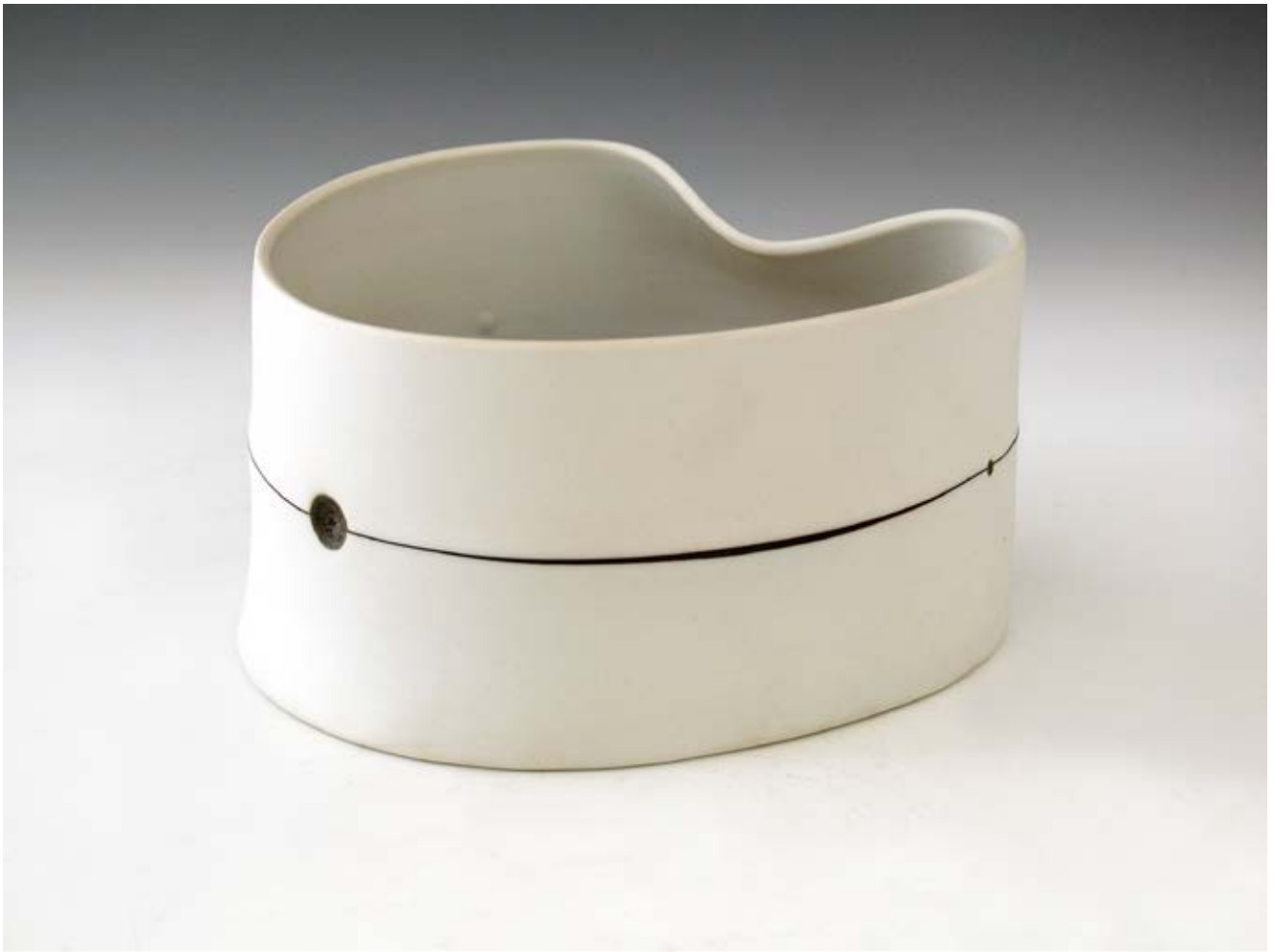
Gustavo Pérez Vaso (02-348) , 2002 porcelain 3 ¼ x 5 ¾ x 6 inches