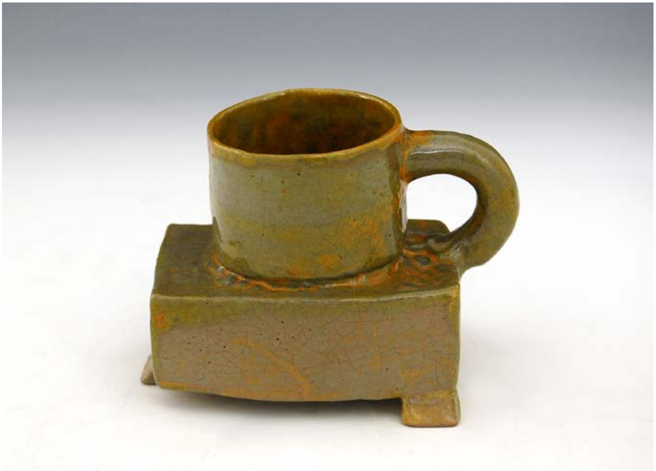
Ken Price Untitled Cup , N.D. earthenware 3 ½ x 4 ¾ x 3 inches