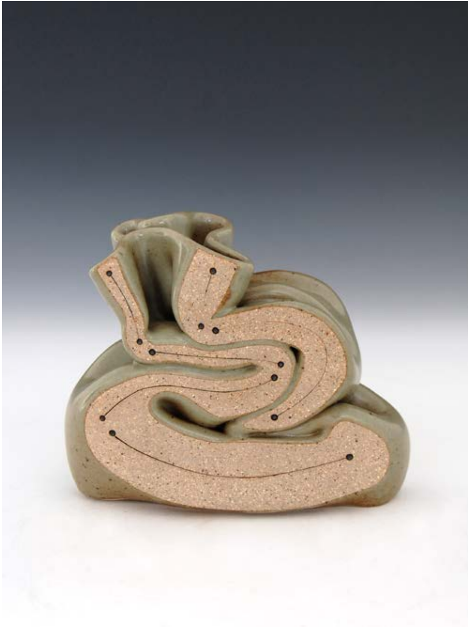
Gustavo Pérez Vase (05-342) , 2005 stoneware 5 ¼ x 6 ¼ x 1 ¾ inches