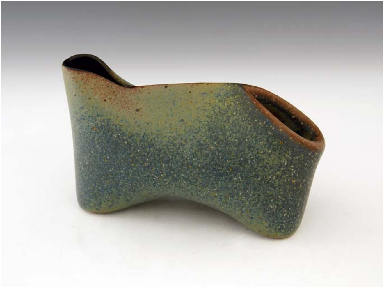
Gustavo Pérez Sin titulo (vase 02-218) , 2002 stoneware 4 ½ x 7 x 3 ¼ inches