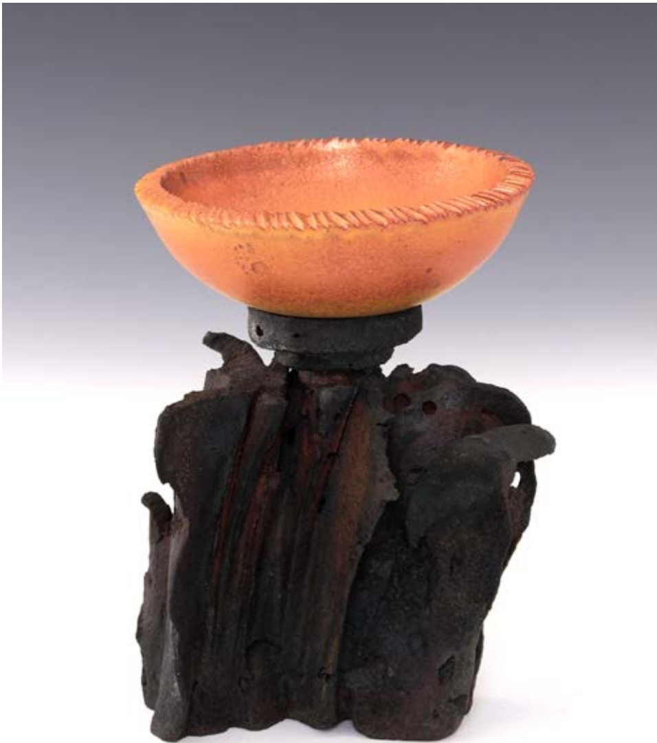
Adrian Saxe Untitled Mortar Bowl with Stand , 1983 porcelain, raku, gold and lusters Overall: 6 \frac{1}{4} x 4 \frac{1}{2} x 4 \frac{1}{2} inches Bowl: 1 \frac{1}{2} x 4 \frac{3}{8} inches Stand: 4 \frac{3}{4} x 4 \frac{3}{4} x 4 \frac{1}{4} inches