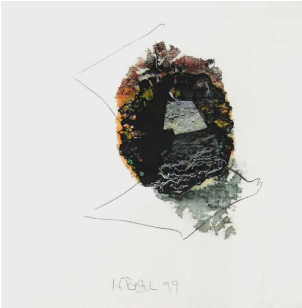
Larry Bell Fraction #5238 , 1999 mixed media on paper 10 x 10 inches