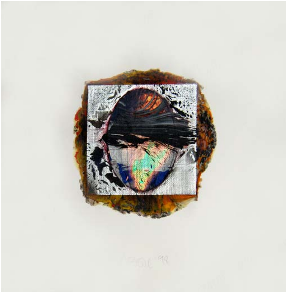
Larry Bell Fraction #3099 , 1998 mixed media on paper 10 x 10 inches