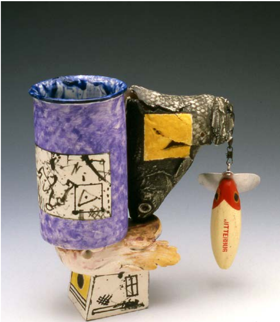
Robert Hudson Jitterbug Cup , 1973/98 porcelain, fishing lure 6 x 6 x 3 inches