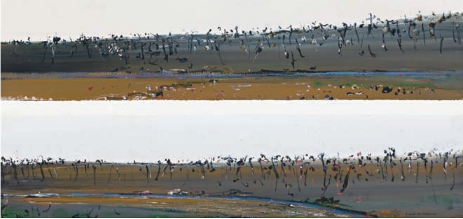
11. Fred WILLIAMS The Yarra at Kew 1971 gouache on paper 36.0 x 74.0 cm 12. Fred WILLIAMS Upwey Landscape III 1965 gouache on paper 57.0 x 76.0 cm