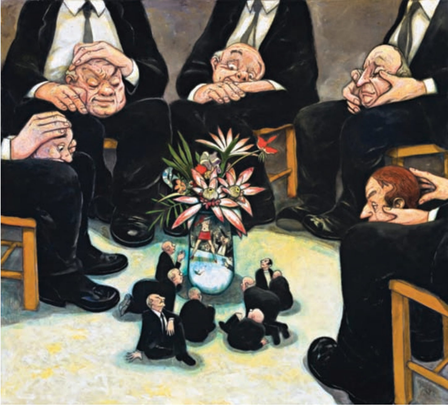
17. Fred CRESS Laptops 2001 synthetic polymer paint on canvas 152.0 x 168.0 cm