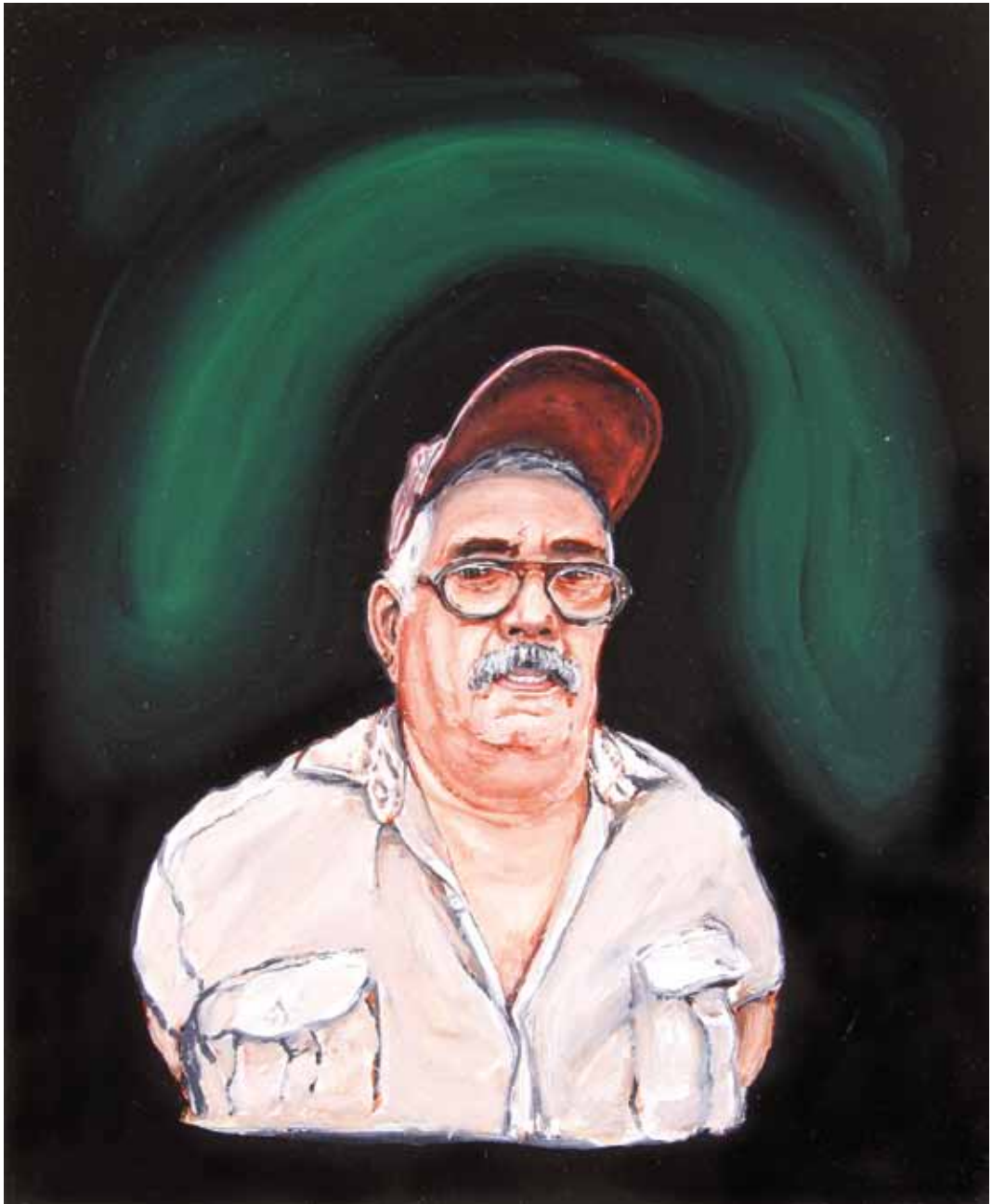
ALBERTO REY Cuban Portraits: Alberto, Agramonte, Cuba, undated Oils on Plaster, 15 ½ x 12 in. (39,4 x 30,5 cm).