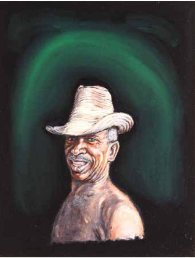
ALBERTO REY Cuban Portraits: Candelario, Agramonte, Cuba , undated Oils on Plaster, 15 ½ x 12 in. (39,4 x 30,5 cm) Courtesy of the artist, Fredonia, New York