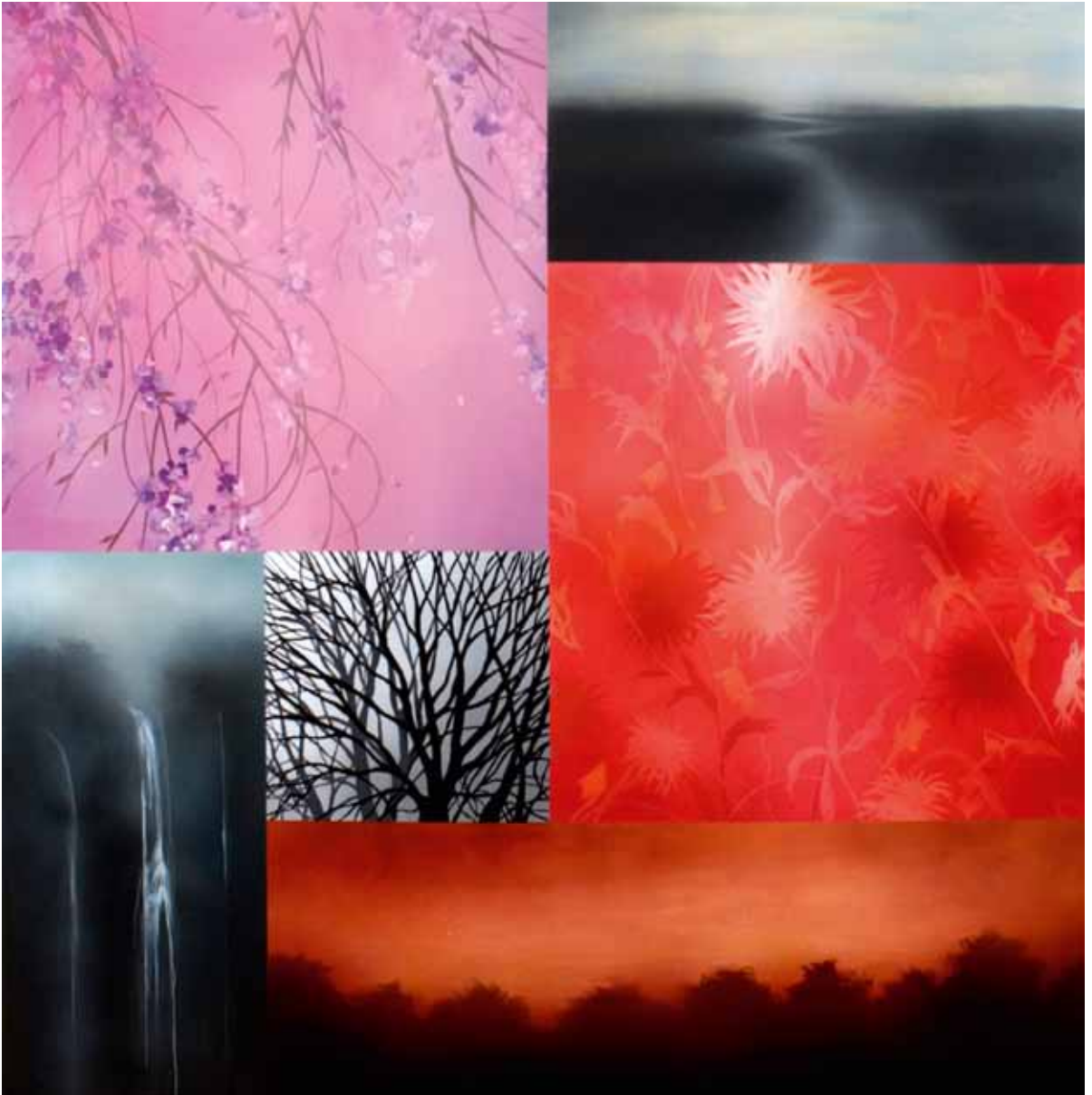
ZOE HERSEY Light Dawns , undated Acrylic on canvas, 70 x 70 in. (177,8 x 177,8 cm)