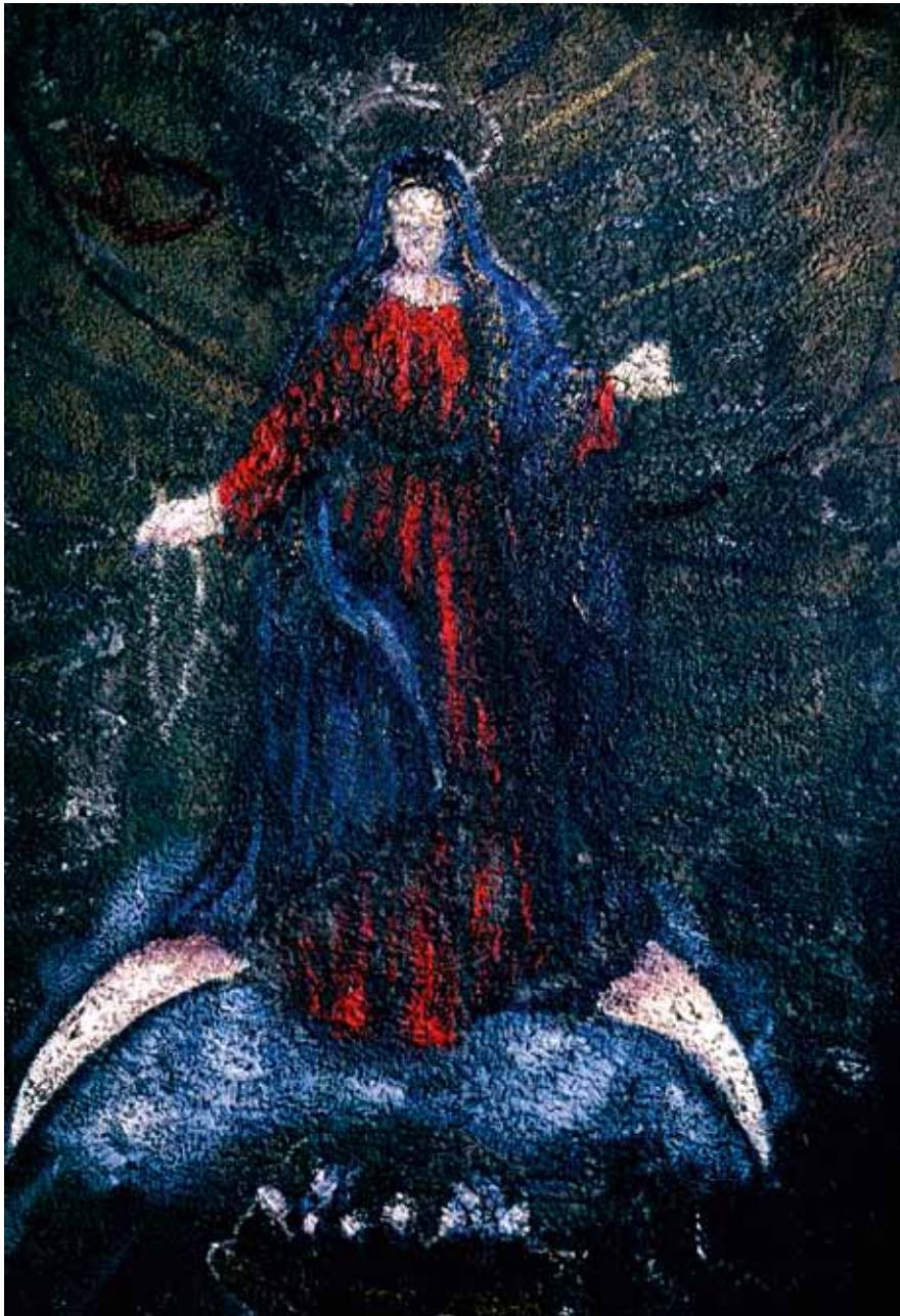
ALBERTO REY Cobre de Caridad , undated Mixed media on canvas, 72 x 48 in. (182,9 x 121,9 cm).