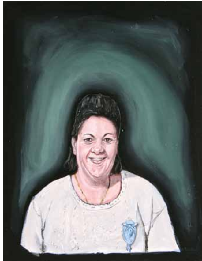
ALBERTO REY Cuban Portraits: Anna, Miami, Florida, United States , undated Oils on Plaster, 15 ½ x 12 in. (39,4 x 30,5 cm)