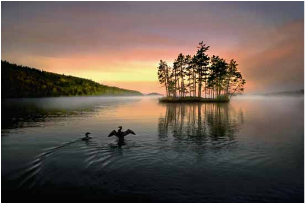
JIM BRANDENBURG Wilderness Loons – Day 10 Chased by Light , 1994 Photograph, 26 1/16 x 40 in. (67,8 x 101,6 cm).