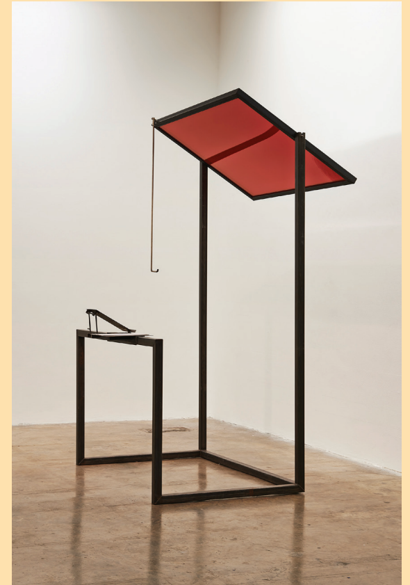
Céline Condorelli, Structure for Public Speaking , 2012–2013, Mild steel, perspex, mirror film, 230 × 160 × 120 cm