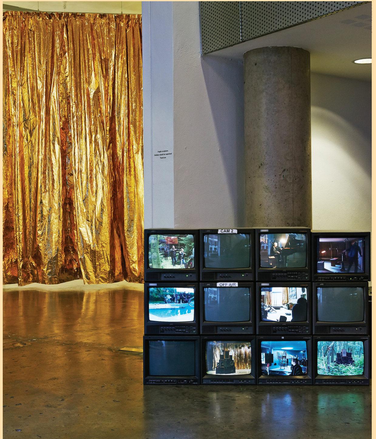
Céline Condorelli, Structure for Communicating with Wind and Screen Tests, 2012–2013, Installation view, Project Arts Centre