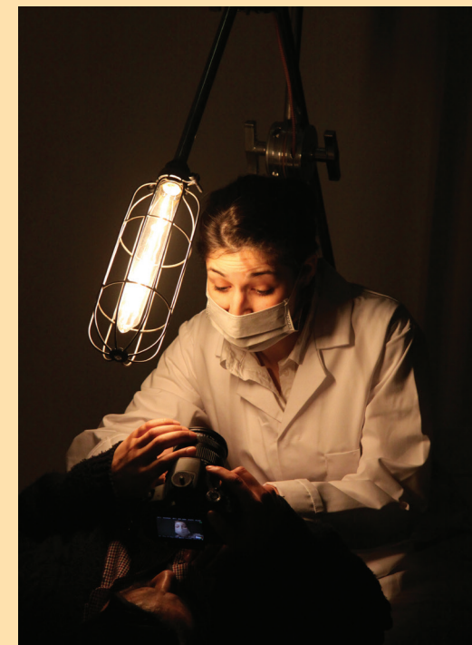
The Company , 2013, in action; a series of unscripted, impromptu events. Gallery as studio week, day 2, Project Arts Centre

Condorelli's Additional s also have a rich and active life beyond the moving image; they can be apprehended as still photographs, framed either as sculptures or prop object. They exist too as a series of 'character descriptions' written by Will Holder (in the guise of Amy, one of the six characters adopted in dialogue with Cardew's score), and as material things that can be observed at close quarters and, in some circumstances, physically manipulated by exhibition-goers. Even within the context of a specific exhibition, such as their presentation in the gallery of Project Arts Centre, Additional s are set in motion and animated as performers in two scenes guided by Cardew's score; Daypiece and Nightpiece . The transition from 'Day' to 'Night' is manifest through changes in the room's environment: the gallery lights dim and brighten, sound emanates at times from the stack of speakers constituting Structure for Listening , and the electric fan poised behind the Structure for Communicating with Wind switches on and off, causing the delicate metallic curtain to billow and recede.