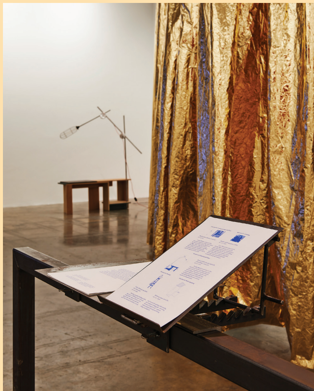
Céline Condorelli, Additional , 2013, installation view, Project Arts Centre