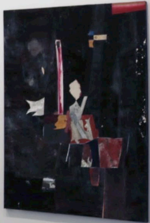
Surveyor Installation View, 2016 Susan Inglett Gallery, NYC.