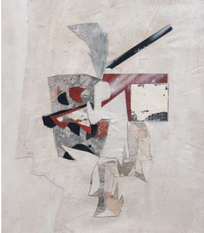
Untitled (Surveyor) IV, 2016 Oil, enamel, acrylic, aluminum, paper, tape, lead, linen, canvas 26 x 22 in.