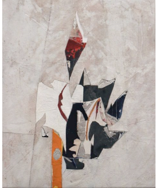
Untitled (Surveyor) VI, 2016 Oil, enamel, acrylic, aluminum, paper, rubber, tape, perspex, linen, canvas 26 ¼ x 22 in.