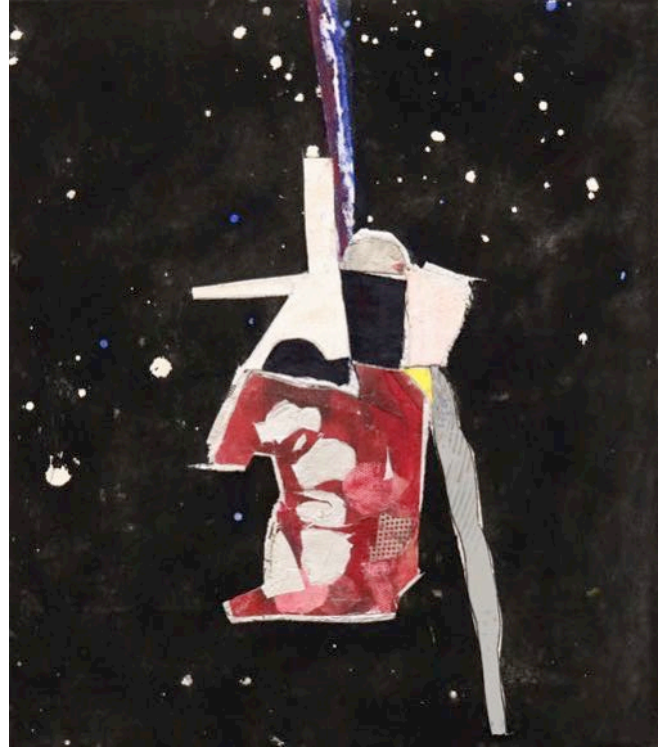
Untitled (Surveyor) V, 2016 Oil, enamel, acrylic, paper, rubber, linen, tape, perspex, canvas 26 ¼ x 22 ½ in.