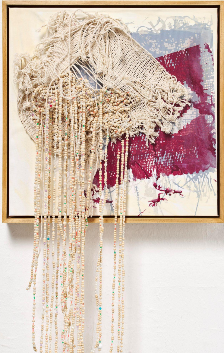
Entanglement III , co-created with Pinky Moyo 2019

Co-created with Pinky Moyo. Wooden and glass beads made in China, fishing gut, string, embodied traces of time/labour/exertion/conversation/instruction, digital print and acrylic on canvas 50 x 50 cm (19.7 x 19.7 inches) £ 2,000 (framed)