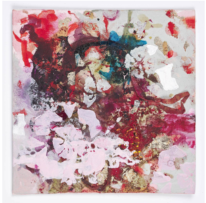
Immaterial Gesture IX (2019) Ink, glue, washing-up cloth, gold leaf, embodied traces of time/labour/exertion/creative process and acrylic on canvas 25 x 25 cm (7.1 x 7.1 inches) £ 350 (framed)