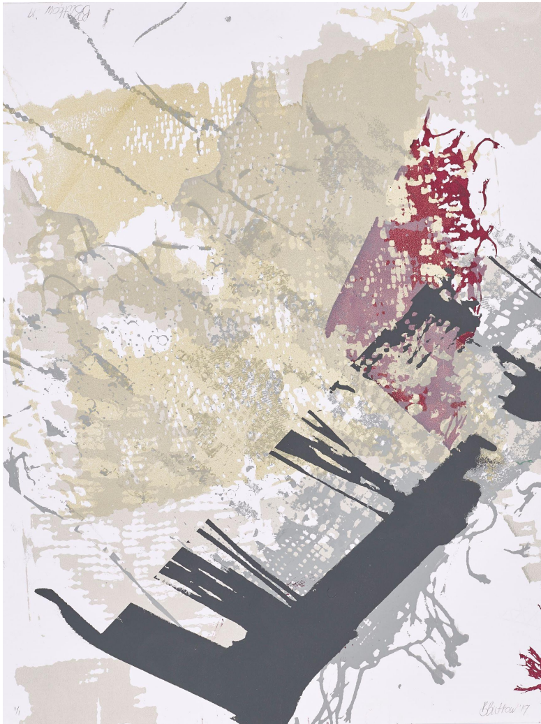
Untitled IX (Traces Of Labour series) 2019 Silkscreen Monotype 56 x 42cm £ 500 (unframed)