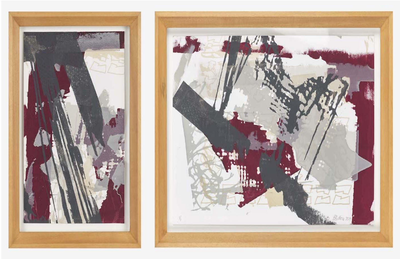
Untitled I & II (Traces Of Labour series), 2019 Screenprint Monotype 36 x 80 cm (14.2 x 31.5 inches) £500 (framed)