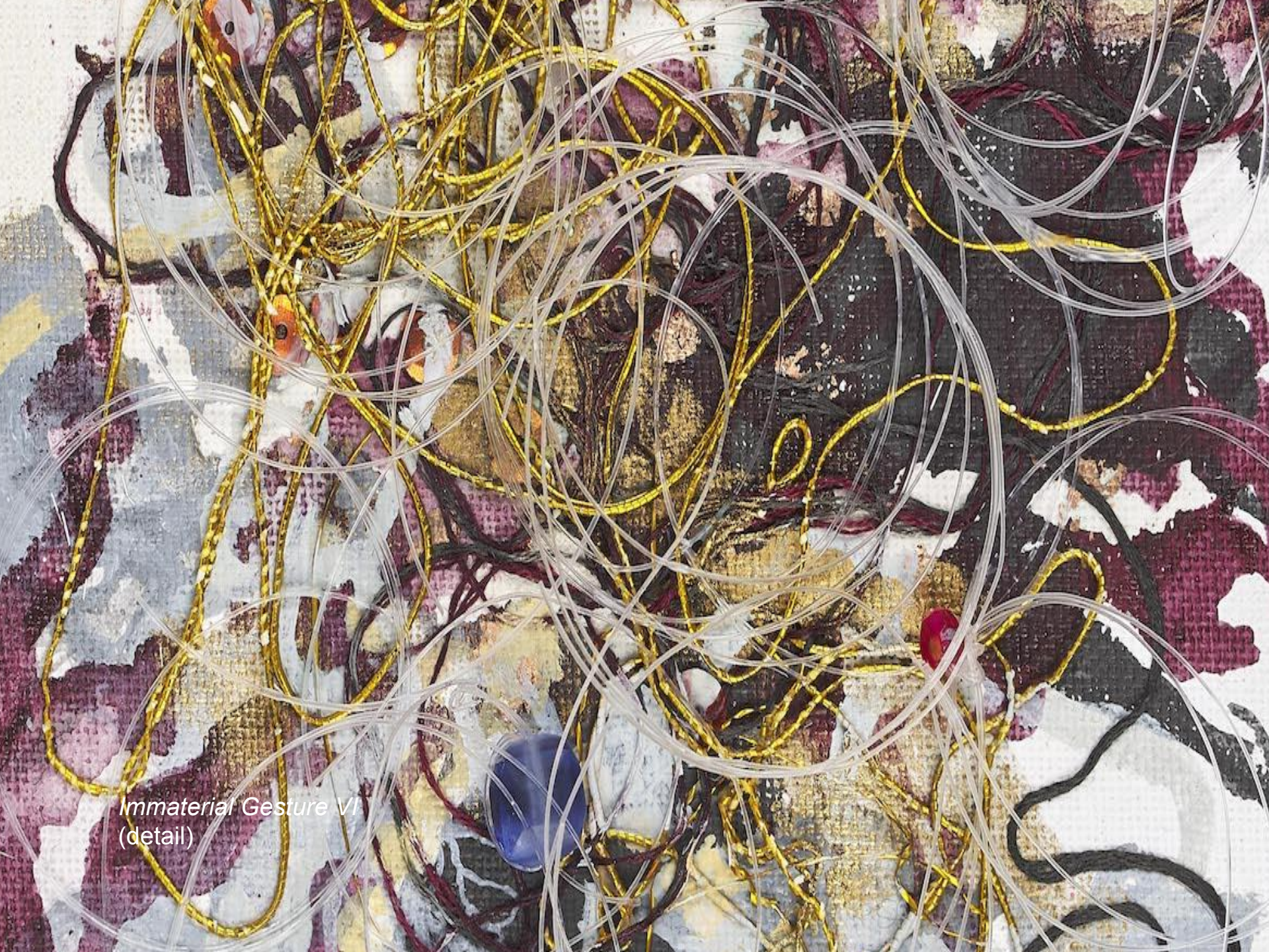
Immaterial Gesture VI (detail)