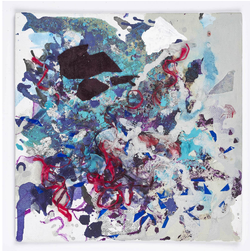
Immaterial Gesture VIII (2019)

Ink, glue, washing-up cloth, insulation tape, silver leaf, embodied traces of time/ labour/exertion/creative process, wool and acrylic on canvas