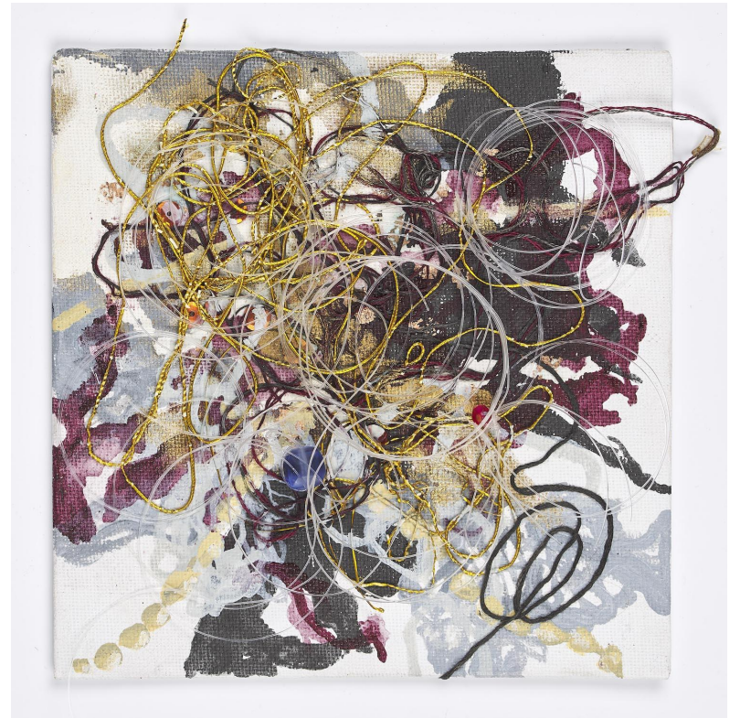
Immaterial Gestures VI (2019) Embodied traces of time/ labour/exertion/creative process and acrylic, fishing gut, thread and beads on canvas 18 x 18 cm (7.1 x 7.1 inches) £ 250 (framed)