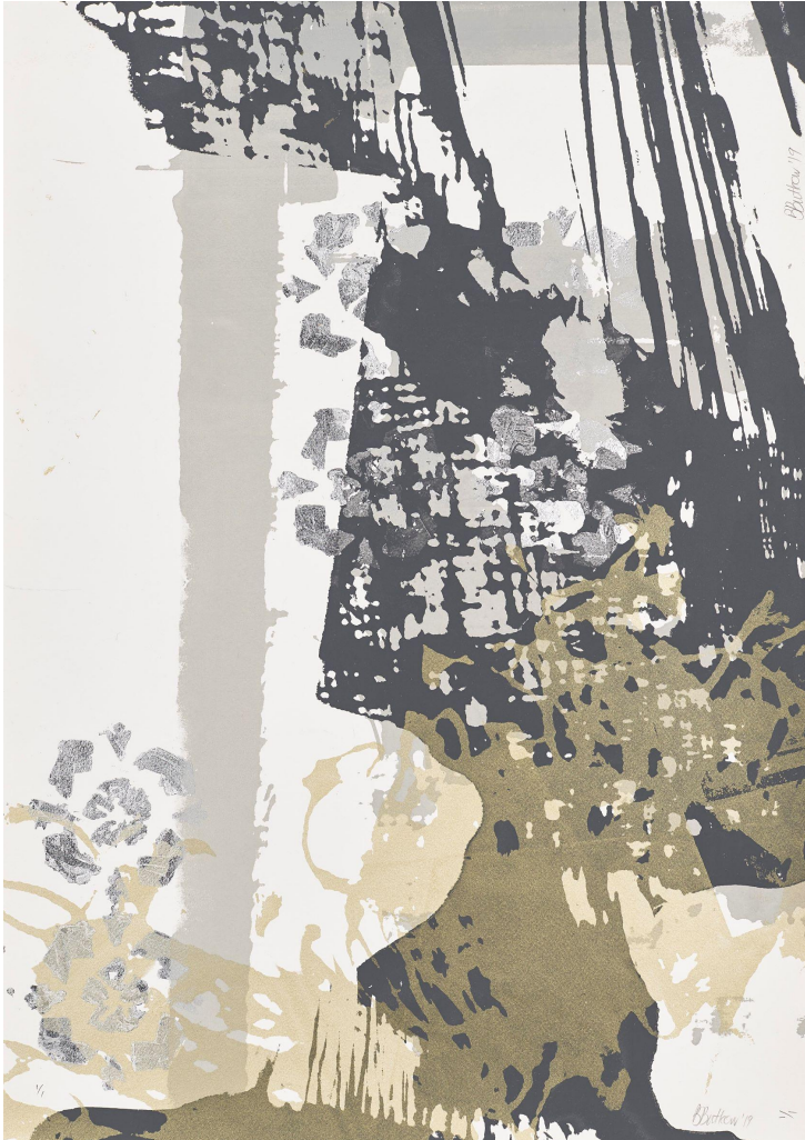
Untitled VII (Traces Of Labour series) 2019 Silkscreen Monotype 56 x 42cm £ 500 (unframed)