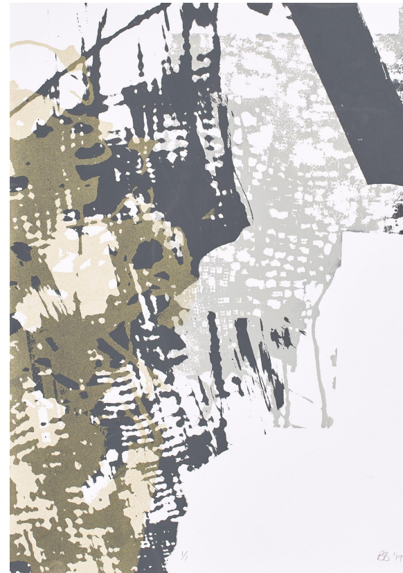
Untitled VI (Traces Of Labour series) 2019 Silkscreen Monotype 42 x 29.5cm £ 300 (unframed)