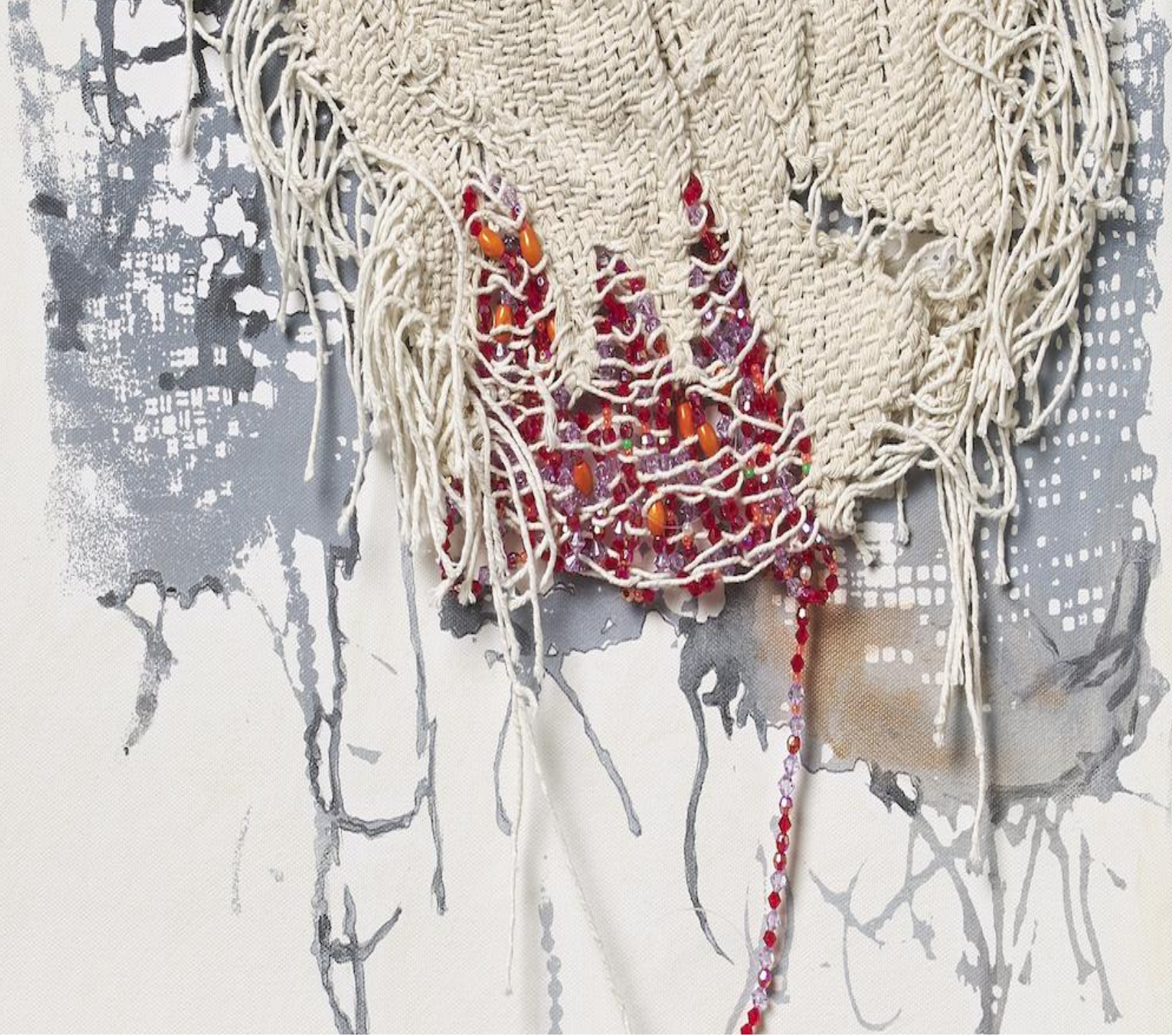
Entanglement II (detail)