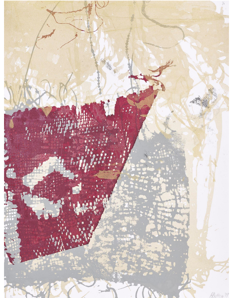
Untitled XI (Traces Of Labour series) 2019 Silkscreen Monotype 56 x 42cm £ 500 (unframed)