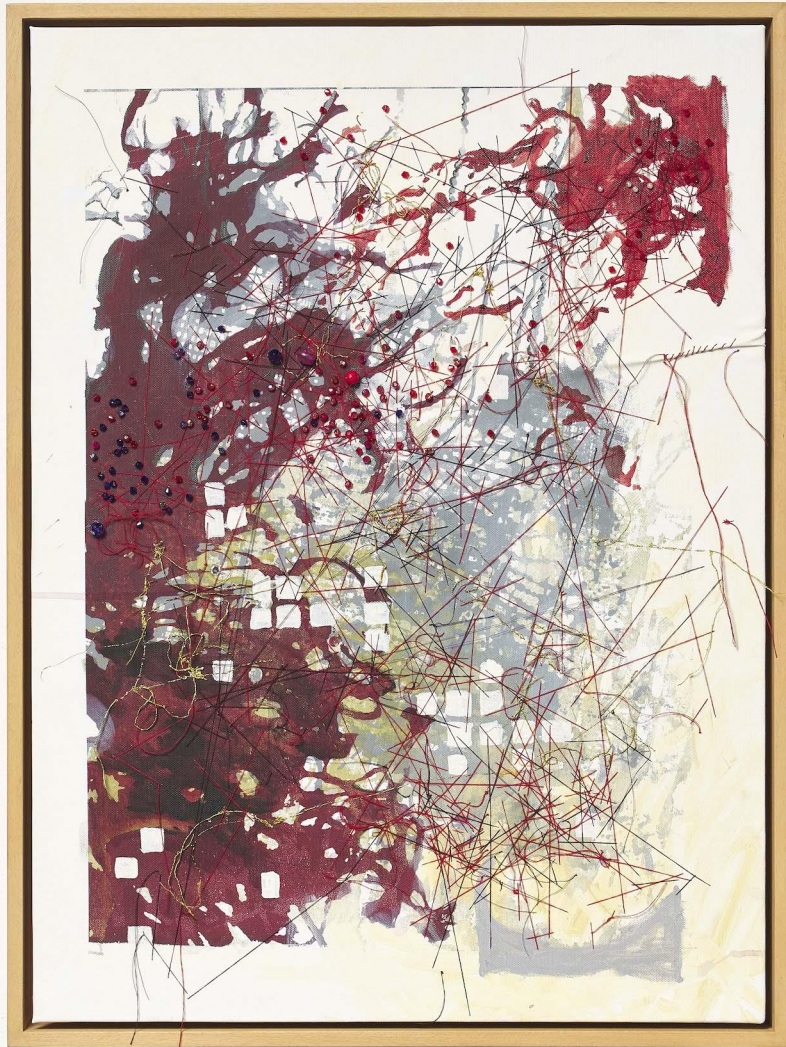
A Body Of Material Traces (2019) Thread, beads made in China, embodied traces of time/ labour/exertion/creative process, acrylic and digital print on canvas 68 x 50 cm £ 2,200