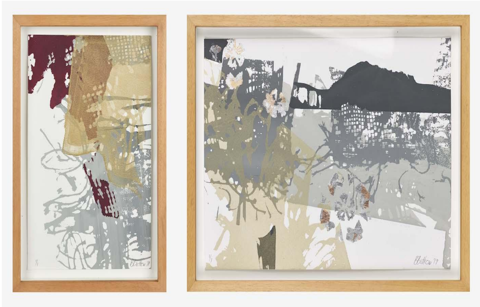
Untitled III & IV (Traces Of Labour series), 2019