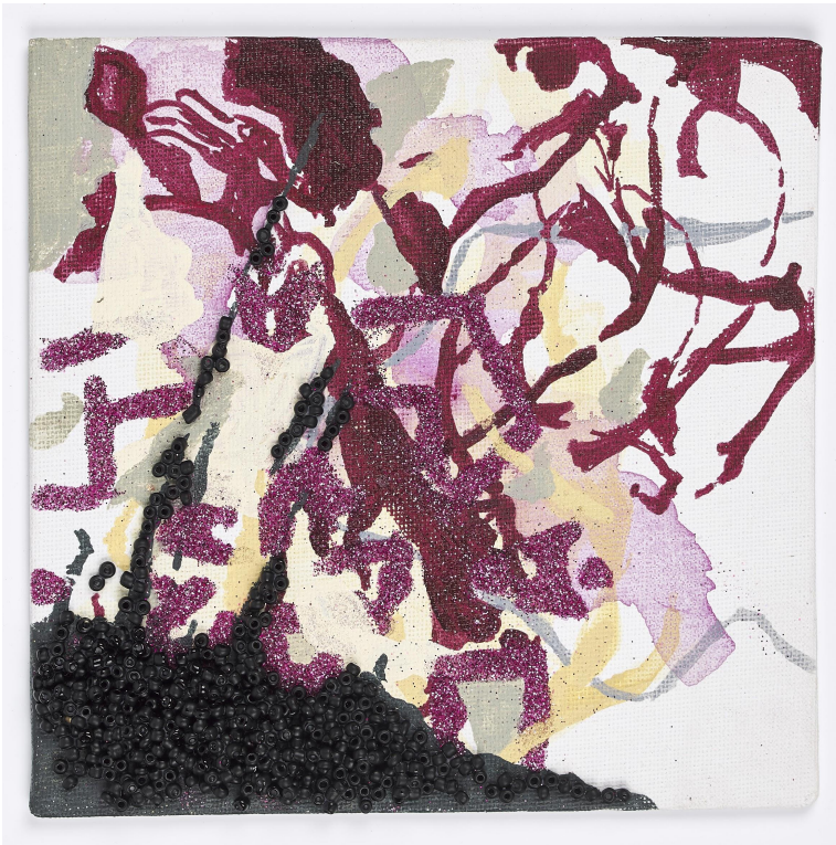
Immaterial Gestures V (2019) Glitter, beads made in China, embodied traces of time/ labour/exertion/creative process and acrylic on canvas 18 x 18 cm (7.1 x 7.1 inches) £ 250 (framed)