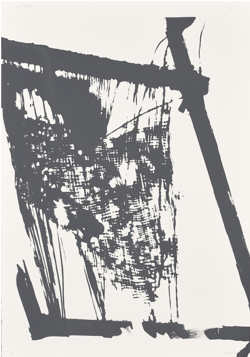
Untitled XVI (Traces Of Labour series)