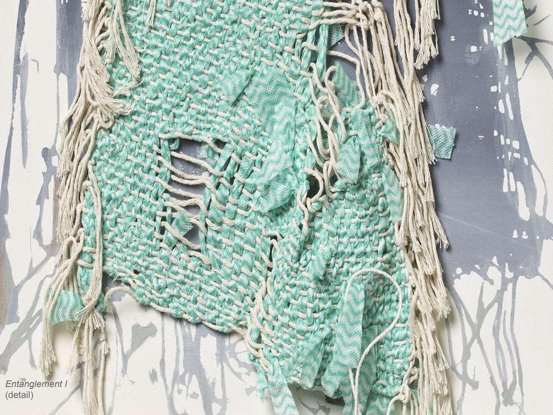
Entanglement I (detail)