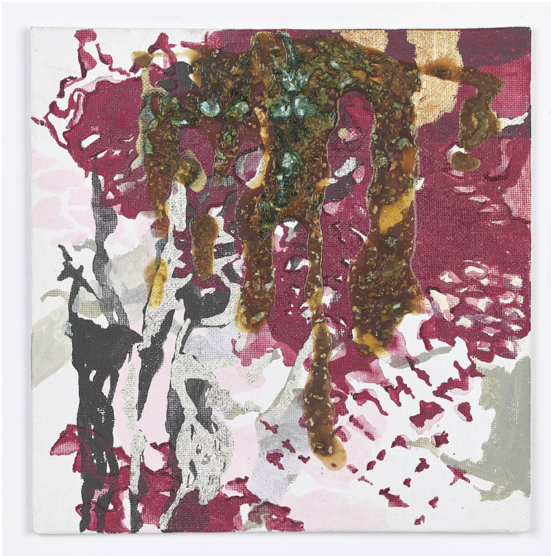
Immaterial Gesture VIII (2019) Embodied traces of time/labour/exertion/creative process, wood glue, ink and gold leaf on canvas 25 x 25 cm (7.1 x 7.1 inches) £ 350 (framed)