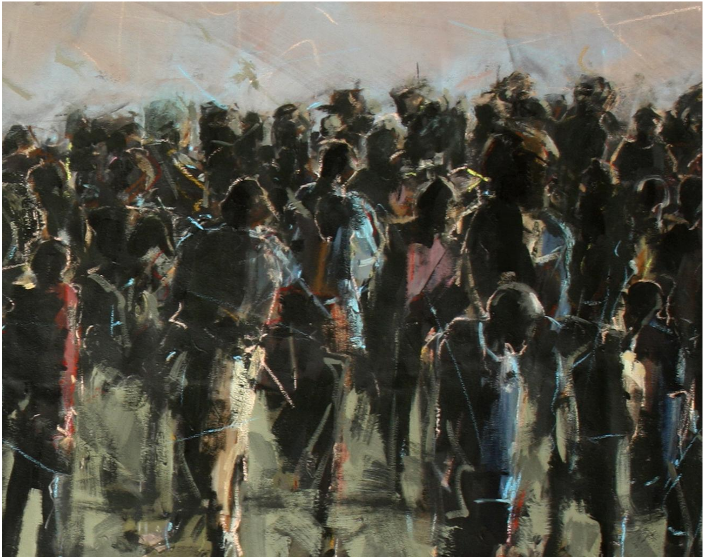
Detail from Omunye phez komunye (page 14)