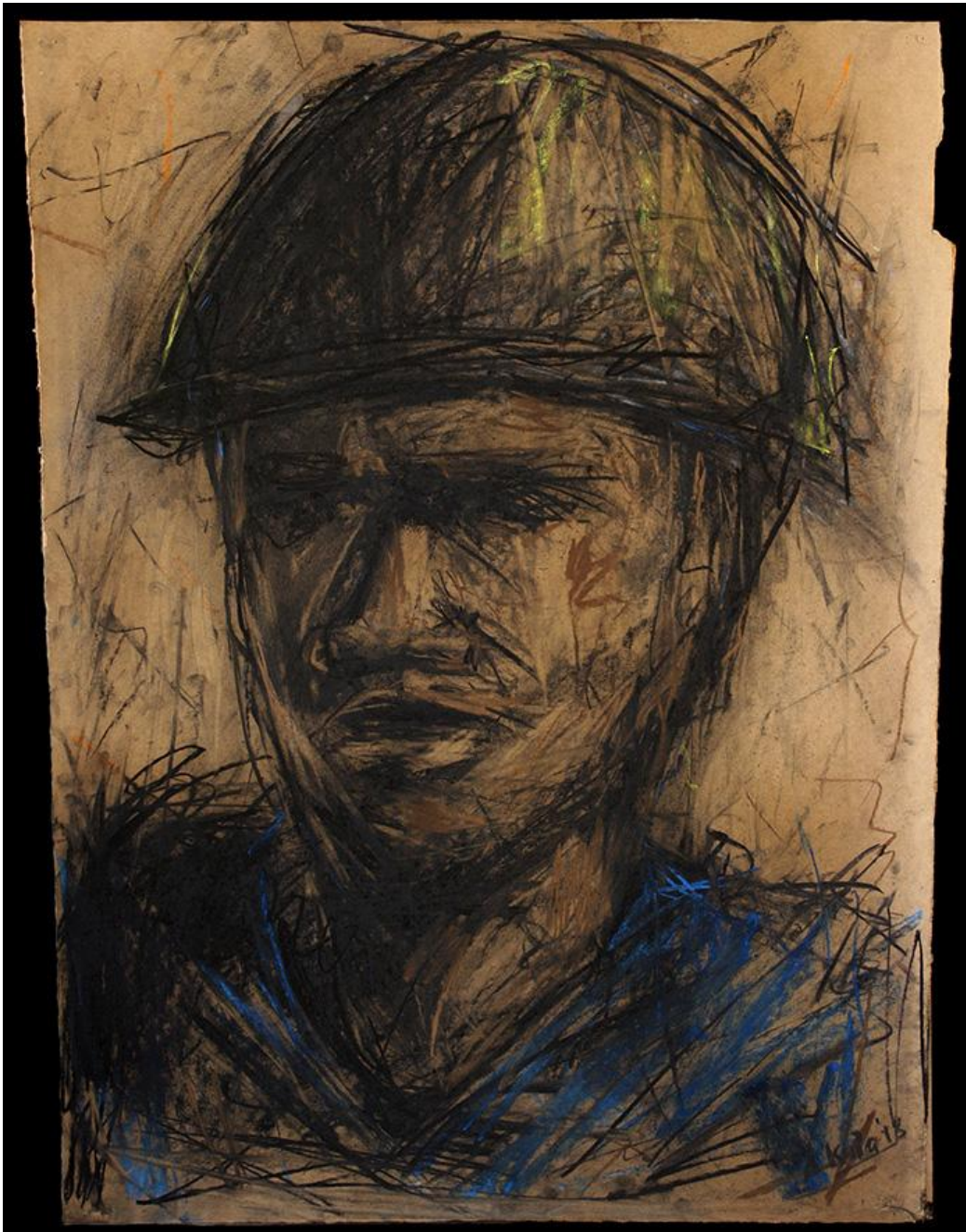
I paved the way (2018) Charcoal and pastel on paper 59.5 x 77cm (variable) R 13,500 incl VAT