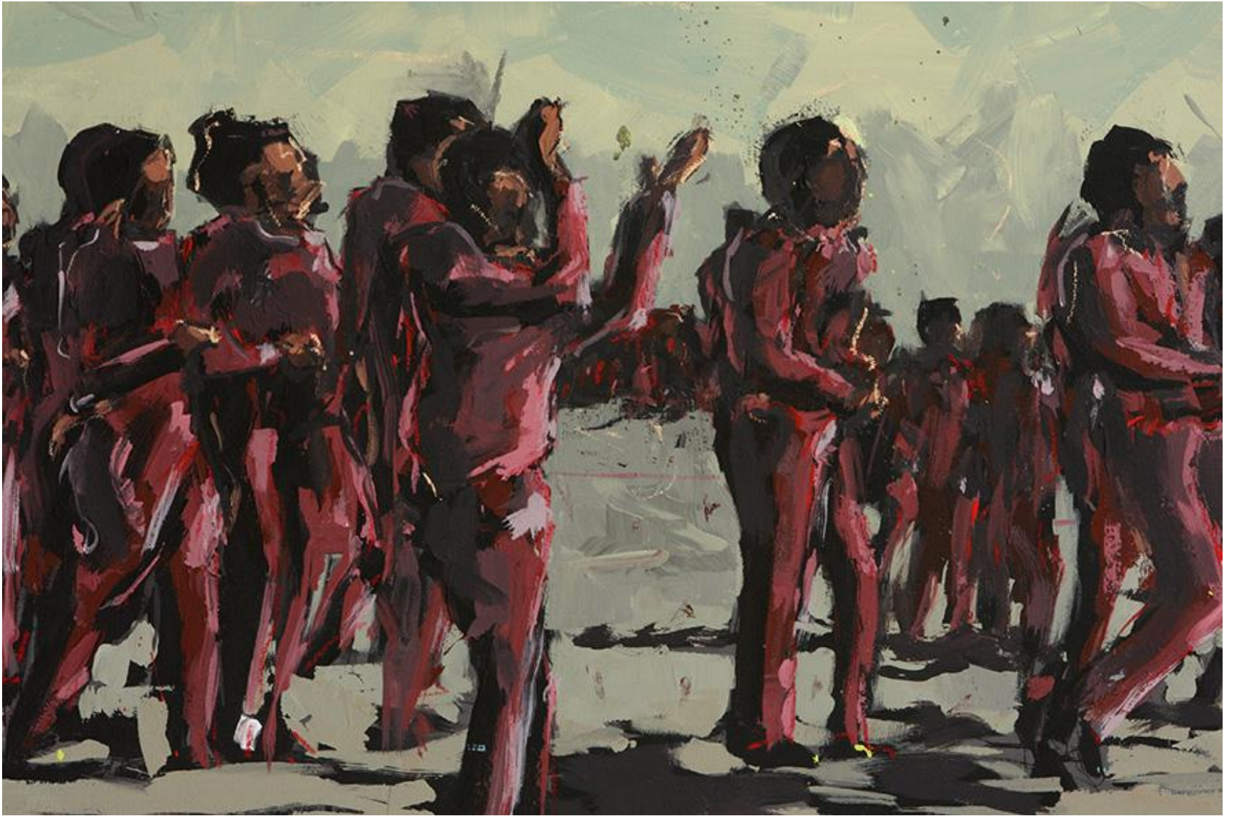
Detail from Imbovane ezibomvu (page 19)