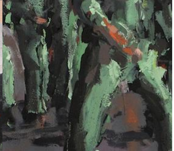
Detail from Less Green Pasture (page 11)