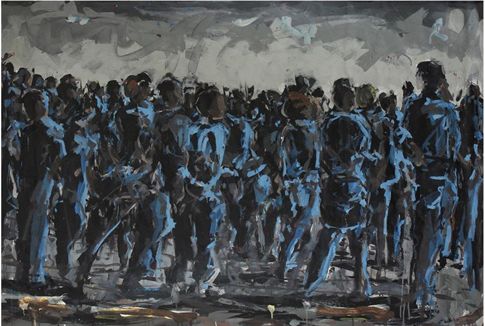
Abasebenzi (trans. 'The Workers') (2018) Acrylic on Canvas 144 x 96 cm SOLD