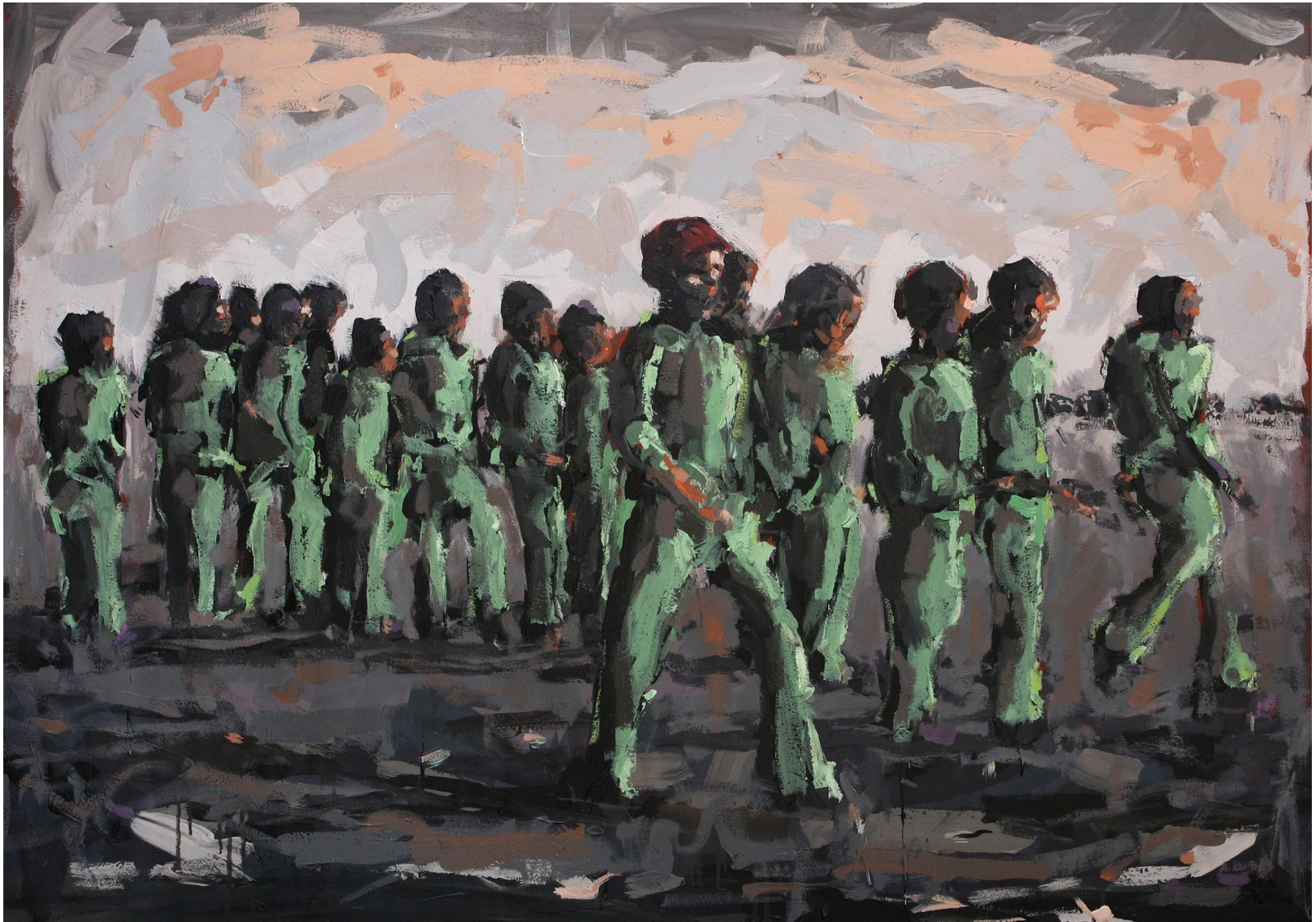
Less Green Pasture (2018) Acrylic on Canvas 128.5 x 89cm R 28,000 incl VAT