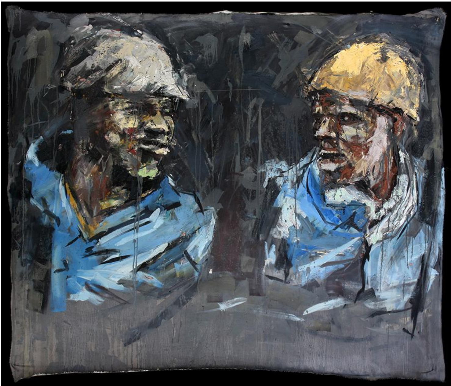
Indoda itya ukubila kwebunzi (Trans. 'A man feeds from the sweat of his forehead...') Oil on Canvas (unstretched) Approx 192 x 147cm | R 40,000 incl VAT