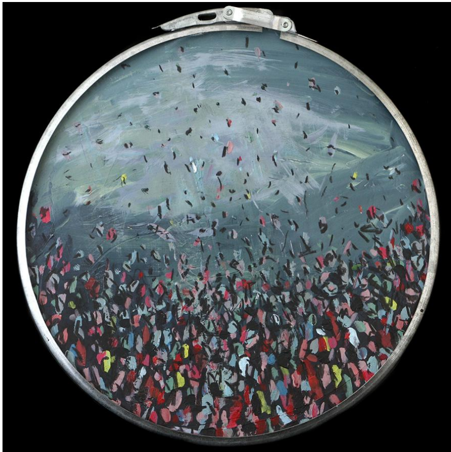
What comes around goes around I (2018) Acrylic on board 37 x 37 cm SOLD