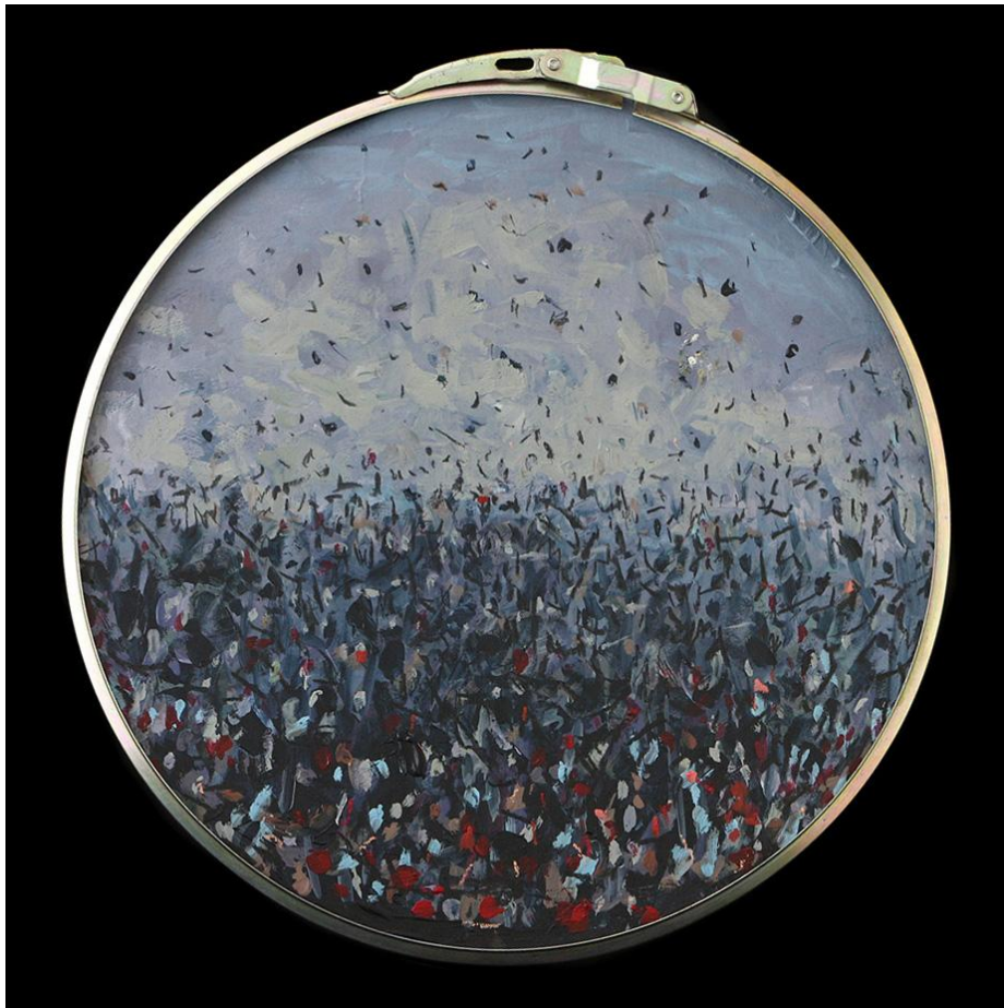
What comes around goes around III (2018) Acrylic on board 37 x 37 cm SOLD