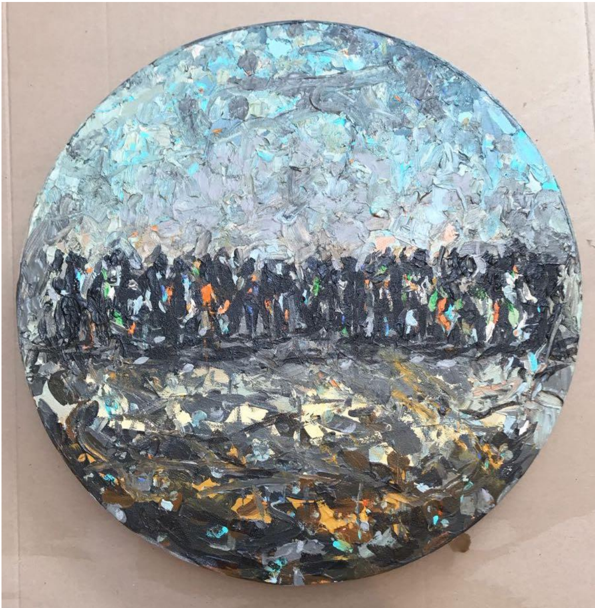
The Crowd II (2018) Acrylic on canvas 60 x 60cm R 16,000 incl VAT RESERVED - contact us for more details