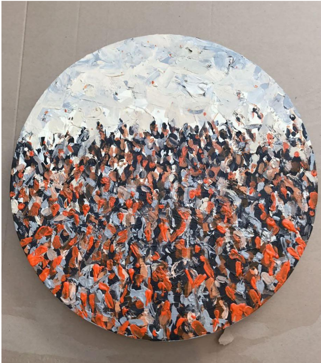
The Crowd I (2018) Acrylic on canvas 60 x 60cm R 16,000 incl VAT