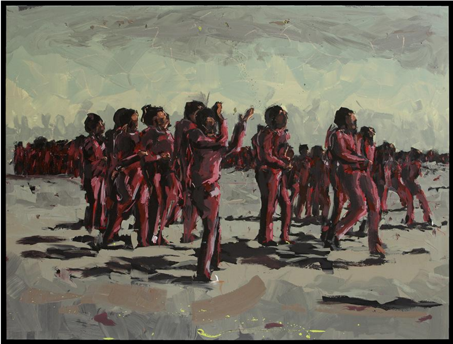
Imbovane ezibomvu (Trans. 'Red ants') (2018) Acrylic on Canvas 146 x 110 cm SOLD