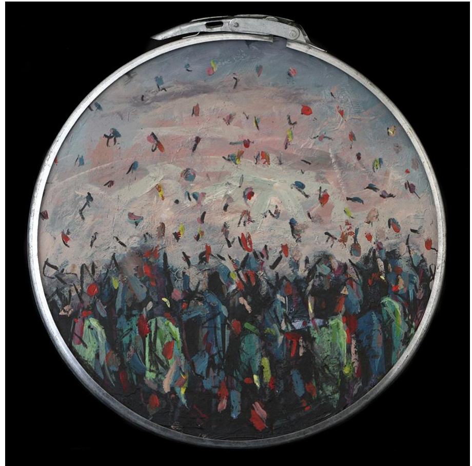
What comes around goes around IV (2018) Acrylic on board 37 x 37 cm R 8,000 incl VAT