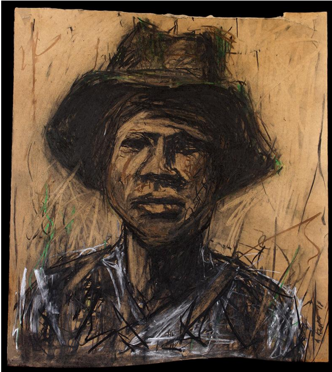
These fields are mine (2018) Charcoal and pastel on paper 62 x 74cm (variable) R 13,500 incl VAT