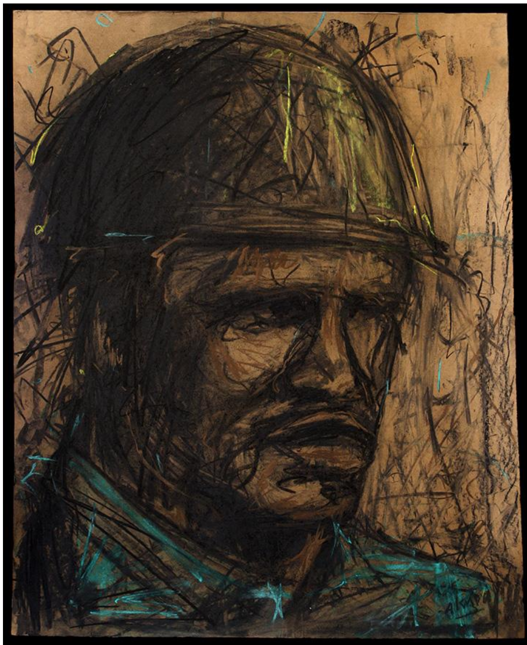
Underground Safety (2018) Charcoal and pastel on paper 62 x 77cm (variable) R 13,500 incl VAT