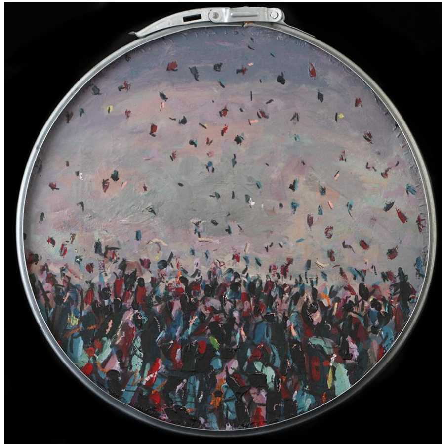
What comes around goes around II (2018) Acrylic on board 37 x 37 cm SOLD