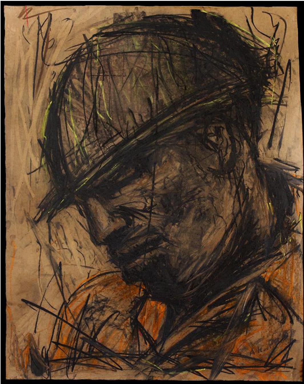
Gossip Development (2018) Charcoal and pastel on paper 60.5 x 75.5cm (variable) R 13,500 incl VAT