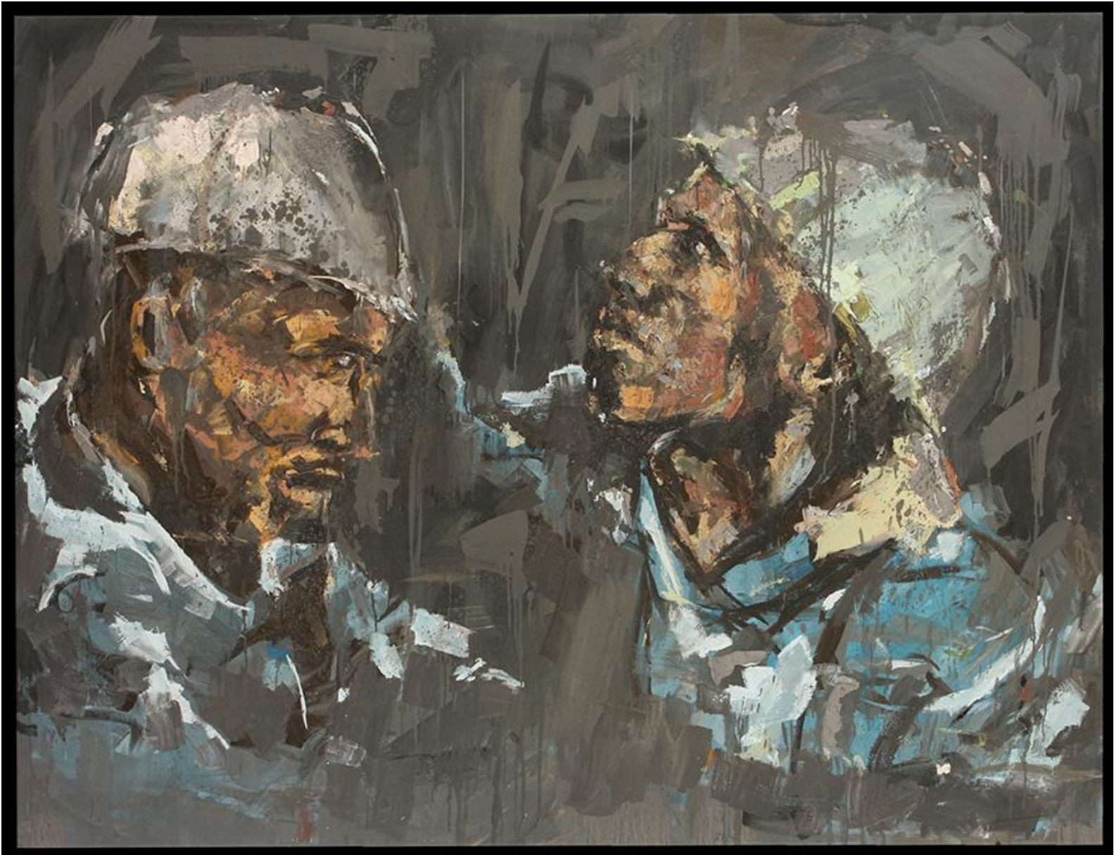
We in this together Oil on Canvas 192 x 147cm SOLD