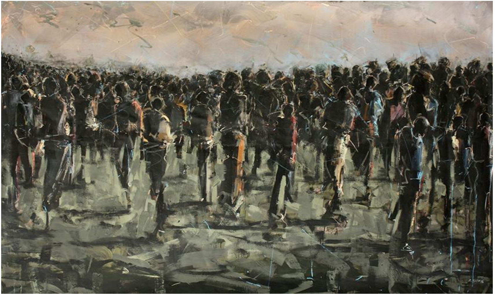
Omunye phez komunye (Trans. 'Each one to another') Acrylic and pastel on canvas 235.5 x 142cm SOLD