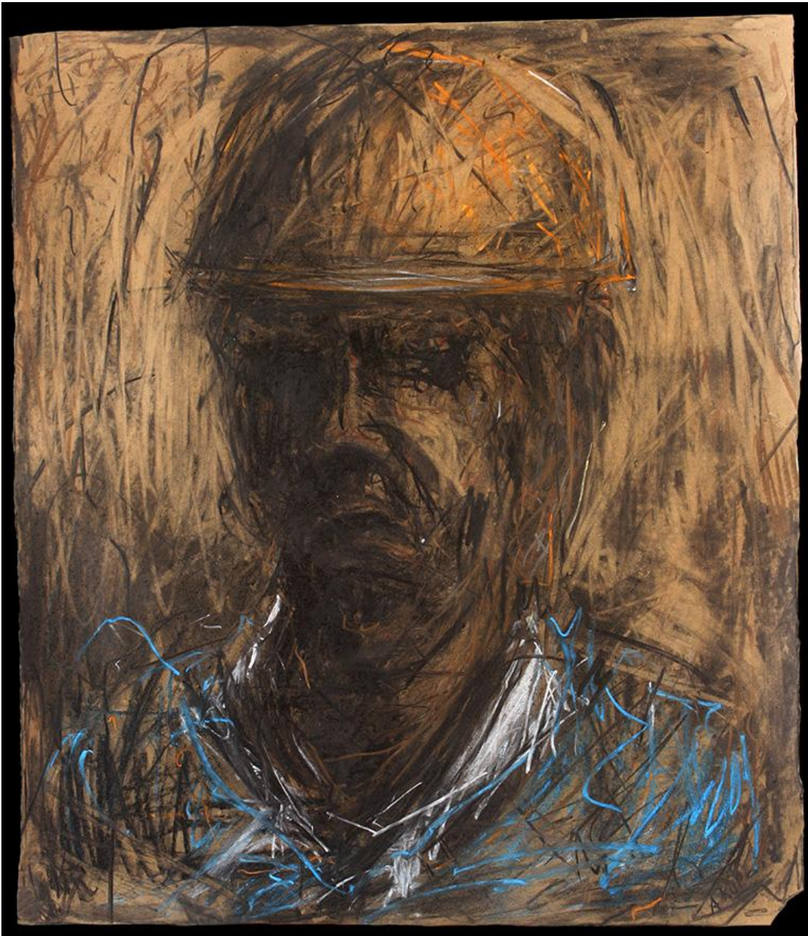
The Fixer (2018) Charcoal and pastel on paper 80 x 92 cm (variable) R 15,000 incl VAT