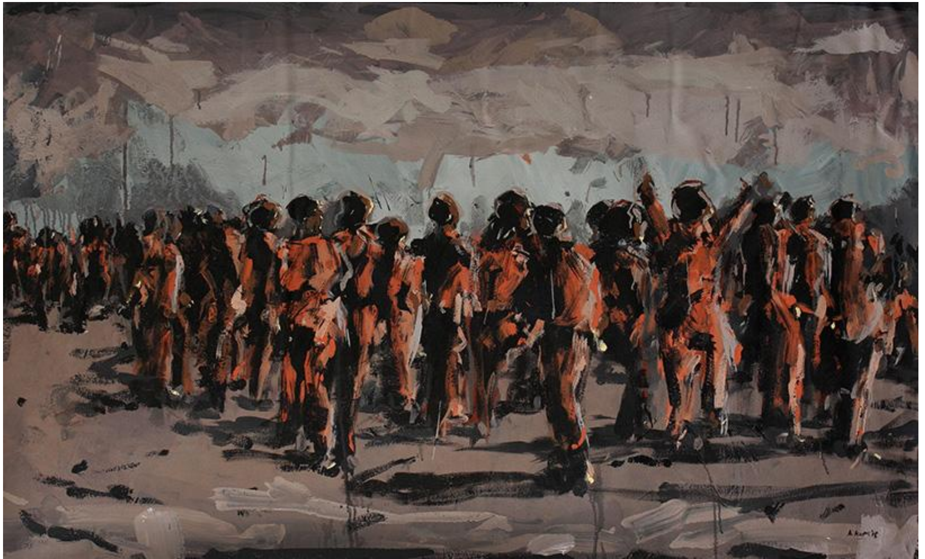
The Chosen (2018) Acrylic on Canvas 134.5 x 83.5 cm SOLD