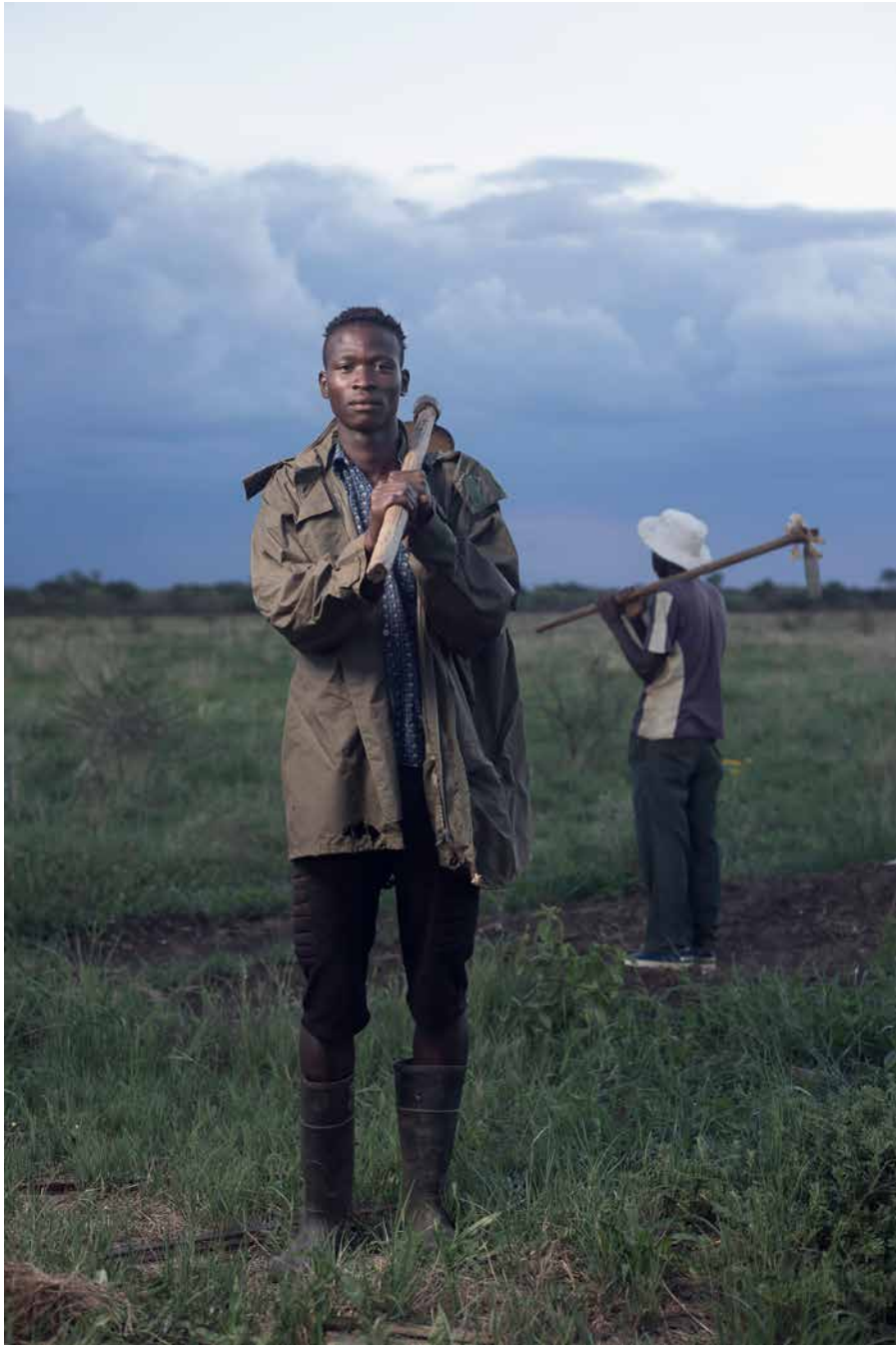
WHEN CLOUDS GATHER LENTSWELETAU, BOTSWANA 25 - 11 - 2016