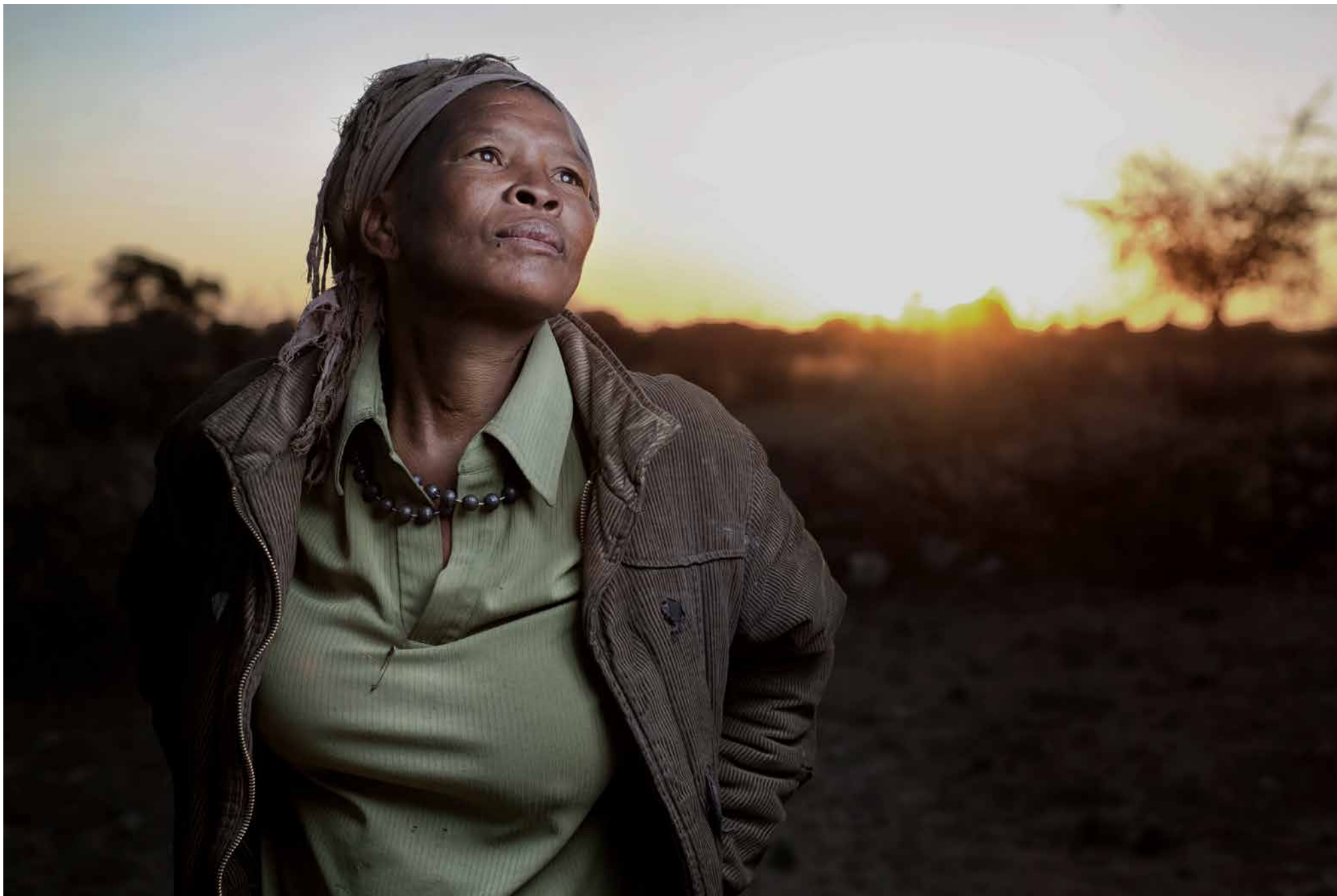
GIVING THANKS TSENSENG, BOTSWANA 19 - 07 - 2016

Signed and numbered prints on fine art paper sold with a certificate of authenticity *86cm x 61cm (paper size), 75cm x 50cm (image size) Edition of 6 plus 1AP*