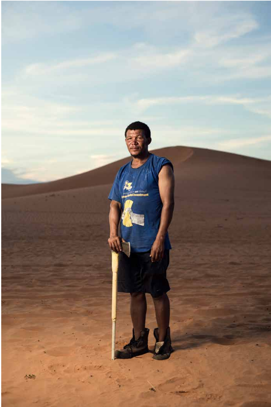
NATURE & MANKIND GAKHIBANA, BOTSWANA 17 - 02 - 2017