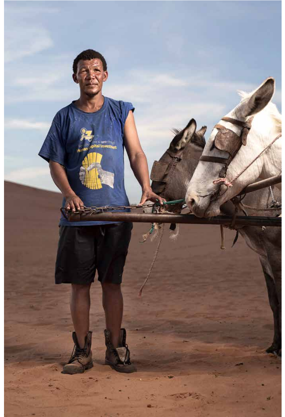
SURVIVAL GAKHIBANA, BOTSWANA 17 - 02 - 2017

Signed and numbered prints on fine art paper sold with a certificate of authenticity *86cm x 61cm (paper size), 75cm x 50cm (image size) Edition of 6 plus 1AP*