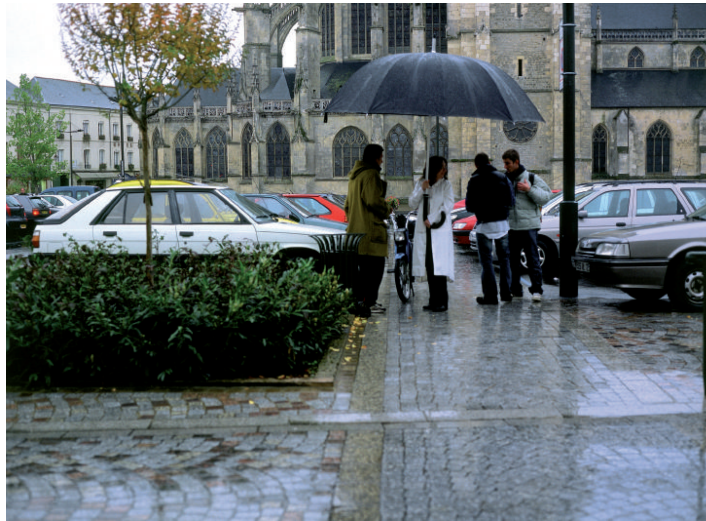
Smoking #1, #2, #3