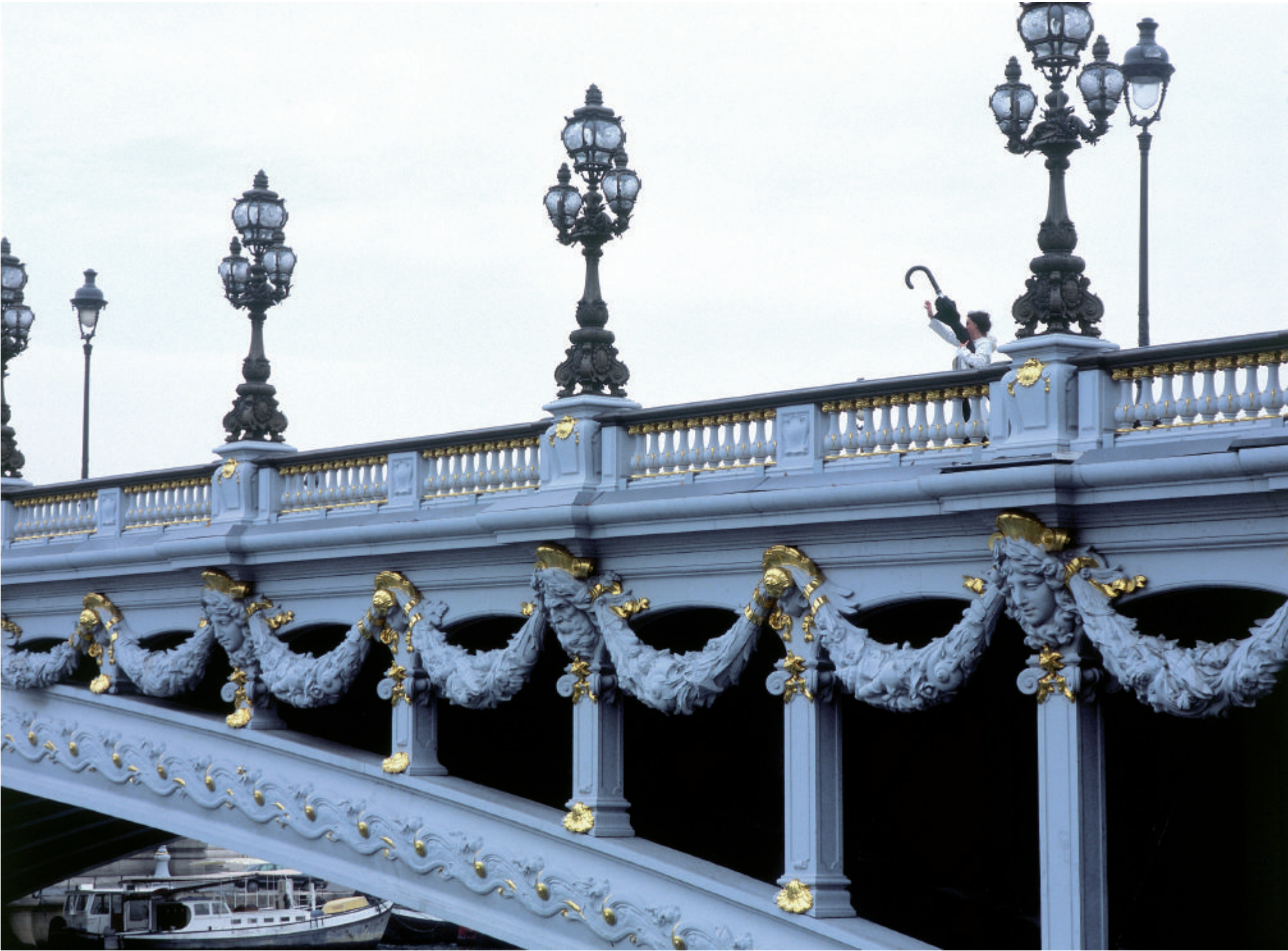
Wave at Alexander Bridge