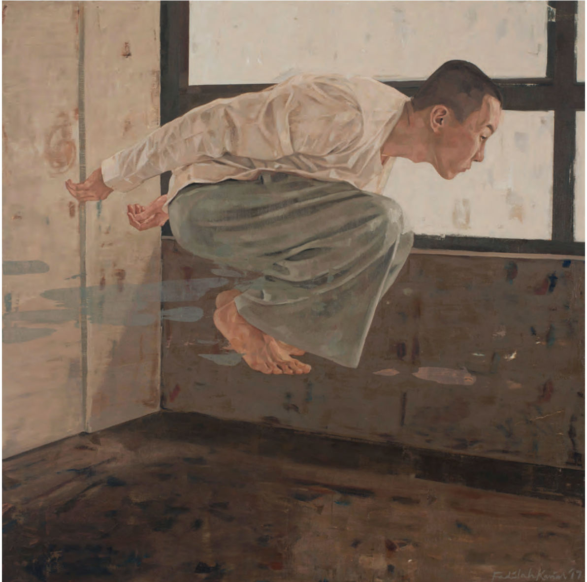
Leap of Faith