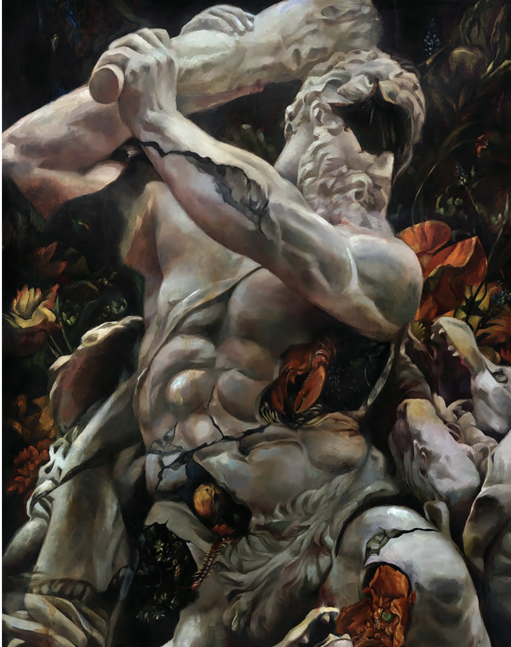
My Second Labor