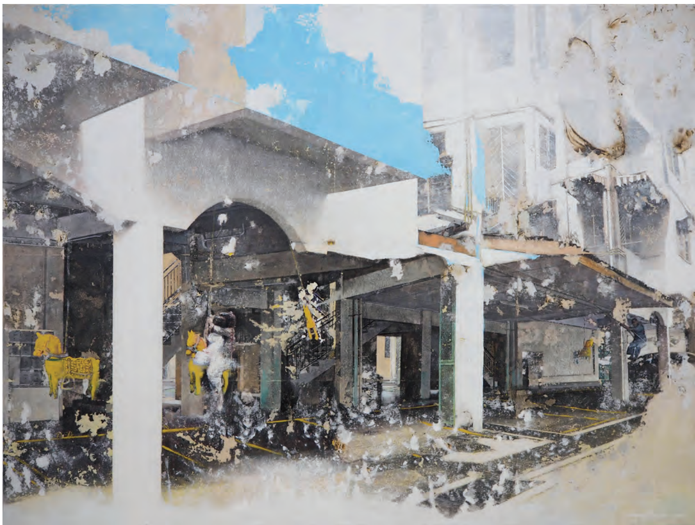
This Is Your Ride Welcome To My Playground

113 x 150 cm | Image transfer, burnt effect, acrylic on non-woven fabric and canvas, latex & rabbit glue, gloss gel finishing | 2017