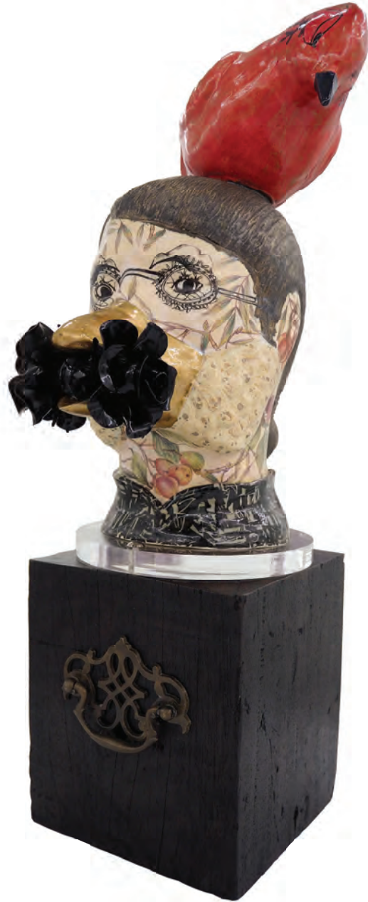
The Perch 'Love' #2 14.5 cm (W) X 26 cm (D) X 55 cm (H) | Ceramic & mixed media | 2014-17