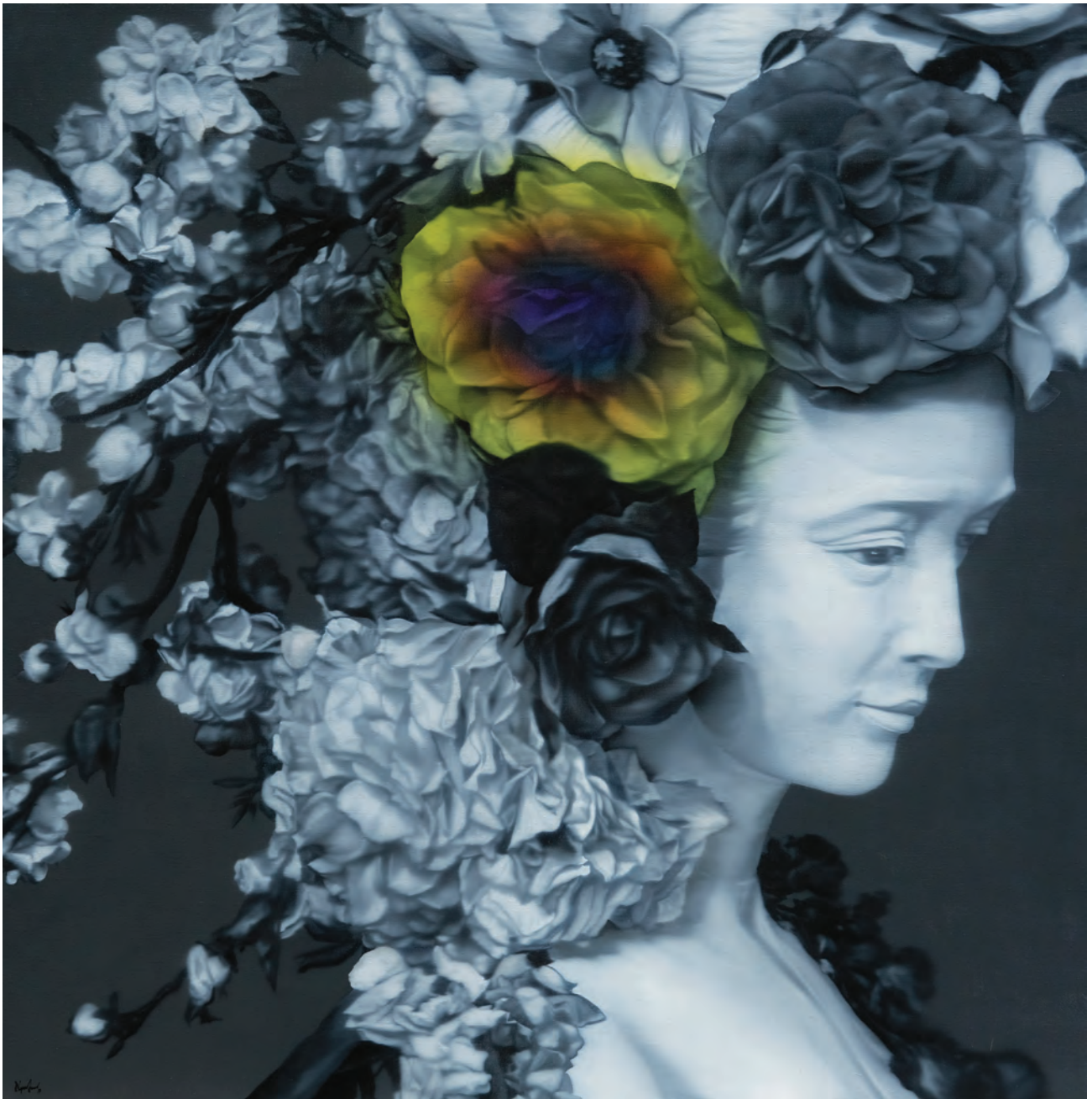
Dark Angle 2 120 x 120 cm | Oil on linen 2017