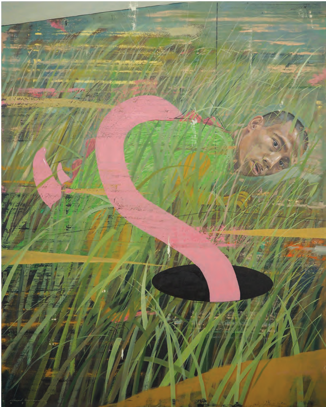
"Young Boy" turun padang II 152.5x122cm Oil on Canvas 2017