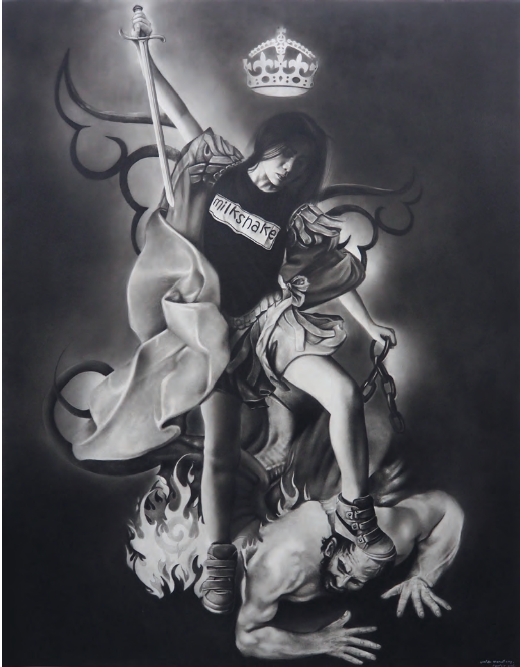
Shake U To Hell

180 x 140 cm | Charcoal on canvas | 2016