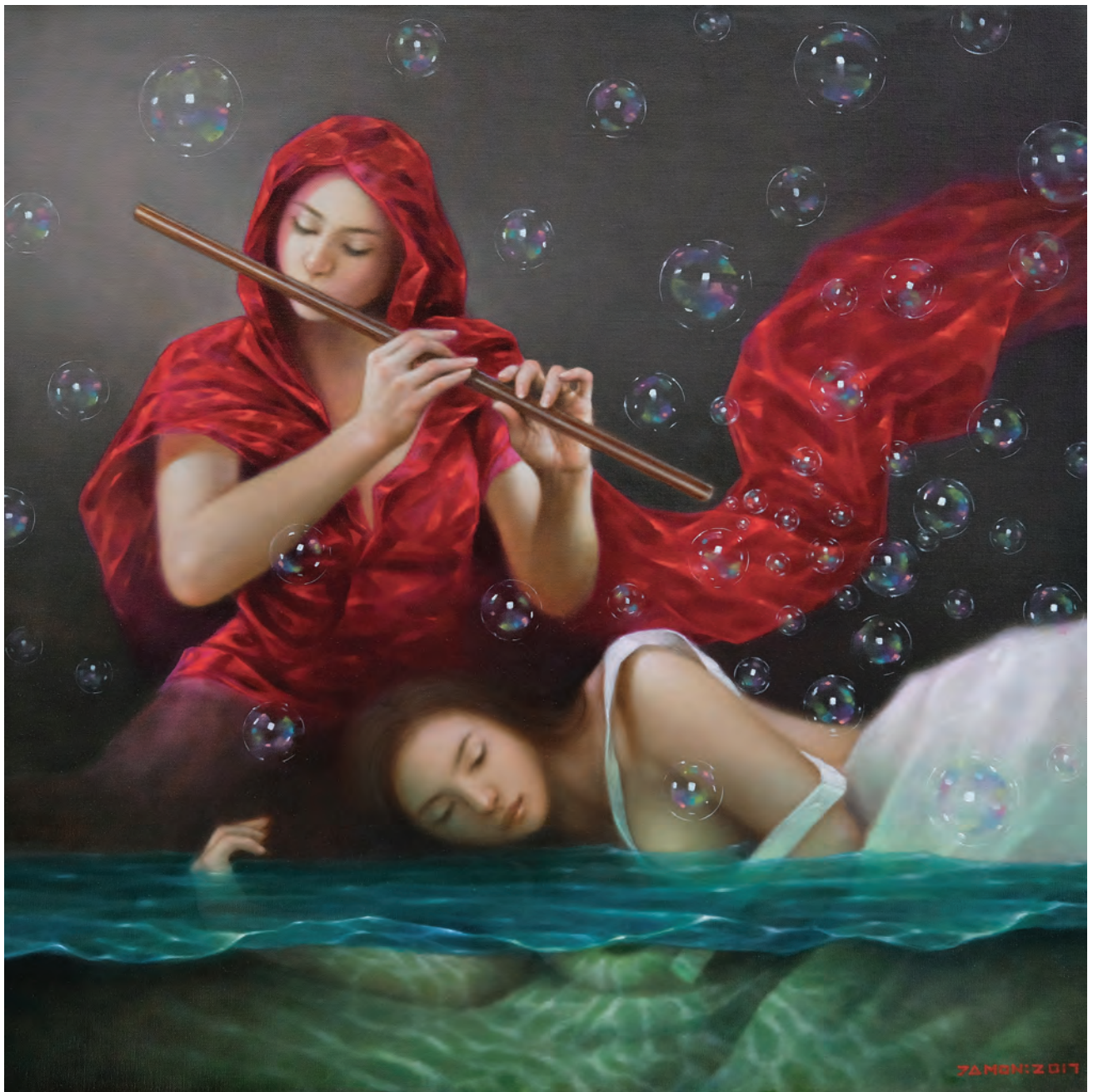
Magic 2 80 x 80 cm | Oil on linen | 2017