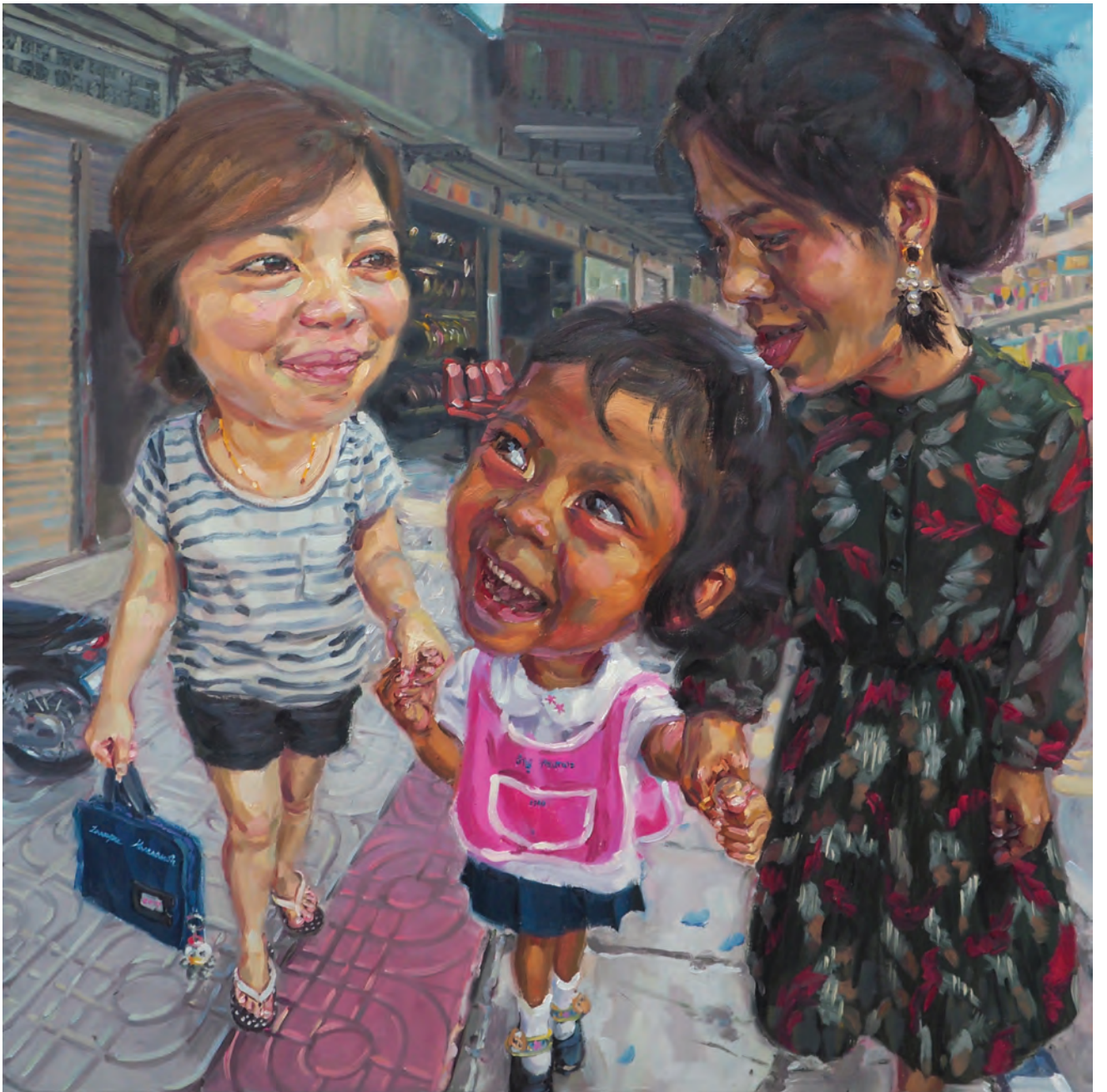
Walking Home With Mommies 120 x 120 cm | Oil on linen | 2017