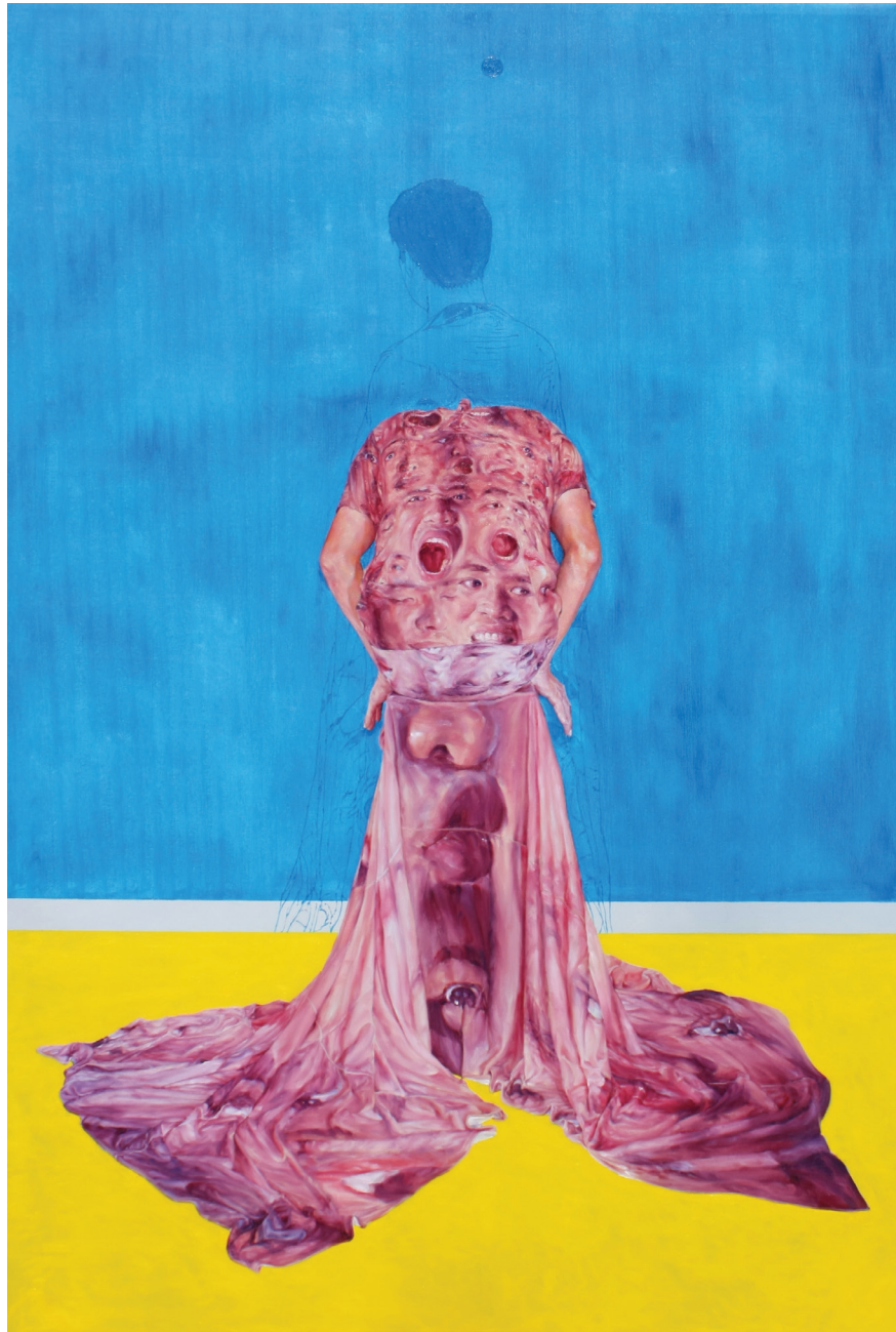
I know who I am 150 x 100 cm | Oil on canvas | 2017