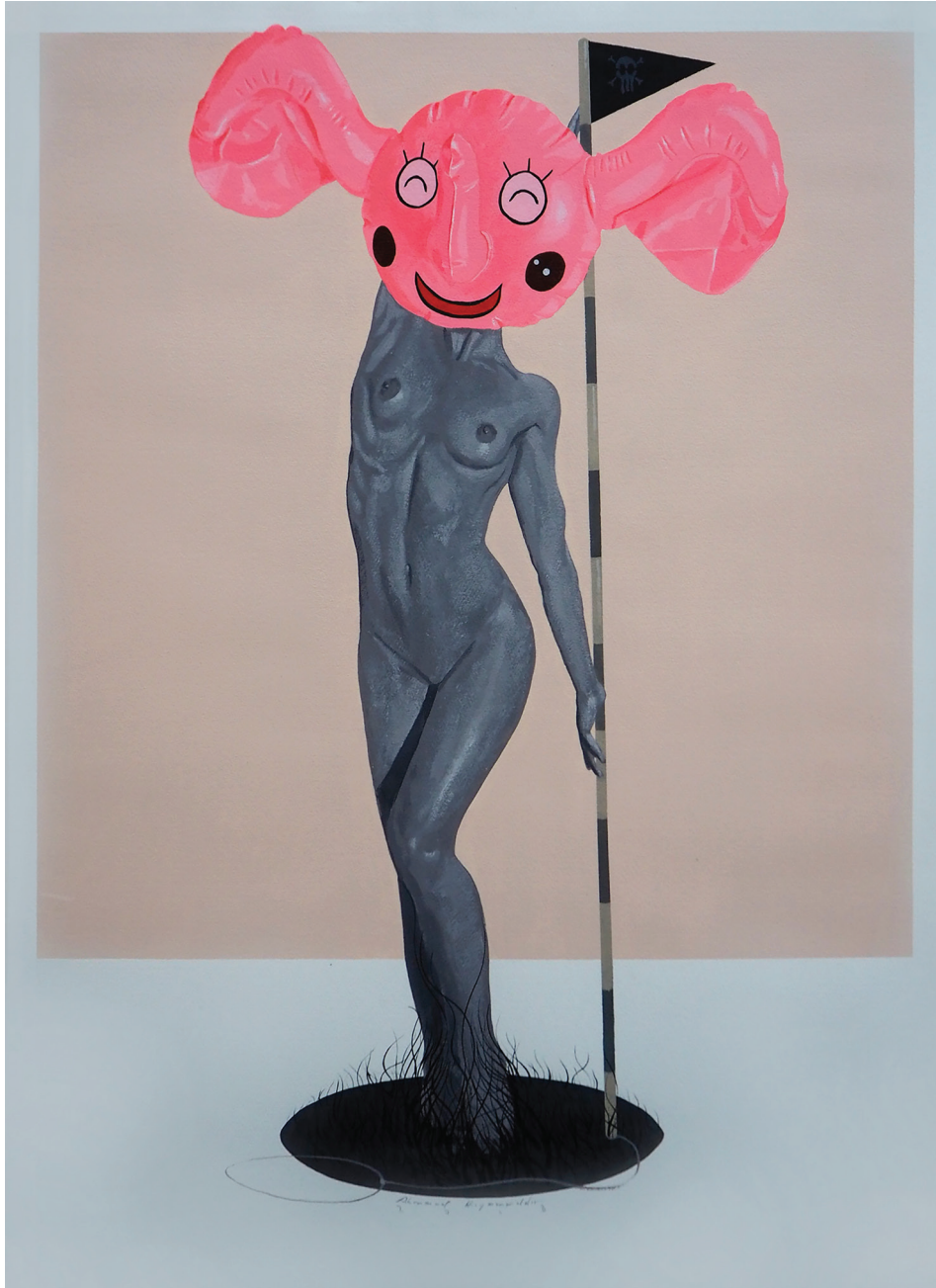
Pink Trap on Track 77 x 56 cm | Acrylic on paper | 2018