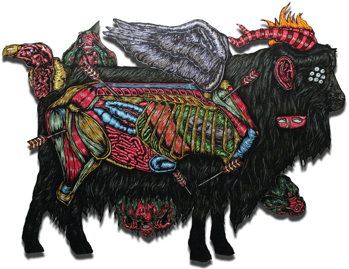
The Black Goat Who Defended His Master

159 x 202 cm | Oil & acrylic on jute stick on mdf board | 2018