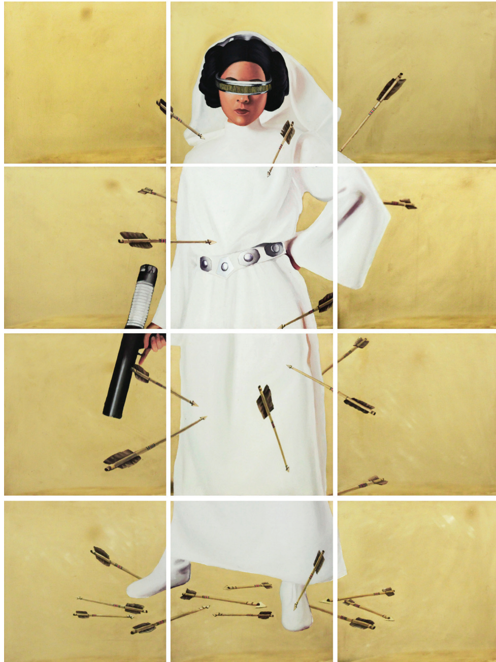
Fighter 3 200 x 150 cm ( 12 Panel ) | Oil on brass | 2018