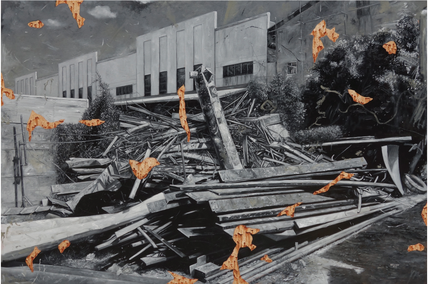
Totem 121.5 x 182.5 cm | Oil on canvas | 2017