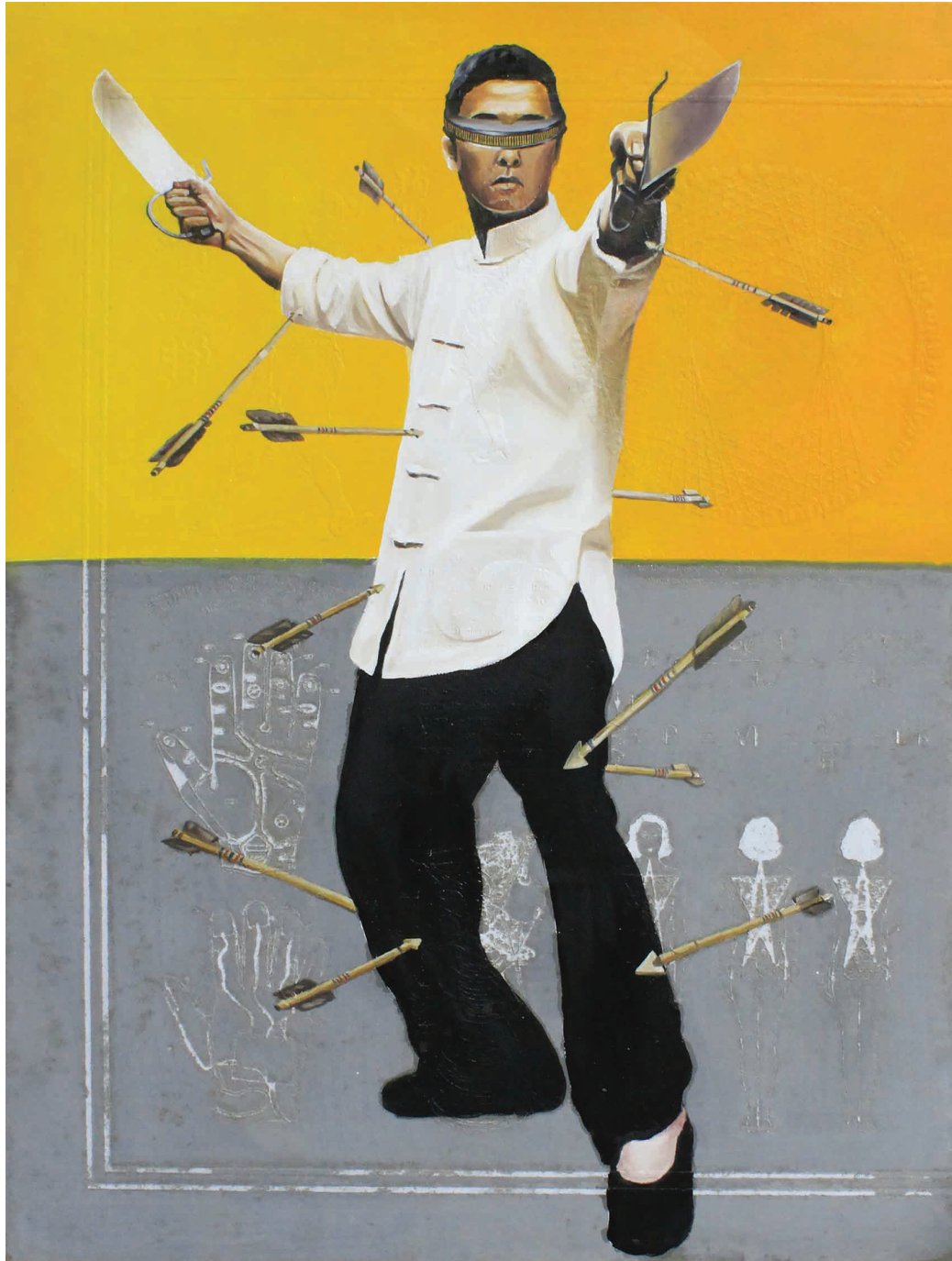
Fighter 1 80 x 60 cm | Oil on etched aluminium | 2018