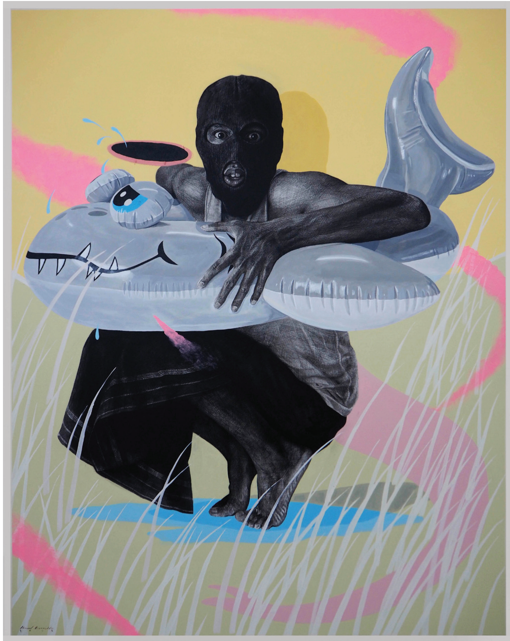
SORRY !! 1 This is Not What You Imagine 170 x 135 cm | Charcoal, acrylic & oil on canvas | 2017