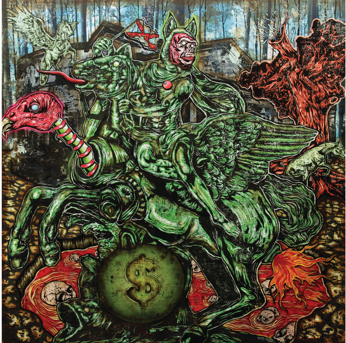
The Warrior of The Broken Empire 153 x 153 cm | Oil & acrylic on jute | 2018