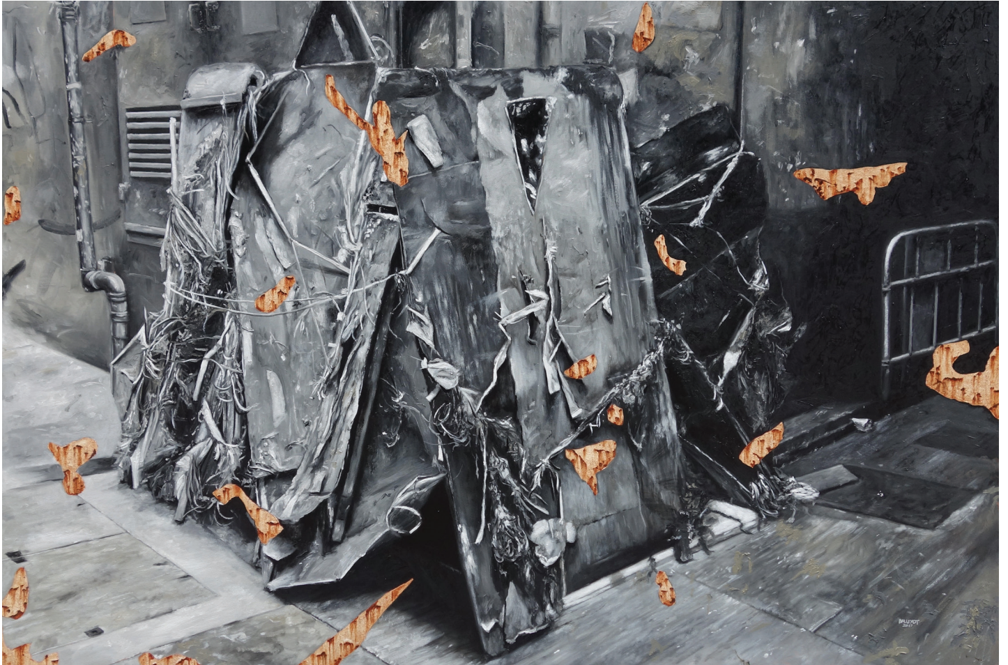
The Altar 121.5 x 182.5 cm | Oil on canvas | 2017