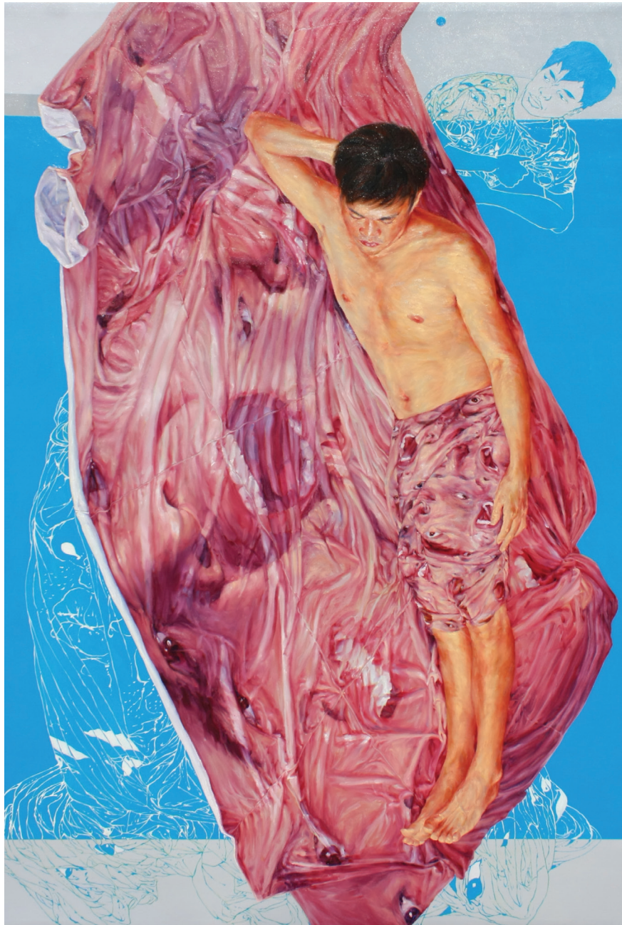
I belong to me