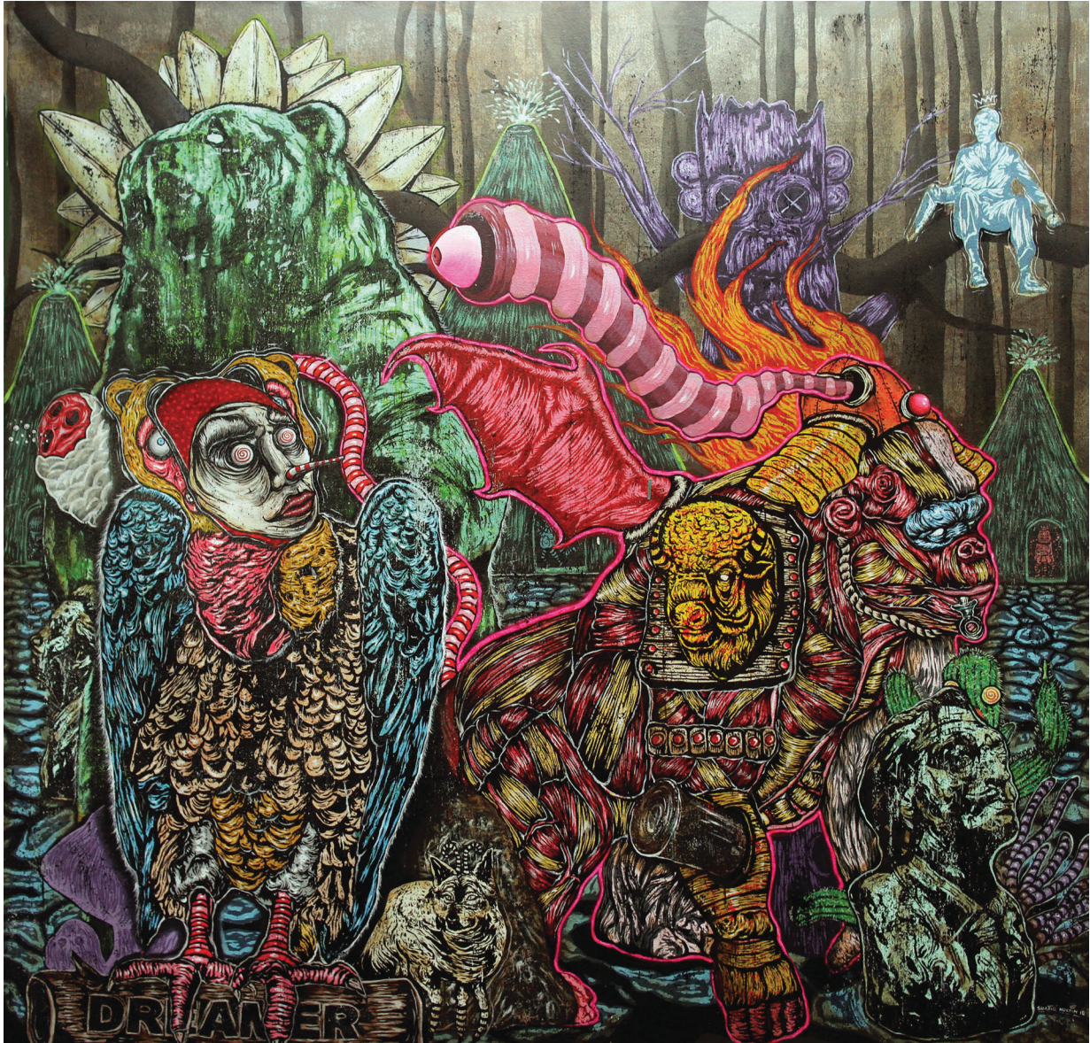
The Tale of the Dreamer & The Injured Fighter 198 x 206 cm | Oil & acrylic on jute | 2018