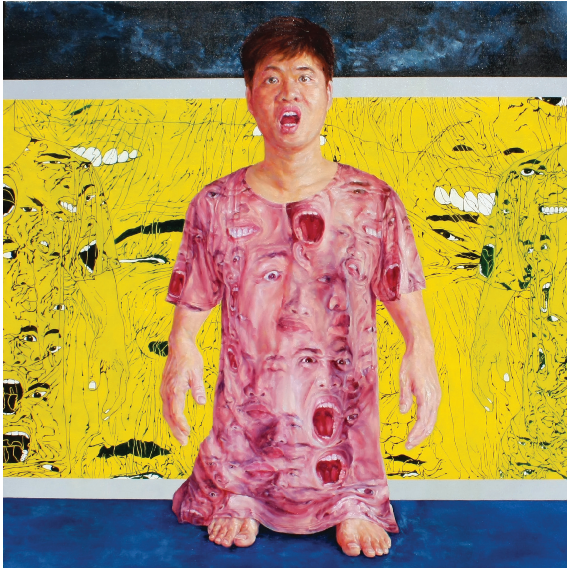
My fake pathetic self 100 x 100 cm | Oil on canvas | 2017