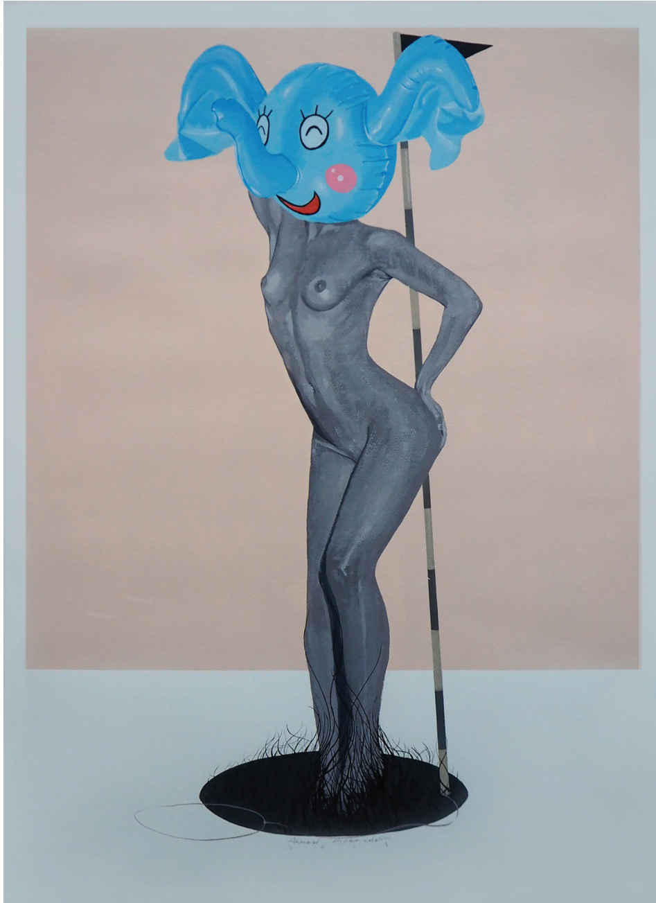
Blue Trap on Track 77 x 56 cm | Acrylic on paper | 2018