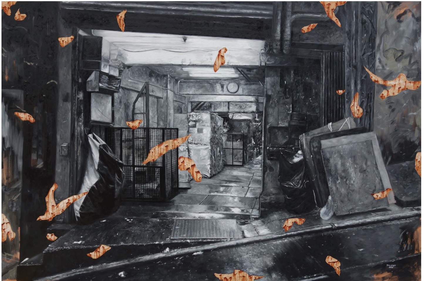
Portal 121.5 x 182.5 cm | Oil on canvas | 2017