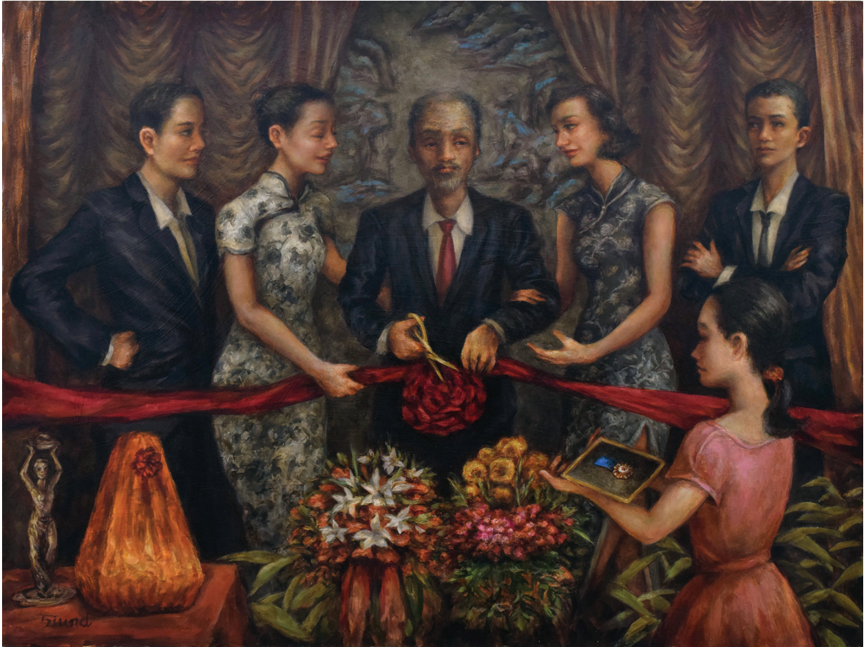
Very Important Person