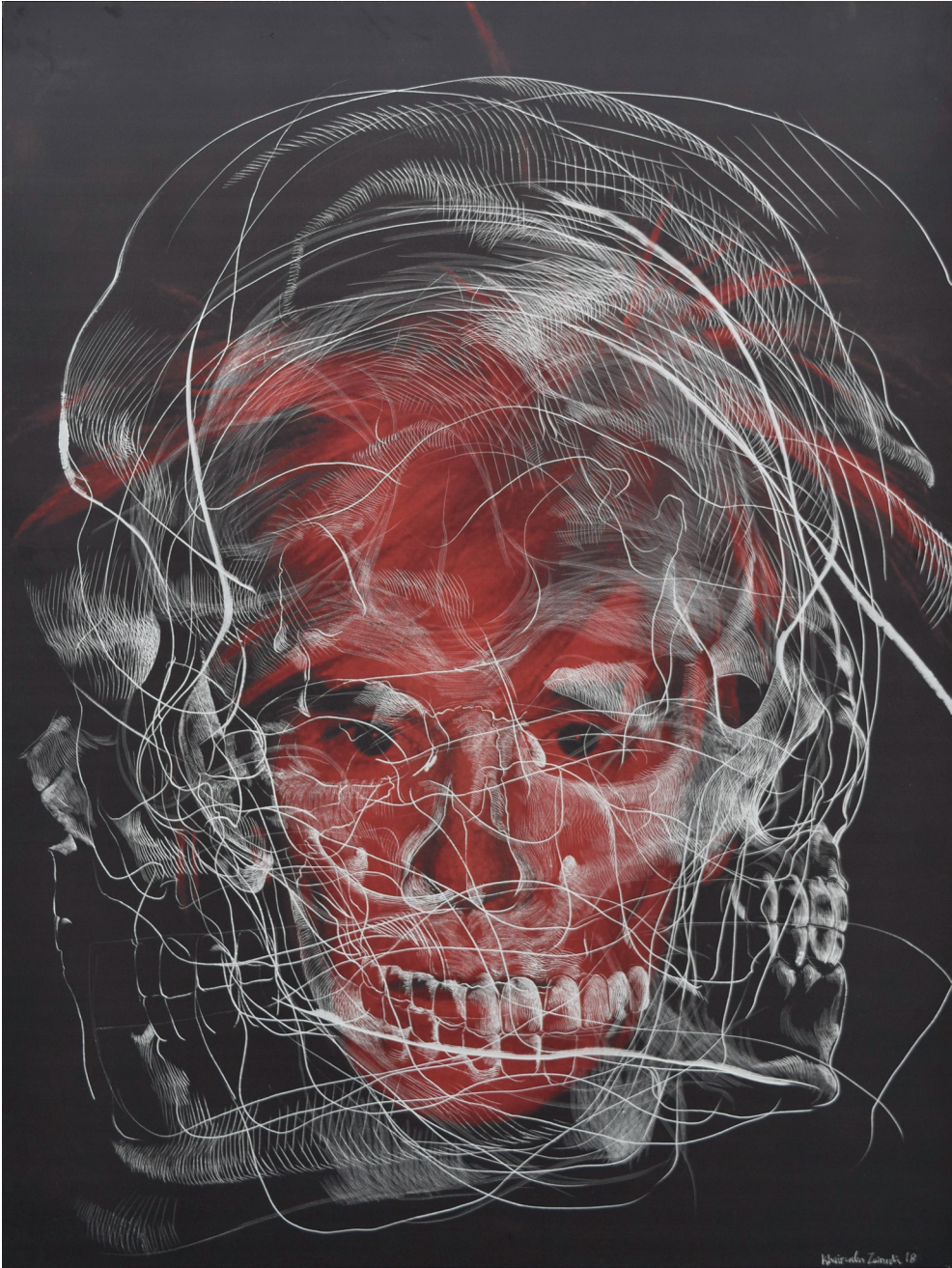
Thanks to Skeletal that Support The Greatest Mind - Red 122 x 91.5 cm | Scratched on Photo Printed Aluminium | 2018