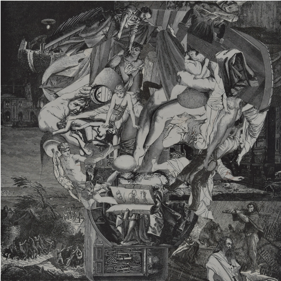
After Max Ernst No. 14- His Smile Will Be Of A Sober Elegance 29 x 29 cm | Paper Collage on Paper | 2018