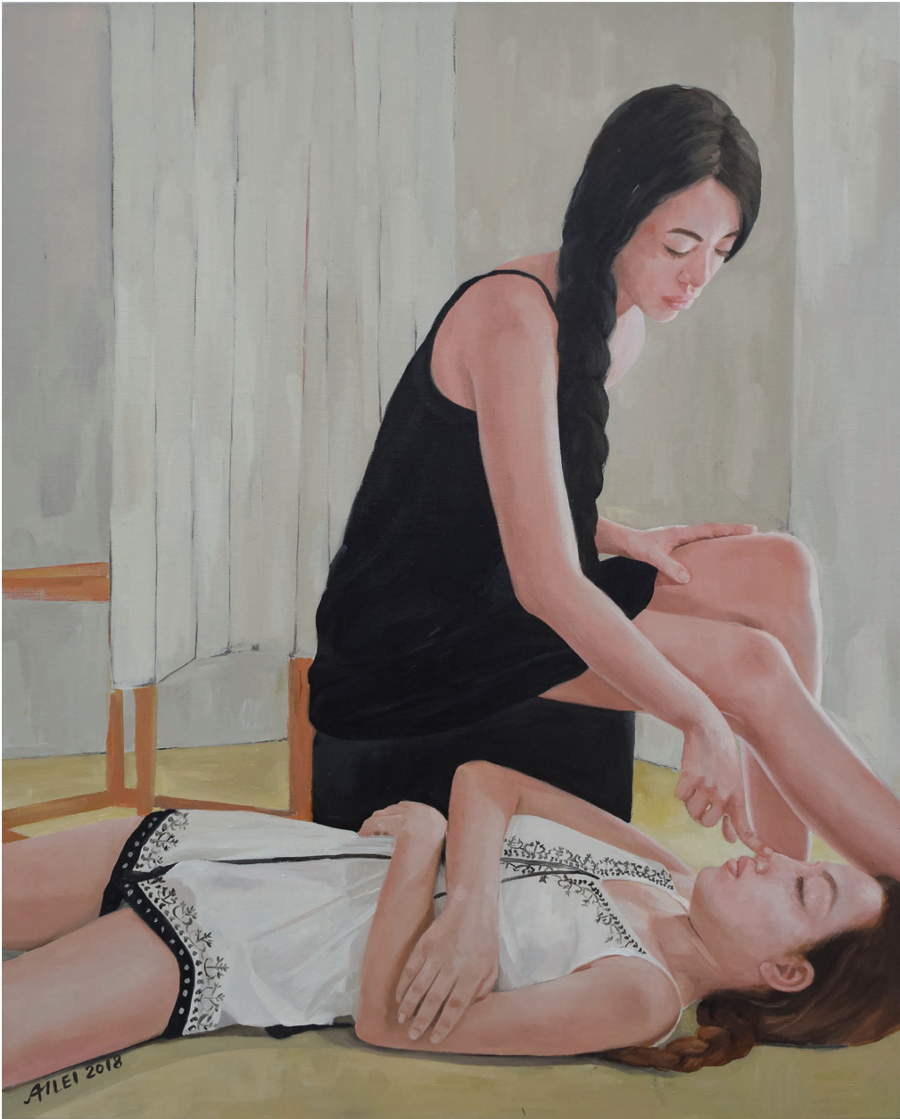
Black & White #2 76 x 61 cm | Oil on Canvas | 2018