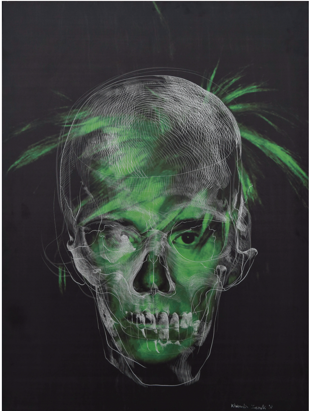
Thanks to Skeletal that Support The Greatest Mind - Green 122 x 91.5 cm | Scratched on Photo Printed Aluminium | 2018