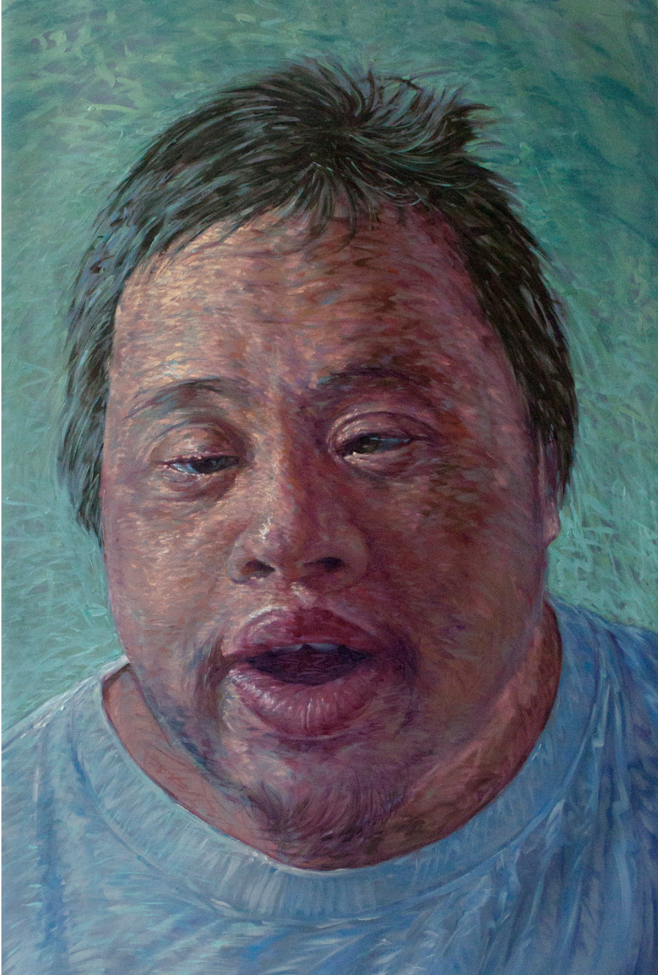
Face Value 1 (Moment to Moment) 150 x 100 cm | Oil on Canvas | 2018