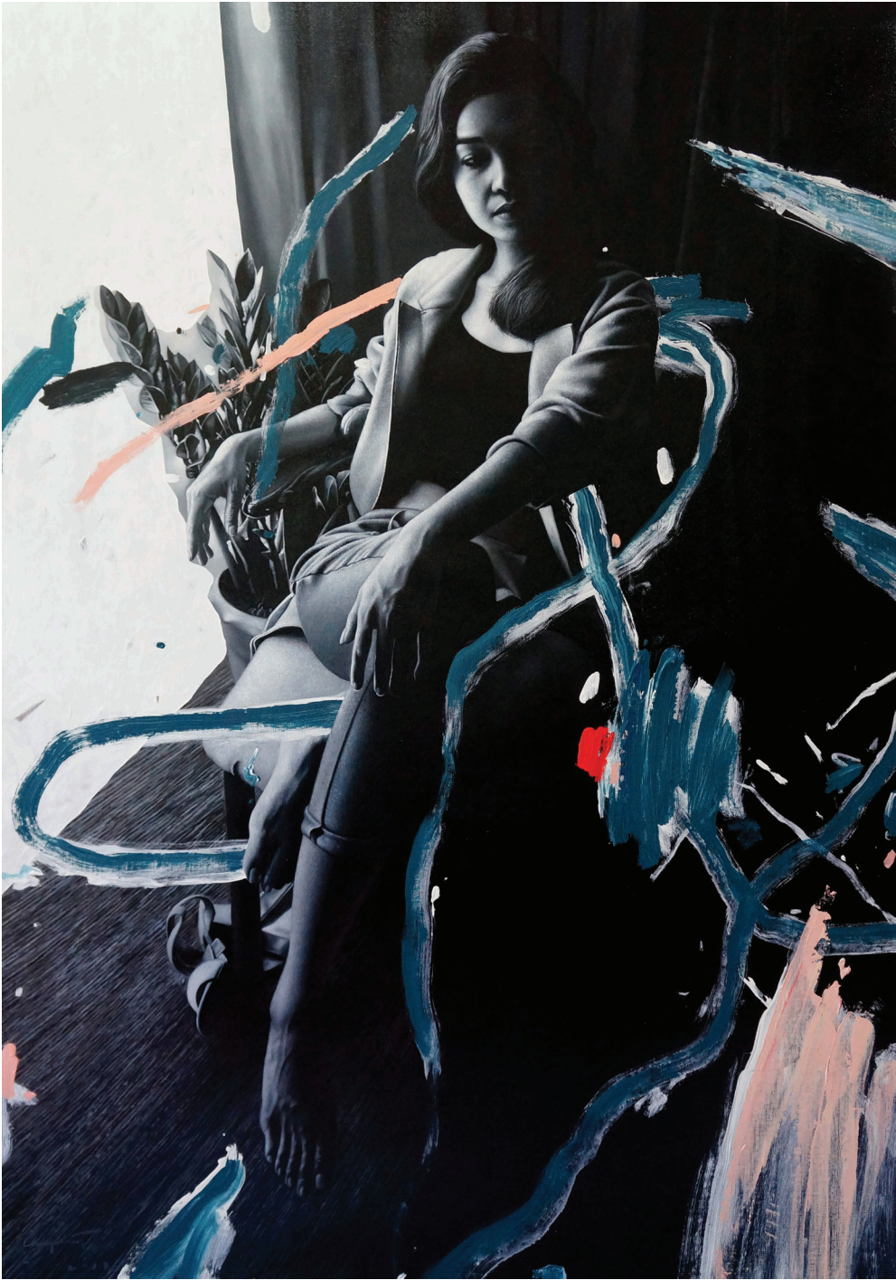
Sit No. 1 150 x 106.5 cm | Oil on Linen | 2018