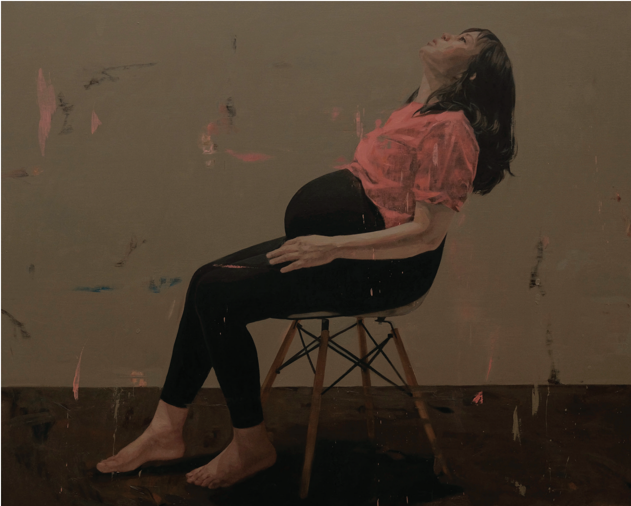
Bubblegum 122 x 152 cm | Oil on Linen | 2018