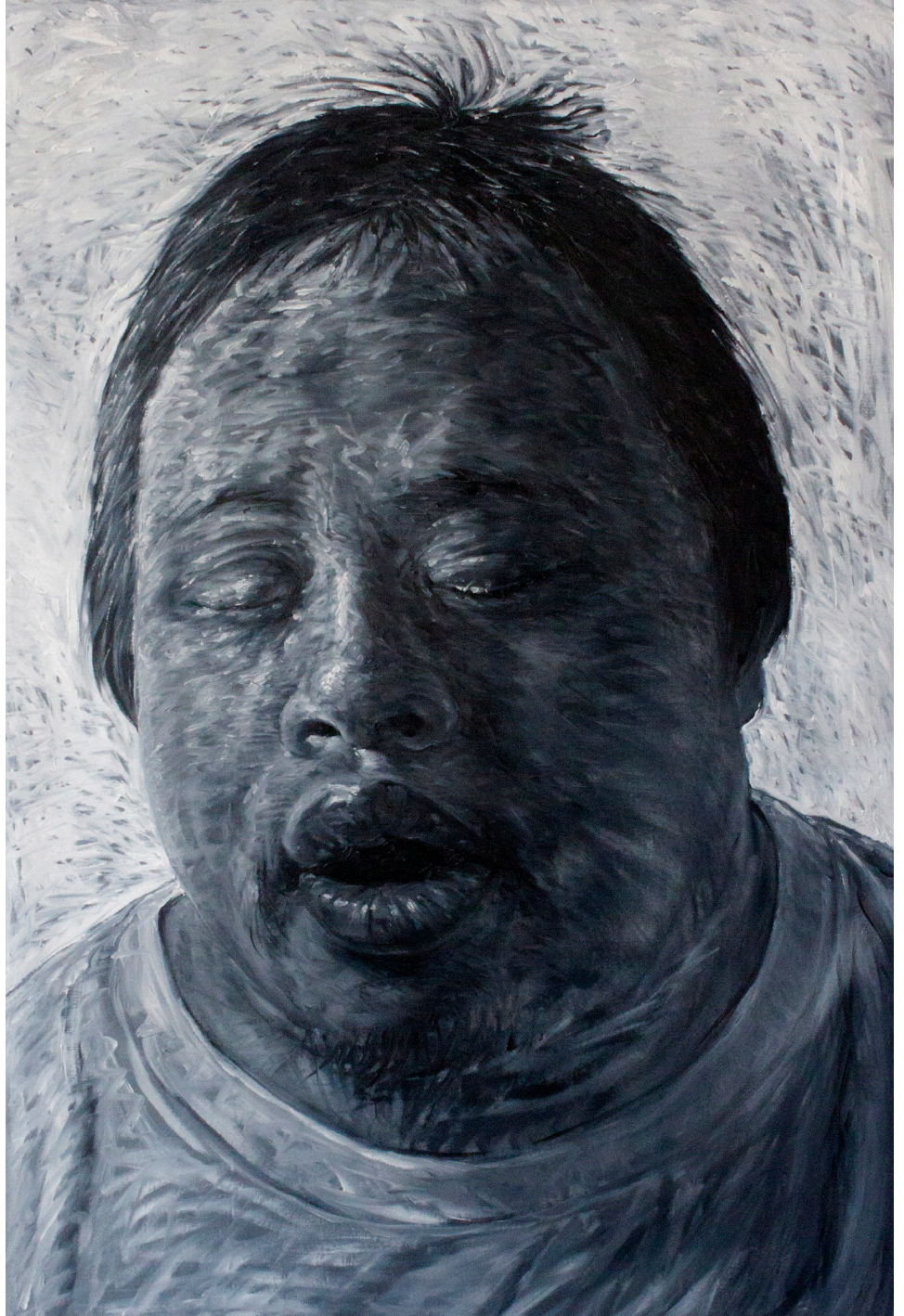
Face Value 2 (Moment to Moment) 150 x 100 cm | Oil on Canvas | 2018