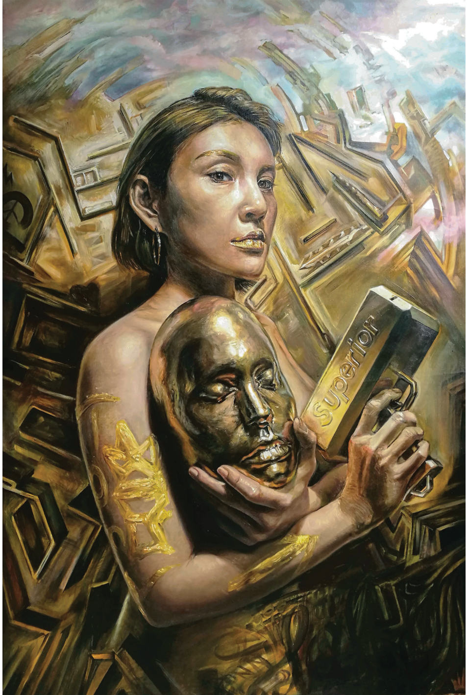
Stand A Chance