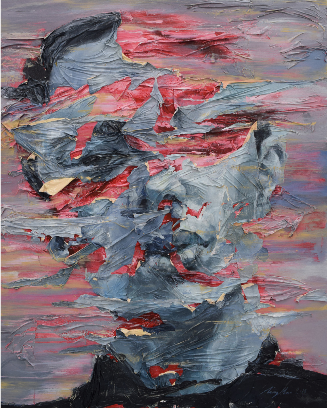
This Is Me, I Guess 2

150 x 120 cm | Acrylic and Gloss Gel on Canvas | 2018