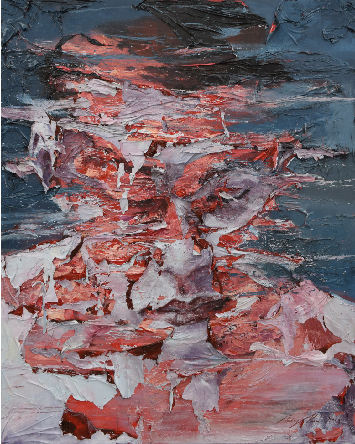
This Is Me, I Guess

150 x 120 cm | Acrylic and Gloss Gel on Canvas | 2018