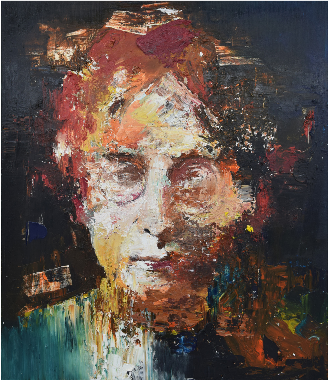
Legend - JL