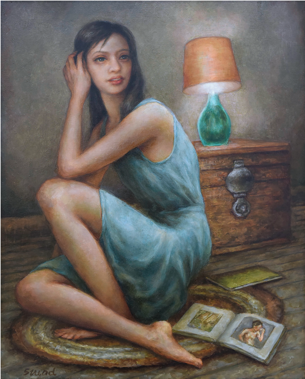
Genie 76 x 61 cm | Oil on Canvas | 2018