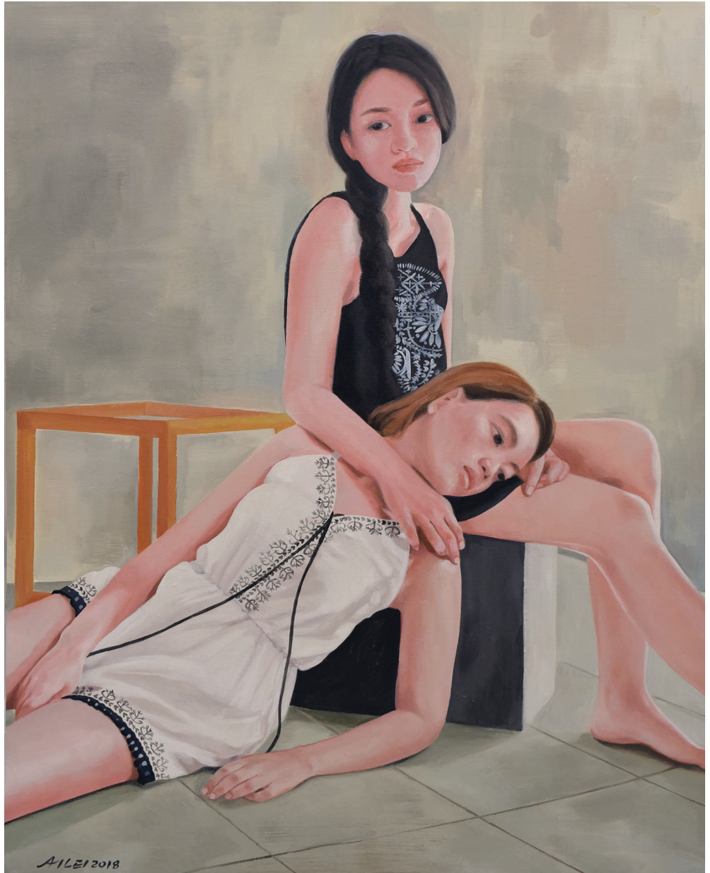
Black & White #3 76 x 61 cm | Oil on Canvas | 2018