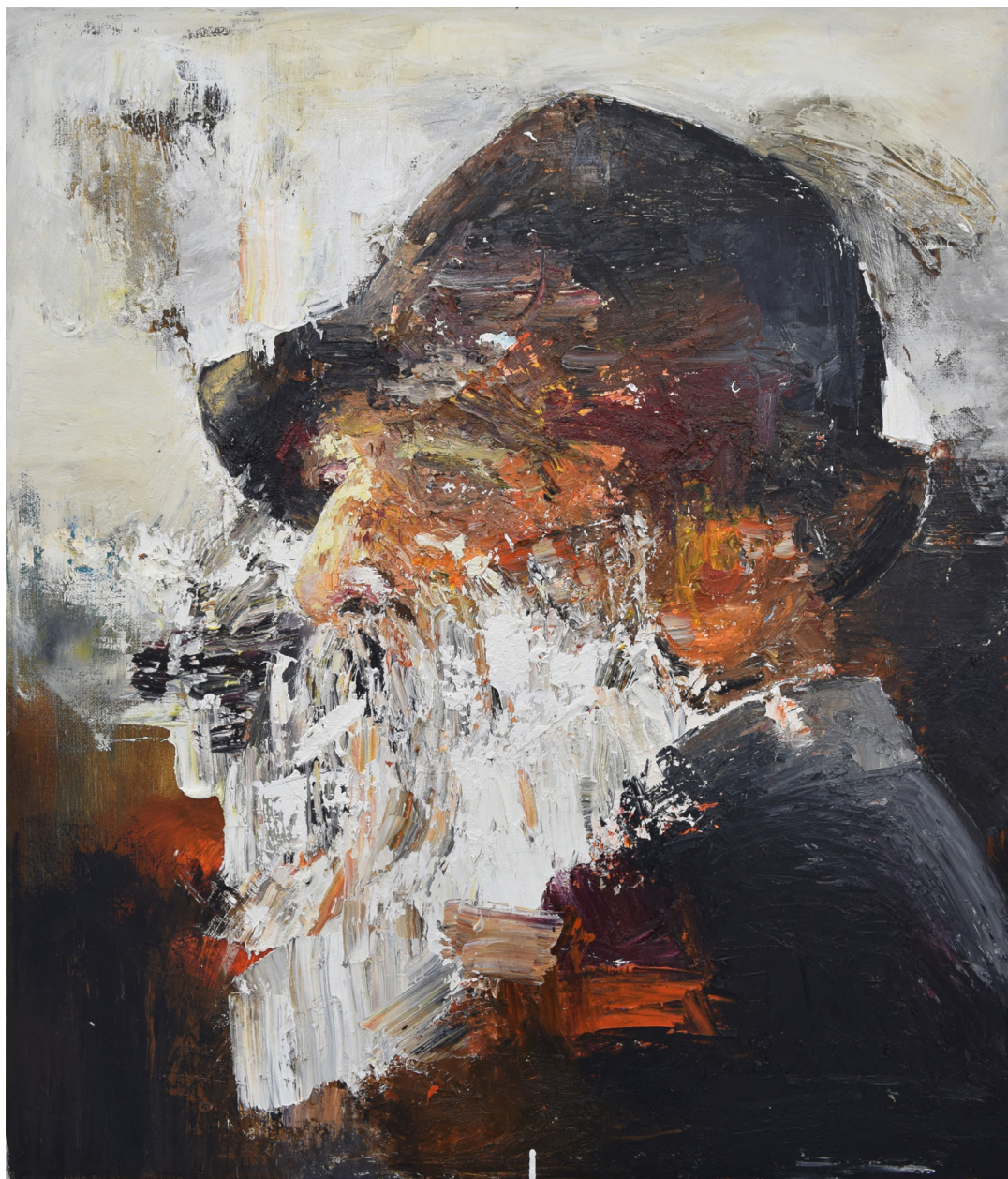
Legend - Claude