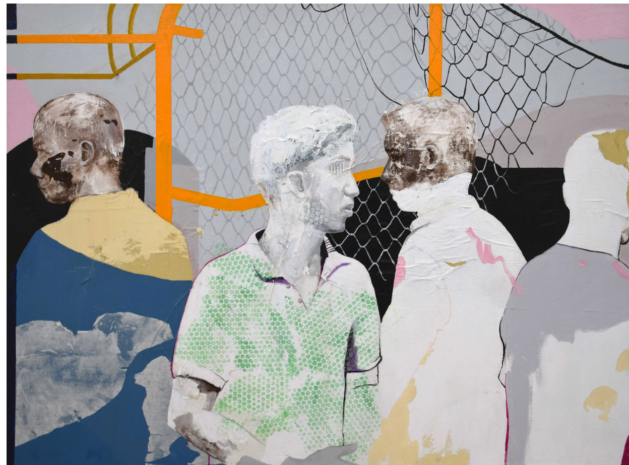
The Lost of The City I

100 x 140 cm | Paper, charcoal, oil pastel, gloss gel & acrylic on canvas | 2018