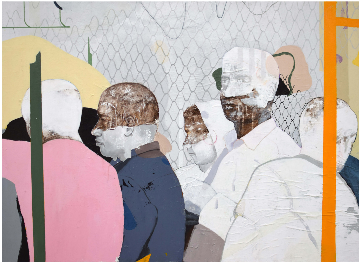
The Lost of The City II 98 x 135 cm | Paper, oil pastel, gloss gel & acrylic on canvas | 2018