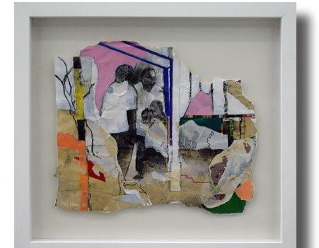
Cities & Memory (Full Series) Variable Dimensions | Paper, charcoal, oil pastel, gloss gel & acrylic on paper | 2018