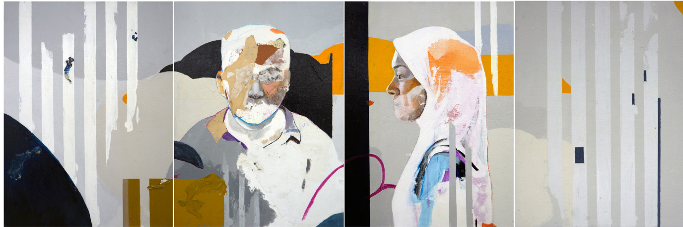
Cities & Sign 56 x 168 cm | Paper, charcoal, oil pastel, gloss gel & acrylic on canvas | 2018