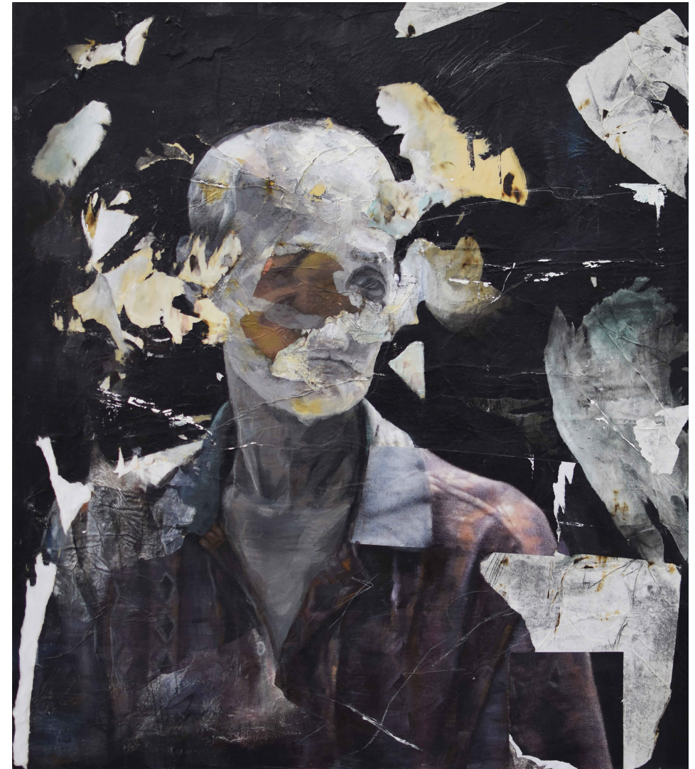
Where Are You Heading 102 x 90 cm | Paper, print, gloss gel and acrylic on canvas | 2017