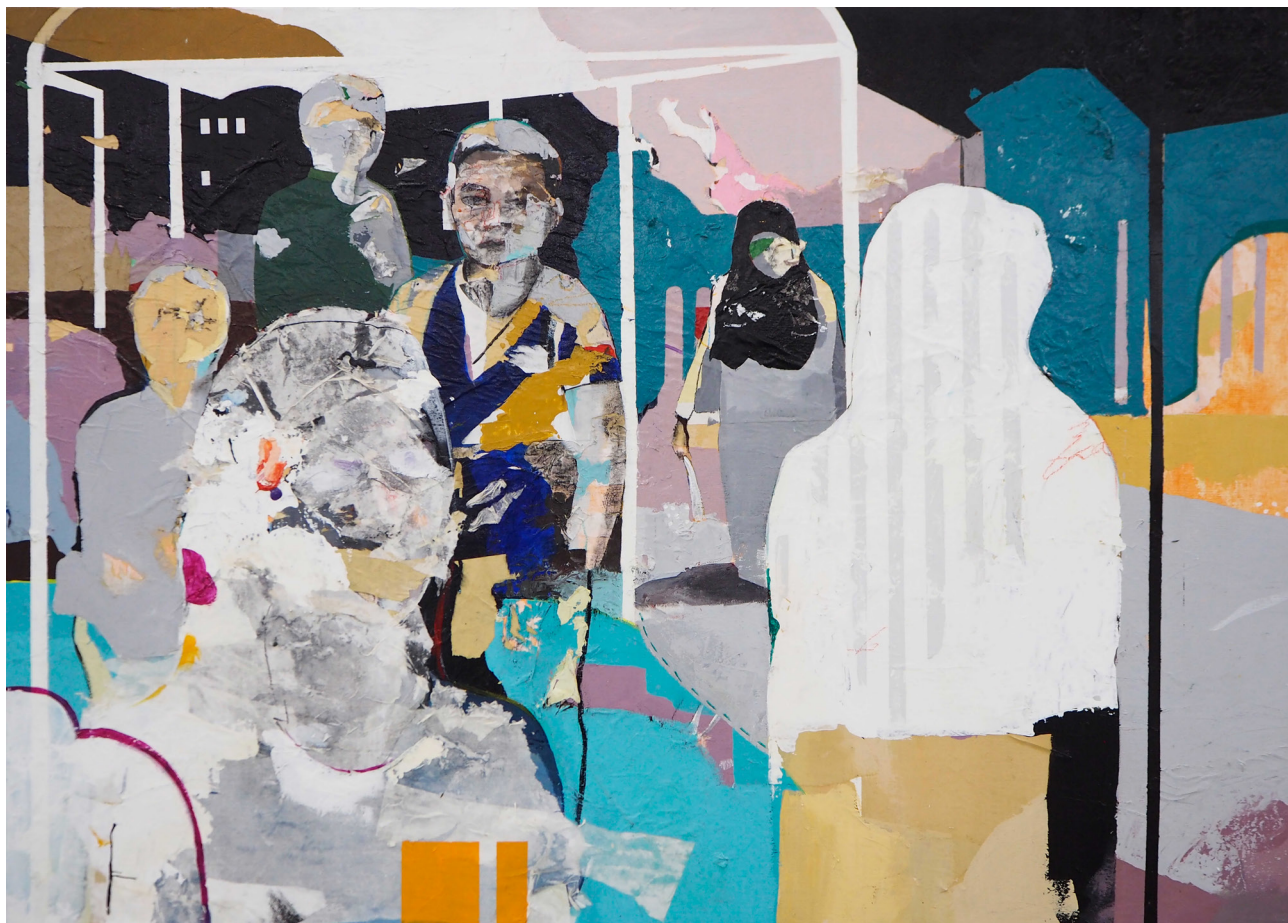
Cities & Desire

100 x 140 cm | Paper, charcoal, oil pastel, gloss gel & acrylic on canvas | 2018