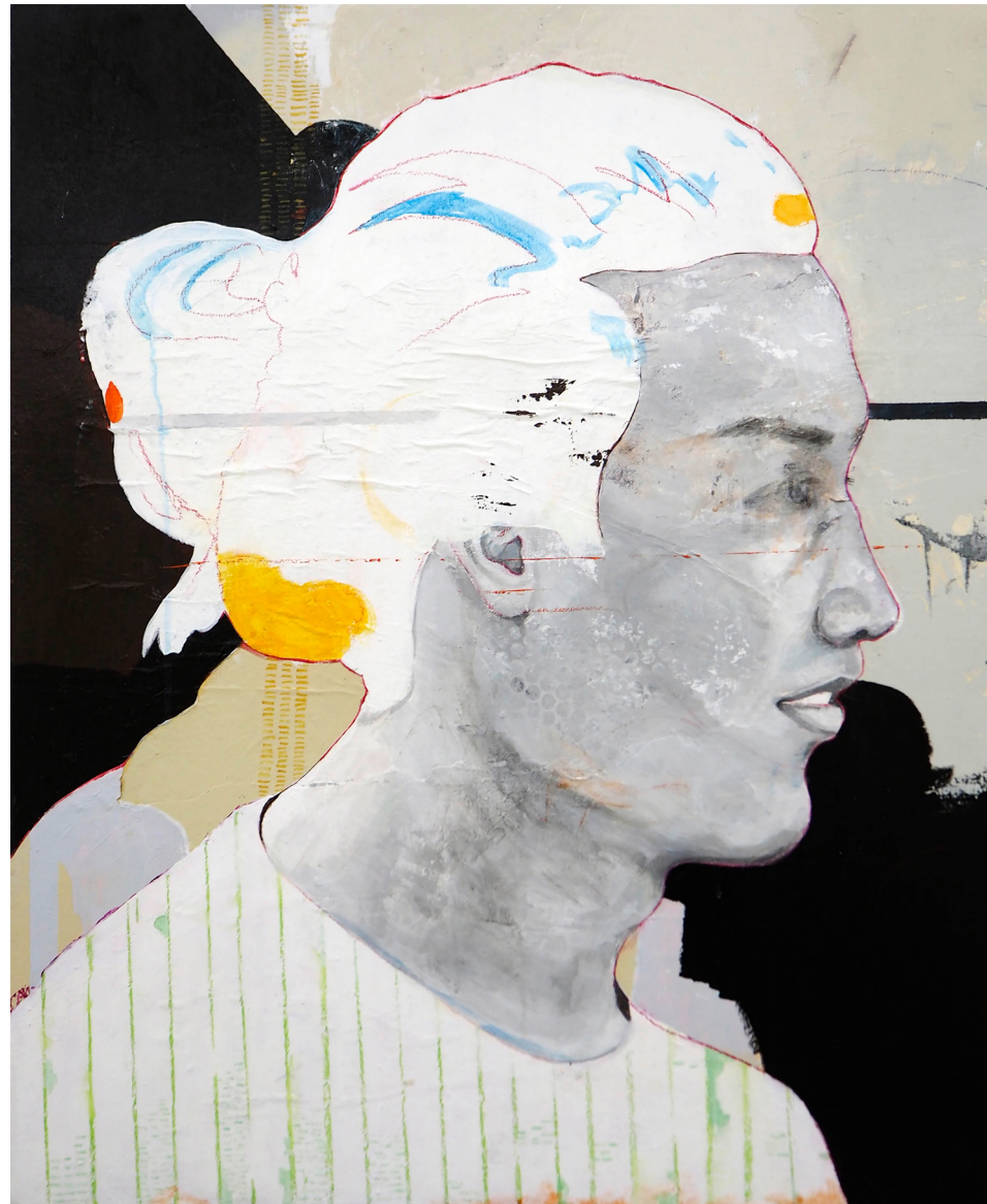
Tell Me About Your City 82 x 67 cm | Paper, oil pastel, gloss Gel & Acrylic on Canvas | 2018