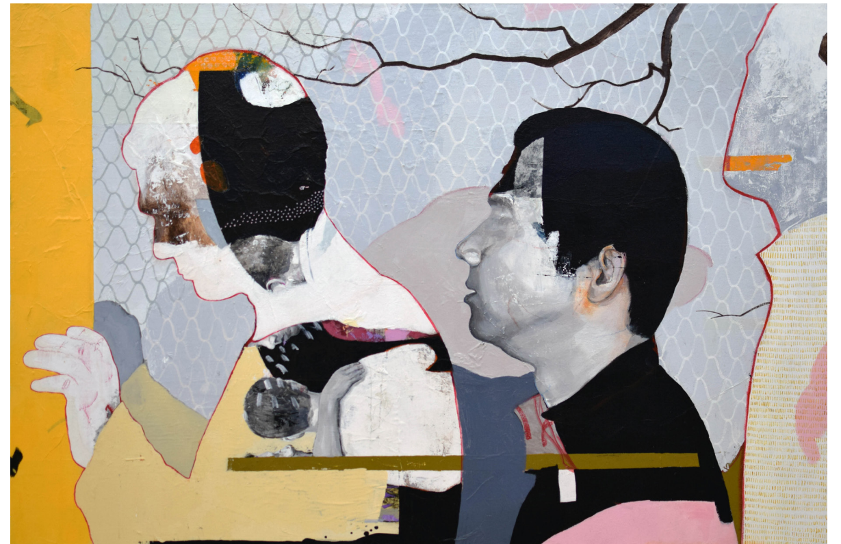
The Lost of Us 90 x 135 cm | Paper, oil pastel, gloss gel & acrylic on canvas | 2018