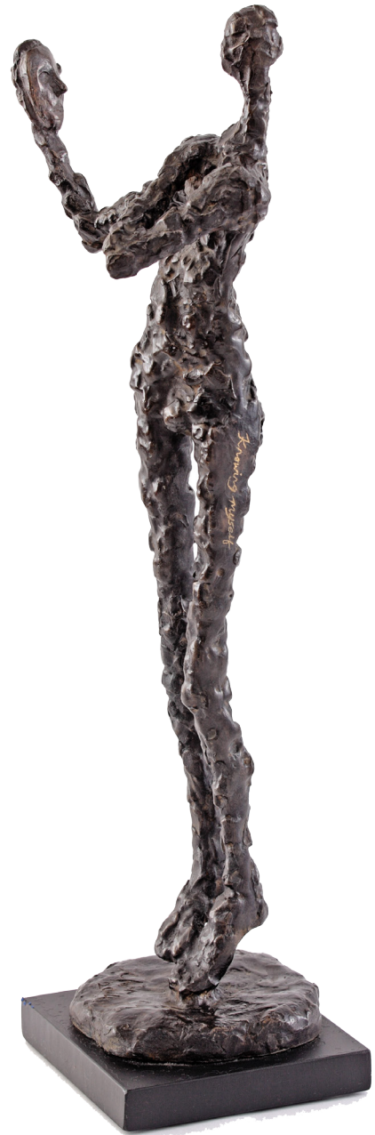
Beyond Mind and Words Series No. 62 The Existance of Reality 51(H) x 18(W) x 12(D)cm Bronze 2014