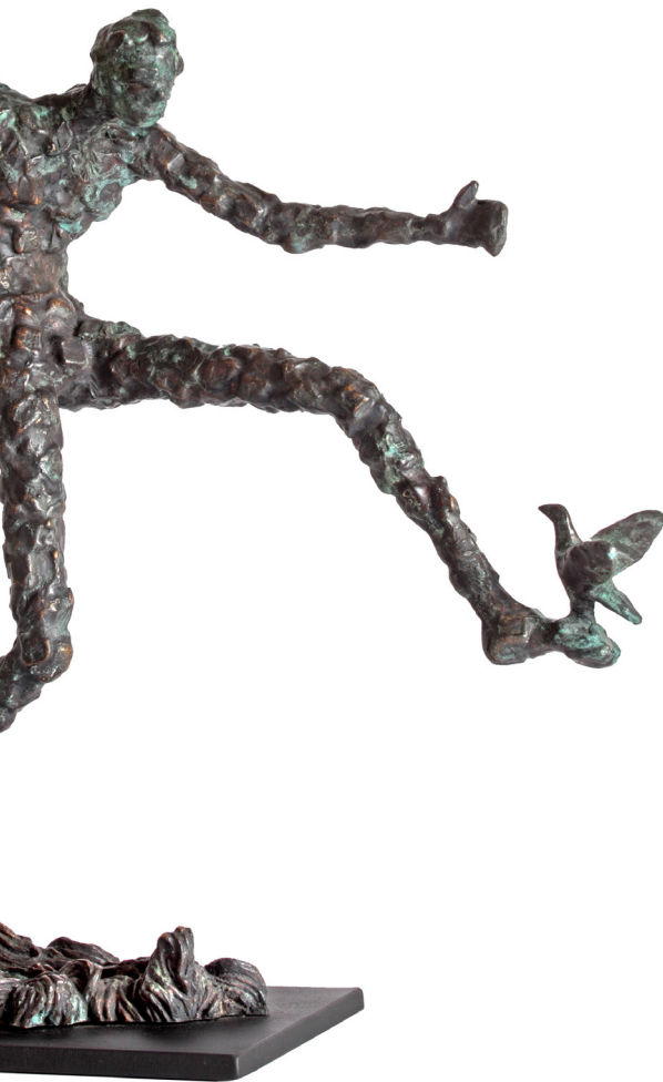
Beyond Mind and Words Series No.66 Reality 50.5(H) x 34(W) x 15(D)cm Bronze 2015