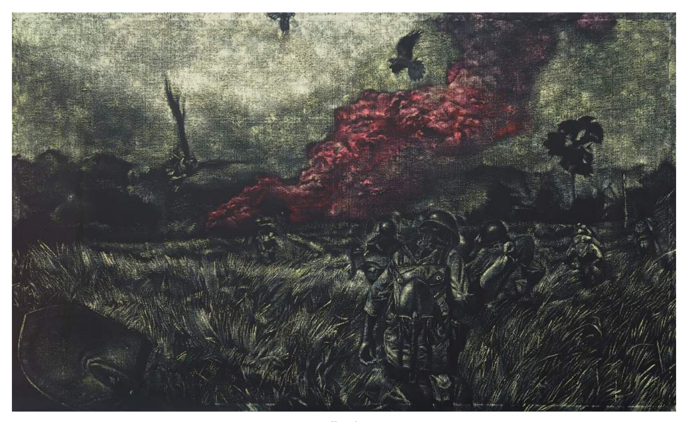
Mara! 92 x 152.5cm | Oil on Canvas | 2019