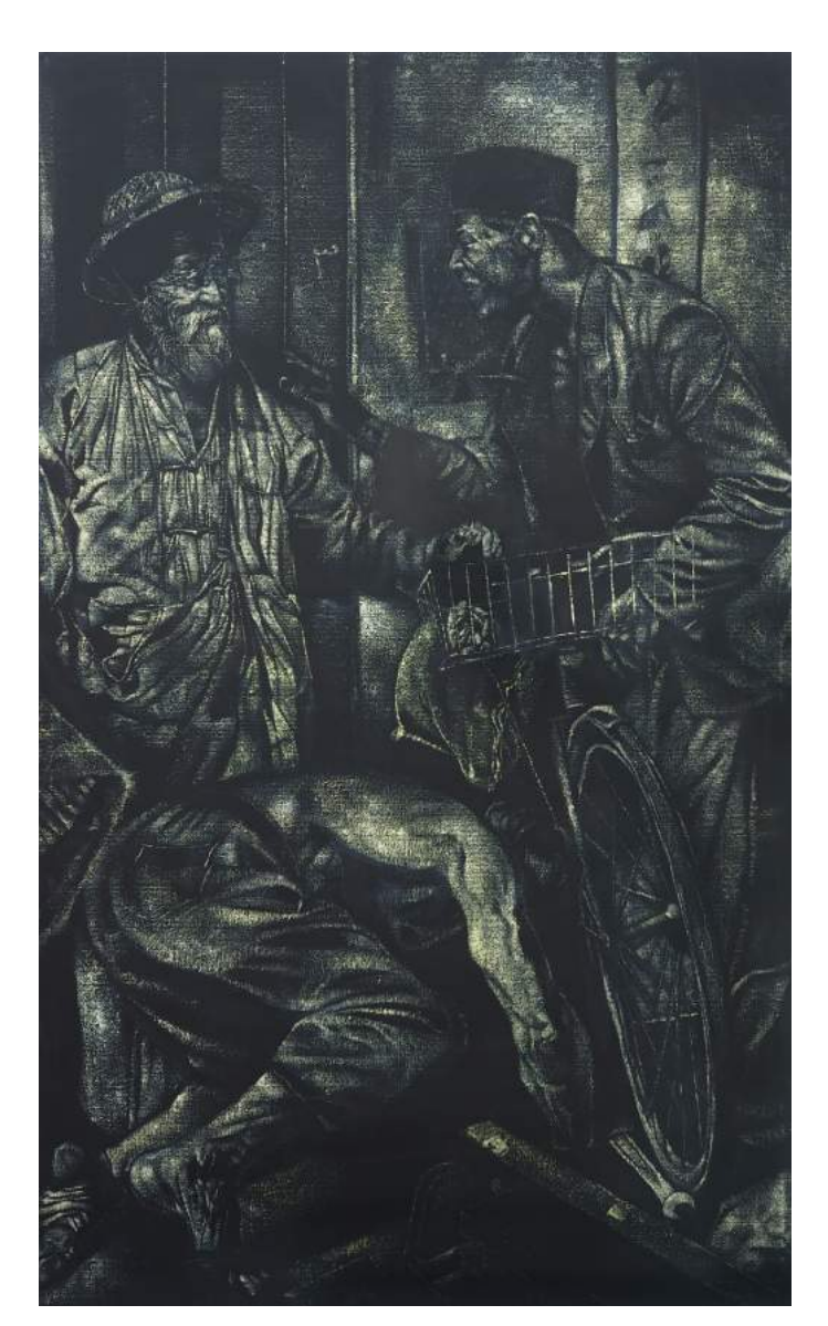
Bagai Isi dengan Kuku 152.5 x 92cm | Oil on Canvas | 2019