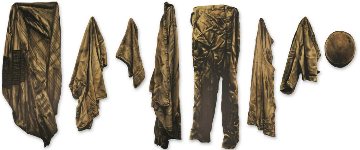
Unjustified Justify; Amicus Curiae #3 120x270x15cm | (Installation) Charcoal on Wood | 2020