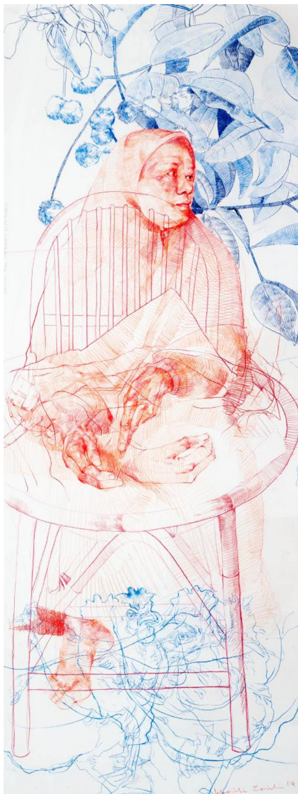
Di bawah pokok rambutan di depan reban I 200x75cm | Pencil on Paper | 2020