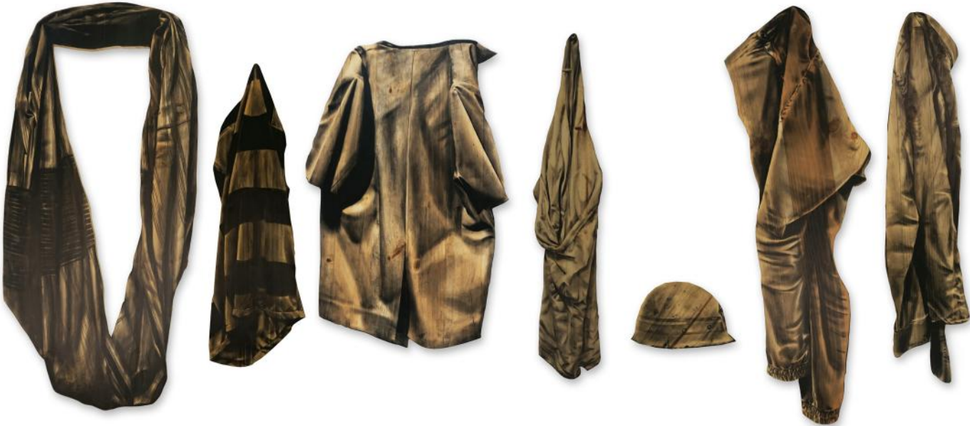
Unjustified Justify; Amicus Curiae #2 120x270x15cm | (Installation) Charcoal on Wood | 2020

This tells us how we hold on to something we believe, on how to ask forgiveness and how to pray as a person, how to be a person and their view on what they believe, there are times when a man wants to be God to fulfill their desire, and they change when they have a taste of power.