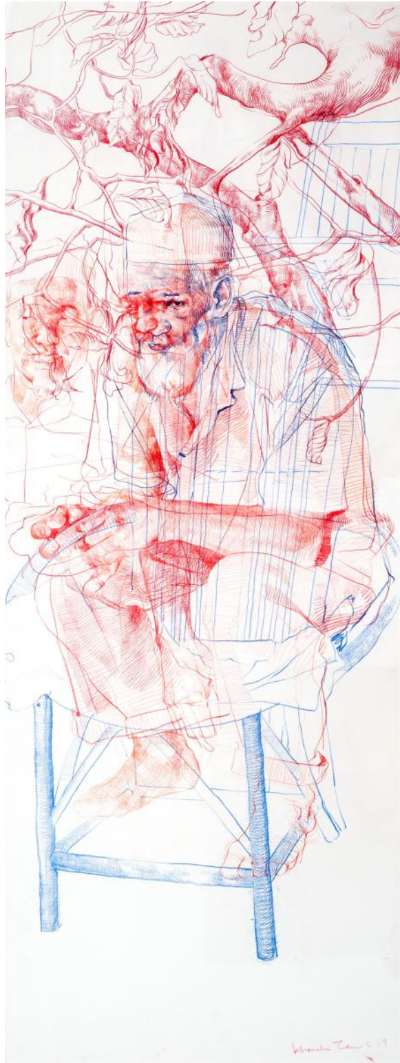
Di bawah pokok rambutan di depan reban II