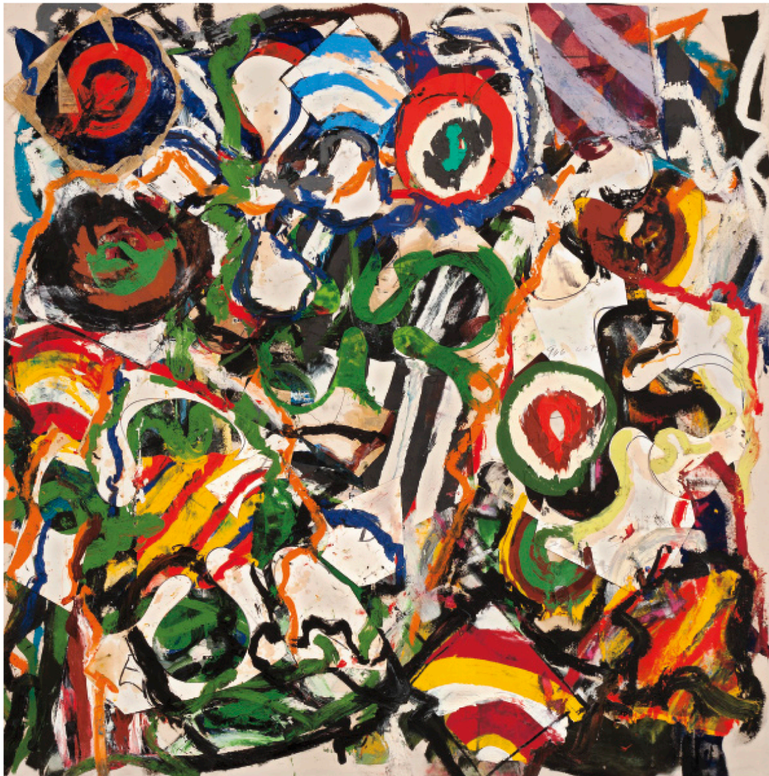
ABOVE Michael Goldberg (1924–2007) Untitled , 1992. Mixed media on canvas, 72½ x 71 ½ inches. Signed lower right: "goldberg". Signed and dated verso: "goldberg '92"