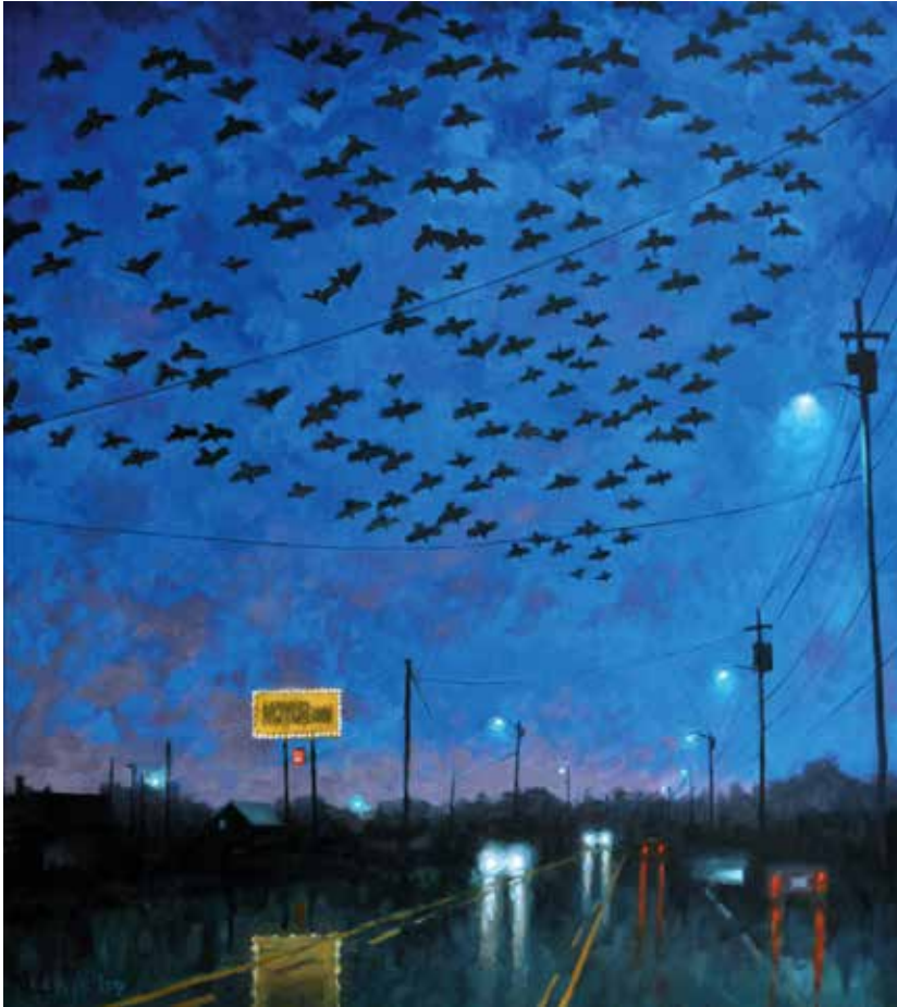
Carmack Lewis Commute , 2009

Oil on canvas, 53 x 50 in. (134.6 x 127 cm).