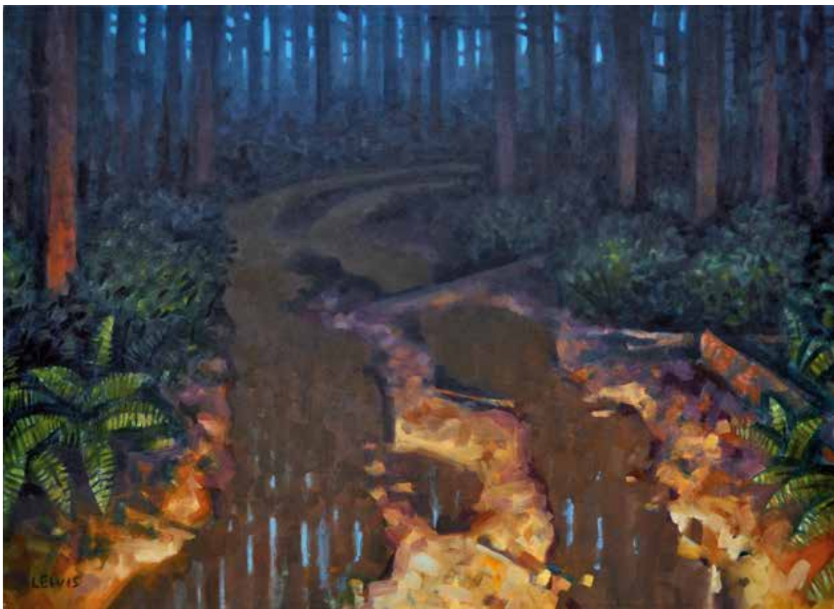
Carmack Lewis Muddy Road , 2009

Oil on canvas, 33 x 46 in. (83.8 x 116.8 cm).