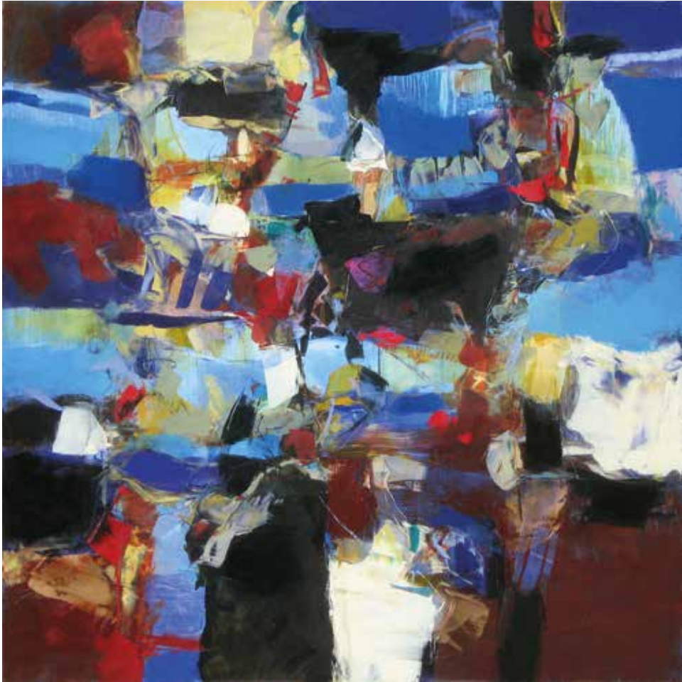
Loehr Mirrat , 2011

Oil on panel, 48 x 48 in. (121.9 x 121.9 cm).