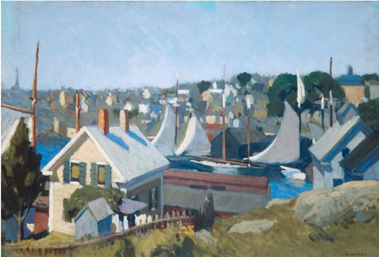
Edward Hopper Gloucester Harbor , 1912