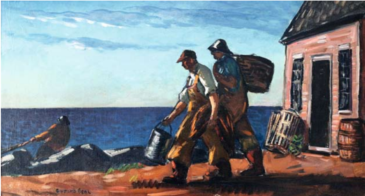
Gifford Beal Fishermen, Early Morning , 1930 Oil on canvas 20 x 36 in. (50,8 x 91,4 cm)