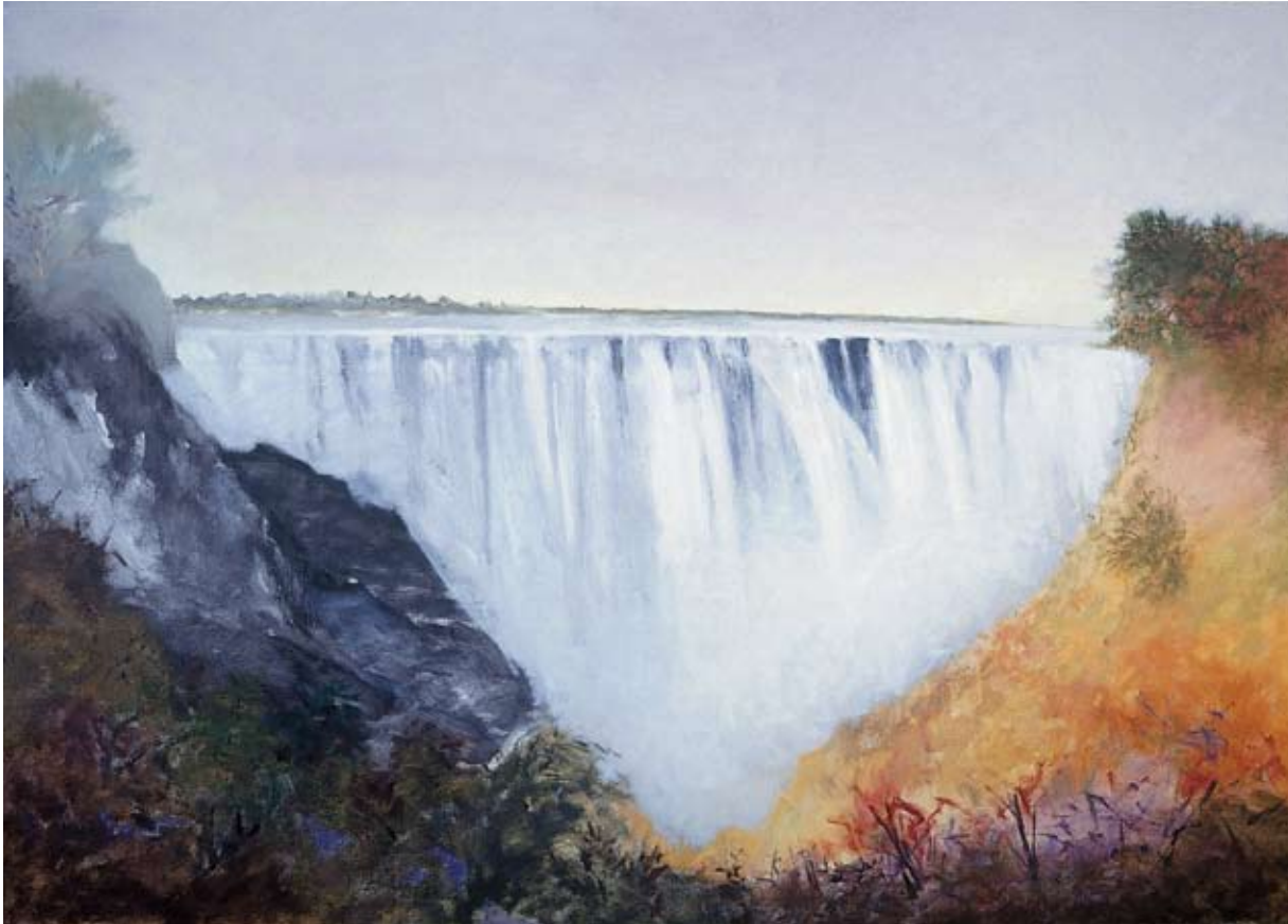
The Zambezi, Victoria Falls, 1992