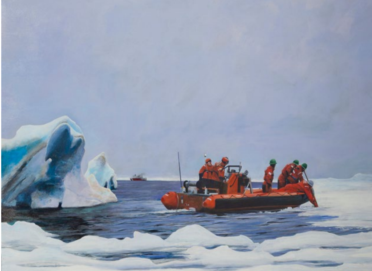
Chukchi Reach , 2014 Acrylic on canvas, 24 x 36 in. (61 x 91,4 cm) U.S. Coast Guard Art Collection, Washington, D.C.

resigned both his position at Dartmouth and the Rhode Island School of Design so that he and his wife could realize their long-held dream of moving to the Green Mountains of Vermont.