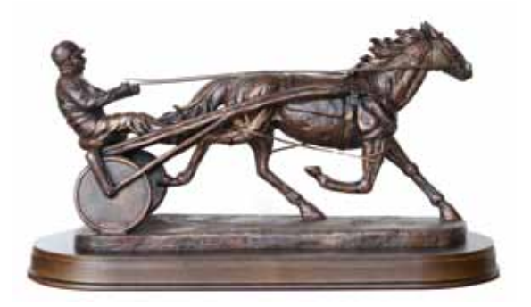
Pacer, c. 2006. Resin/bronze finish, 7 x 17 x 9 in. (17,8 x 43,2 x 22,9 cm).