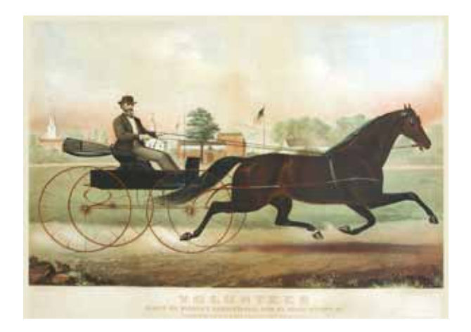
Volunteer, 1869 Color lithograph, 18 ¾ x 26 ¾ in. (47,6 x 67,9 cm)