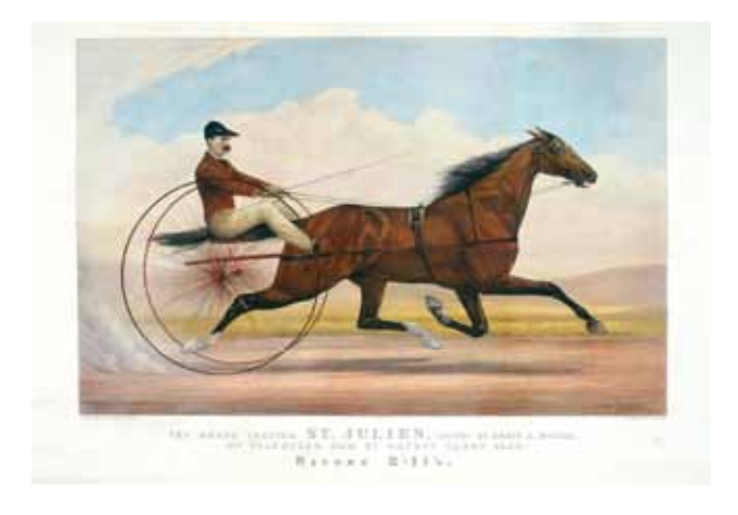
The Grand Trotter St. Julien , undated Color Lithograph, 20 x 29 ¾ in. (50,8 x 75,6 cm)