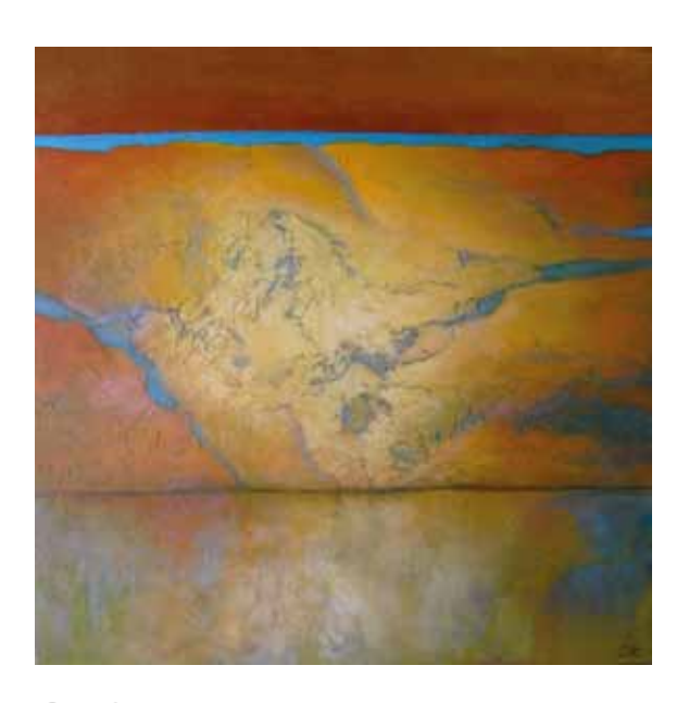
Craft Moonrise, 2005 Acrylic on canvas, 48 x 48 in. (121.9 x 121.9 cm) Courtesy of the artist, Albuquerque, New Mexico