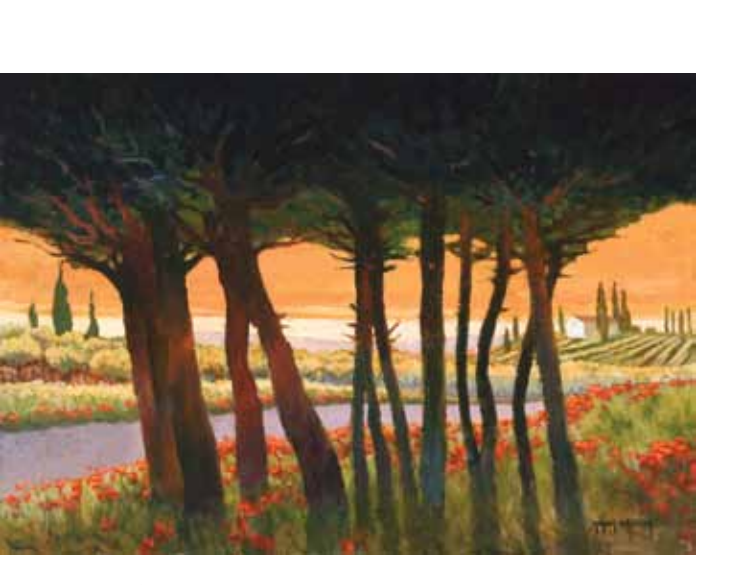
Schlicting Road to Assisi, 2008 Acrylic on canvas, 14 x 19 in. (35.6 x 48.3 cm)