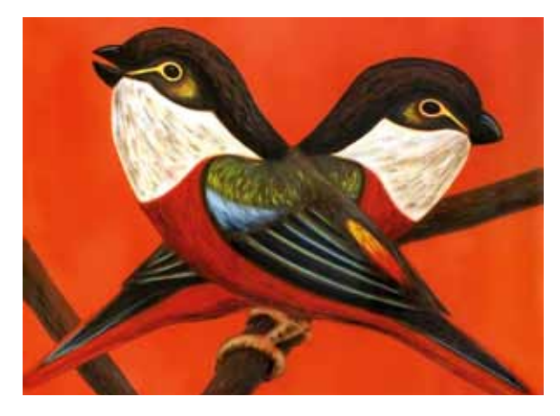
Monotype and mixed media, 40 x 50 in. (101.6 x 127 cm)