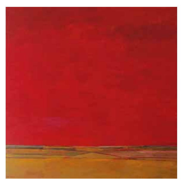
Bowles Summer Heat # 8, 2010 Acrylic on canvas, 48 x 48 in. (121.9 x 121.9 cm) Courtesy of the artist, Orangevale, California