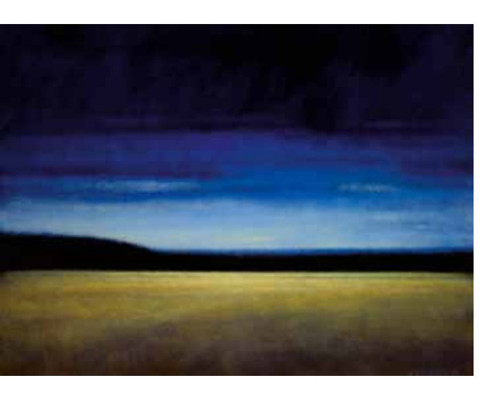
Fitzgerald Horizon Blue, 2009 Oil on canvas, 30 x 40 in. (76.2 x 101.6 cm) Courtesy of the artist and Principle Gallery, Alexandria, Virginia