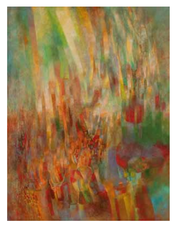
Oil on linen, 58 x 44 in. (147.3 x 111.8 cm)