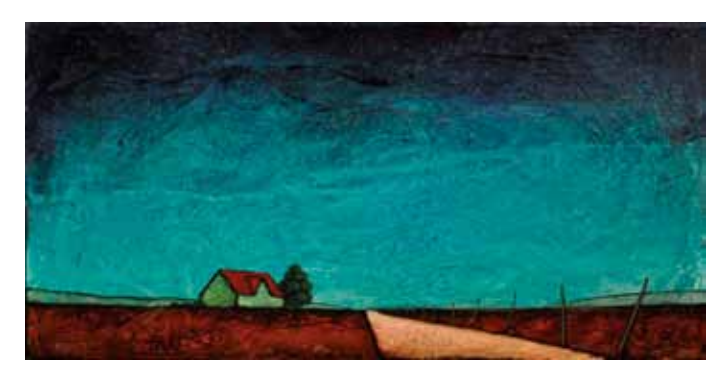
Myers The Dark Blue Above , 2009 Mixed media on canvas, 12 x 24 in. (30.5 x 61cm)