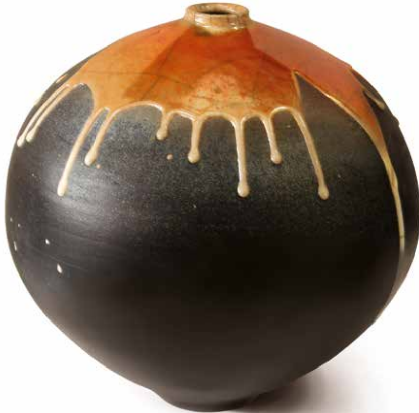
Untitled , 2015 Ceramic (Raku fired) 23 x 10 x 10 in. (58.4 x 25.4 x 25.4 cm)