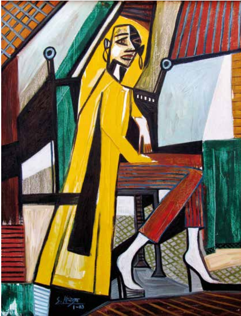
Seated Woman with Yellow Coat

Oil on canvas, 42 x 34 in. (106.7 x 86.4 cm)