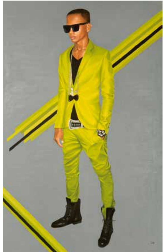
Bossman , 2014