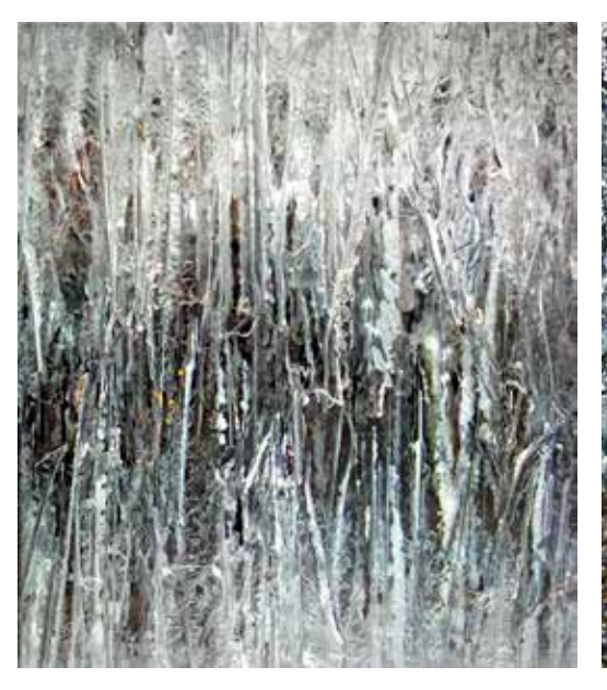
Lightness Next to Fire, 2015 Photograph printed on Moab Entrada Rag 48 × 43 in. (121,9 × 109,2 cm)