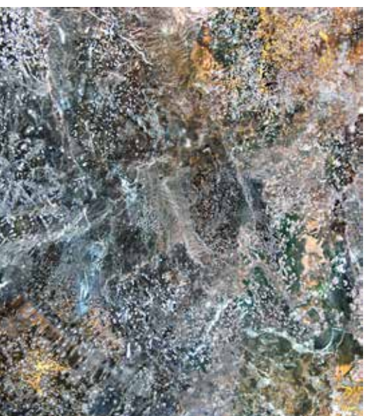
The Temper, 2015 Photograph printed on Moab Entrada Rag 48 × 43 in. (121,9 × 109,2 cm)