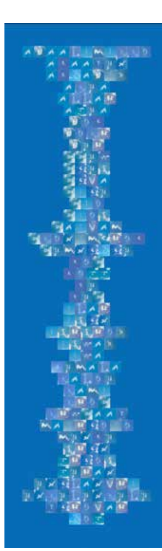
Untitled, 2005 Lightjet print on Endura paper 87 ½ × 29 in. (222,3 × 73,7 cm) Courtesy of the artists and Marsha Mateyka Gallery, Washington, D.C.

Entropy in Cinnamon Swirl, 2004 Lightjet print on metallic paper 37 ½ × 37 ½ in. (95,3 × 95,3 cm) Courtesy of the artists and Marsha Mateyka Gallery, Washington, D.C.