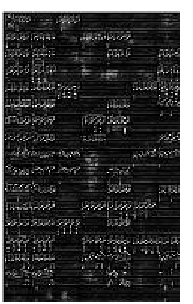
Please Listen to Me Digital image 47 x 32 ½ in. (119,4 x 82,6 cm)