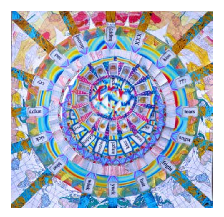
View Master, 2017 Collage, 21 ½ × 21 ½ in. (54,6 × 54,6 cm)