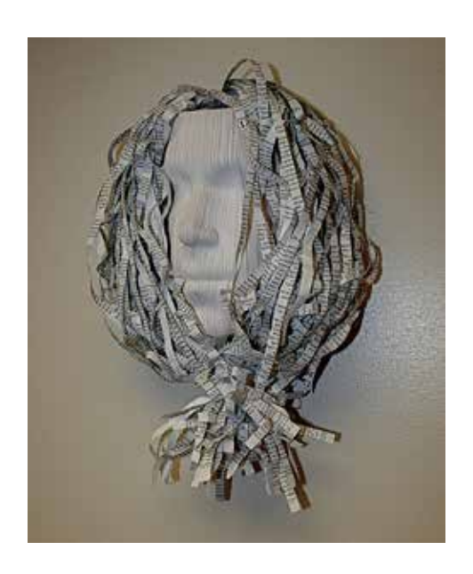
(Top left) Medicine Man, 2008 Altered book, 14 \times 12 \times 5 in. (35,6 \times 30,5 \times 12,7 cm) Courtesy of the artist, Sitka, Alaska

(Top right) Soothsayer , 2018 Monotype, 22 × 30 in. (55,9 × 76,2 cm) Courtesy of the artist, Sitka, Alaska