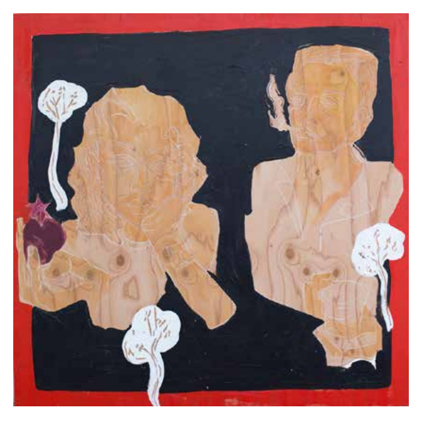
The Fall: pt 2 Back to the Garden, 2017 Woodcut 48 × 48 in. (121,9 × 121,9 cm) Courtesy of the artist, Santa Barbara, California