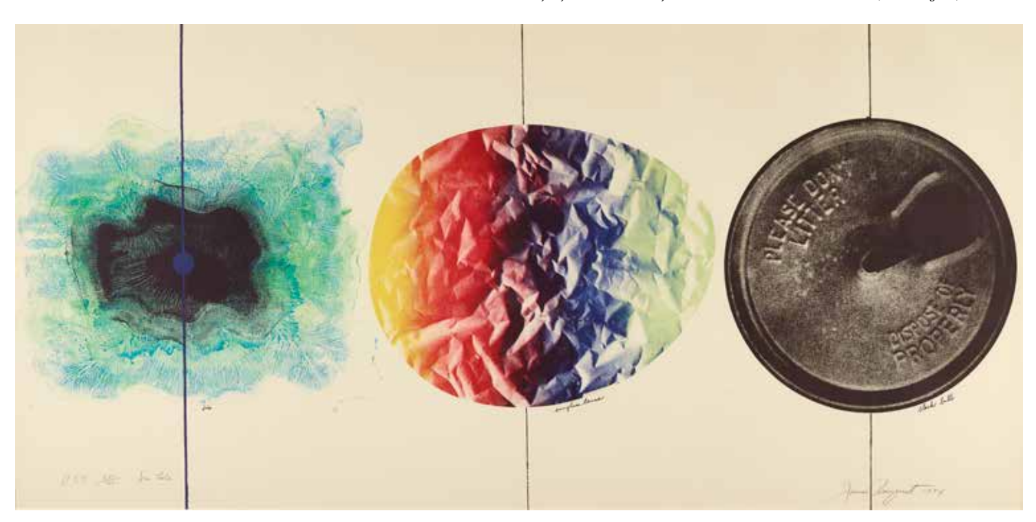
Iris Lake, 1974 Color lithograph, 43 ¾ x 80 ½ in. (111,1 x 204,5 cm) Collection of Art in Embassies, Washington, D.C.; Gift of the Foundation for Art and Preservation in Embassies, Washington, D.C.