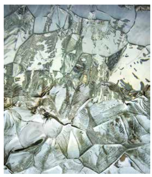
To Feed the Clouds, 2015 Photograph printed on Moab Entrada Rag 48 × 43 in. (121,9 × 109,2 cm)