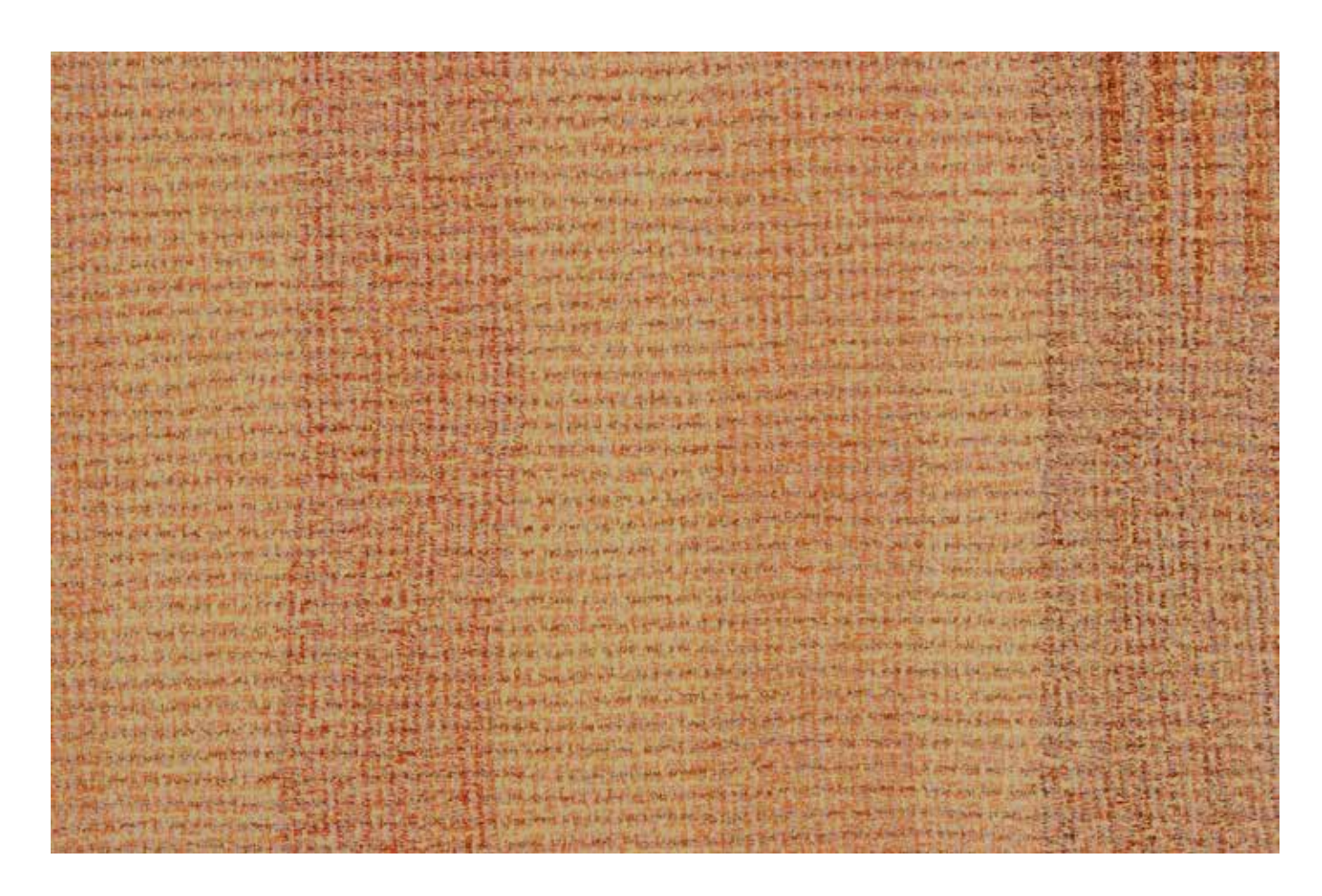
Blanket Series: Continuum (Book I / Book III), 2007

Six color lithograph printed on natural Sekishu on white Arches paper, 31 ½ x 39 in. (80 x 99,1 cm)