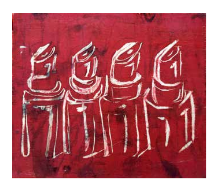
Lipstick Ammunition, 2015 Woodcut, mounted on wood 10 × 12 in. (25,4 × 30,5 cm) Courtesy of the artist, Santa Barbara, California