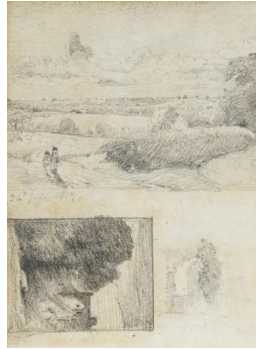
Fig.3 · John Constable, Dedham Vale from East Bergholt , 25 July

As Ian Fleming-Williams first pointed out, Constable had periods when drawing dominated his art. ‘Drawing or painting appears to have taken the lead alternatively: painting out of doors in 1802 giving place to pencil and watercolour in 1805–6; oil sketching predominating in the period 1809–12, to yield during 1813 and 1814 yet again to the sketchbook and pencil. This period, and in particular those last two years, was largely devoted to sketching, to gathering the material that would fuel his creative energy for the rest of his working life.’ 25 This catalogue contains sheets from all of these key moments offering us an opportunity to interrogate further how Constable used his drawings.