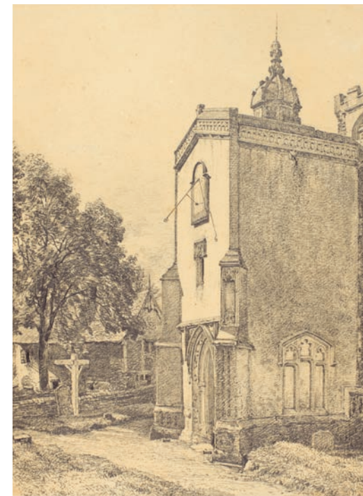
Fig.8 · John Constable, East Bergholt Church