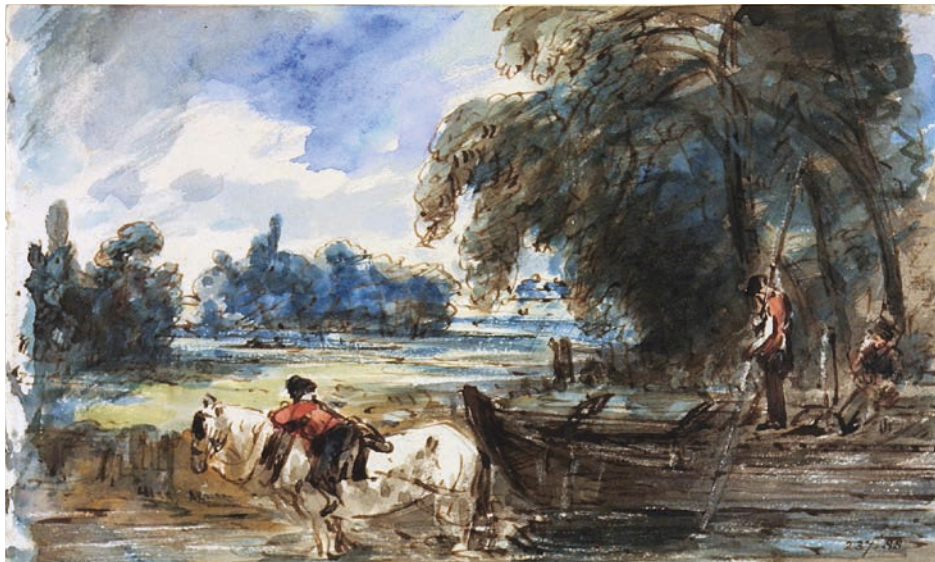
Fig.22 · John Constable, A barge on the Stour , c.1832

Pencil, pen and ink and watercolour · 4½ × 7½ inches · 115 × 192mm. © Victoria and Albert Museum, London, (237–1888)