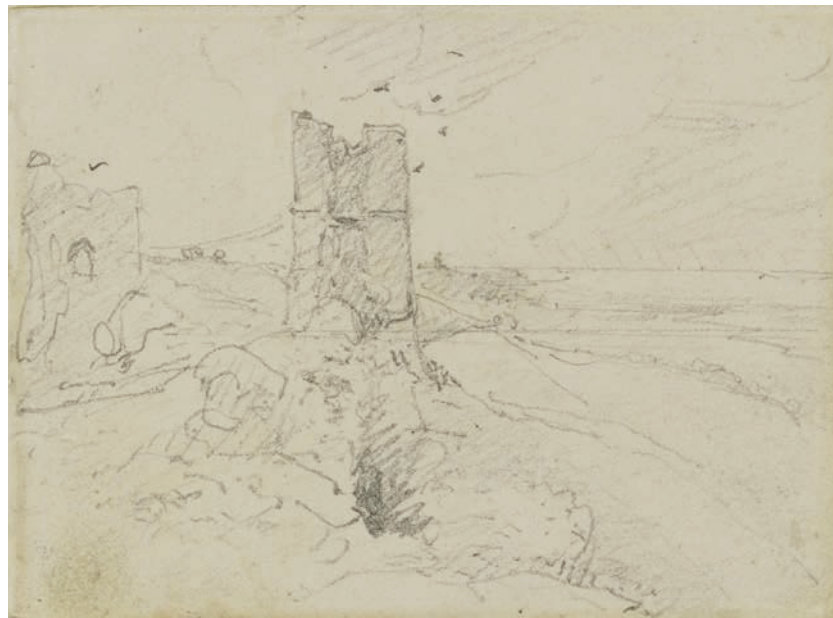
Fig.6 · John Constable, Hadleigh Castle , 1814