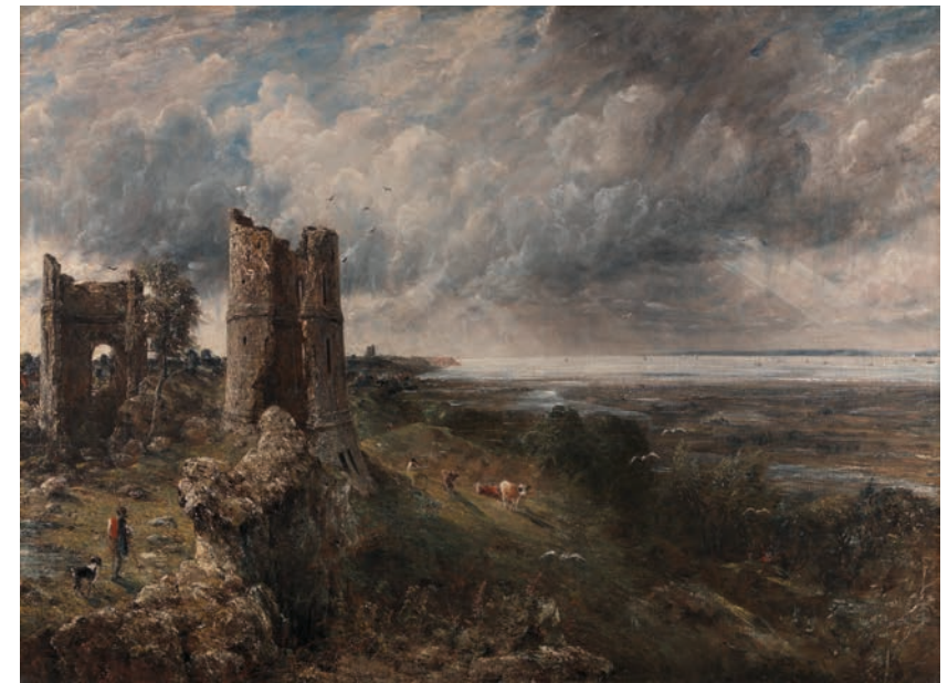
Fig.7 · John Constable, Hadleigh Castle , 1829