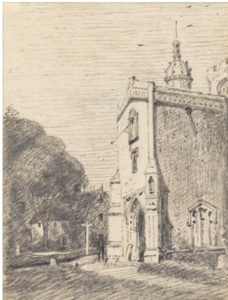
Fig.19 · John Constable, East Bergholt Church from the South East , c.1814

Graham Reynolds, The Early Paintings and Drawings of John Constable , New Haven and London, 1996, cat. no.14.60, repr. pl.1208.