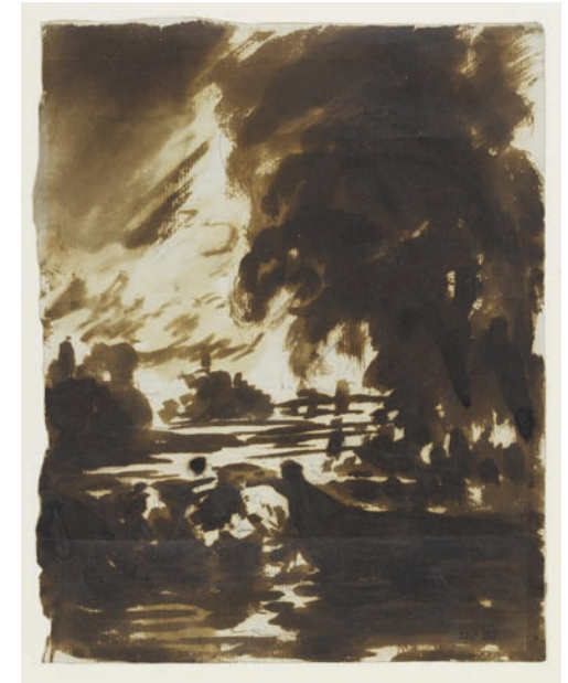
Fig.23 · John Constable, Trees and a stretch of water on the Stour , c.1832