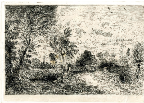
Fig.21 · John Constable, Milford Bridge , c.1826