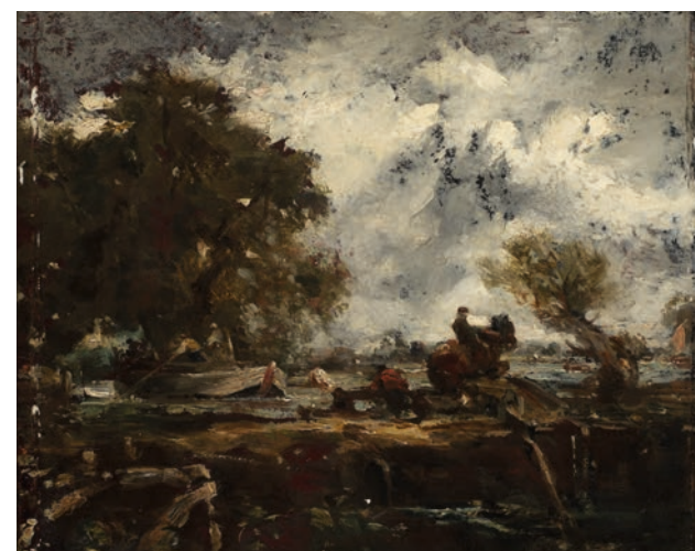
Fig.15 · John Constable, Study for The Leaping Horse , c.1824–5

Pencil and pen and grey ink and wash 8 × 11 7/8 inches · 203 × 302 mm