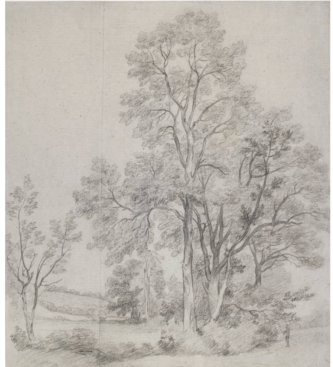
Fig.2 · John Constable, A stand of elms , c.1802

Constable entered the Academy when the institution was reaching maturity; a second generation of Academicians were conscious of investing British art with the intellectual and theoretical underpinning enjoyed by Continental schools of painting. This meant, above all, that the writings of the Academy's first President, Joshua Reynolds were highly valued and discussed. Constable was particularly conscious of Reynolds's writing and his reputation. 8 It is from Reynolds that Constable borrowed the phrase 'the art of seeing nature' which he quotes in his