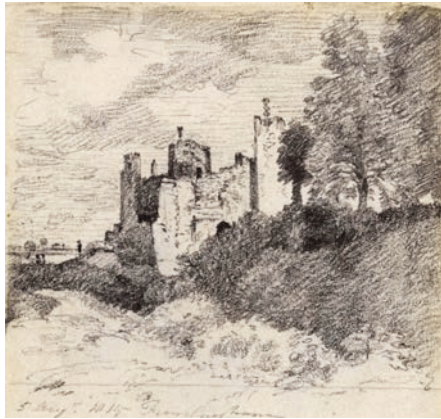
Fig.20 · John Constable, Framlingham Castle from the South West , 1815

London, Stafford Gallery, Duke Street, 1939.