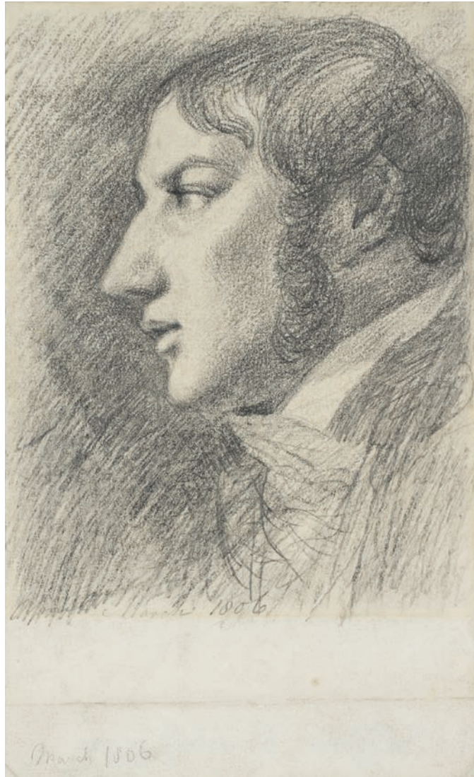
Fig.1 · John Constable, Self-portrait , 1806

This catalogue provides an opportunity to consider ten drawings by Constable. The sheets come from the collection of David Thomson, who has not only formed