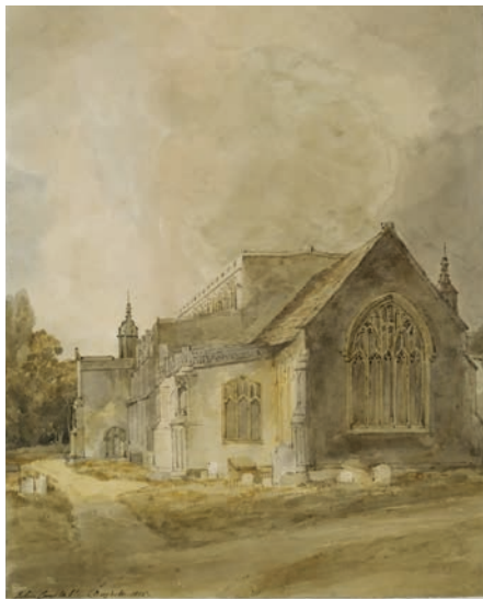
Fig.17 · John Constable, East Bergholt Church , 1805 Pencil and watercolour 17 \frac{1}{4} × 13 \frac{3}{4} inches · 439 × 351mm National Gallery of Canada, Ottawa (5817)