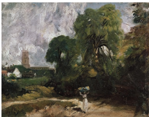
Fig.18 · John Constable, Stoke-by-Nayland, c.1830 Oil on paper · 9 3/4 x 13 inches · 248 x 330mm