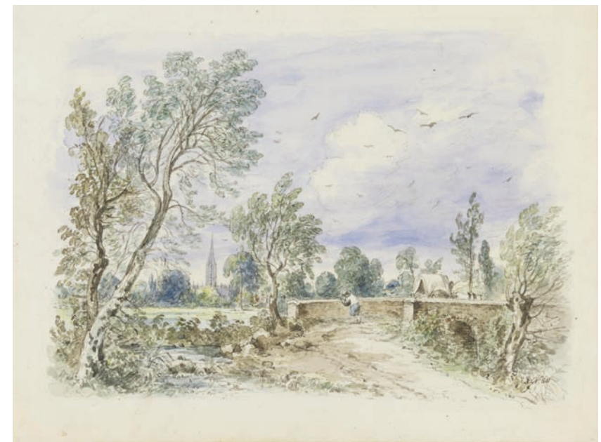
Fig.16 · John Constable, Milford bridge , c.1836

Watercolour · 7⅞ × 9½ inches · 182 × 241mm