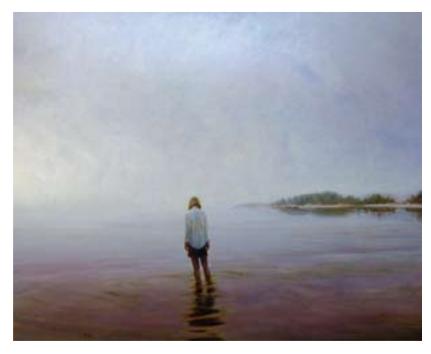
Reflection , 2005 Oil on canvas 48 \times 60 in. (121,9 \times 152,4 cm)