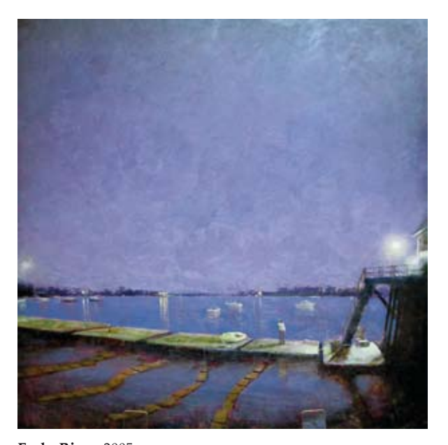
Early Riser, 2005 Oil on board 24 \times 24 in. (61 x 61 cm)