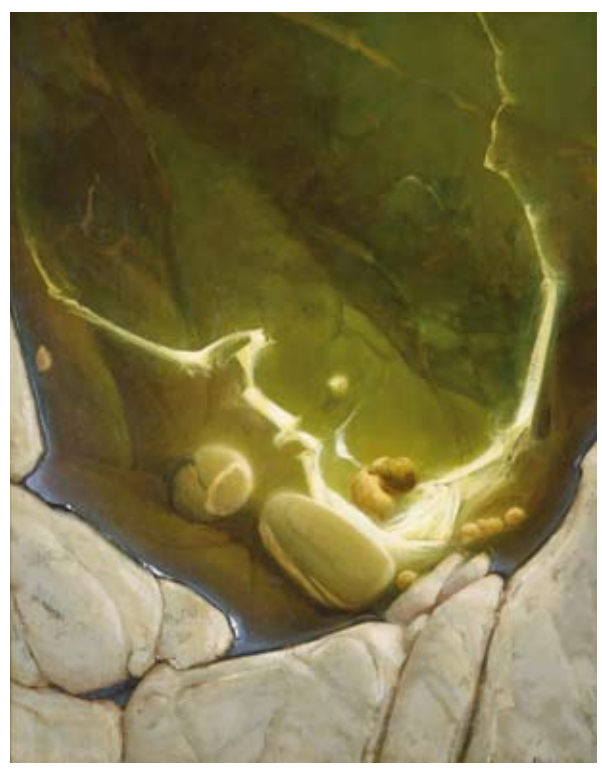
Rock Pool, 2004 Oil on canvas 32 x 26 in. (81 x 86 cm) Courtesy of a Private Collection