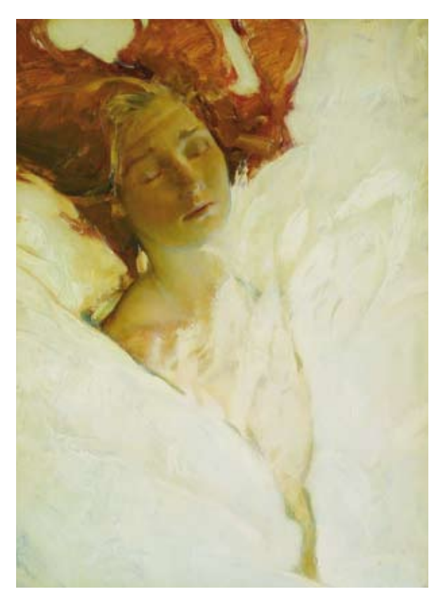
Leda , 2001 Oil on board 26 x 20 in. (66 x 51 cm)