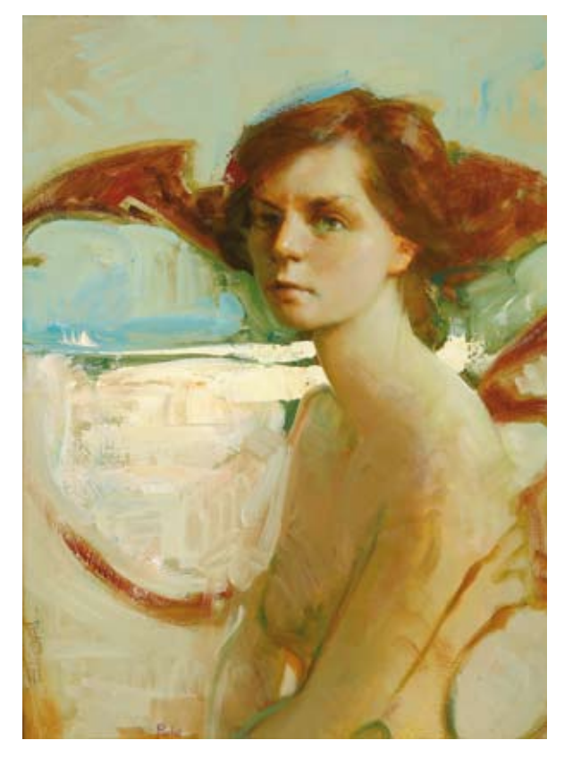
Europa , 2001 Oil on board 26 x 20 in. (66 x 51 cm)