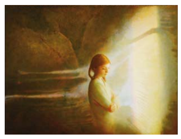
Becca, 2002 Oil on board 38 ½ x 50 ½ in. (98 x 128 cm)