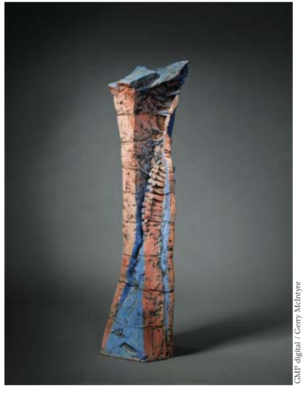
Spires of the Sea Series: Emerging, 2004 Ceramic 61 \times 18 \times 21 in. (154.9 \times 45.7 \times 53.3 cm) Courtesy of the artist, Sacramento, California

Spires of the Sea Series: Tornado Tower, 2001 Ceramic 79 \frac{1}{2} x 22 x 23 in. (201,9 x 55,9 x 58,4 cm) Courtesy of the artist, Sacramento, California