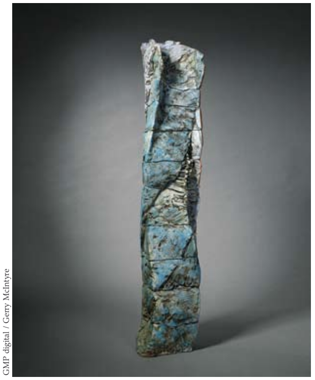
Spires of the Sea Series: Blue Ribbed, 2001 Ceramic 74 \times 17 \times 16 in. (188 \times 43.2 \times 40.6 \text{ cm})