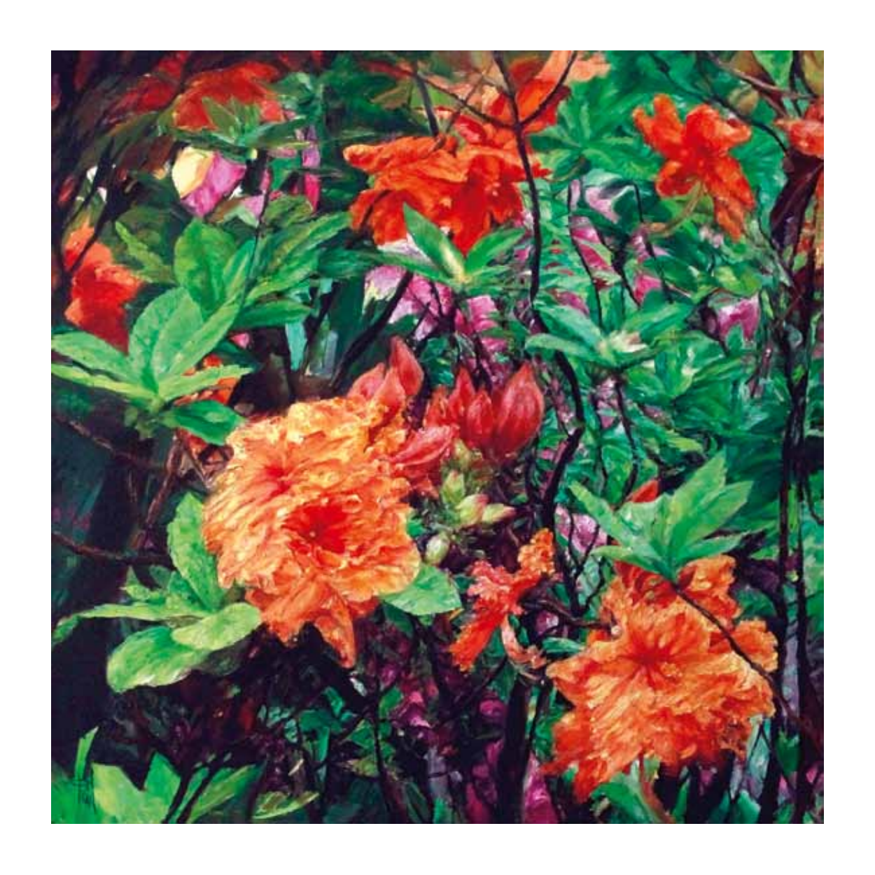
Pakan Penn Azalea Dream, undated Oil on canvas, 48 \times 48 in. (121.9 \times 121.9 cm).