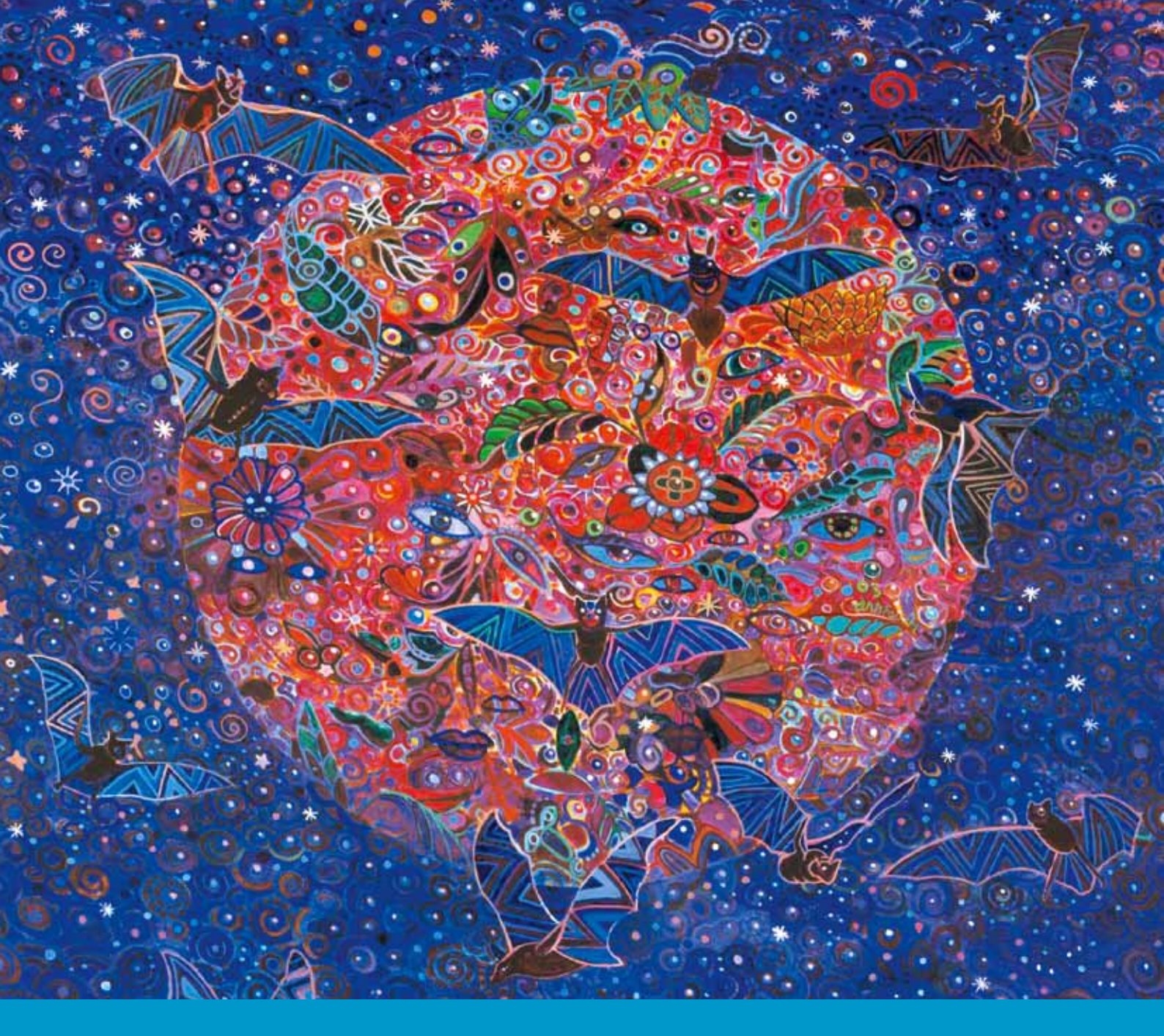
United States Embassy Port Louis, Mauritius ART in Embassies Exhibition