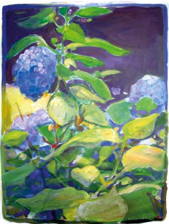
Nancy Haskett Hydrangea I, 2004 Acrylic on canvas, 26 x 23 in. (66 x 58.4 cm) Courtesy of the artist, Washington Grove, Maryland