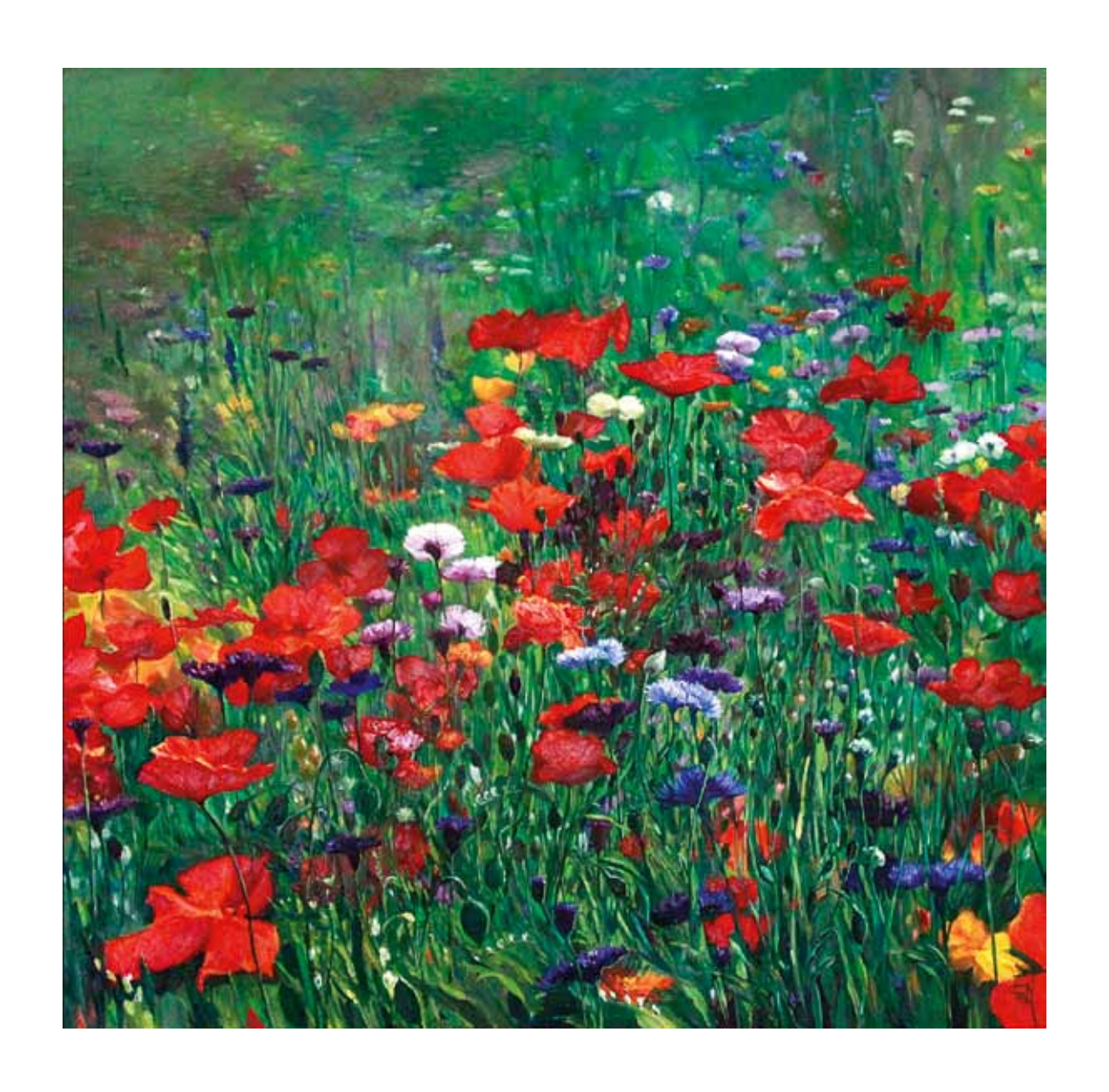
Pakan Penn Wild Poppies, 2002 Oil on canvas, 48 \times 48 in. (121.9 \times 121.9 cm).