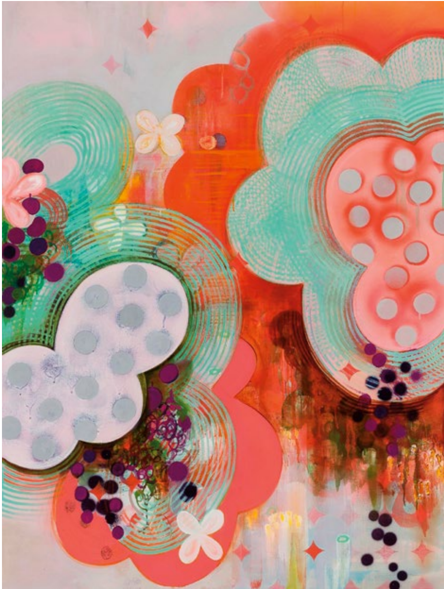
Alchemy , 2015 Oil and mixed media on linen 48 x 36 in. (121,9 x 91,4 cm)