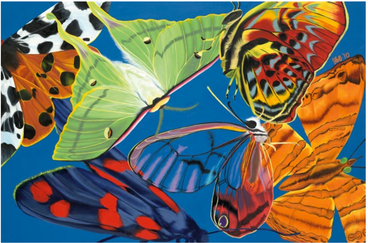
Flutter , 2010 Oil on canvas 20 x 30 in. (50,8 x 76,2 cm)