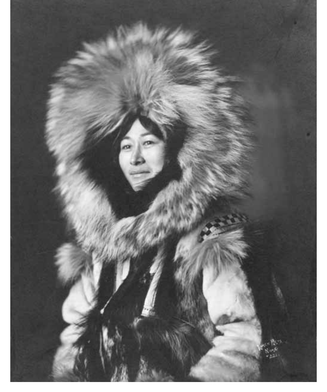
Anonymous American Eskimo Woman , ca. 1915 Photograph from digital negative, 16 ¼ x 13 18 in. (41,3 x 33,3 cm) Courtesy of ART in Embassies, Washington, D.C. Library of Congress Photographic Archives LC-DIG-ppmsc-02277