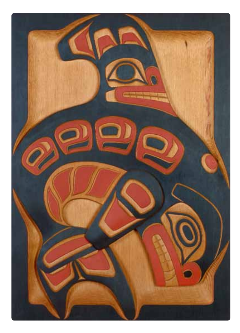
Jim Charlie Orca Panel, undated Red cedar, acrylic paint, 35 x 25 x 3 in. (88,9 x 63,5 x 7,6 cm)