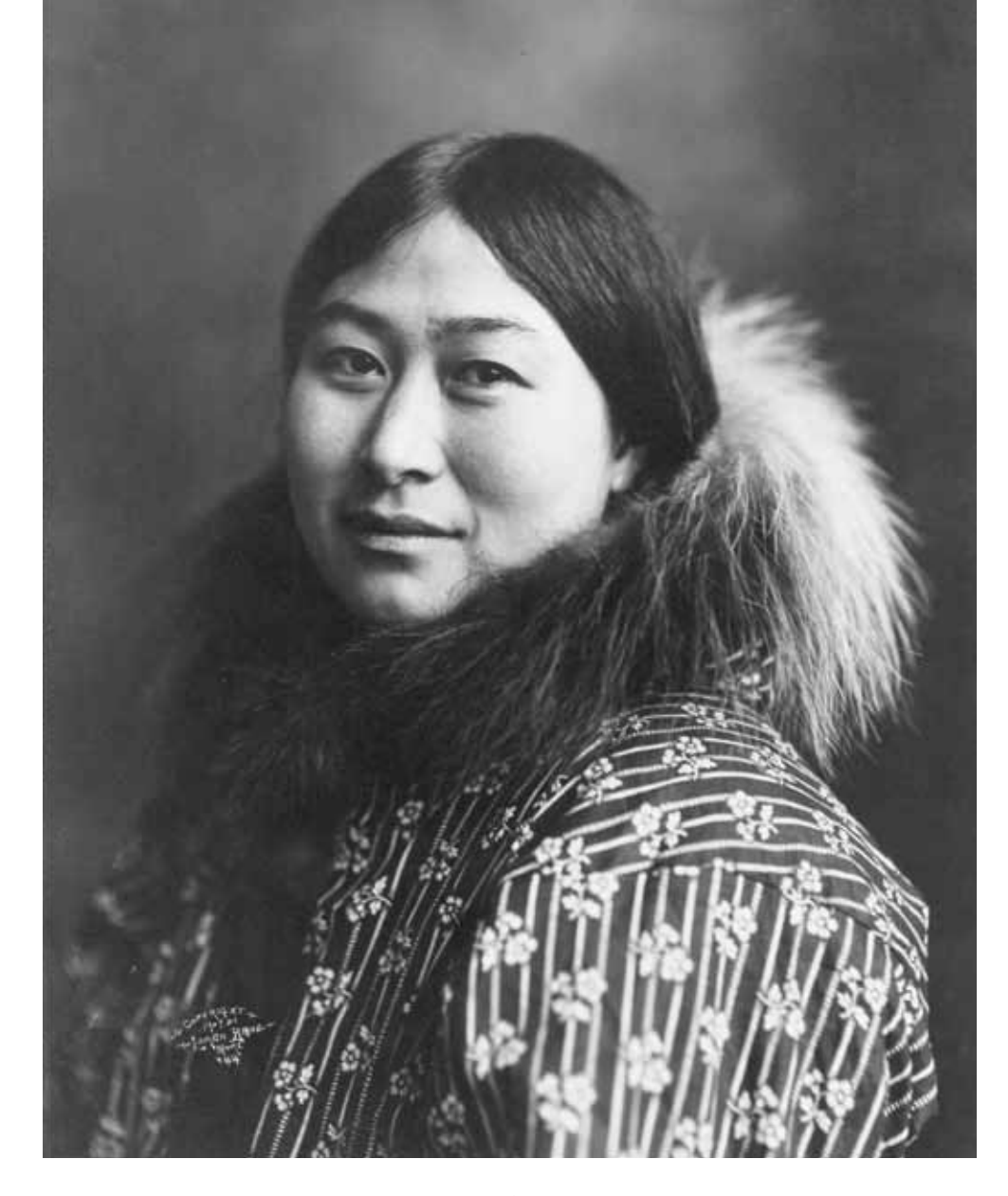
Anonymous American Eskimo Woman , ca. 1907 Photograph from digital negative, 16 ¼ x 13 18 in. (41,3 x 33,3 cm) Courtesy of ART in Embassies, Washington, D.C. Library of Congress Photographic Archives LC-DIG-ppmsc-02289