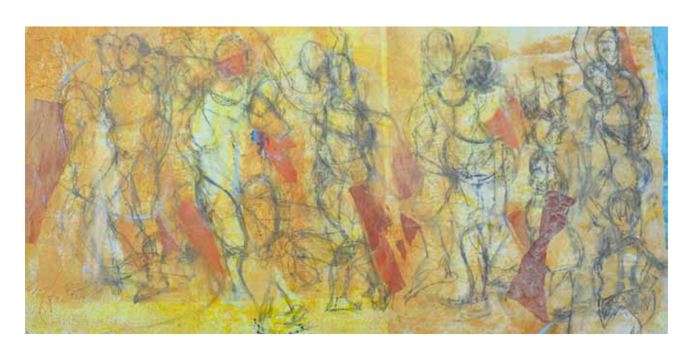
Kathleen Walsh Elena Dancing, 2009 Mixed media on canvas, 28 x 52 in. (71,1 x 132,1 cm)