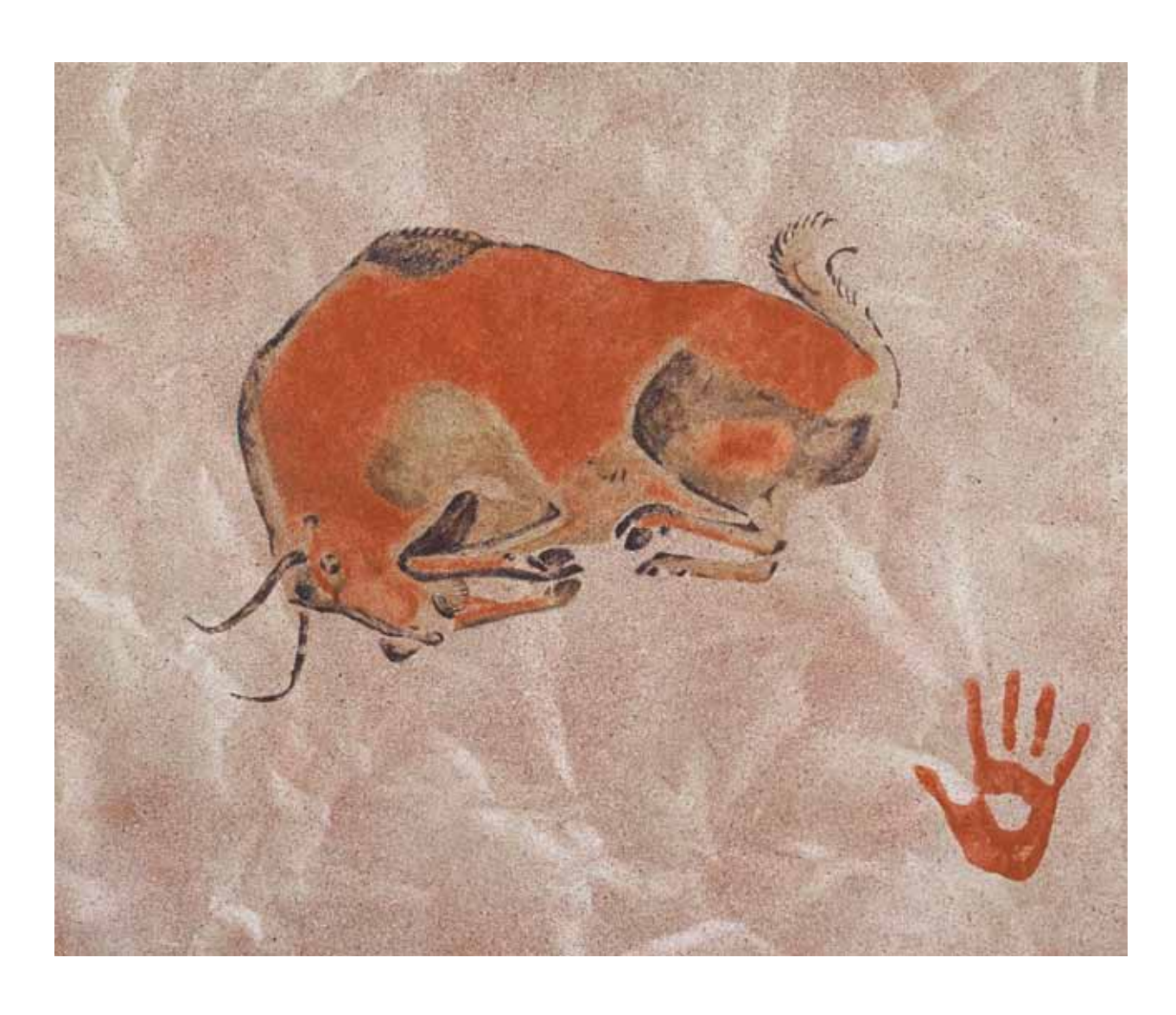
Betsy Gandy Excavations: Large Charging Bison, 2005 Acrylic on canvas, 32 x 40 in. (81,3 x 101,6 cm)