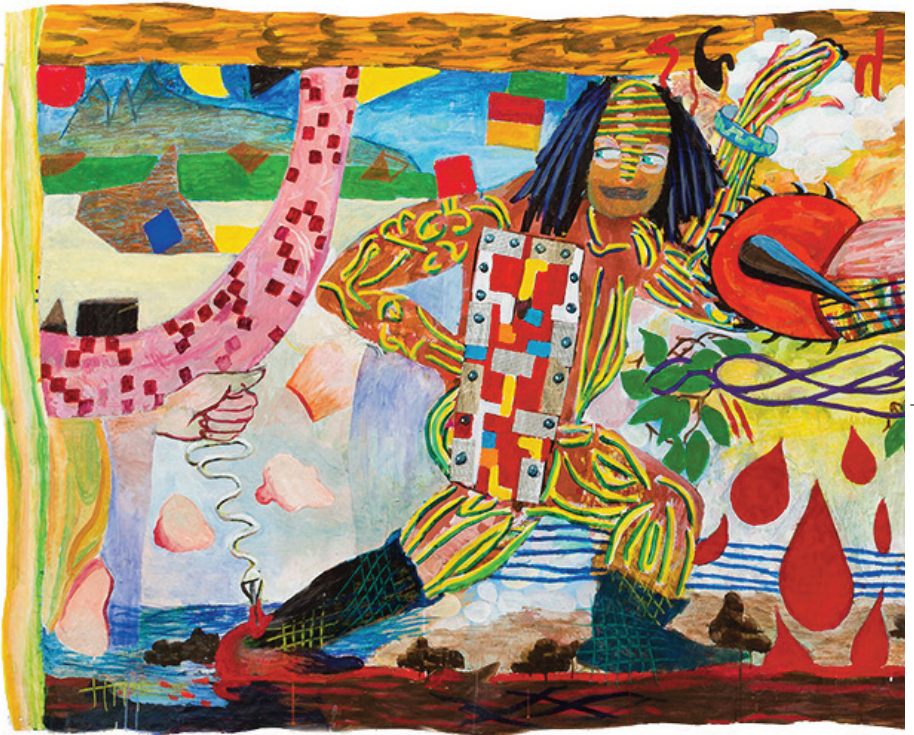
Outside the Gates , 2013, acrylic on paper, 57 x 139 in. (144.78 x 353.06 cm)