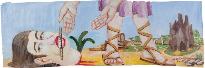
Now She Can't Curse Us , 2014, acrylic on paper, 15 3/4 x 48 in. (40.01 x 121.92 cm)