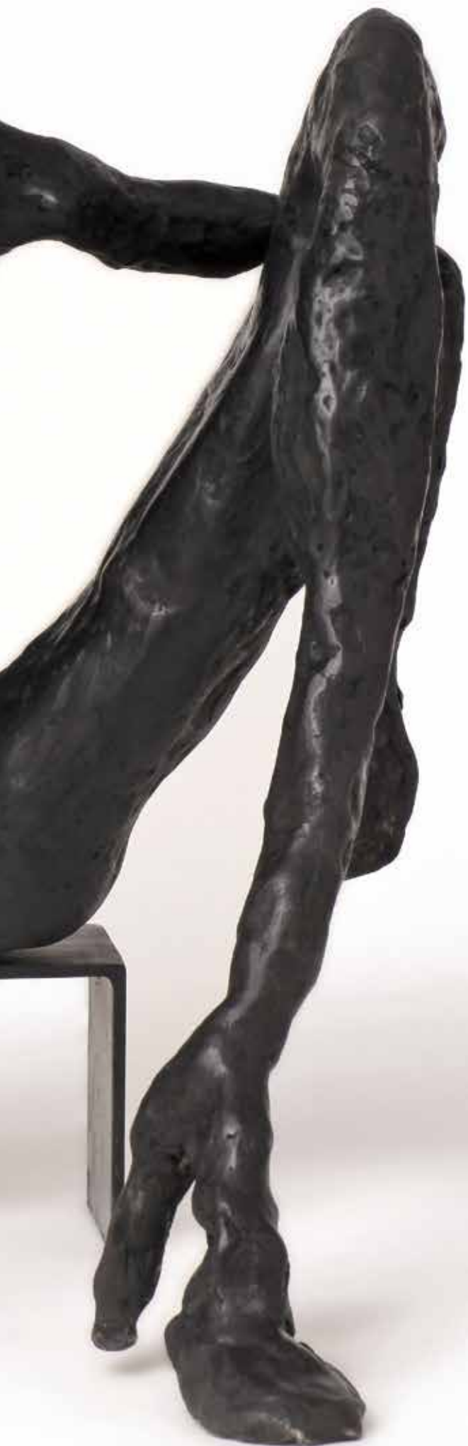
Spidergirl 2013, Bronze with Polished Black Patina and Stainless Steel, 42×43×32