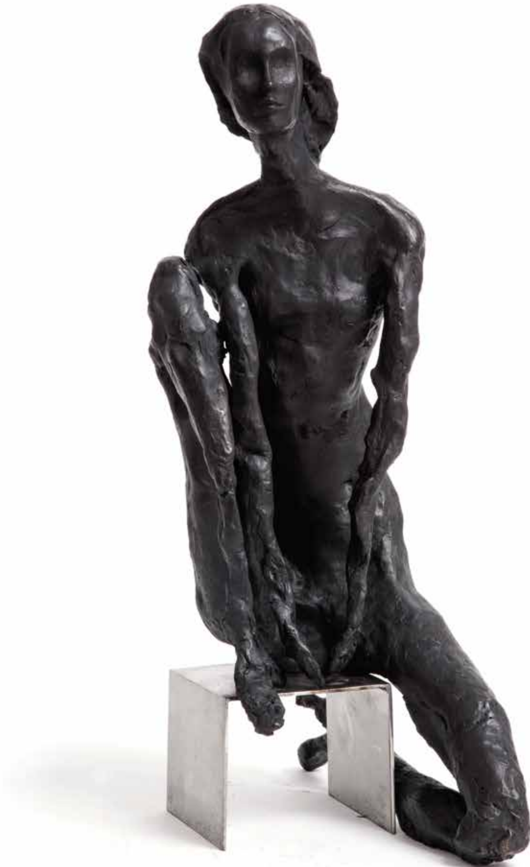
Giacometti's Granddaughter as a Supermodel (sitting 2)

2013, Bronze and Polished Black Patina, and Stainless Steel, 60x25x20