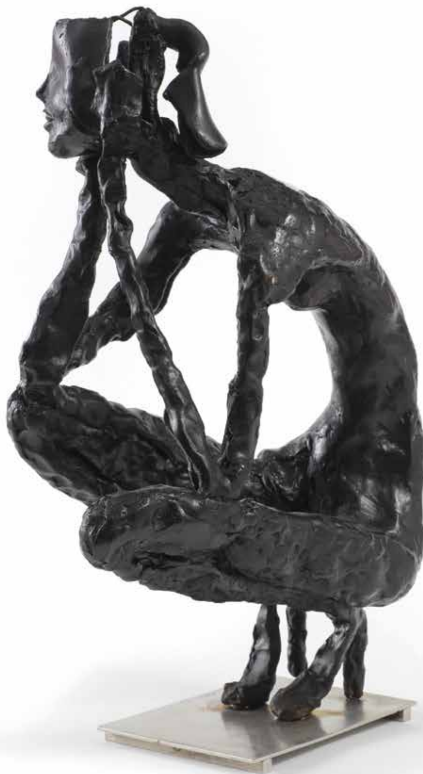
Giacometti's Granddaughter as a Supermodel (sitting)

2013, Bronze with Polished Black Patina and Stainless Steel, 55×20×35