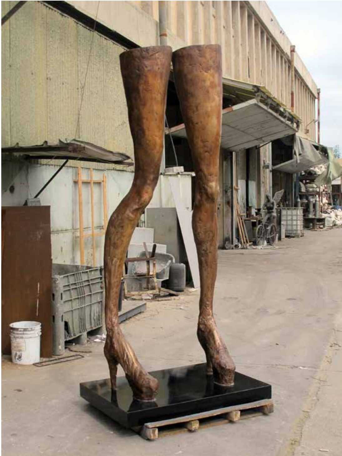
Giacometti's Granddaughter as a Supermodel (large legs) 2013, Bronze with Polished Gold Patina and Stainless Steel, 265×120×83