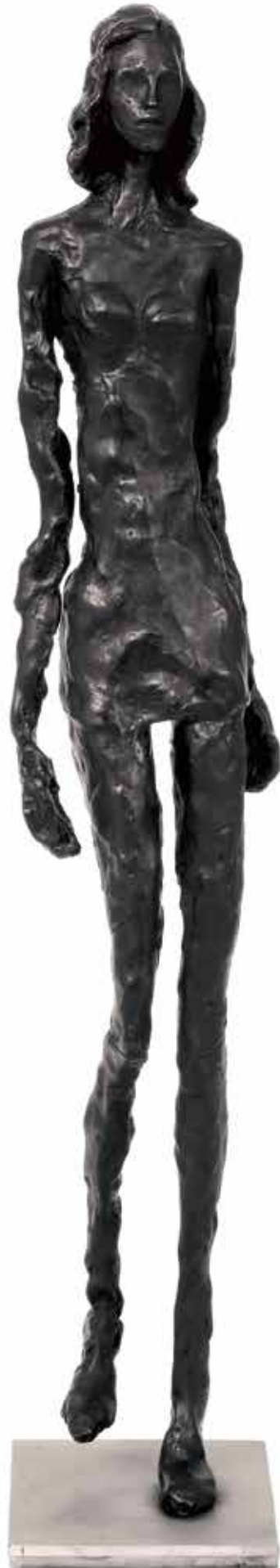
Giacometti's Granddaughter as a Supermodel (catwalk)

2012, Bronze with Polished Black Patina and Stainless Steel, 78×17×13