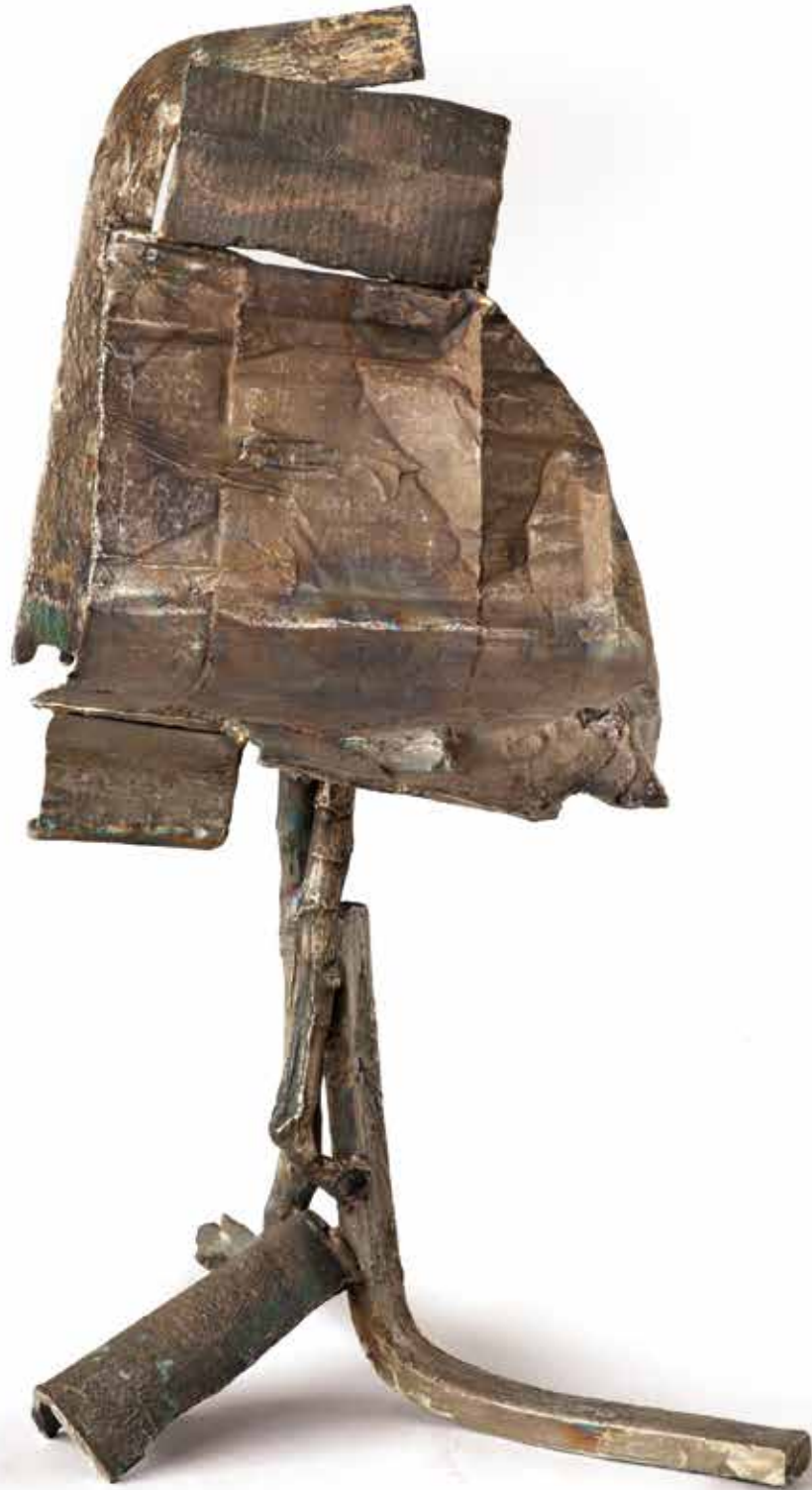
Chair 4 2014, Bronze, 80x40x40