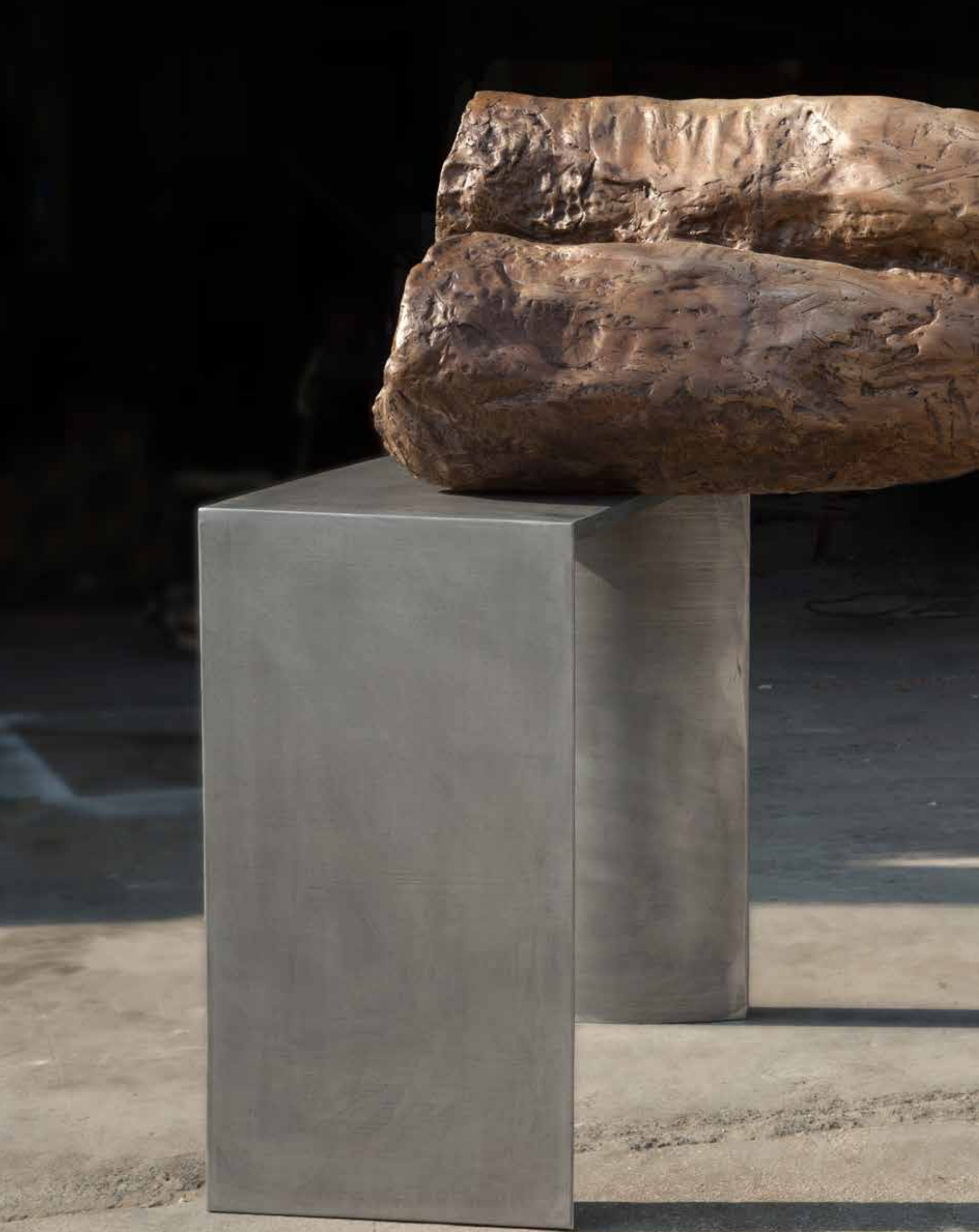
Giacometti's Granddaughter as a Supermodel (large legs, sitting) 2013, Bronze with Polished Gold Patina and Stainless Steel, 140x210x110