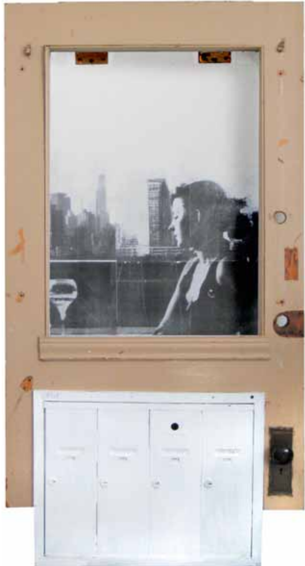
Away From It All , 2009 Mixed media on found door 61 x 32 x 7 in. (154,9 x 81,3 x 17,8 cm)