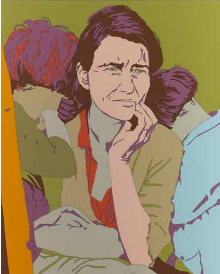
Dorothea Lange “Destitute peapickers in California; a 32-year-old mother of seven children” (reversed), 2010 Acrylic on canvas, 71 x 57 in. (180,3 x 144,8 cm) Courtesy of the artist, Vienna, Austria