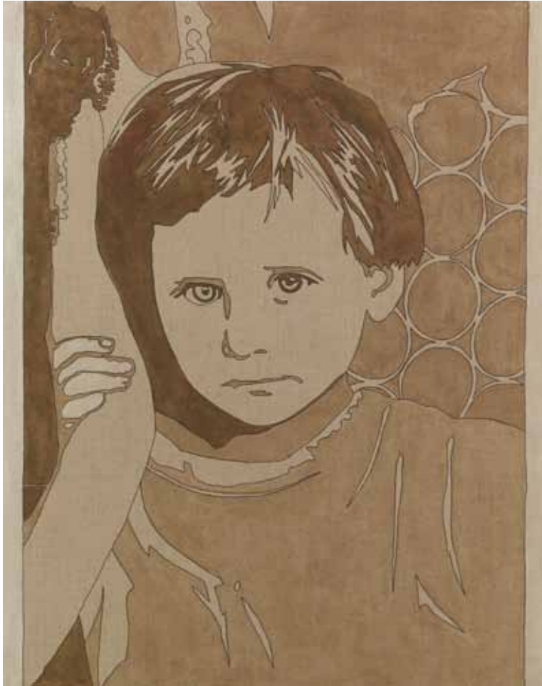
Walker Evans “Laura Minnie Lee Tenge”, 2009 Acrylic on linen, 39 x 31 in. (99,1 x 78,7 cm) Courtesy of the artist, Vienna, Austria