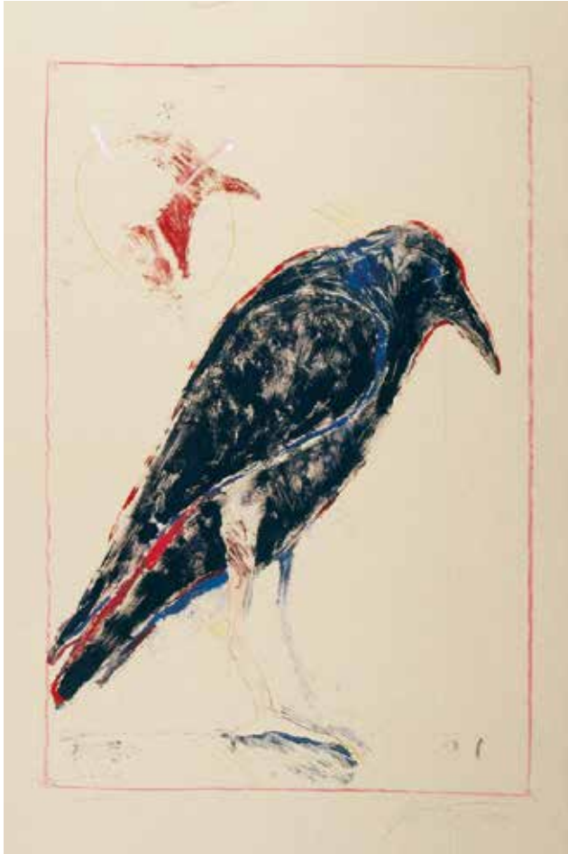
Crow Waiting , 1992

Monotype, pastel on paper, 48 x 34 in. (121,9 x 86,4 cm)