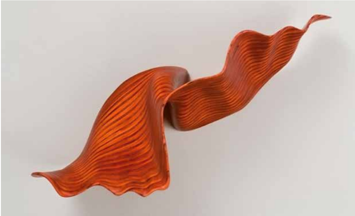
Autumn Leaf 2 , 2008. Laminated plywood, aniline dye, 14 x 17 x 9 in. (35,6 x 43,2 x 22,9 cm)

Acclaimed contemporary sculptor Nancy Sansom Reynolds creates minimal, abstract sculptures from laminated plywood, cast bronze, resin, and aluminum. Her unique sculptures and large-scale commissions have been displayed throughout the United States, Europe, Asia, and Africa, and are in numerous public and private