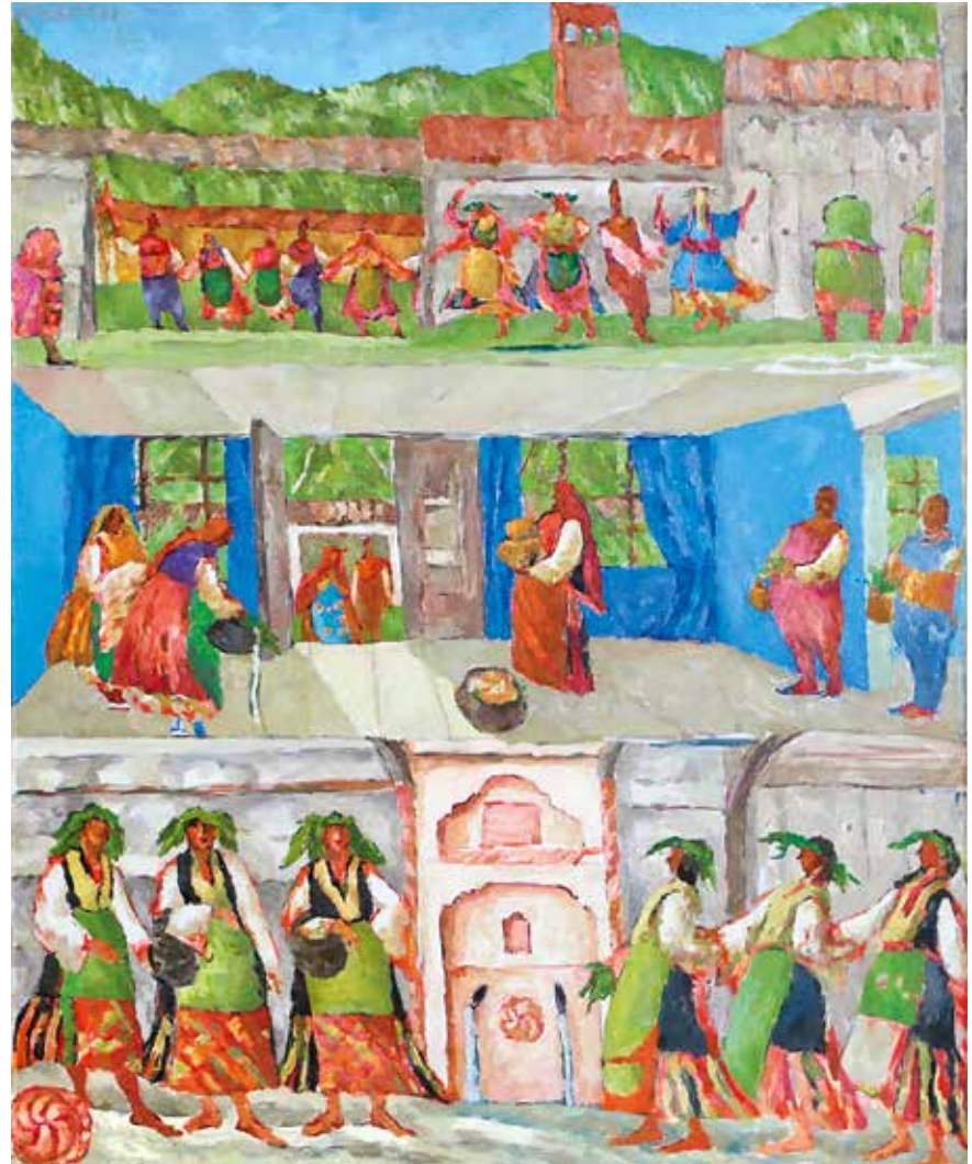
Wedding , undated Oil on canvas 28 1/16 x 23 5/8 in. (72,8 x 60 cm) Courtesy of the artist, Sofia, Bulgaria