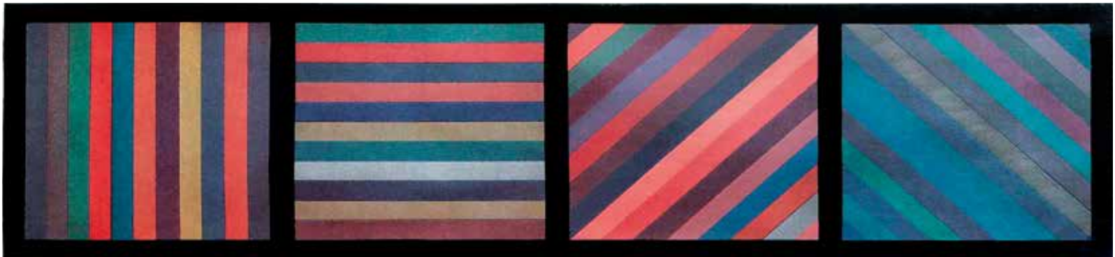
4 Squares, Various Colors , undated Color lithograph, 10 ½ x 28 in. (26,7 x 71,1 cm)

Sol LeWitt was an American artist born on September 9, 1928, in Hartford, Connecticut. He produced his first prints while in college in the late 1940s. LeWitt then moved to New York City in 1953 to study at the Cartoonists and Illustrators School (currently the School of Visual Arts) and worked for Seventeen Magazine . He progressed to a job at the Museum of Modern Art in New York. LeWitt helped launch conceptual art and minimalism of the Post-War era by using basic shapes and colors to create drawings and structures. From the 1960s through the 1990s prominent museums displayed his works. LeWitt died on April 8, 2007, in New York City.