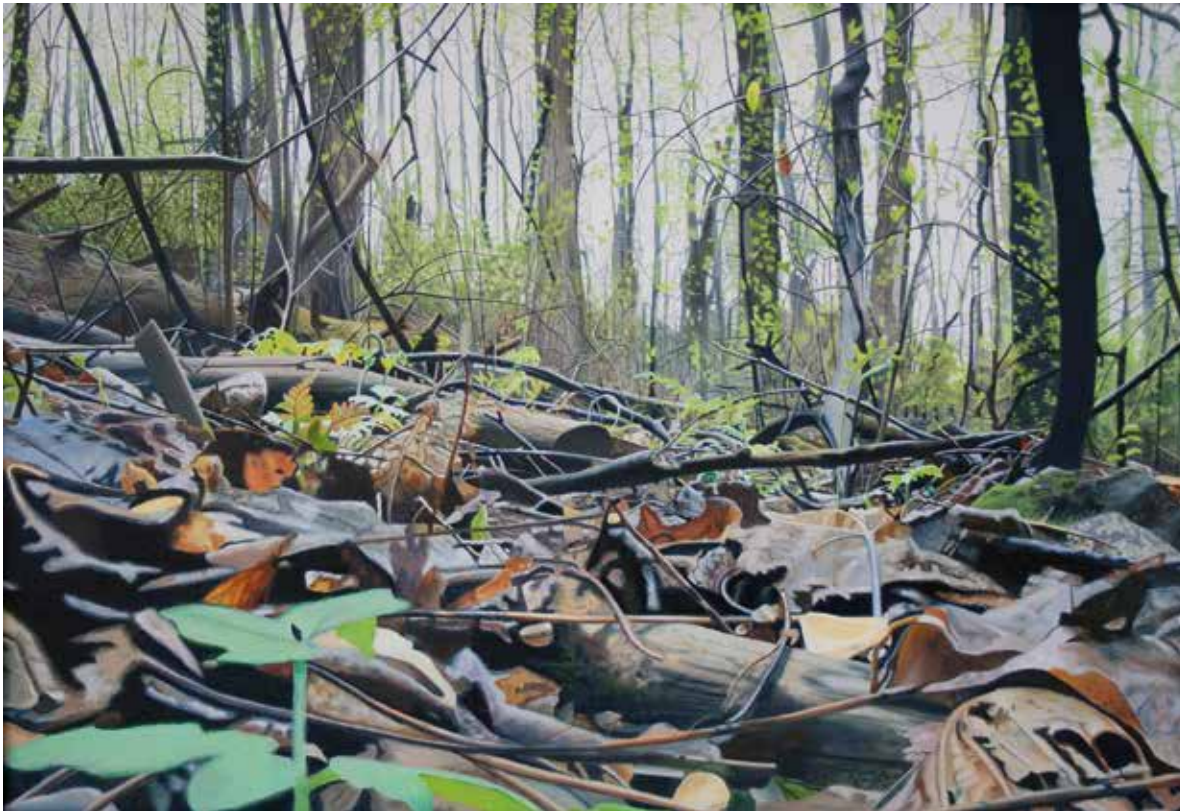
Forest Floor , 2012 Oil on canvas 23 x 33 in. (58,4 x 83,8 cm)