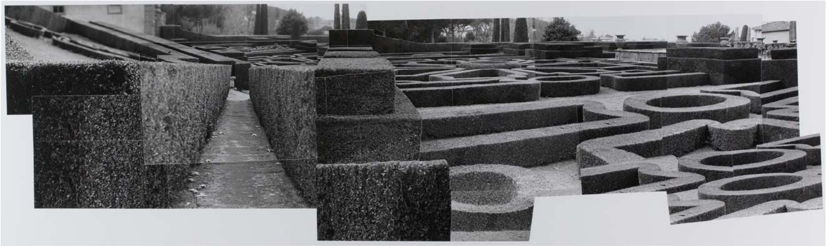
Untitled (Garden), 1997-2006 Gelatin silver print collage, 41 1/4 x 100 1/8 in. (104,8 x 254,3 cm)