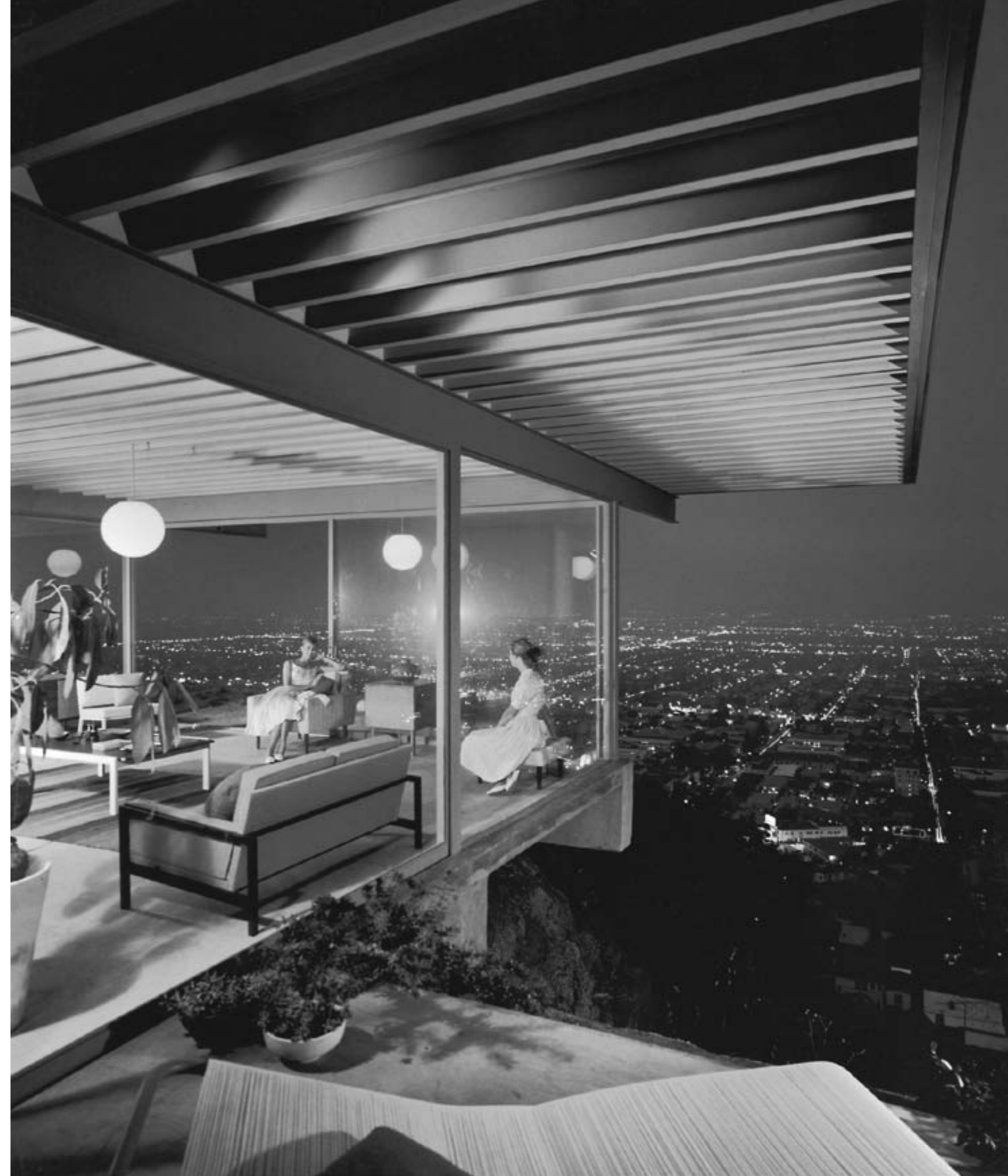
Next page: Chuey House , 1958 (printed later) Gelatin silver print, 20 x 16 in. (50,8 x 40,6 cm)