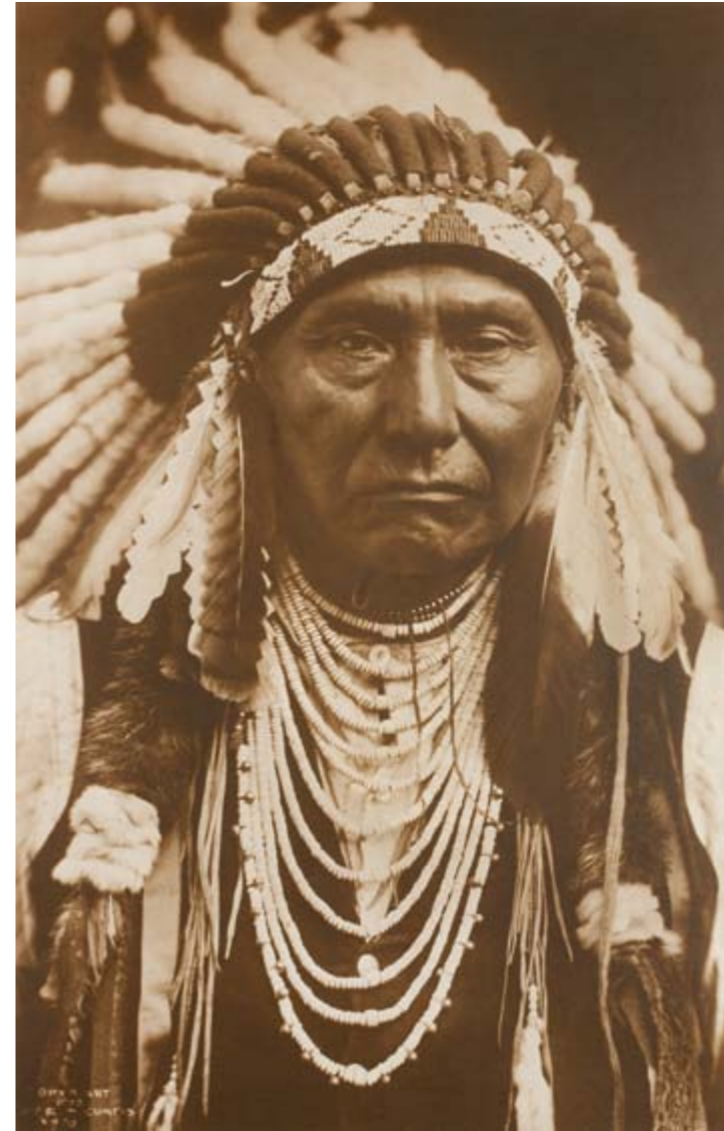
Chief Joseph Sepia toned print (contemporary edition) 22 x 18 in. (55,9 x 45,7 cm)