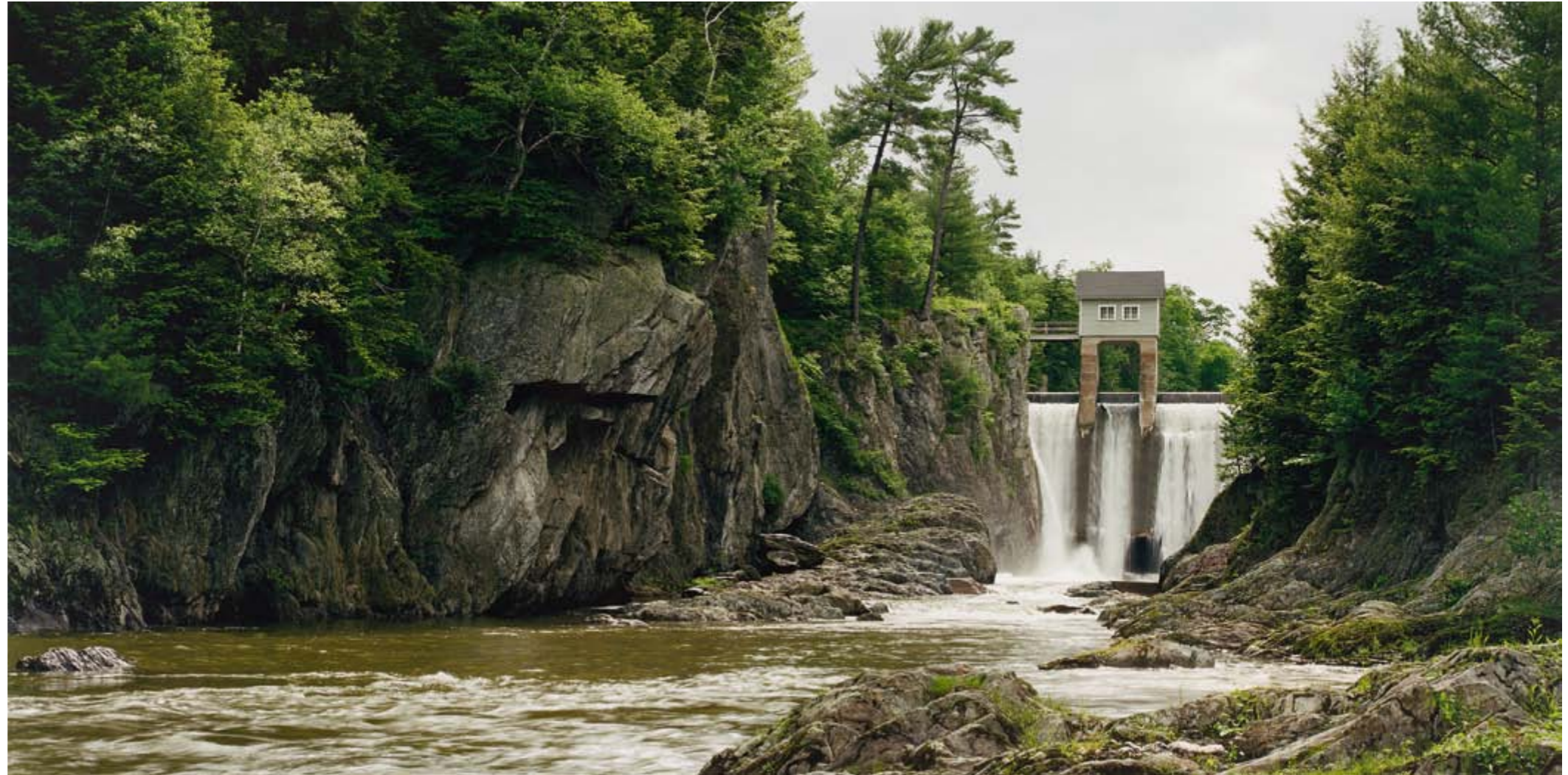
Green Mountain Power Corporation, Winooski River, Vermont, 1989 Ultrachrome print, 43 x 78 in. (109,2 x 198,1 cm).

Pfahl received a Bachelor of Fine Arts degree and a Master of Fine Arts degree from Syracuse University in 1961 and 1968, respectively, and he currently teaches and resides in Buffalo, New York. His work has been widely exhibited and is held in numerous prestigious private and museum collections, including The Museum of Modern Art in New York City and the Art Institute of Chicago in Illinois.