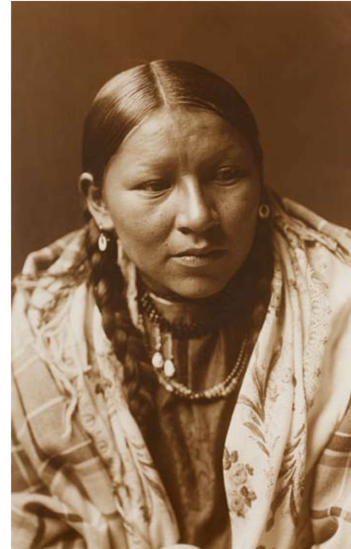
Young Woman – Cheyenne Sepia toned print (contemporary edition) 22 x 18 in. (55,9 x 45,7 cm)