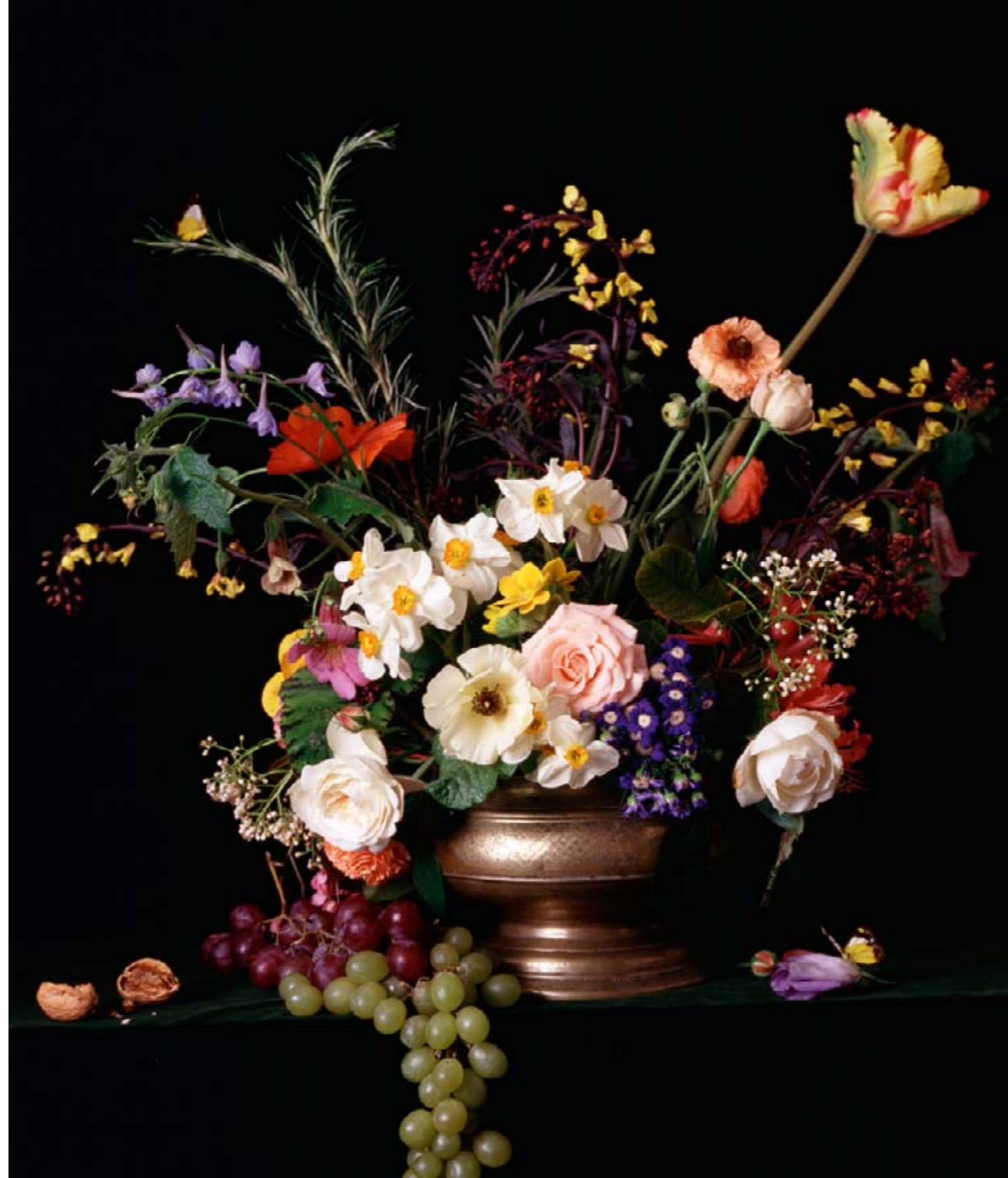
Still Life with Flowers, 1986 Cibachrome print, 51 1/4 x 41 1/4 in. (130,2 x 104,8 cm)