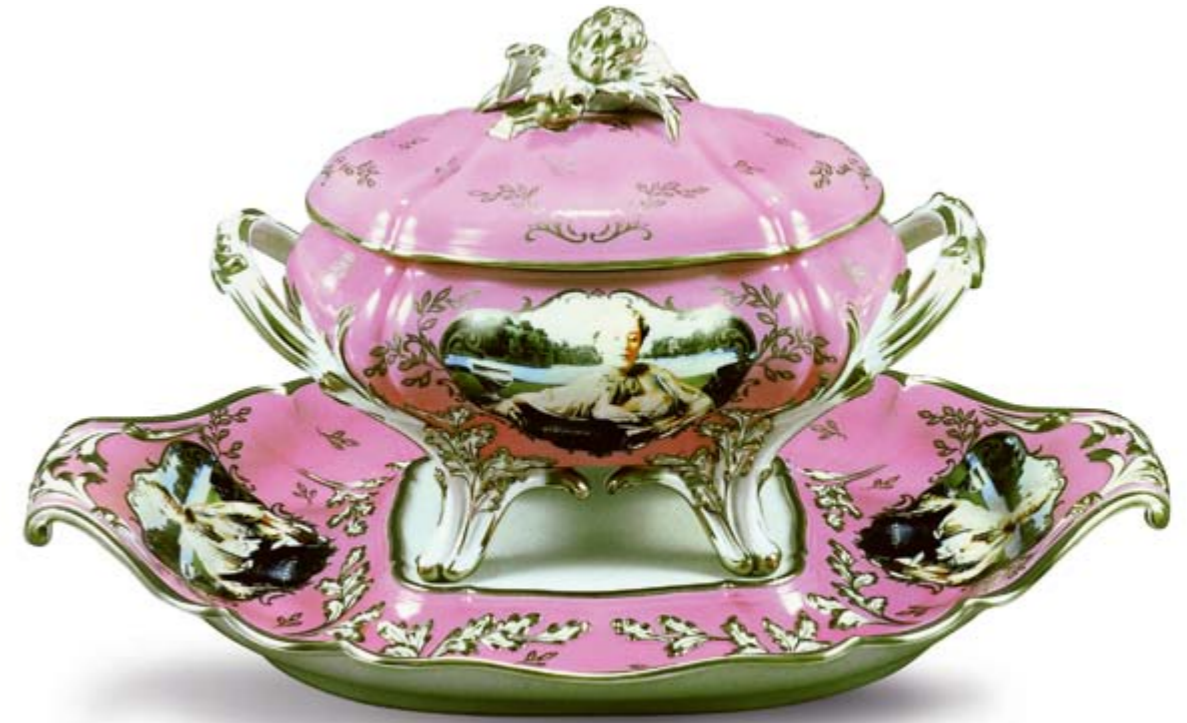
Madame de Pompadour (née Poisson) [Edition No. AP/1], 1991 Porcelain, soup tureen with accompanying platter (Rose). Courtesy of Artes Magnus, Inc., New York, New York

About her work, Cindy Sherman has said: "I've never thought of any of this work as some long expos about self-portraiture. I really think of them all as different people – each one is a different character. Even though I can remember back to the day when I was shooting ... it still seems like somebody else. That's really what I'm looking for, that's what [is] in my mind when choosing an image. What makes it successful is when I suddenly don't sense anything about myself in that image."