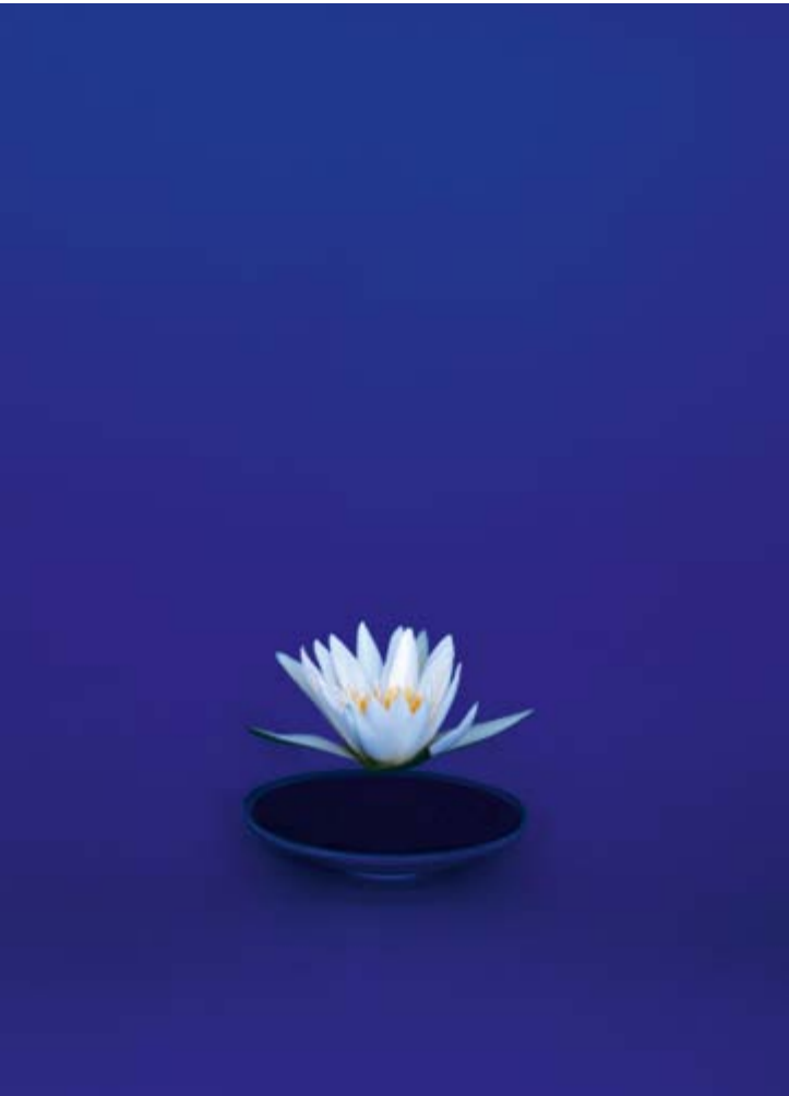
Lotus Bowl, 2002 Laminated Fuji crystal archive print 41 1/2 x 31 1/2 in. (105,4 x 80 cm)

Like the photographs of her contemporaries Laurie Simmons, Sherri Levine, and Cindy Sherman, Sarah Charlesworth's work is associated with the 1980s' 'art appropriation' movement. That is, these artists revisit and appropriate objects or scenes – often from mass media sources – that define so much of our shared culture. For example, Still Life with Flowers from her Doubleworld Series , is a traditional subject taken out of its context or era.