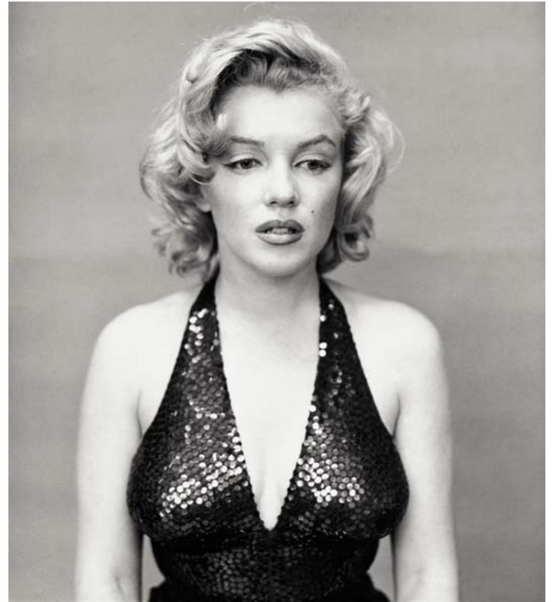
Marilyn Monroe, actor, New York, May 6, 1957 Gelatin silver print, 18 \frac{3}{4} x 15 \frac{3}{4} in. (47.6 x 40 cm).