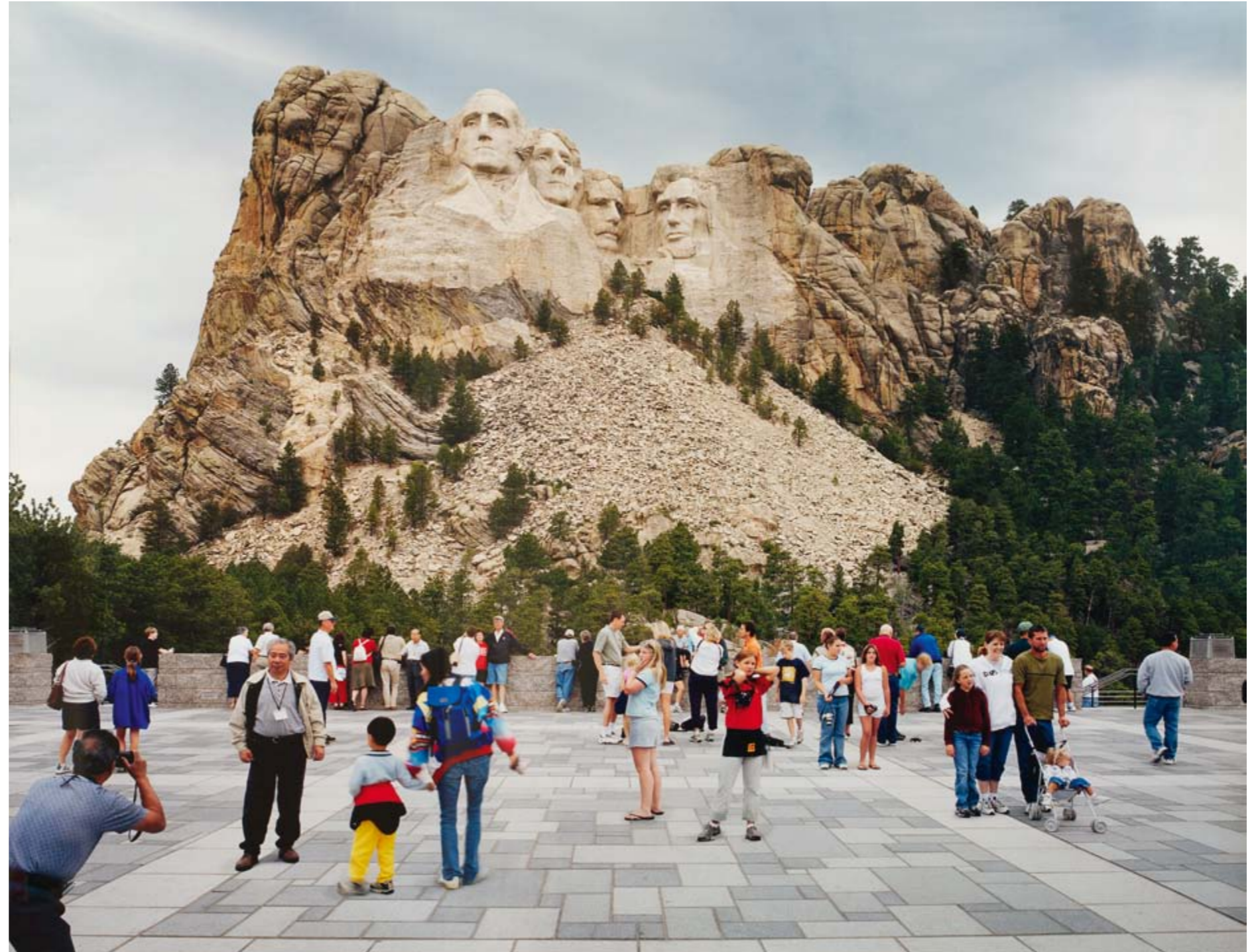
Mt. Rushmore, 2004 Digital C-print, 48 x 63 in. (121,9 x 160 cm)