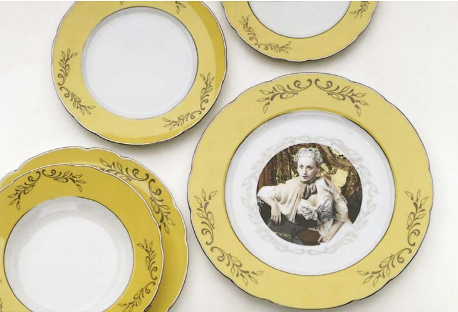
Madame de Pompadour (née Poisson), 1991 Porcelain, set of four presentation plates (Yellow), dimensions vary