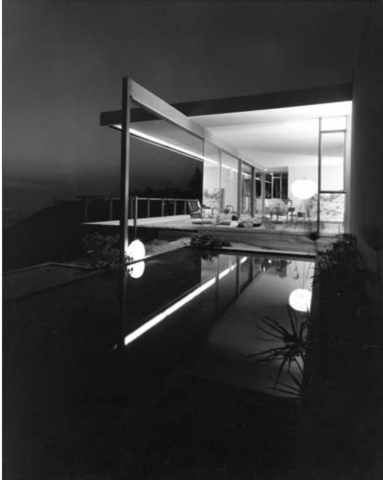
Case Study House #22 , 1960 (printed later) Gelatin silver print, 20 x 16 in. (50,8 x 40,6 cm)

Julius Shulman's photography was instrumental in crafting the image of the mid-century Southern California lifestyle across the United States and around the world. His work keenly identifies the distinctive structural, functional, and design elements of a building, in the context of both its natural surroundings and the people who occupy the spaces. This sensitivity, combined with his intuitive and brilliant sense of composition and timing, has earned him the reputation as a master of the genre.