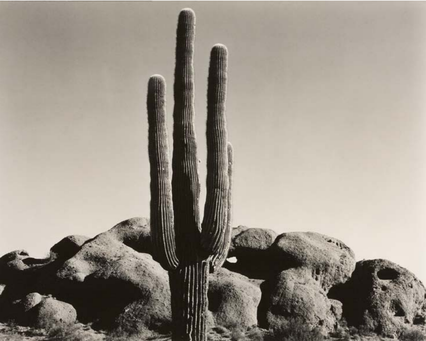
Saguaro, Arizona, 1938. Gelatin silver print, 8 x 10 in. (20,3 x 25,4 cm).