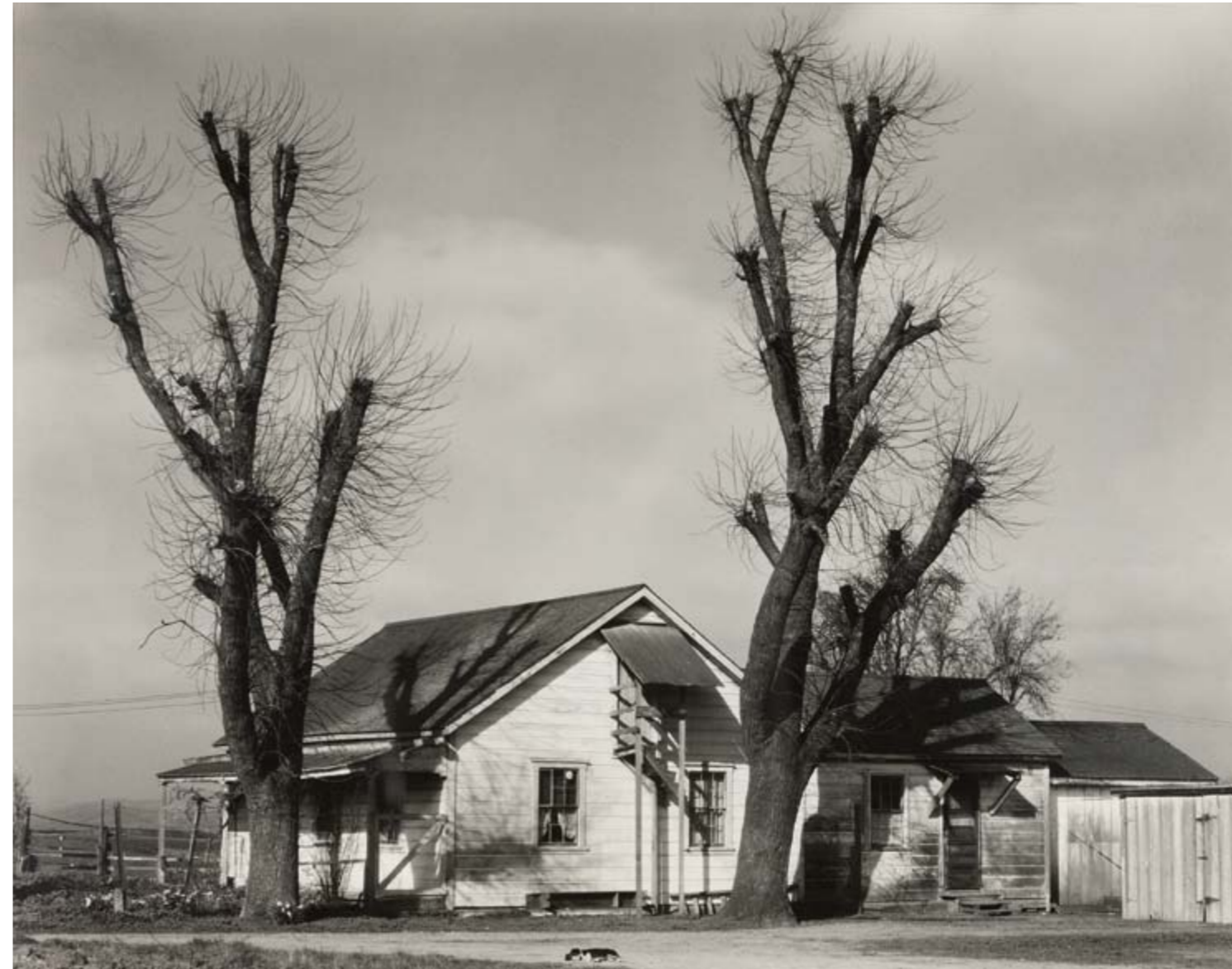
Ranch House , 1934. Gelatin silver print, 8 x 10 in. (20,3 x 25,4 cm).

The thirty-six photographs on display in the Residence are from a series known as the Project Prints , which date from the mid-1950s to his death. Weston suffered from Parkinson's disease but oversaw the printing of these images by his sons Cole and Brett Weston. Edward Weston's photographs are found in major museum collections worldwide. The Center of Creative Photography in Tucson, Arizona, houses the complete archive of Weston's work.