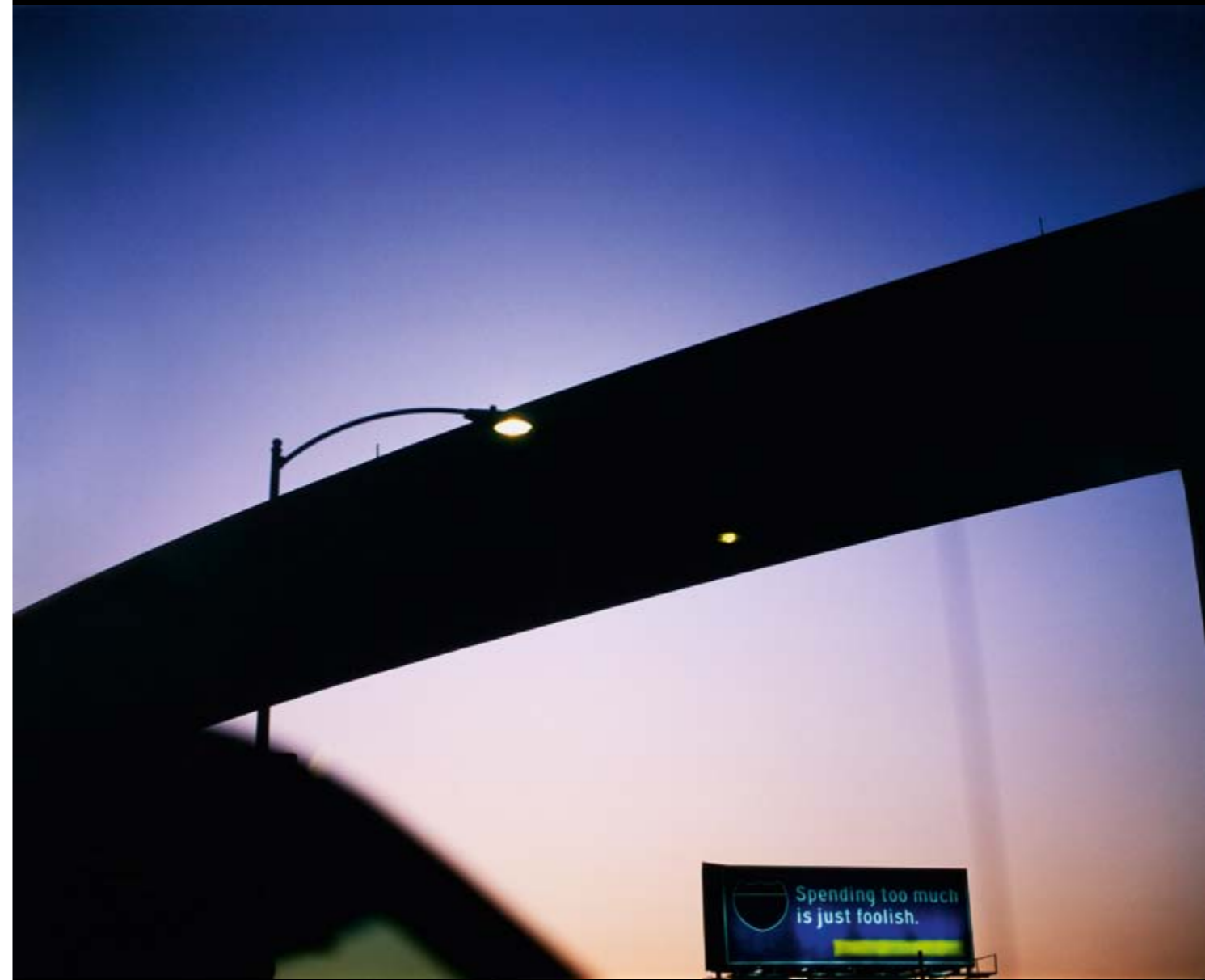
Distant Sign , 2005. C-print on aluminum, 48 x 60 ½ in. (121,9 x 153,7 cm).