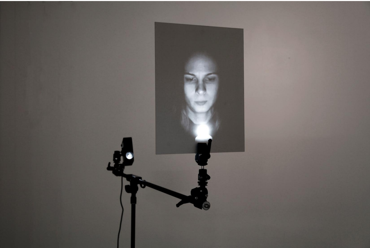
Candle - Microphone Stand. 2017 120 × 80 cm Antique microphone stand, projector, acrylic board and mixed media Ref. BL-09