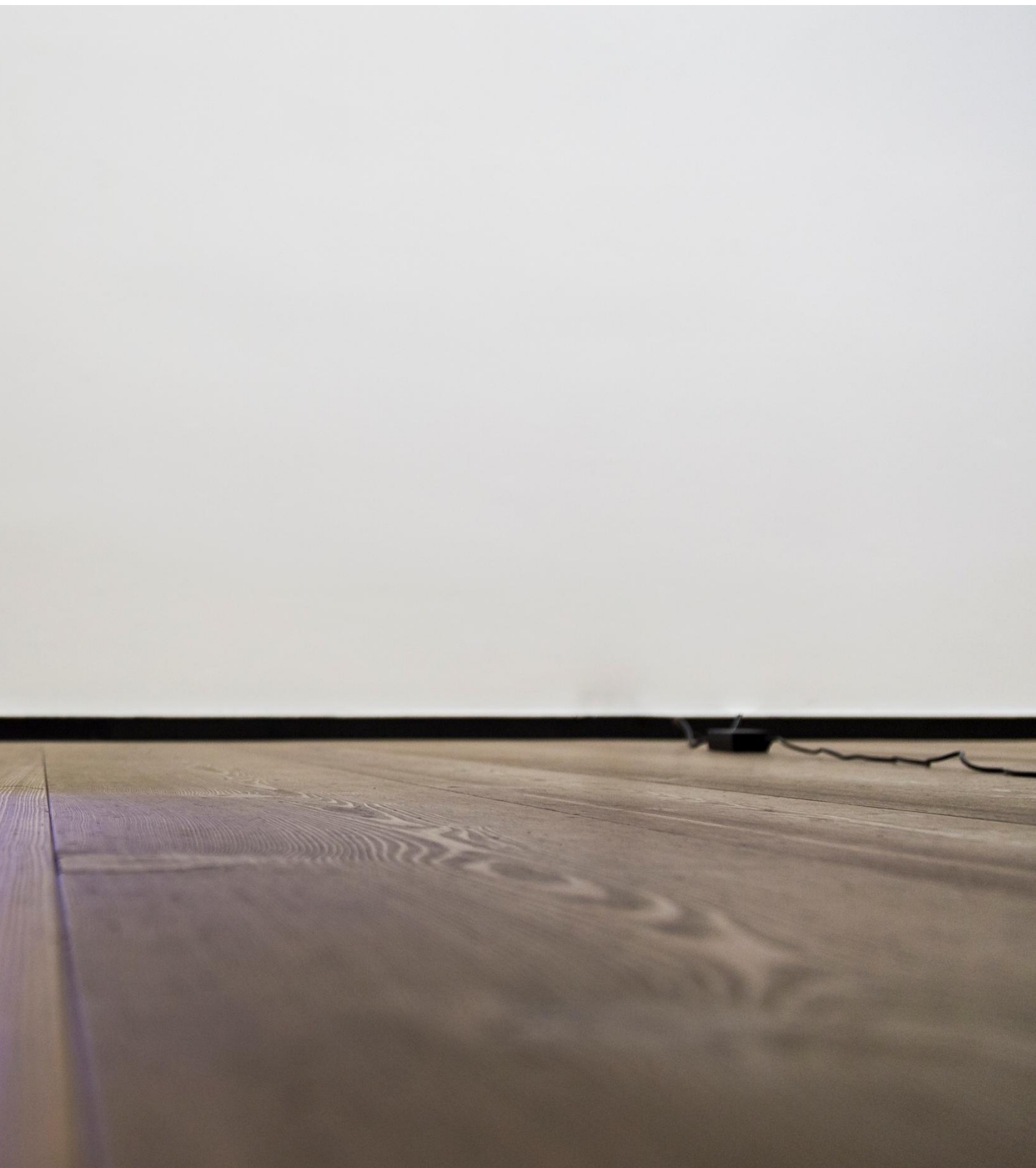
Paper in the Wind. 2015 Movie, old japanese book (yamato-koji) and projector. 37.2 × 30.5 × 4 cm. Edition 5/10 Ref. BL-07