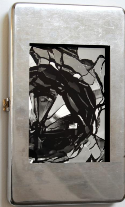
Broken Mirror – Medical box. 2017 Unique antique medical box, movie and mixed media 18 x 27x 2.3 cm Ref. BL-10