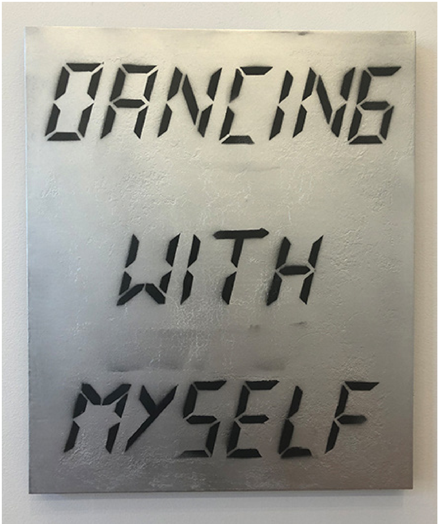
Dancing in 2020 Part II, 2020 Spraypaint on wood 60 x 50 cm