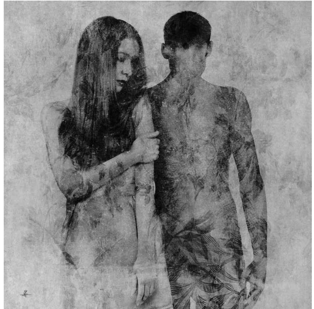
GIVE ME A SIGN, 2014 | 1/3 + A.P Photography & Computer Graphic 100 x 100 cm