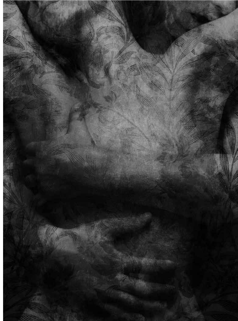
STAY WITH ME, 2014 1/3 + A.P Photography & Computer Graphic 136 x 100 cm