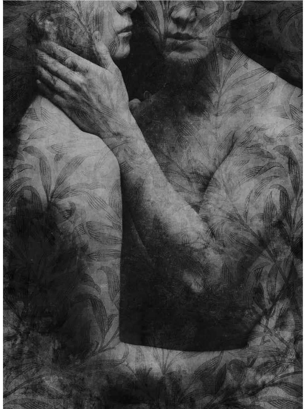
PASSION 2014 | 1/3 + A.P Photography & Computer Graphic 136 x 100 cm