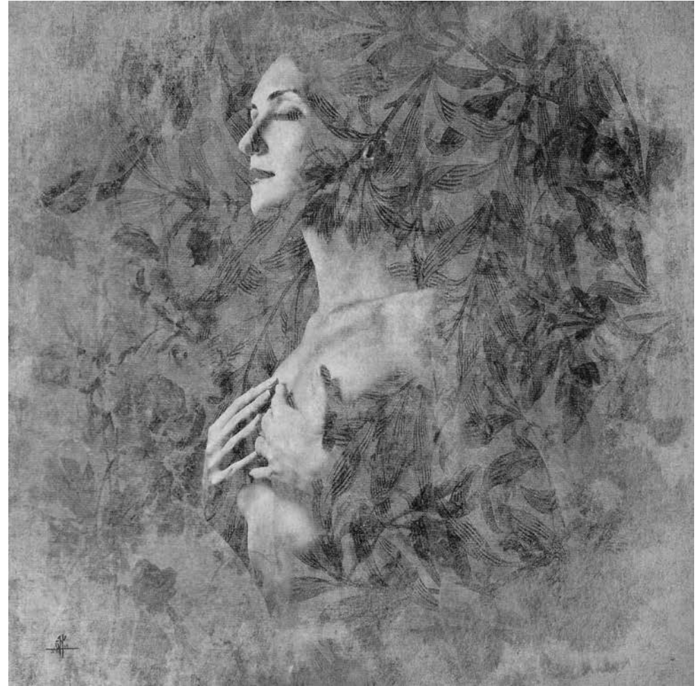
RELIEF, 2014 | 1/3 + A.P Photography & Computer Graphic 100 x 100 cm