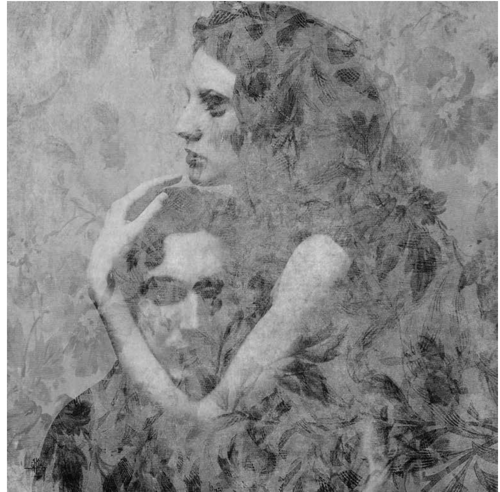
MINE, 2014 | 1/3 + A.P Photography & Computer Graphic 100 x 100 cm