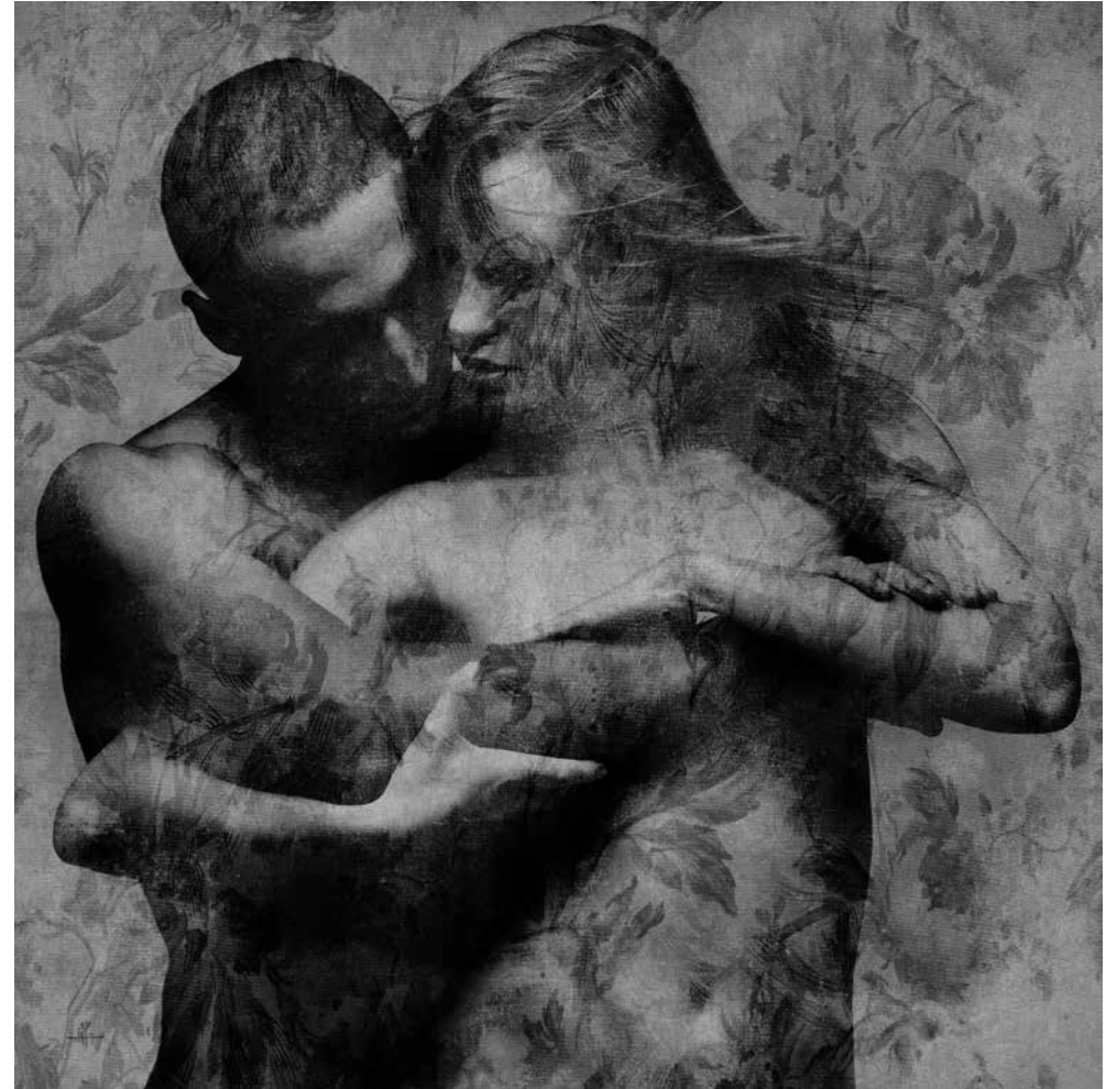
EMBRACE, 2014 1/3 + A.P Photography & Computer Graphic 100 x 100 cm