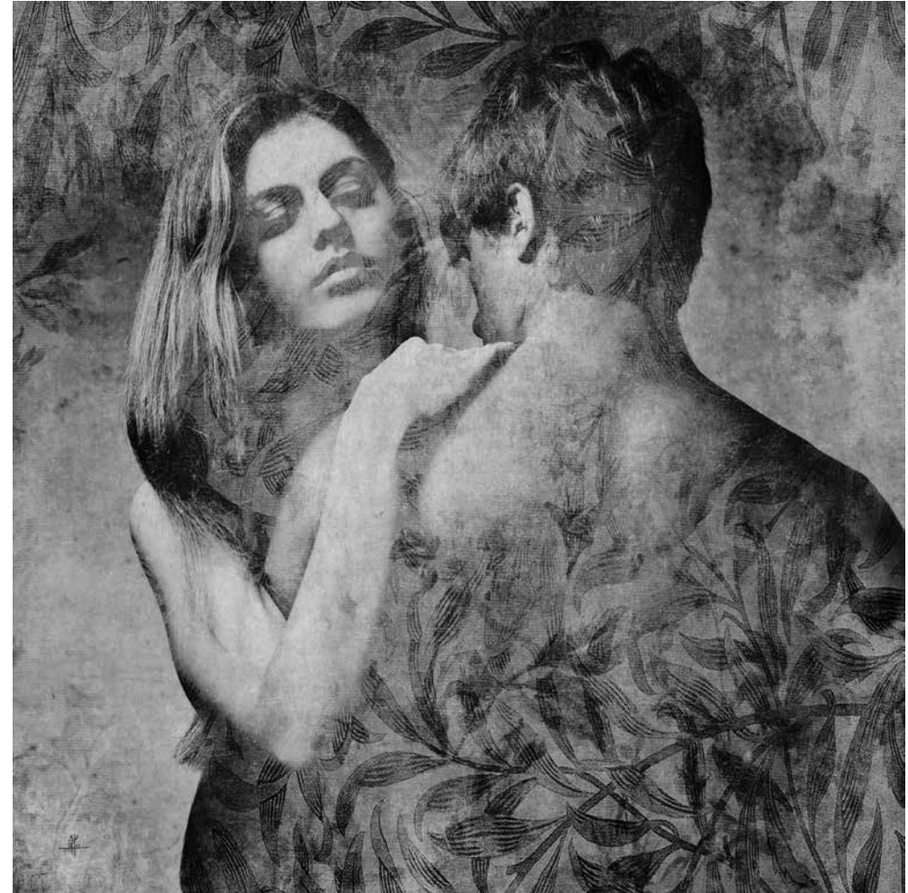
I AM YOURS, 2014 1/3 + A.P Photography & Computer Graphic 100 x 100 cm