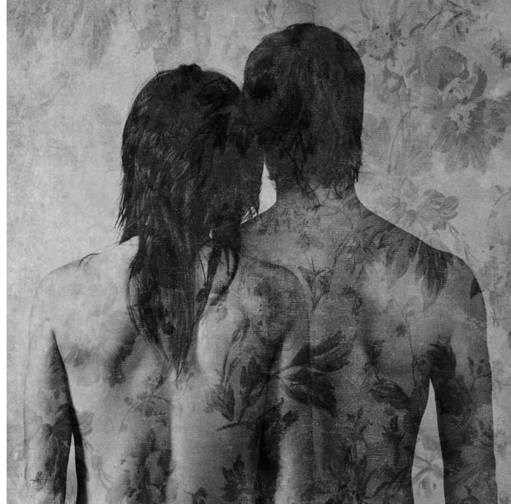
EMERGE, 2014 | 1/3 + A.P Photography & Computer Graphic 100 x 100 cm