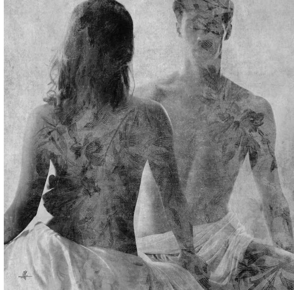
NEVER TOO LATE, 2014 | 1/3 + A.P Photography & Computer Graphic 100 x 100 cm