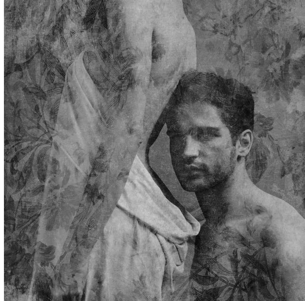
SOMEBODY THAT I USED TO KNOW, 2014 1/3 + A.P Photography & Computer Graphic 100 x 100 cm