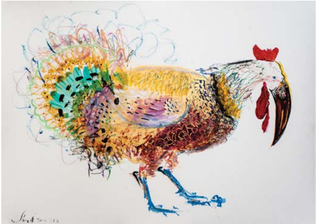
Vahid Sharifian / A Real Handmade Bird / 2013 / mixed media on paper / 50x70 cm