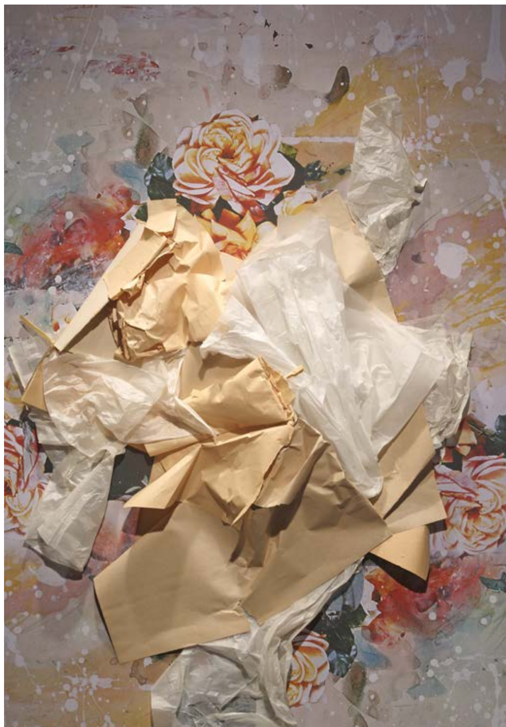
Fereydoun Ave / Untitled / 2013 / inkjet print on canvas + various papers / 151x114x13 cm