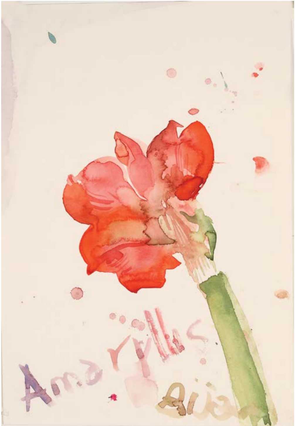
Bijan Saffari / Untitled / 2001 / watercolor on paper / 54x25 cm