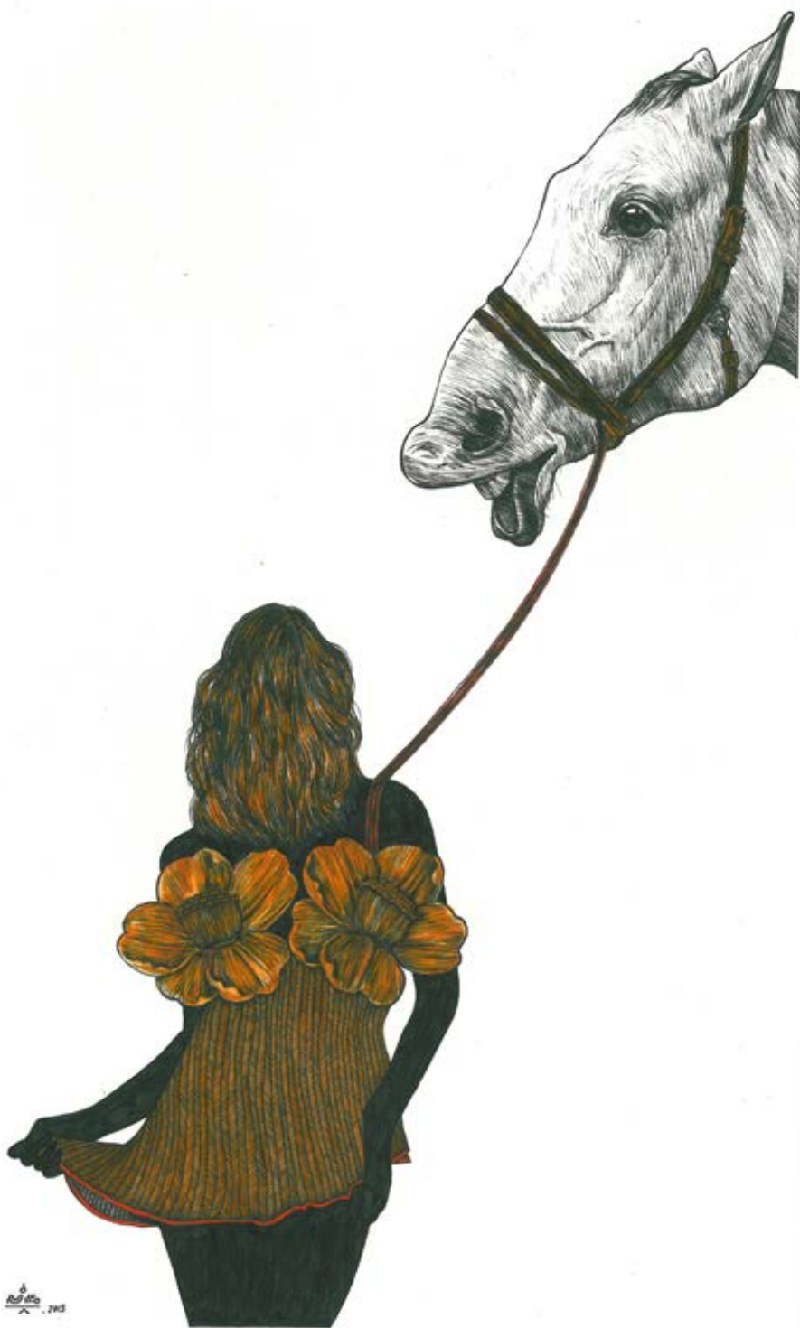
Mohsen Ahmadvand / The Horse / 2013 / sharp pen and ink on paper / 40x25 cm