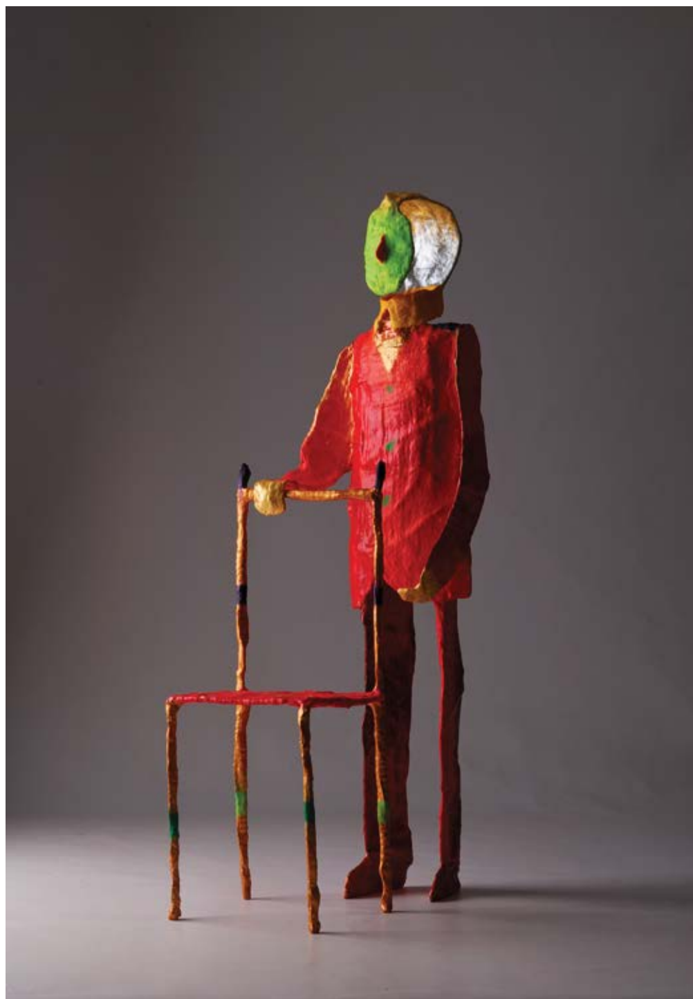
Farshid Mesghali / Man and Chair / 2005 / papier mâché / 60x30x20 cm