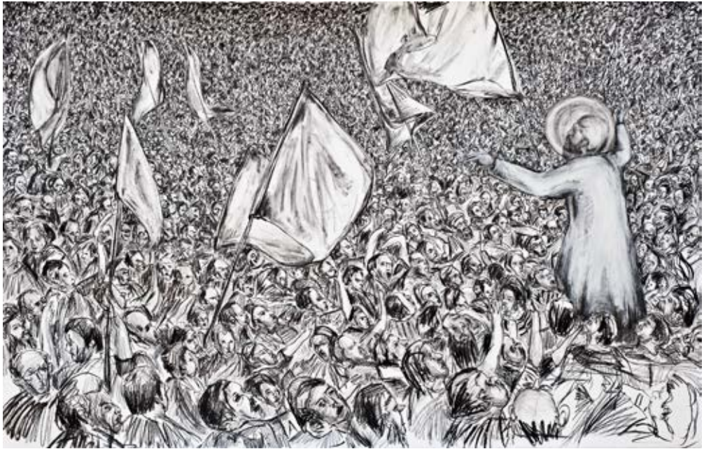
Ramtin Zad / Emersion (Second Coming) No. 1 / 2013 / graphite on paper / 95x148 cm