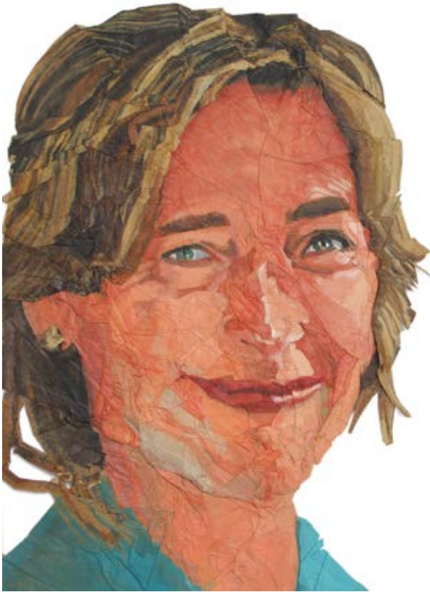
Mohammad Hamzeh / Untitled / 2013 / acrylic on paper / 60x90 cm