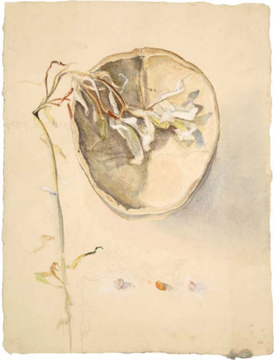
Shahla Hosseini Barzi / Untitled / 1990 / mixed media on paper / 31x24 cm