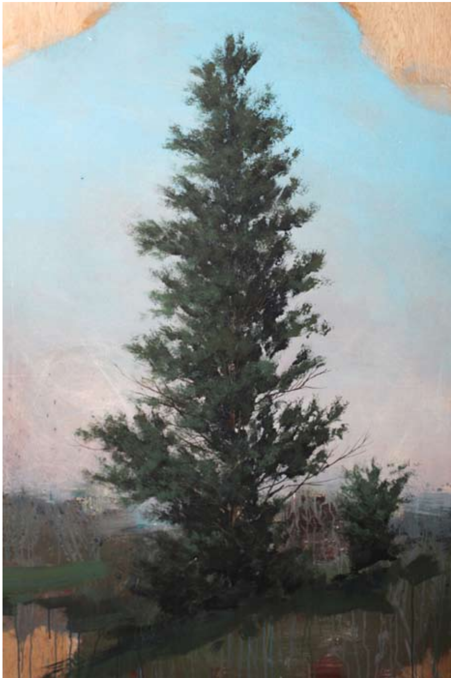
"FAUST", 2011, MM/PANEL/RESIN, 72" X 48"