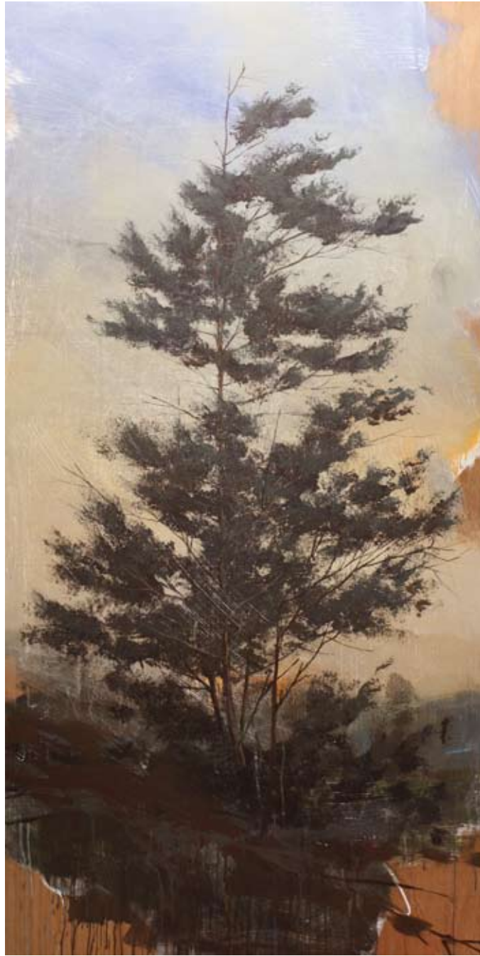
“CEDAR PATH”, 2011, MM/PANEL/RESIN, 72” X 36”