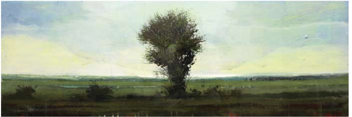
"PLAYER", 2011, MM/PANEL/RESIN, 16" X 48"