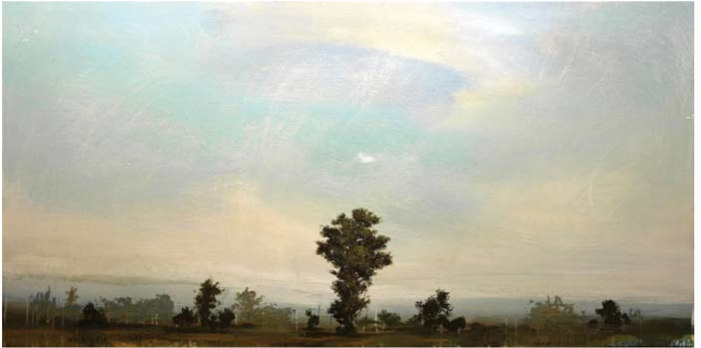
"MORNING (2)", 2011, MM/PANEL/RESIN, 36" X 72"