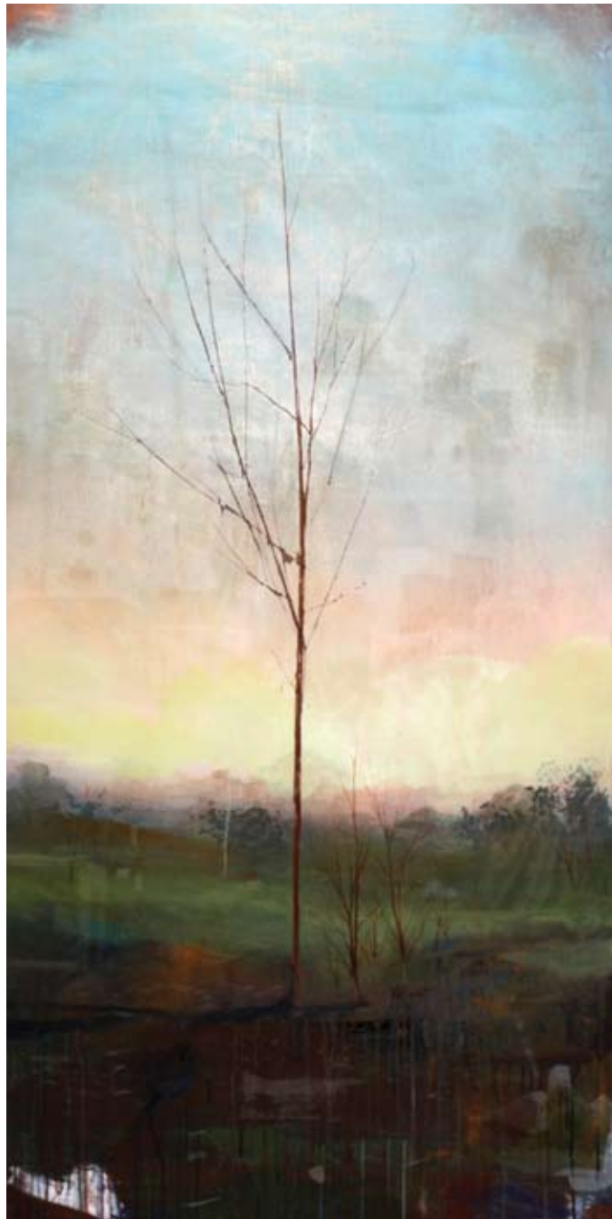
"GLENN", 2011, MM/PANEL/RESIN, 72" X 36"