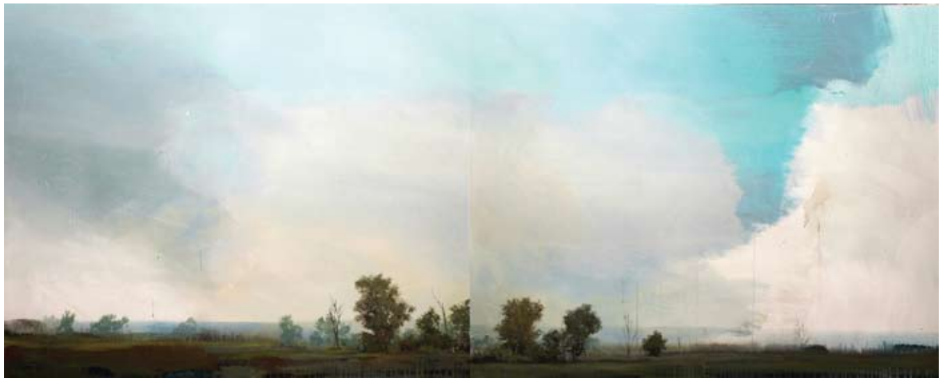
TOP: "COLLAGE", 2011, MM/PANEL/RESIN, 48" X 120" BOTTOM: "CHANNEL", 2011, MM/PANEL/RESIN, 48" X 120"