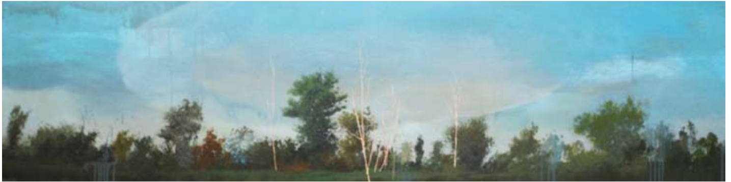
“ETAGE”, 2011, MM/PANEL/RESIN, 24” X 96”