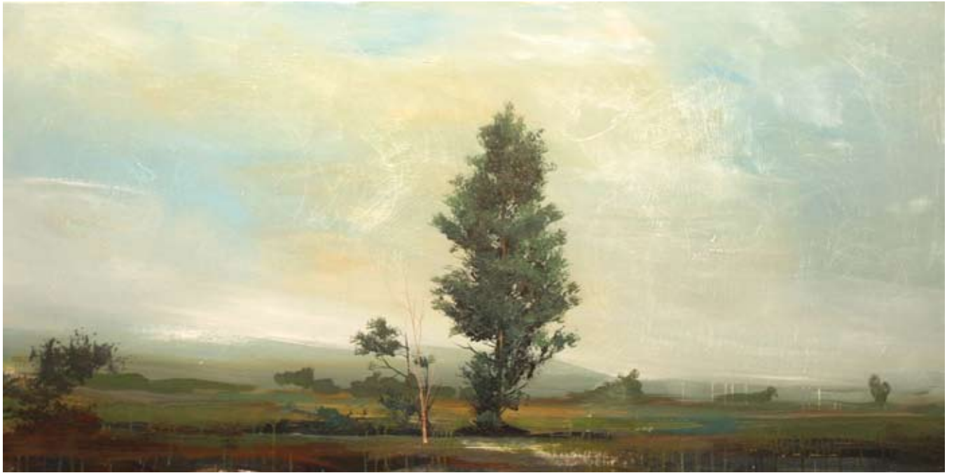
"MORNING (2) B", 2011, MM/PANEL/RESIN, 36" X 72"