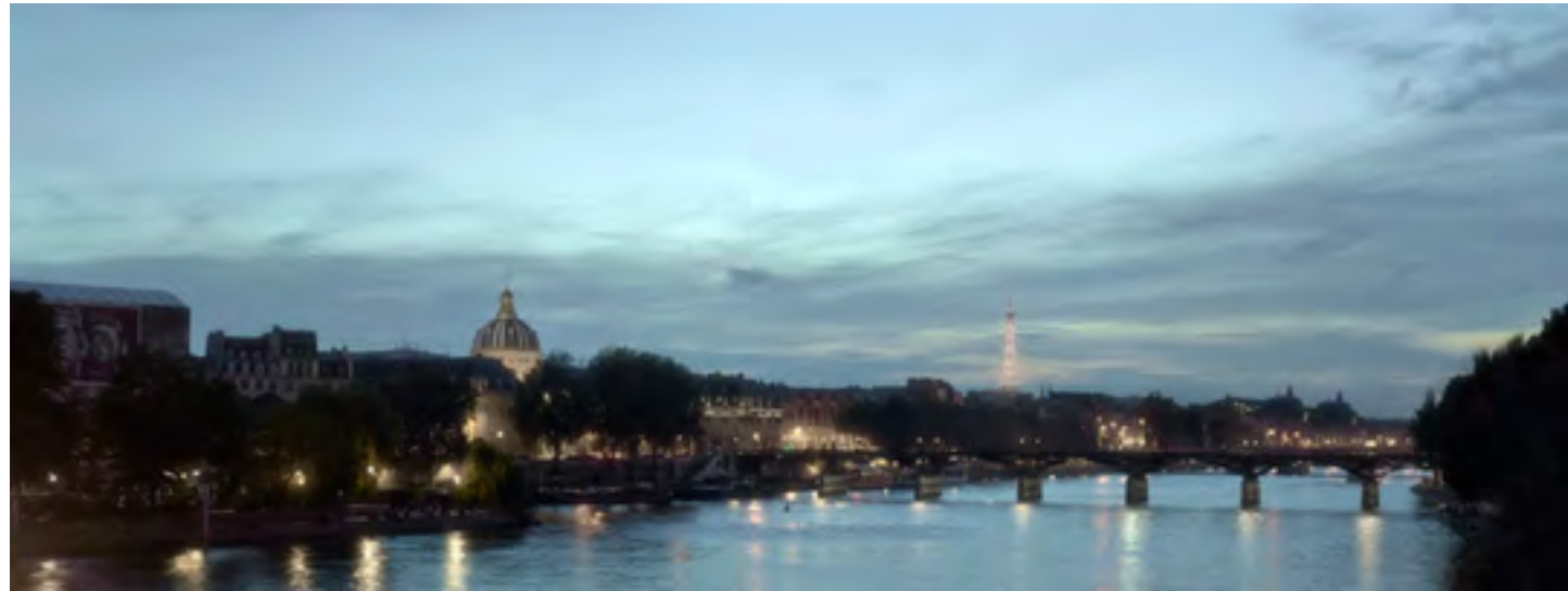
It Hasn't Hit Me Yet , 2013-14, ed/7 Photograph Face Mounted To Plexi 33 x 88 in.