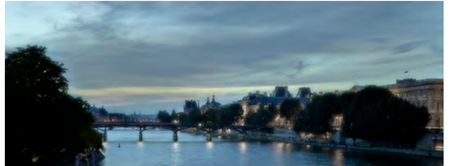
A Lover's Dream of Twilight , 2013-14, ed/7 Photograph Face Mounted To Plexi 33 x 88 in.