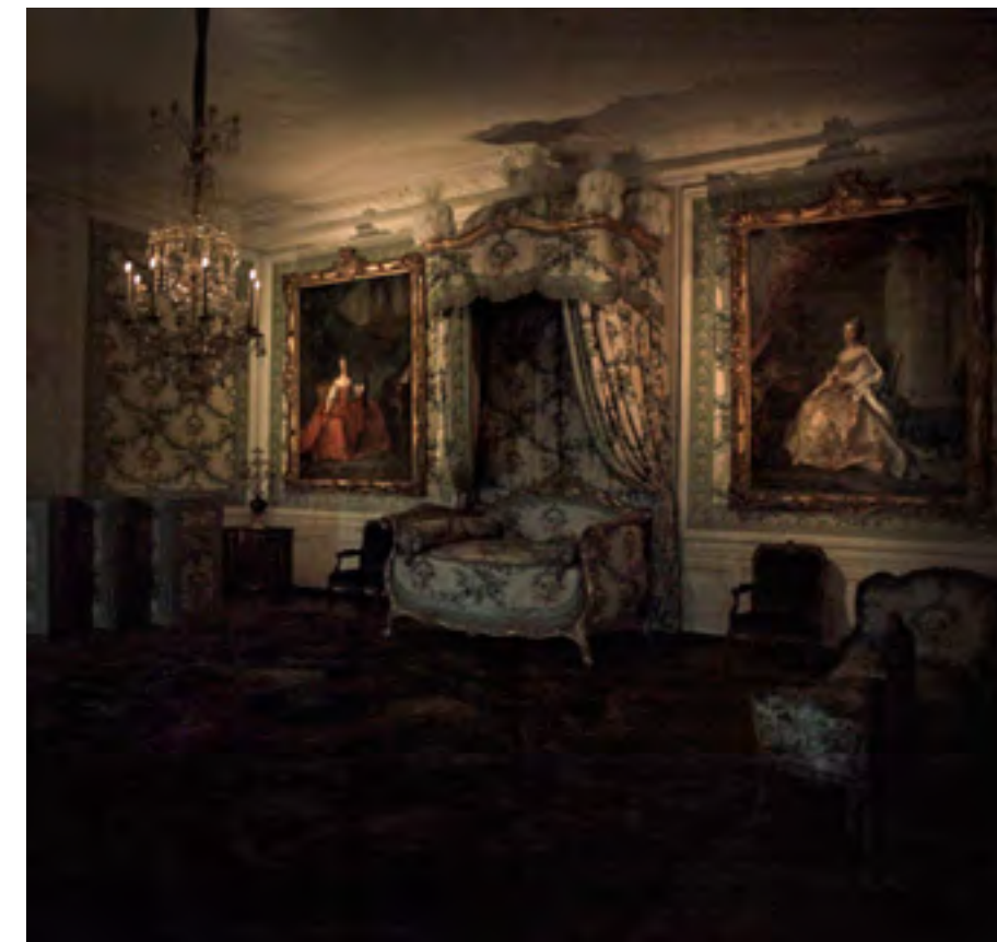
Lonely Unknown Beauties , 2013-14, ed /7 Photograph Face Mounted to Plexi 41 x 43 in.