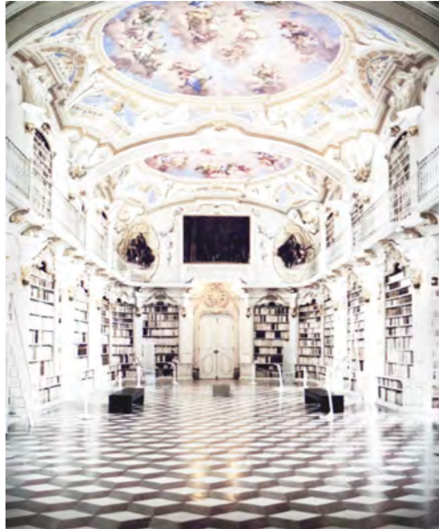
Dwinding Time in Admont Abbey, 2012, ed/7 Photograph Face Mounted To Plexi 24 x 20 in.