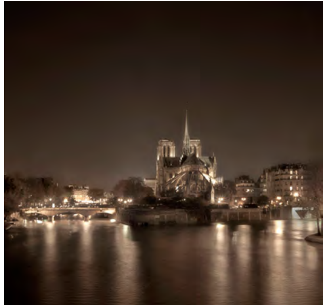
Quiet Lights , 2013-14, ed /7 Photograph Face Mounted to Plexi 41 x 43 in.