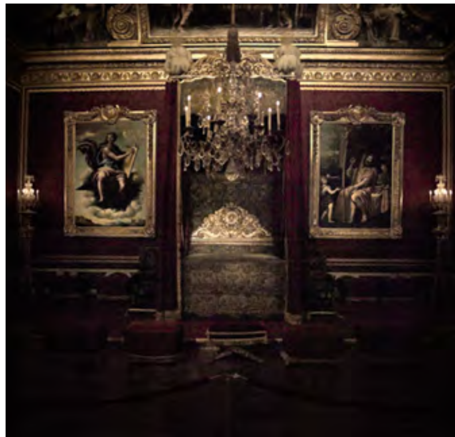
Memories of Lost Days , 2013-14, ed /7 Photograph Face Mounted to Plexi 41 x 43 in.