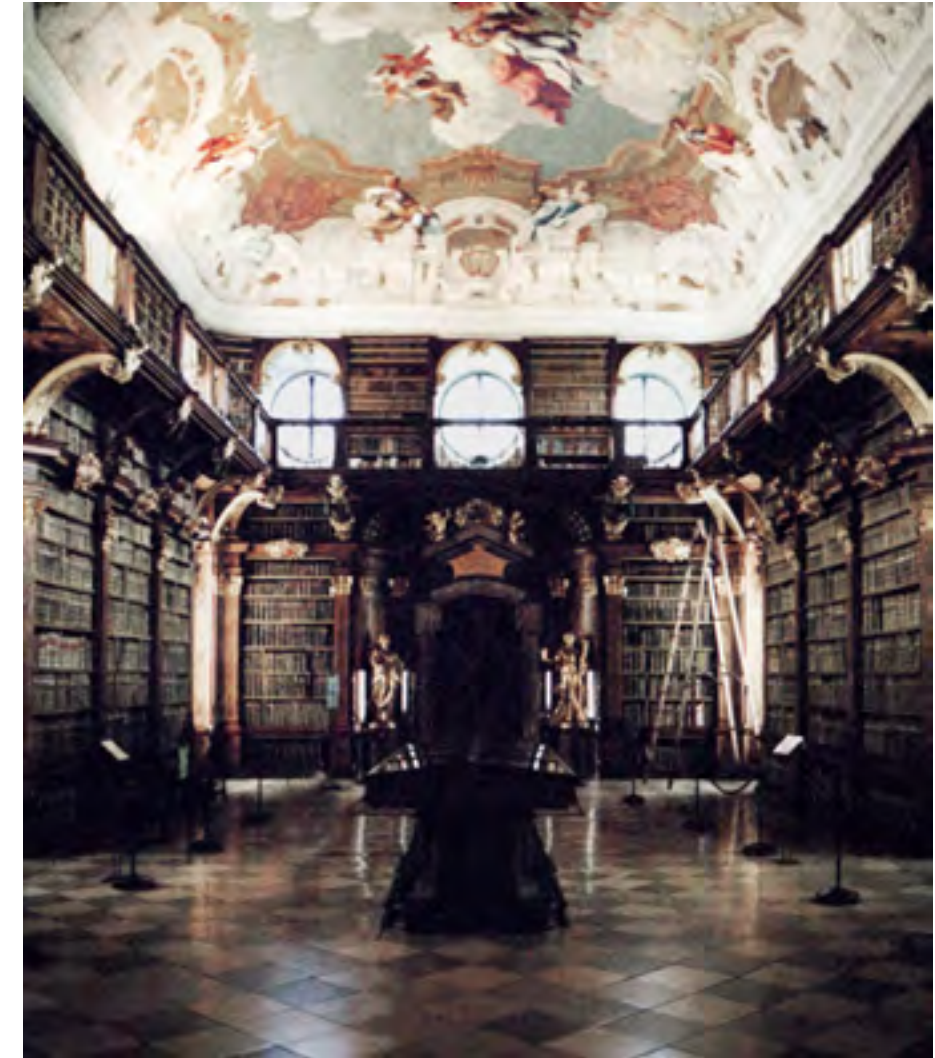
Melk Abbey, 2012, ed/7 Photograph Face Mounted To Plexi 24 x 20 in.