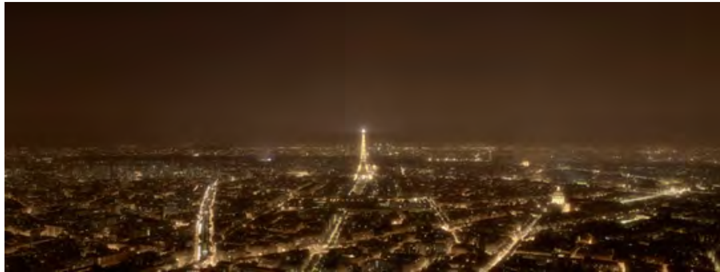
If We Are Lost, We Are Lost Together , 2013-14, ed/7 Photograph Face Mounted To Plexi 33 x 88 in.