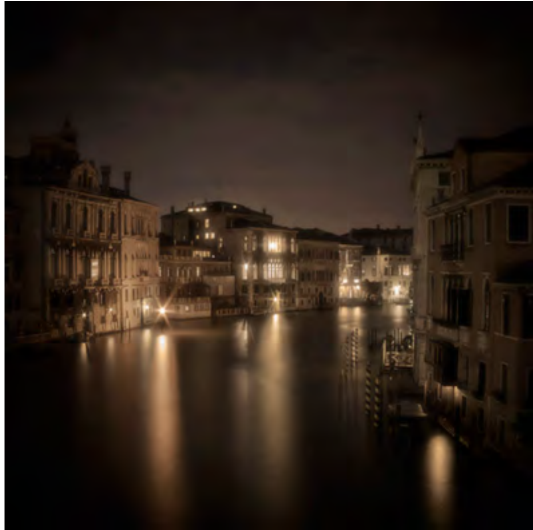
Still Nights With Gleaming Lights , 2013-14, ed /7 Photograph Face Mounted to Plexi 55 x 58 in.