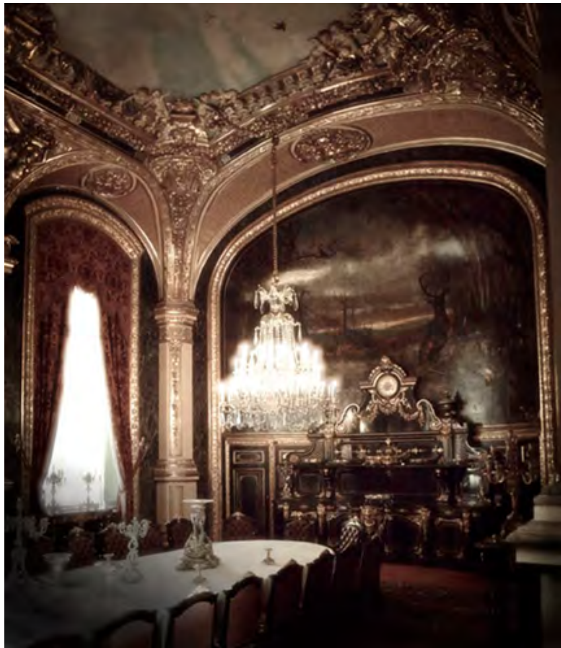
I Kinda Like This Feeling of Being Left Behind , 2013-14, ed /7 Photograph Face Mounted to Plexi 41 x 43 in.