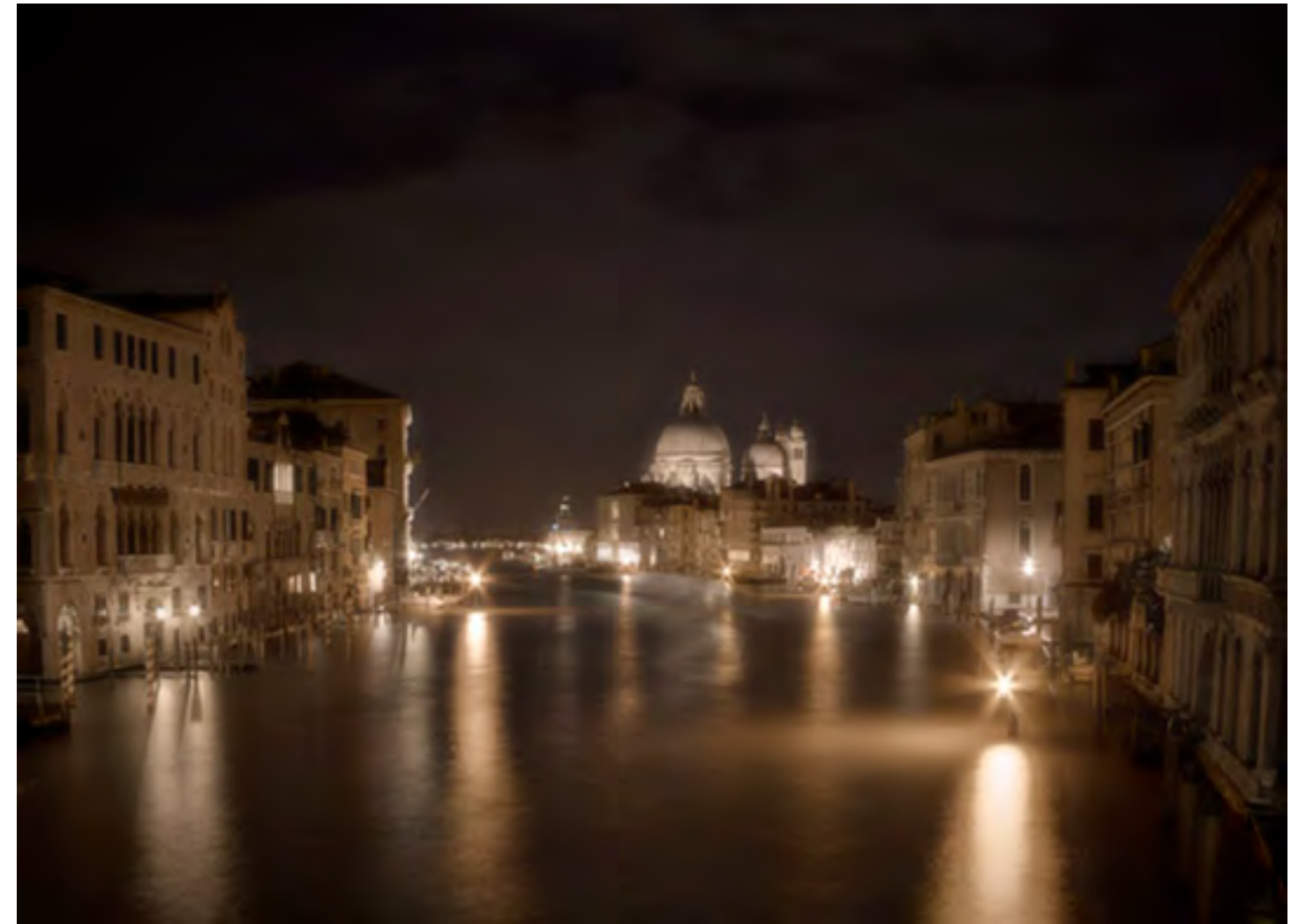
Slowing Lights II , 2013-14, ed/7 Photograph Face Mounted To Plexi 58 x 79 in.