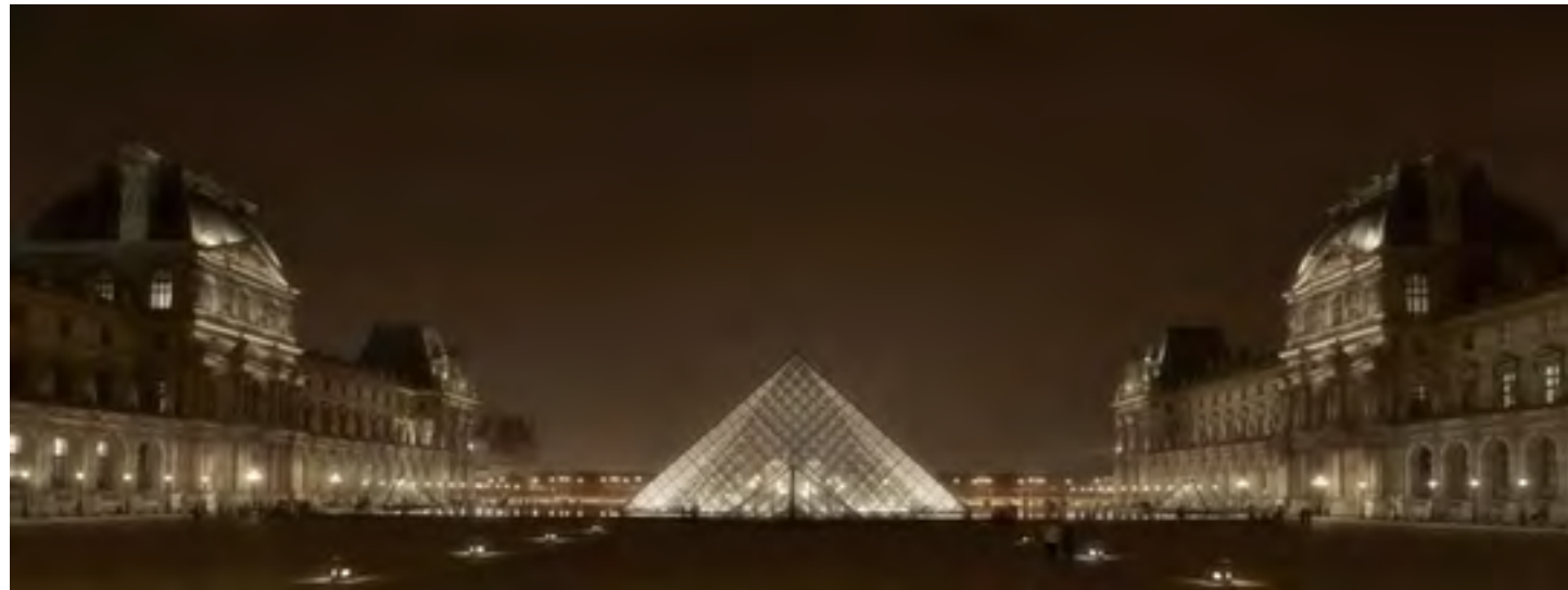
Always In My Dreams , 2013-14, ed/7 Photograph Face Mounted To Plexi 61 x 138 in.