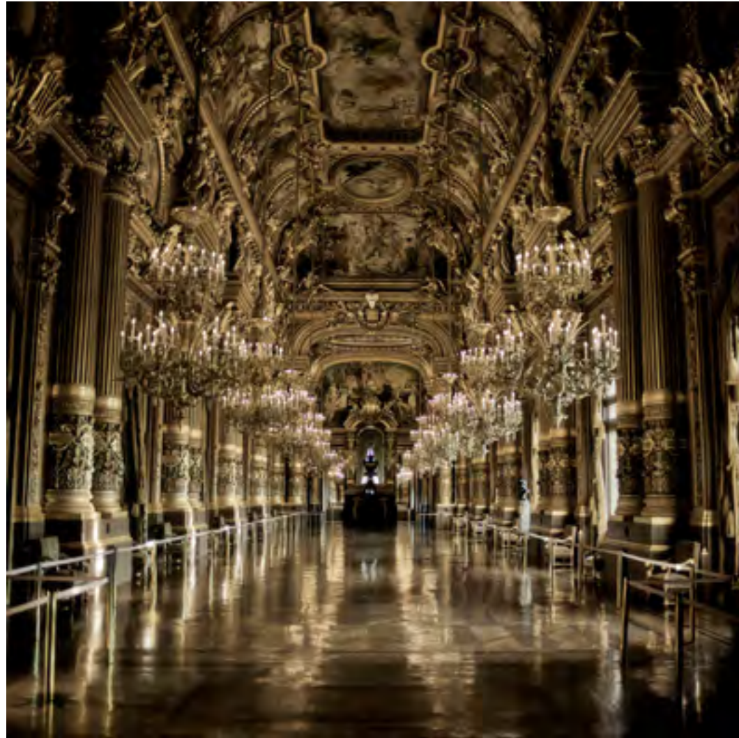
A Quiet Expression , 2013-14, ed /7 Photograph Face Mounted to Plexi 58 x 58 in.