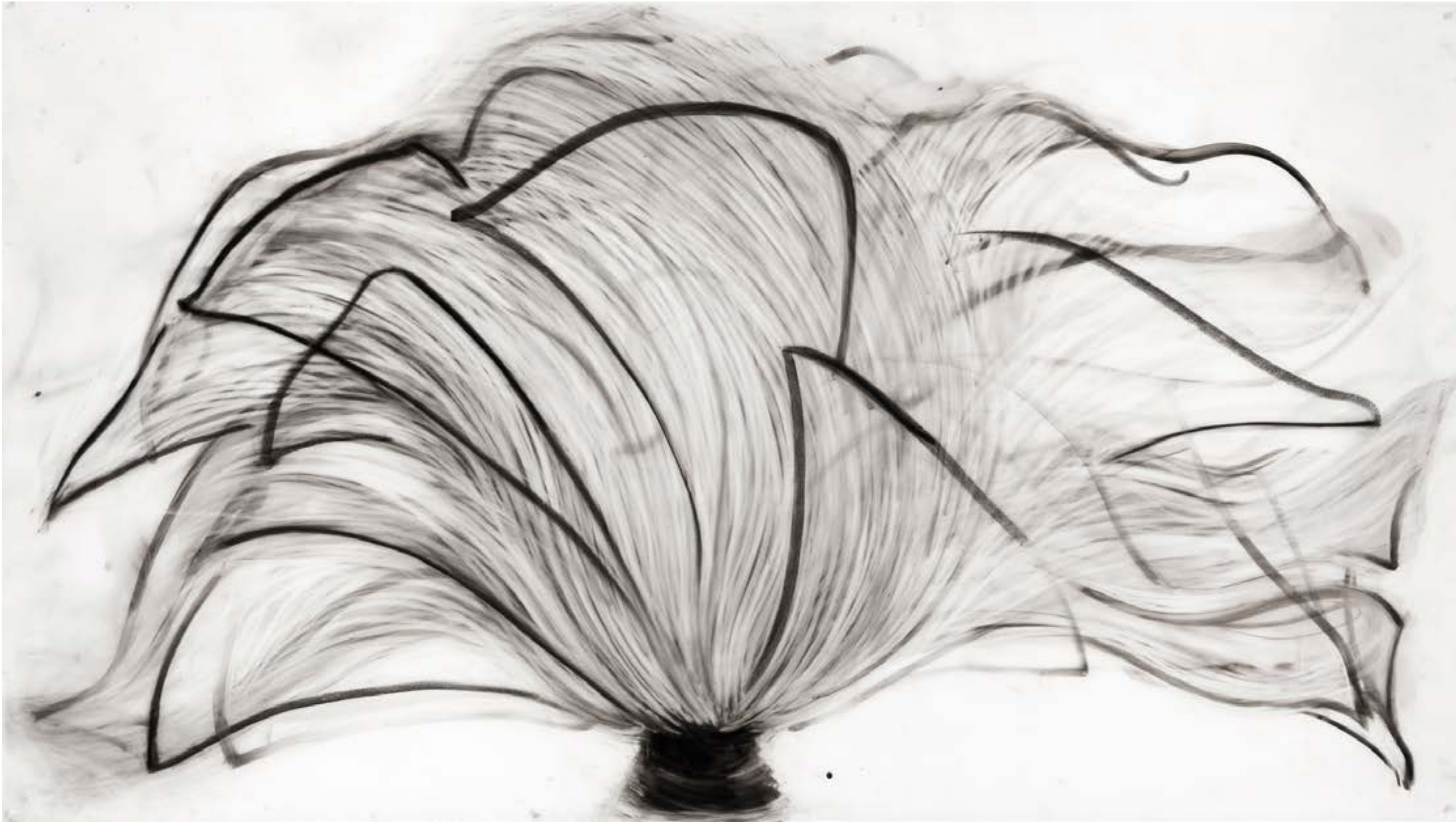
Untitled 998, 2015 Oil Pastel on Vellum 43 x 75 in.