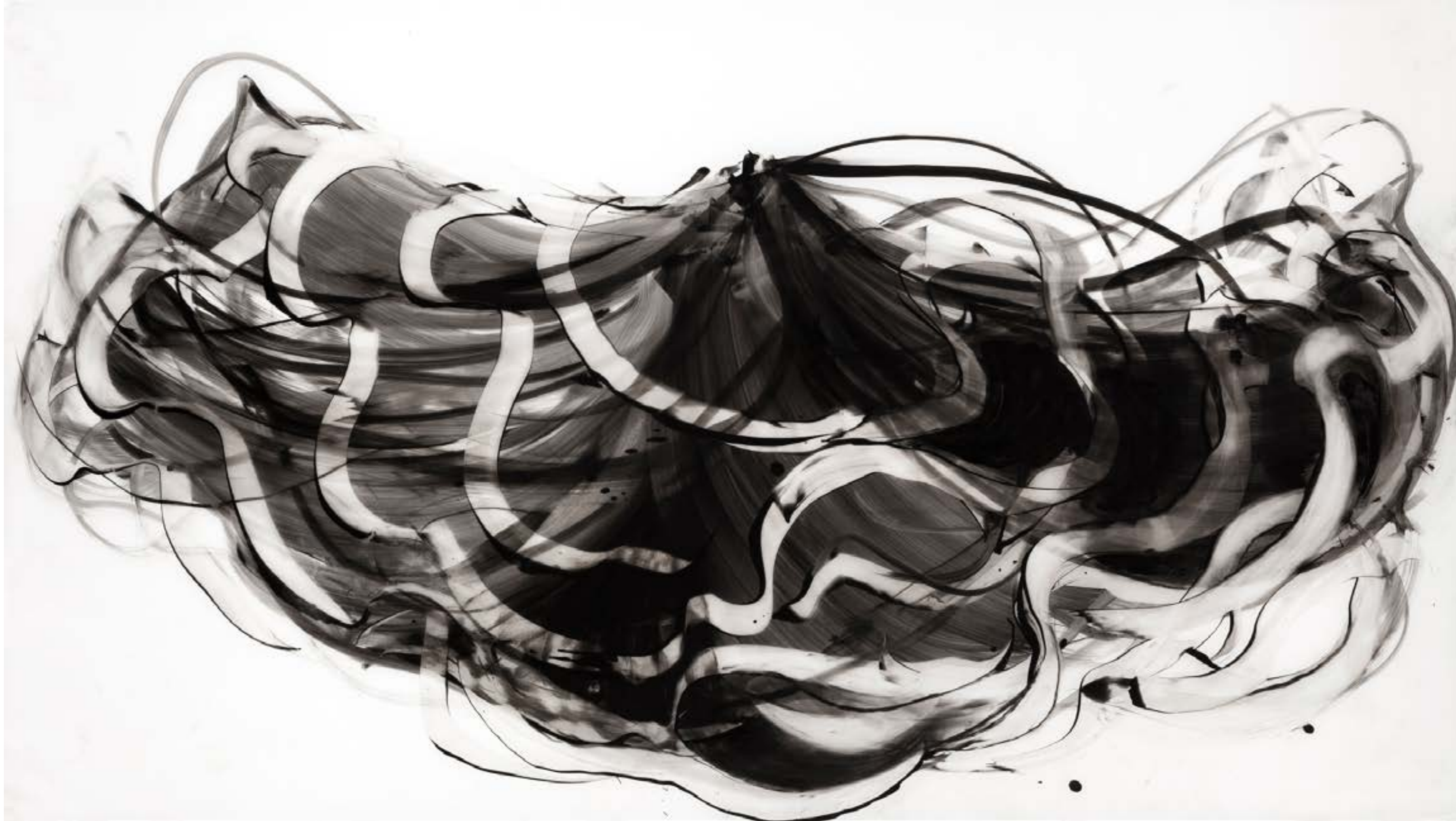
Untitled 1001, 2015 Oil Pastel on Vellum 41 x 77 in.