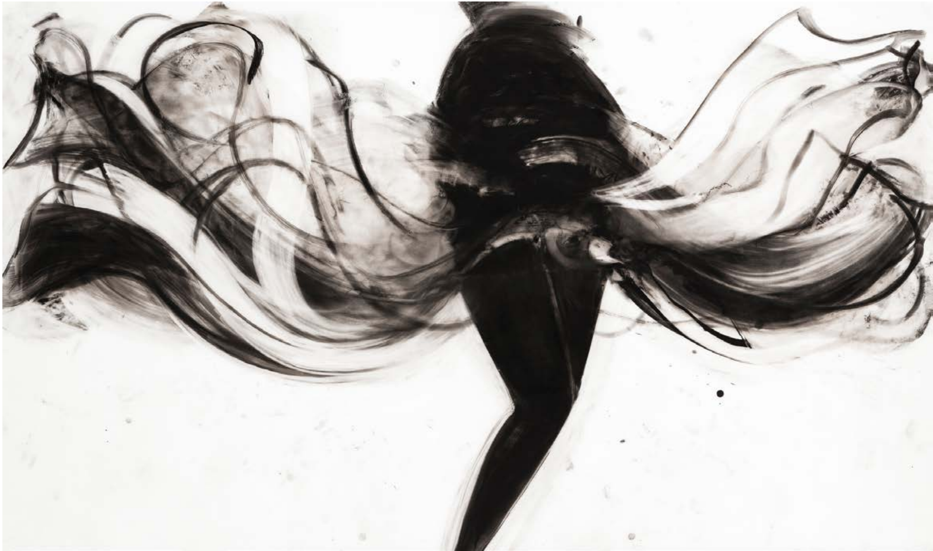
Untitled 999, 2015 Oil Pastel on Vellum 43 x 72 in.