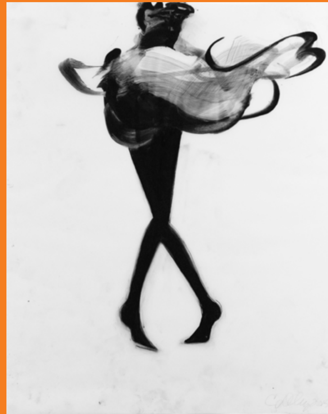
Untitled 984, 986, 989, 2014 Oil Pastel on Vellum 24 x 19 in. (each)