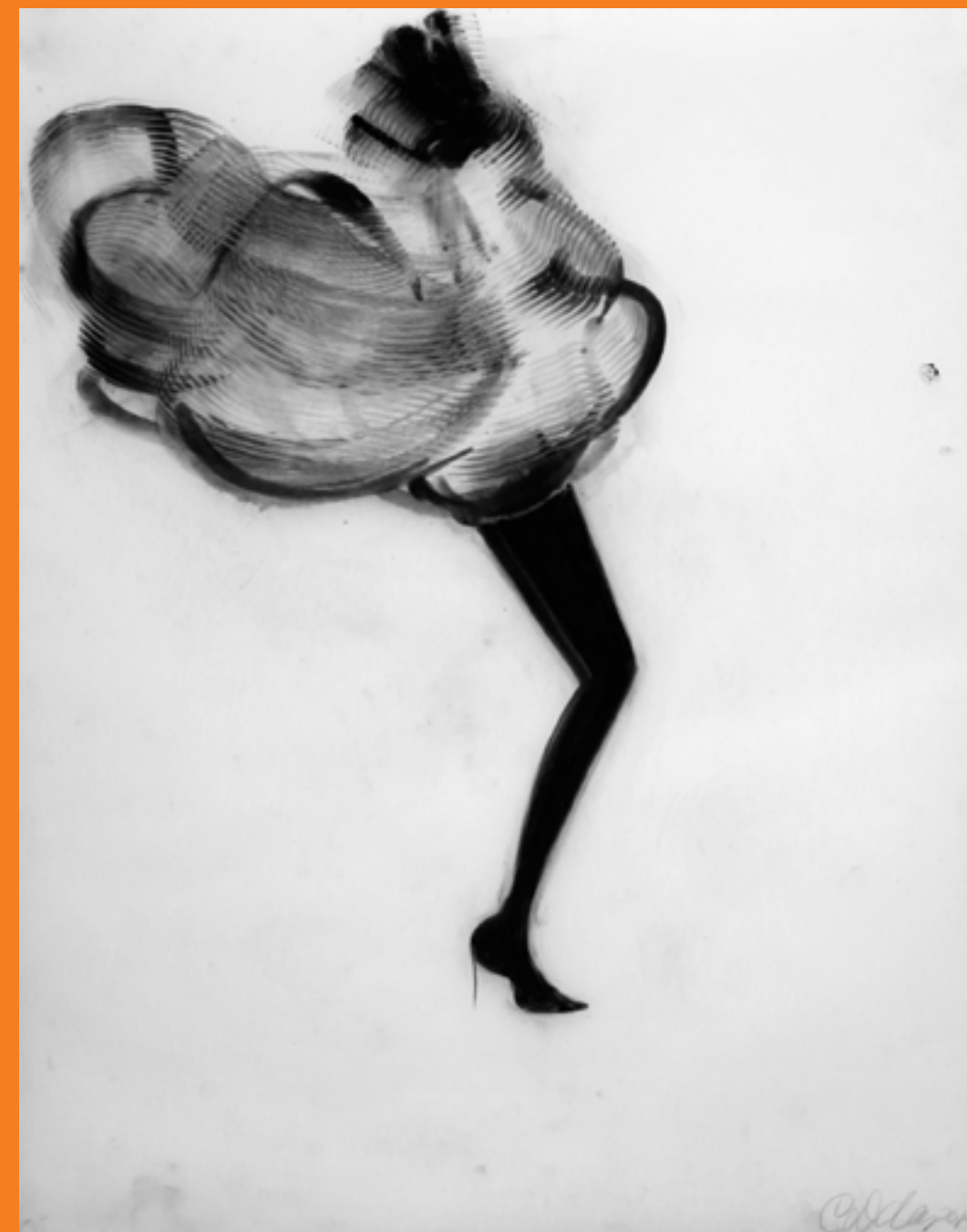
Untitled 943, 948, 949, 2014 Oil Pastel on Vellum 24 x 19 in. (each)