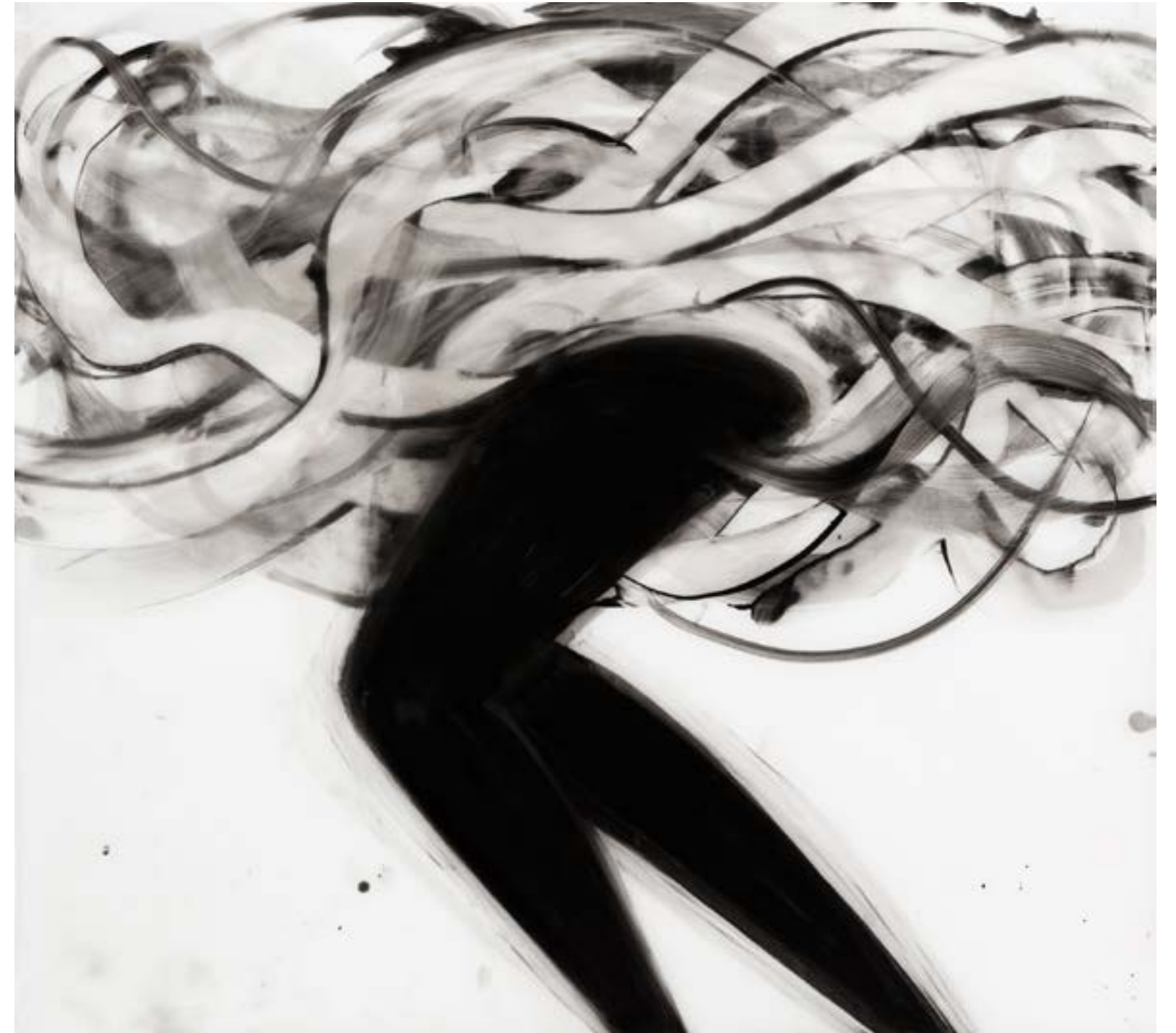
Untitled 1003, 2015 Oil Pastel on Vellum 36 x 39 in.