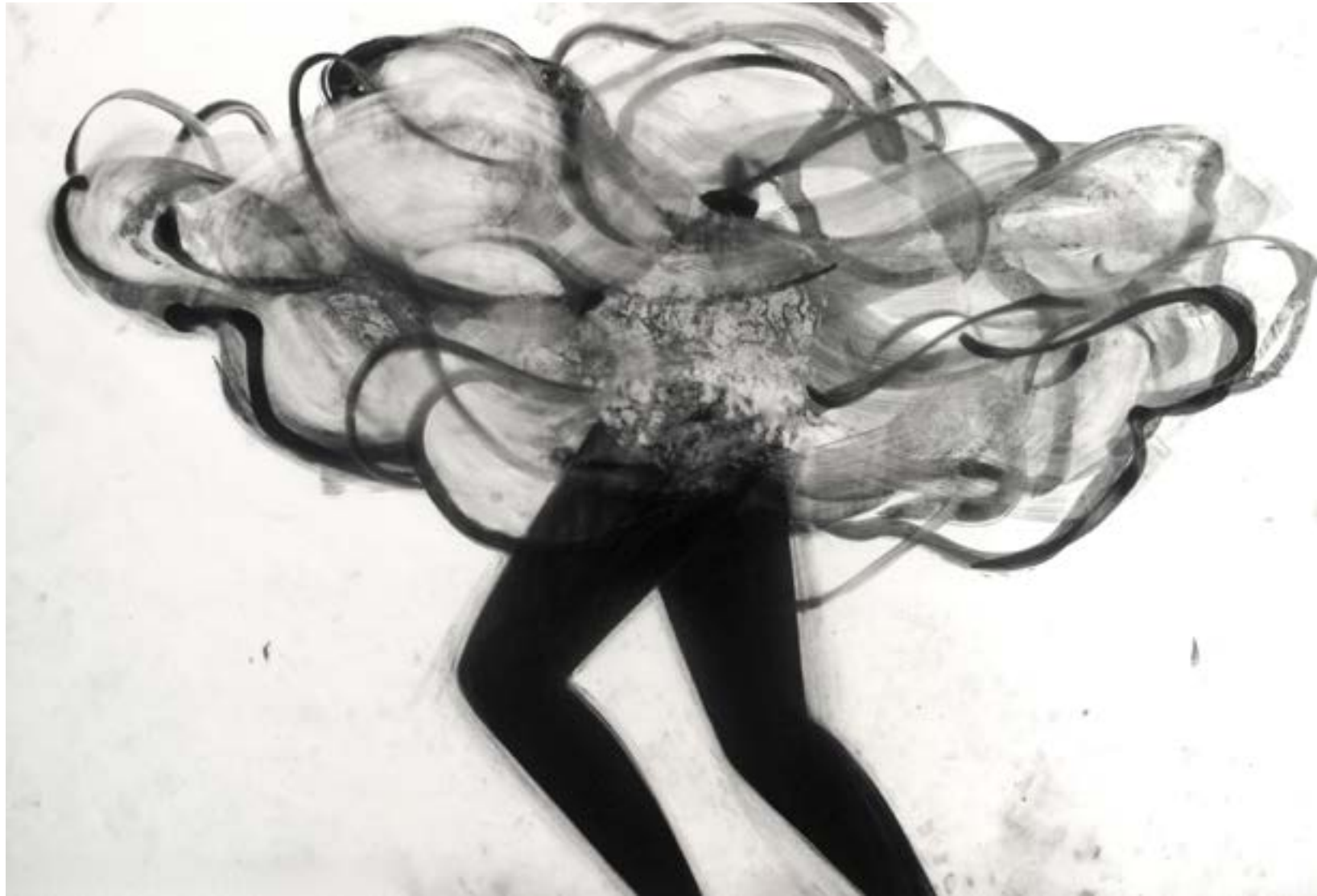
Untitled 1005, 2015 Oil Pastel on Vellum 34 x 50 in.