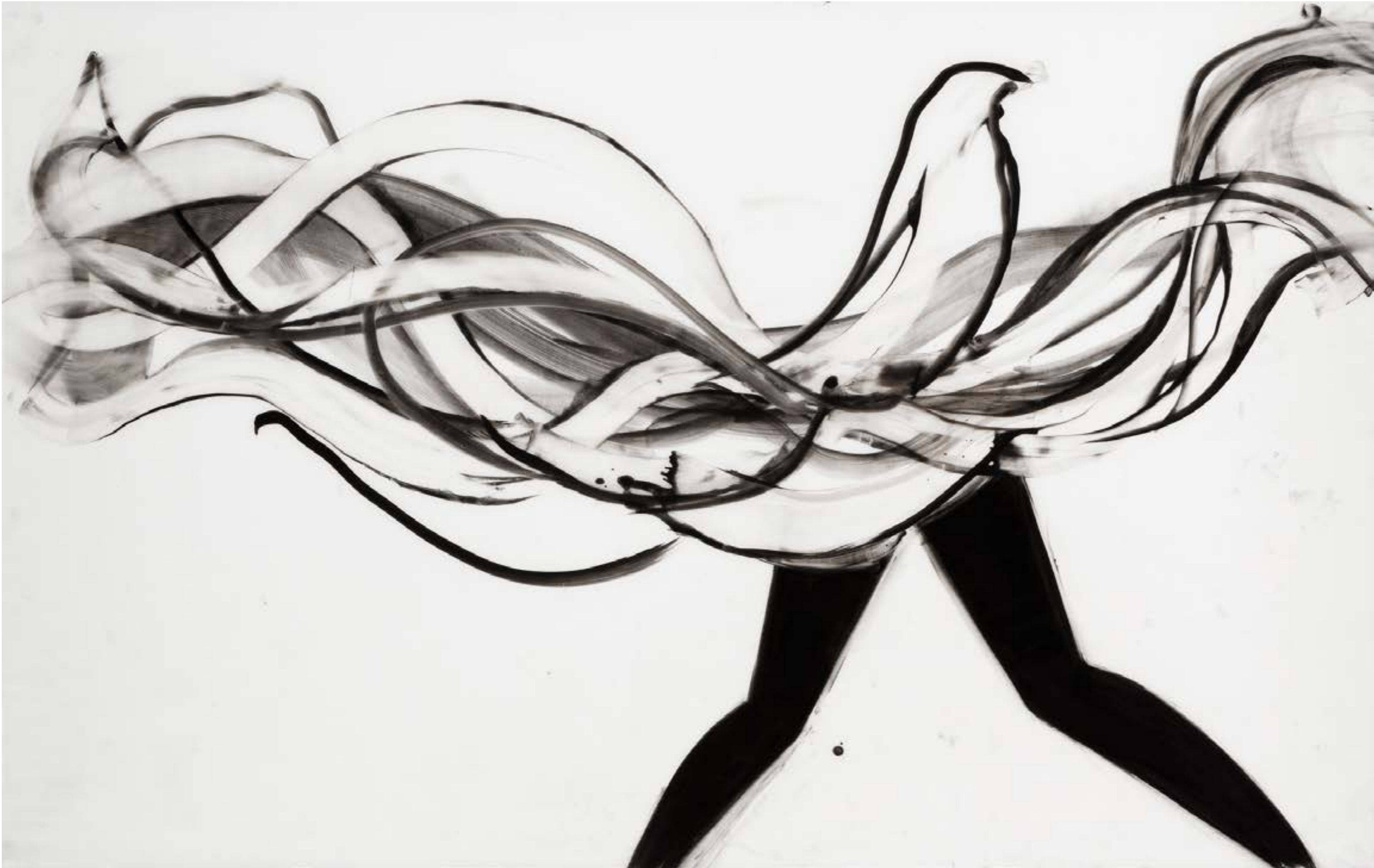
Untitled 1000, 2015 Oil Pastel on Vellum 43 x 75 in.