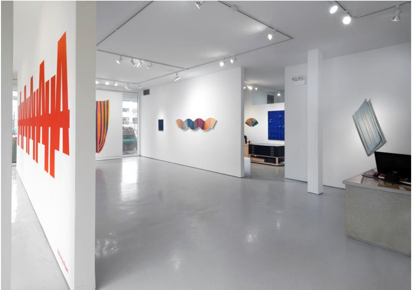
Impromptu Airs , Installation view (Kay Rosen, LOL on the wall )