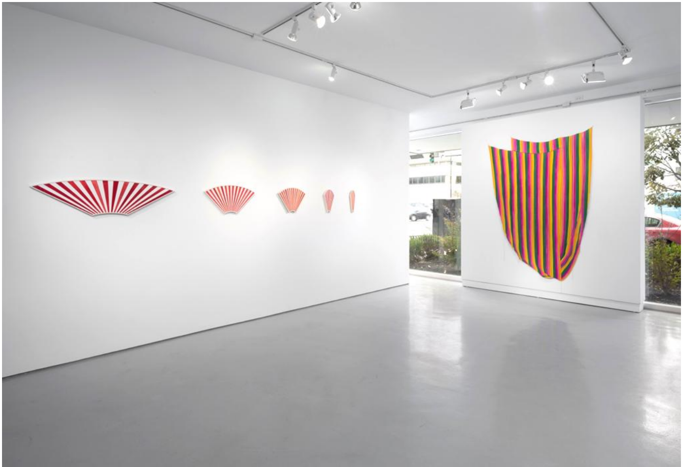
Impromptu Airs , Installation view