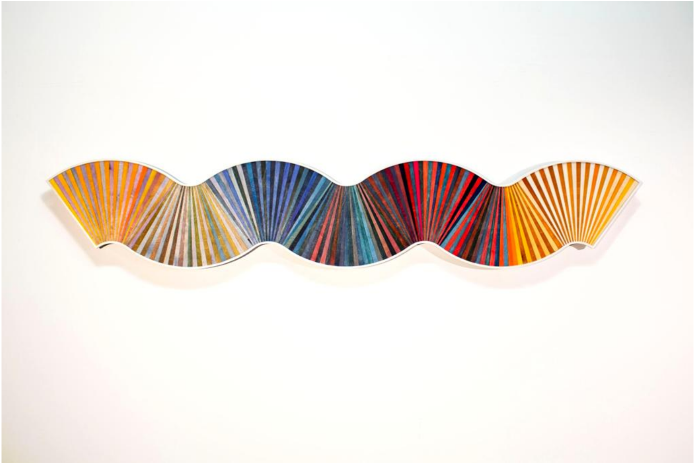
To Fan No. 2, 2014 Dye and polyurethane on Baltic birch plywood on particleboard 22 x 88 inches