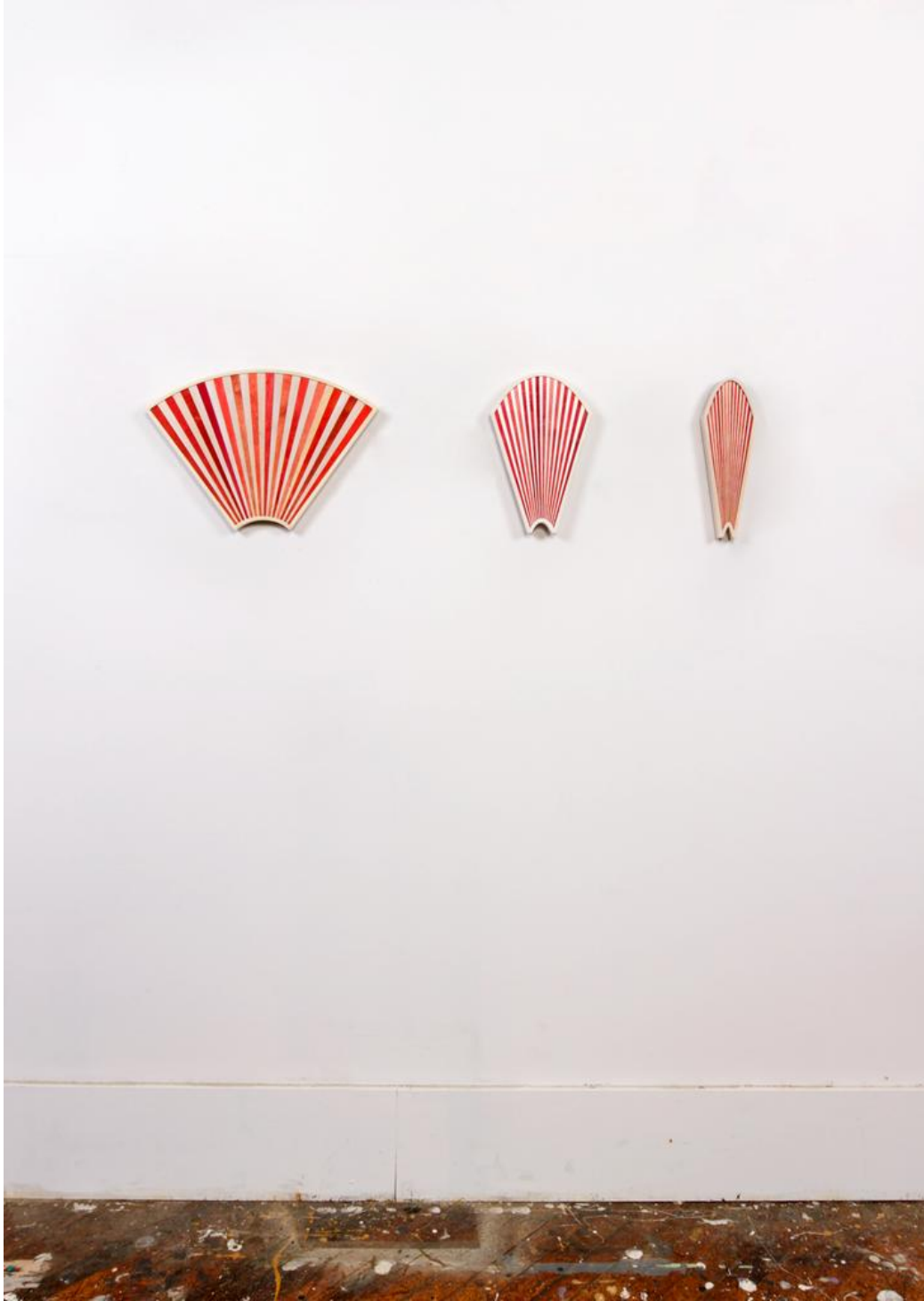
FFaannnn No. 1, 2014 and Faannn No. 1, 2014, Installation view Dye, acrylic, UV absorbent lacquer, Baltic birch plywood on particleboard 13 ½ x 55 inches and 13 ½ x 28 ½ inches