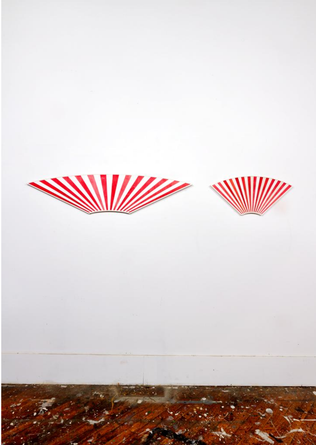
Fan No. 9, 2013; Fn No. 1, 2014; F No. 1, 2014, Installation view Dye, acrylic, UV absorbent lacquer, plywood 13 ½ x 20 inches; 13 ½ x 8 ½ inches; 13 ½ x 4 ¾ inches