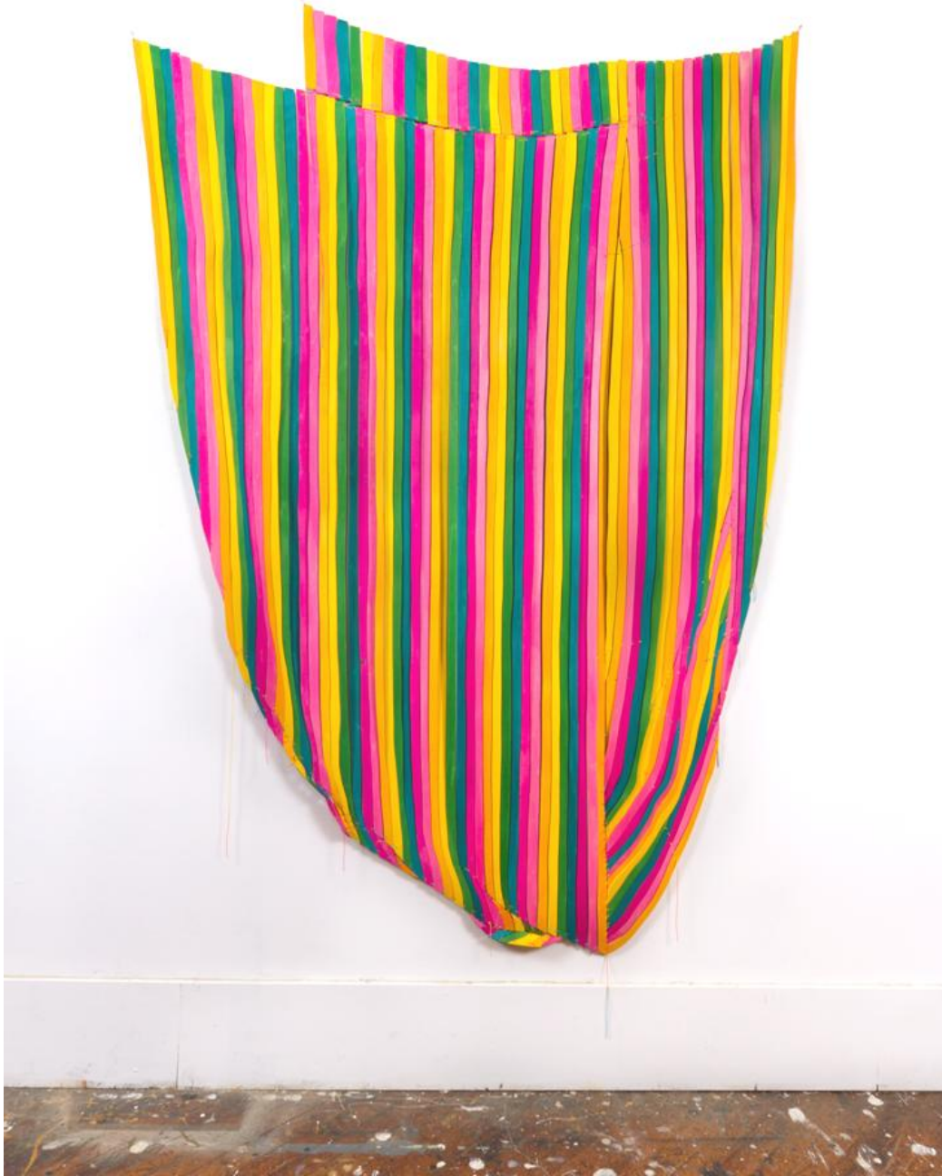
Grand Amusement , 2014

Dye, UV absorbent lacquer on basswood solid core plywood with nylon cord and wire 85 x 60 inches