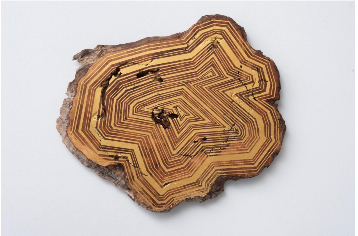
Gold Cherry Gift , 2014 Acrylic on cherry wood 21 1/2 x 24 inches