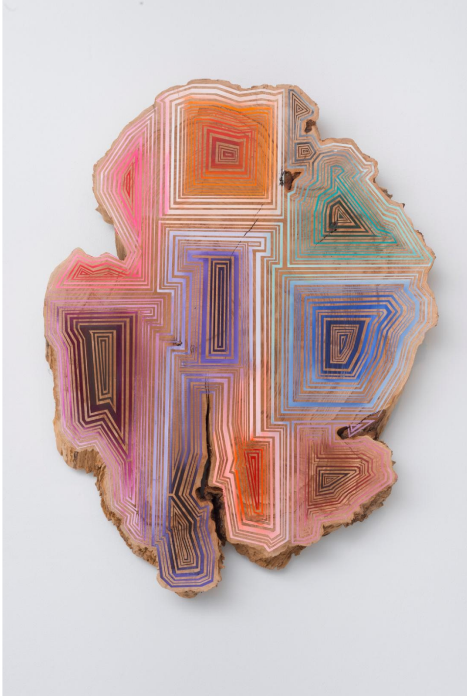
9 Ways to Get Your Groove On, 2014 Acrylic on Big Leaf Maple 35 x 27 inches