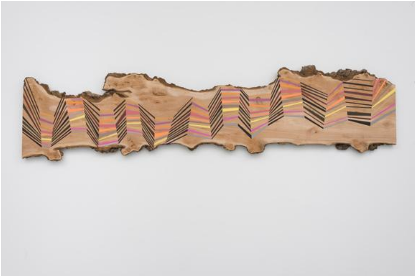
Twenty Colors Down the Middle, 2014 Spray paint on Cotton wood 92 x 21 inches