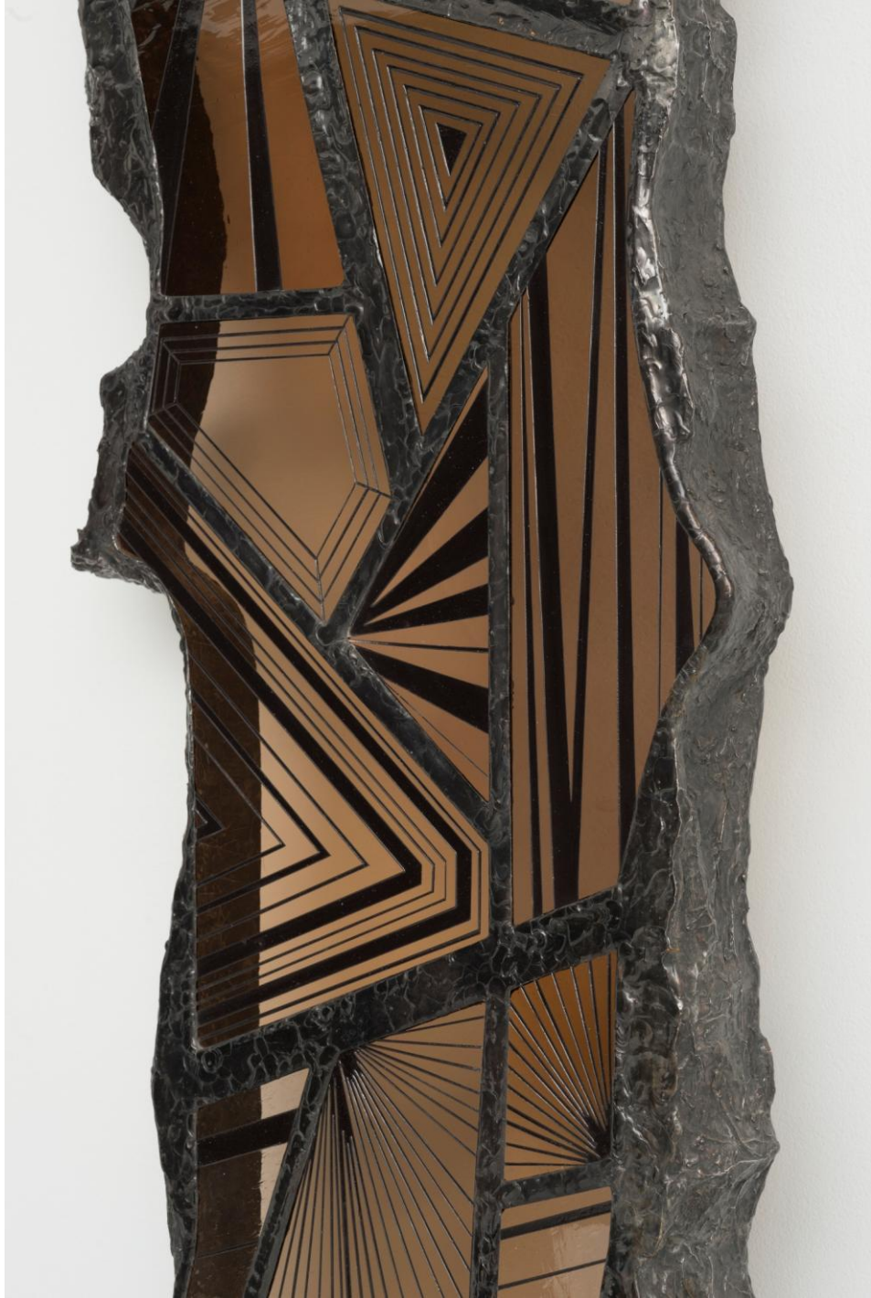
My First Glass Plank (detail)