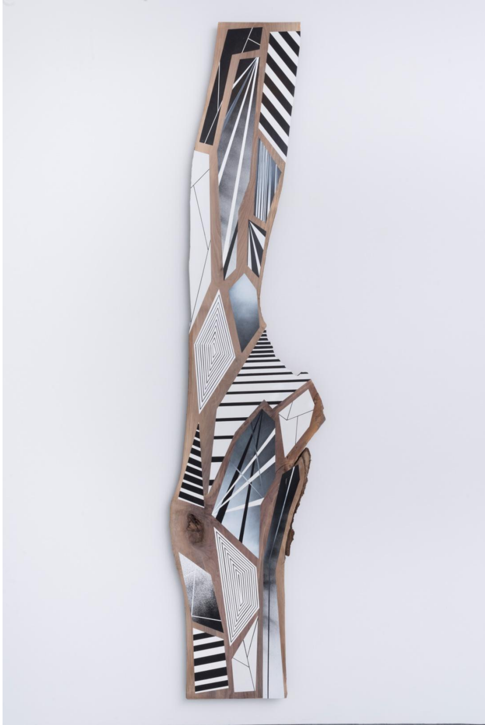
17 Black and White Paintings or the Winner Is, 2014 Acrylic and spray paint on walnut 109 ½ x 23 ½ inches