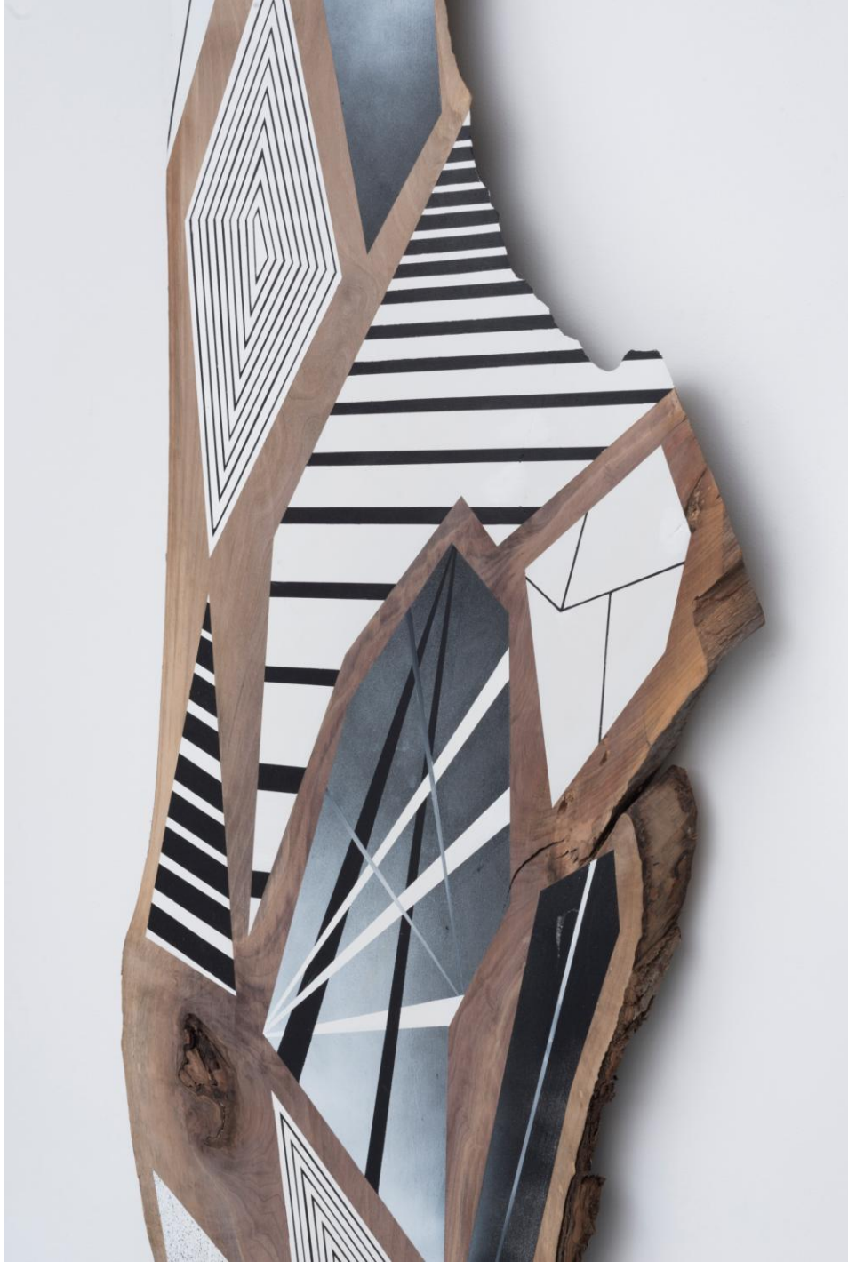
17 Black and White Paintings or the Winner Is (detail)