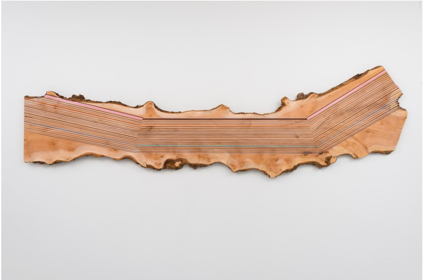
After Tony Smith and the New Jersey Turnpike, 2014 Acrylic on Cotton wood 97 x 22 ½ inches