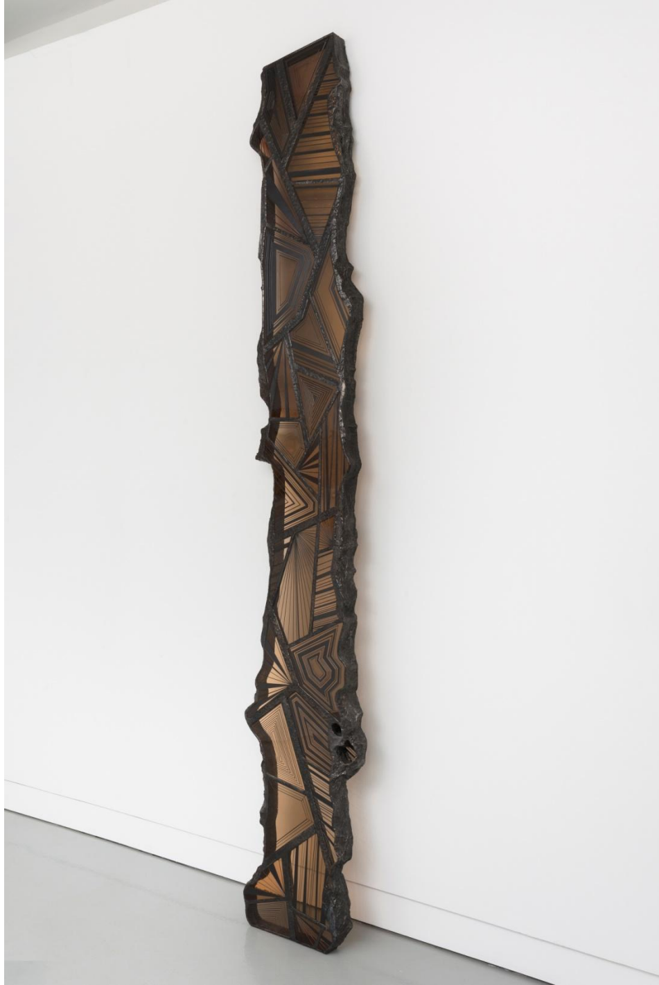
My First Glass Plank , 2014 Steel, glass, lead, copper, patina, wax, enamel 103 x 16 inches