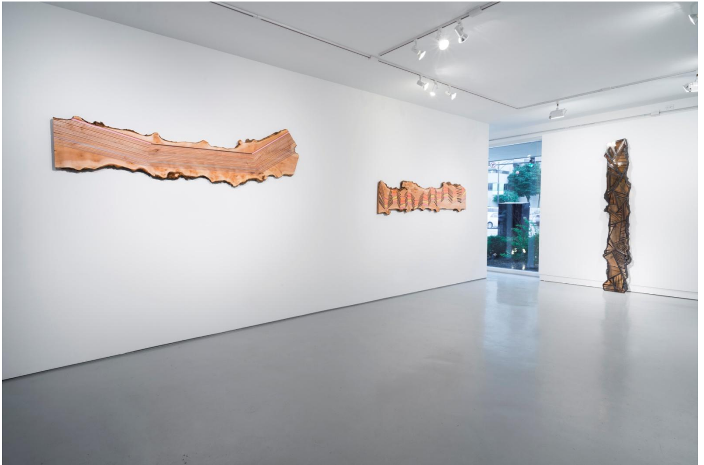
There is a map in every tree, installation view, moniquemeloche