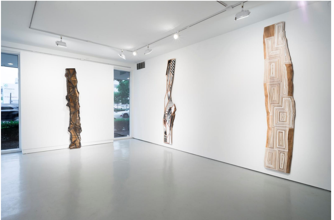
There is a map in every tree, installation view, moniquemeloche