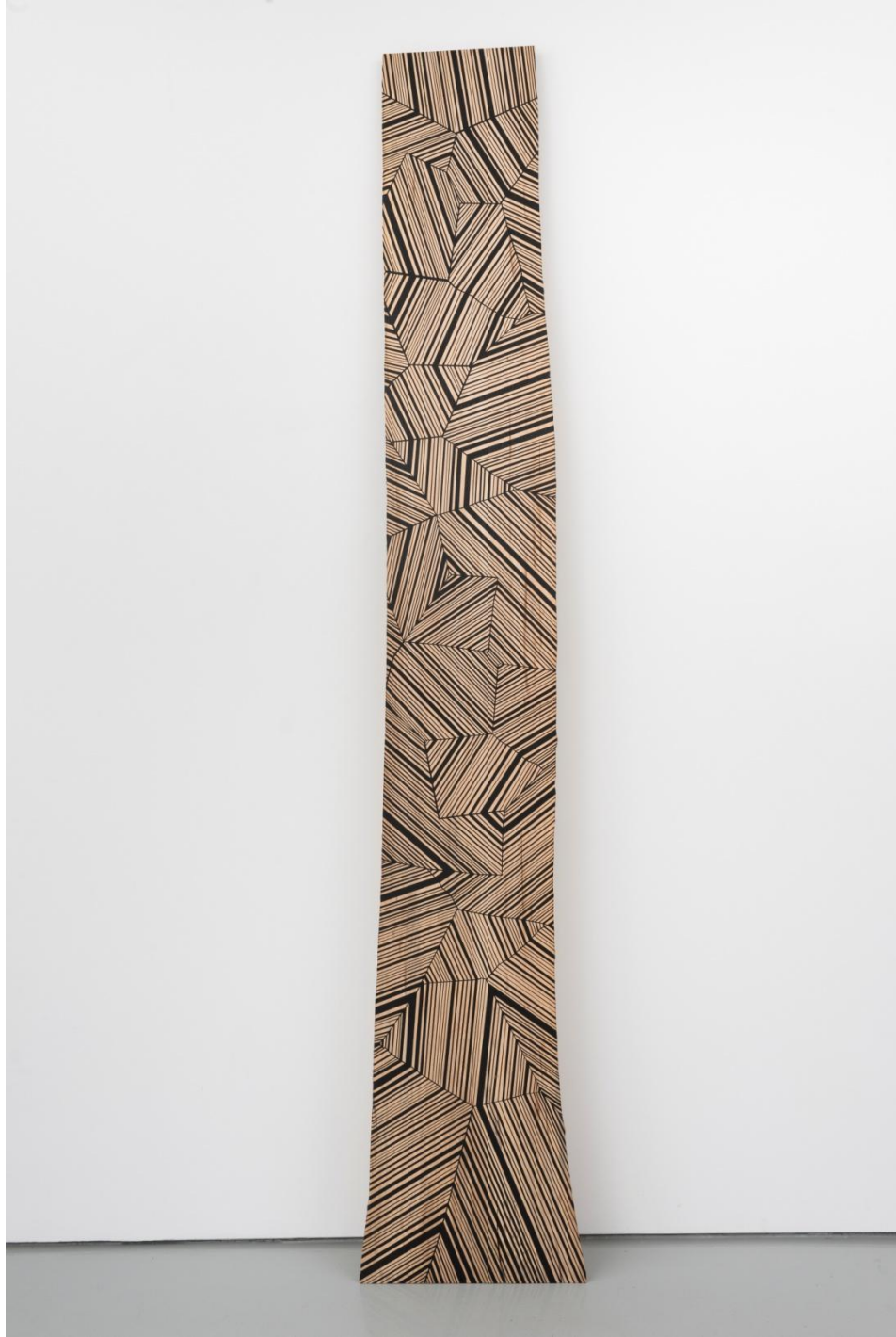
Thinking About Darwin , 2014 Spray paint on American elm 102 x 18 ½ inches