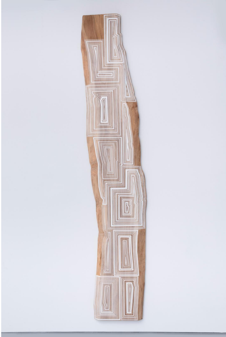
Boxed In , 2014 Spray paint on Elm 112 x 20 inches