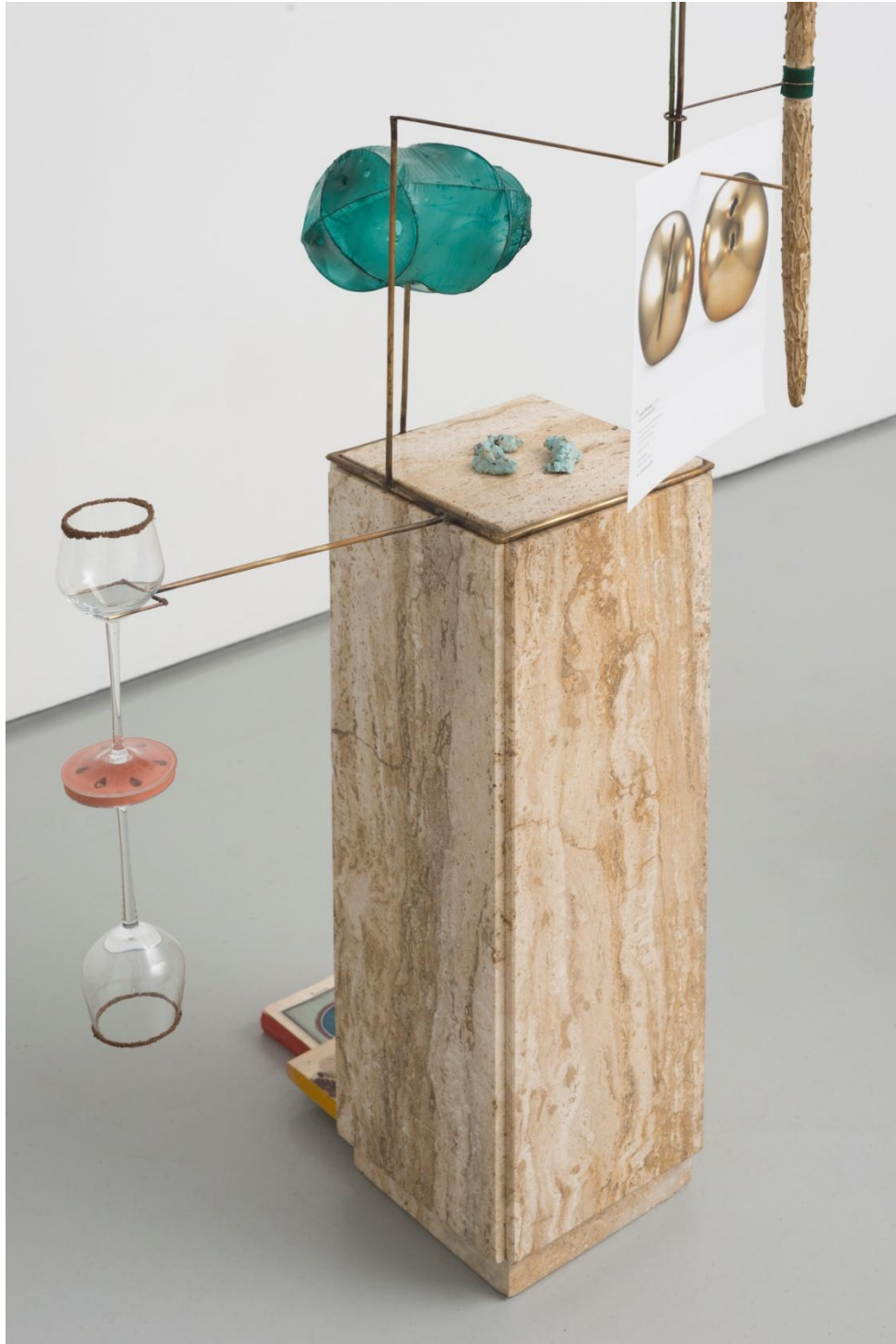
Cup and Balls (Warm Marble), 2014 (detail)