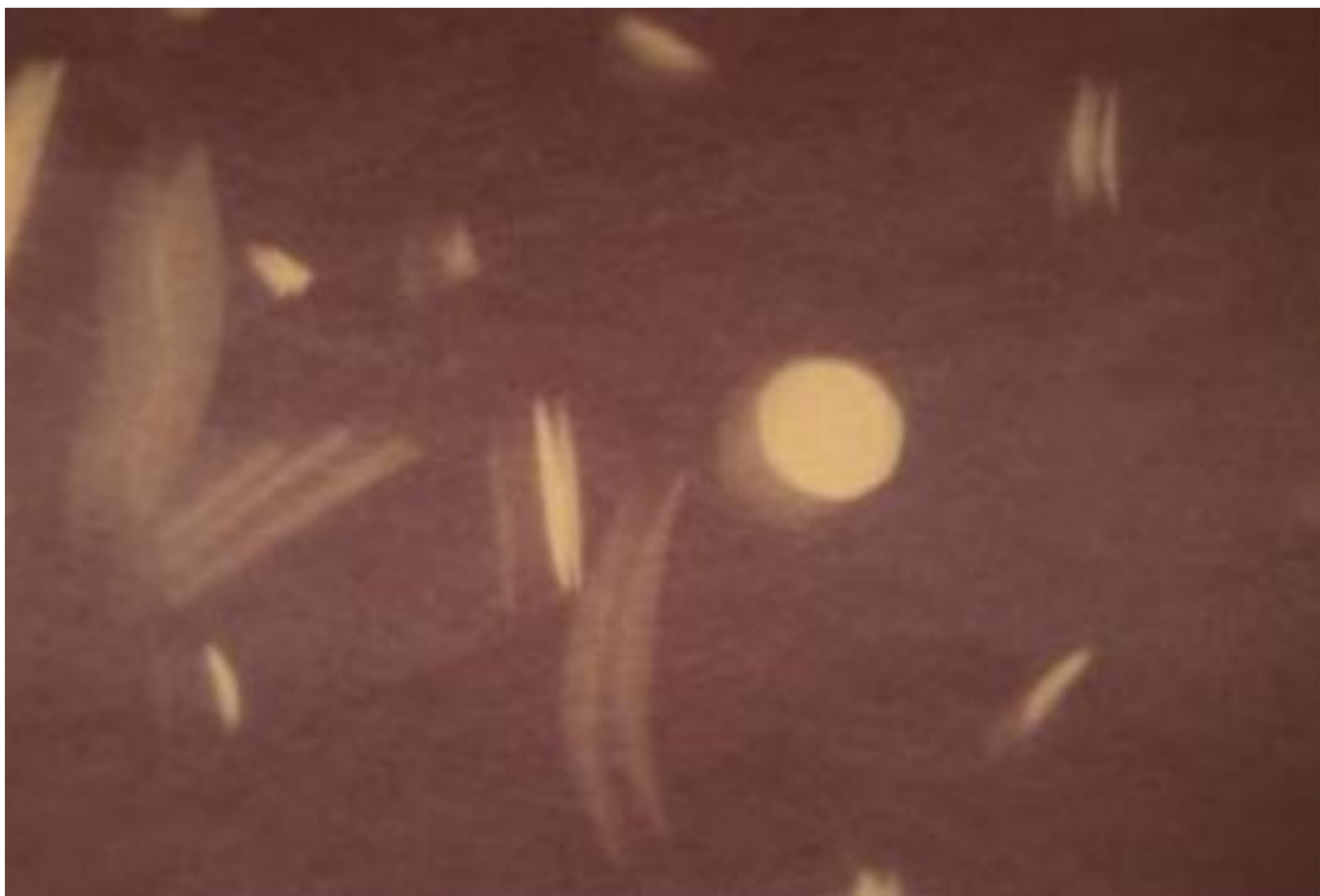
Lilli Carre one second (in the dark) , 2014 HD digital video loop on USB stick