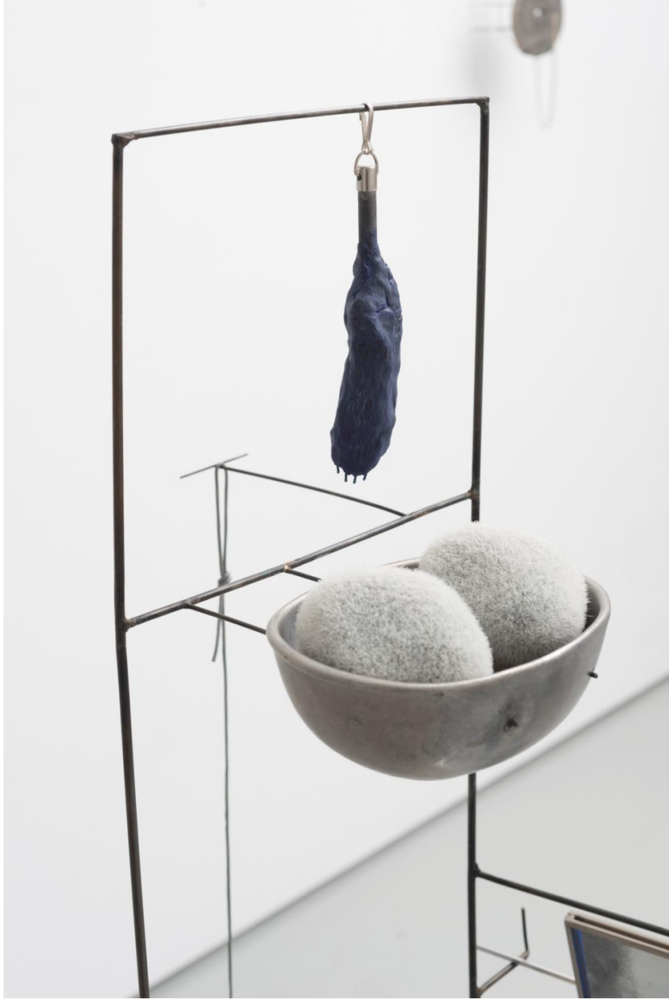
Cup and Balls (Cool Shell) , 2014 (detail)