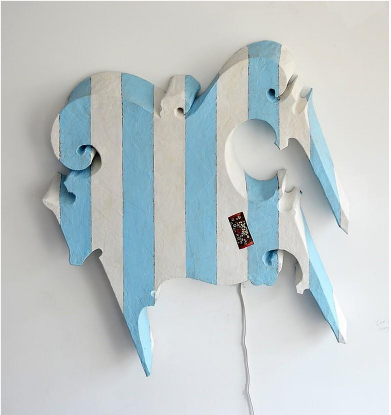
Carol Jackson Boo , 2014 Paper Mache, encaustic, motor 42 x 34 inches