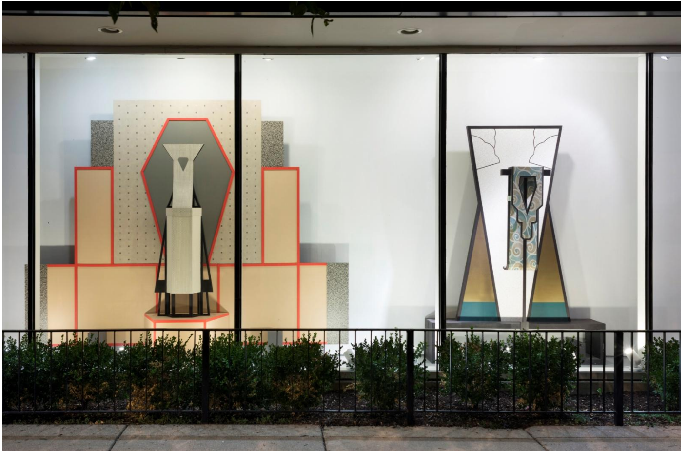
on the wall Diane Simpspn Window Dressing , 2014