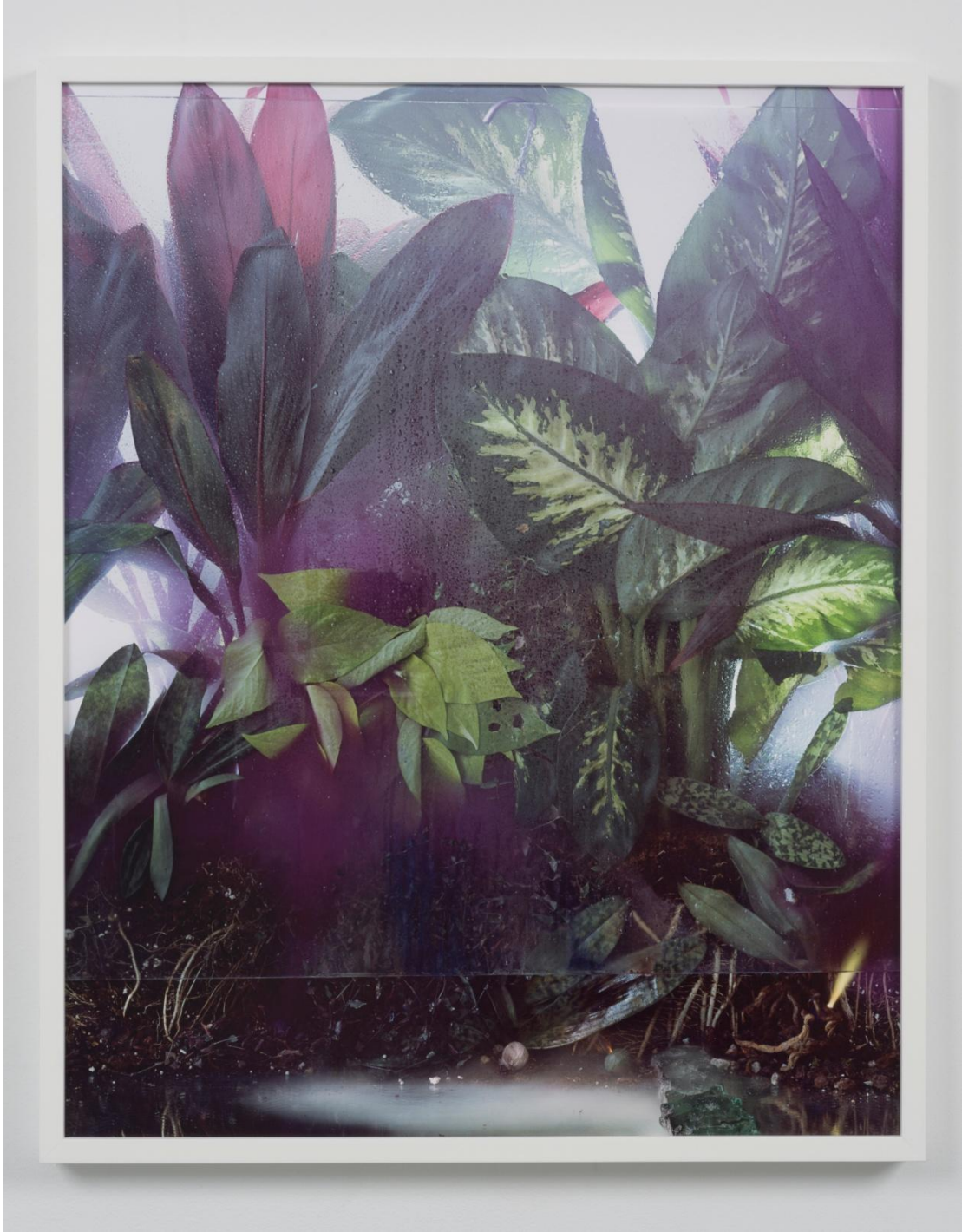
After the Pillar of Purple Fire, 2014