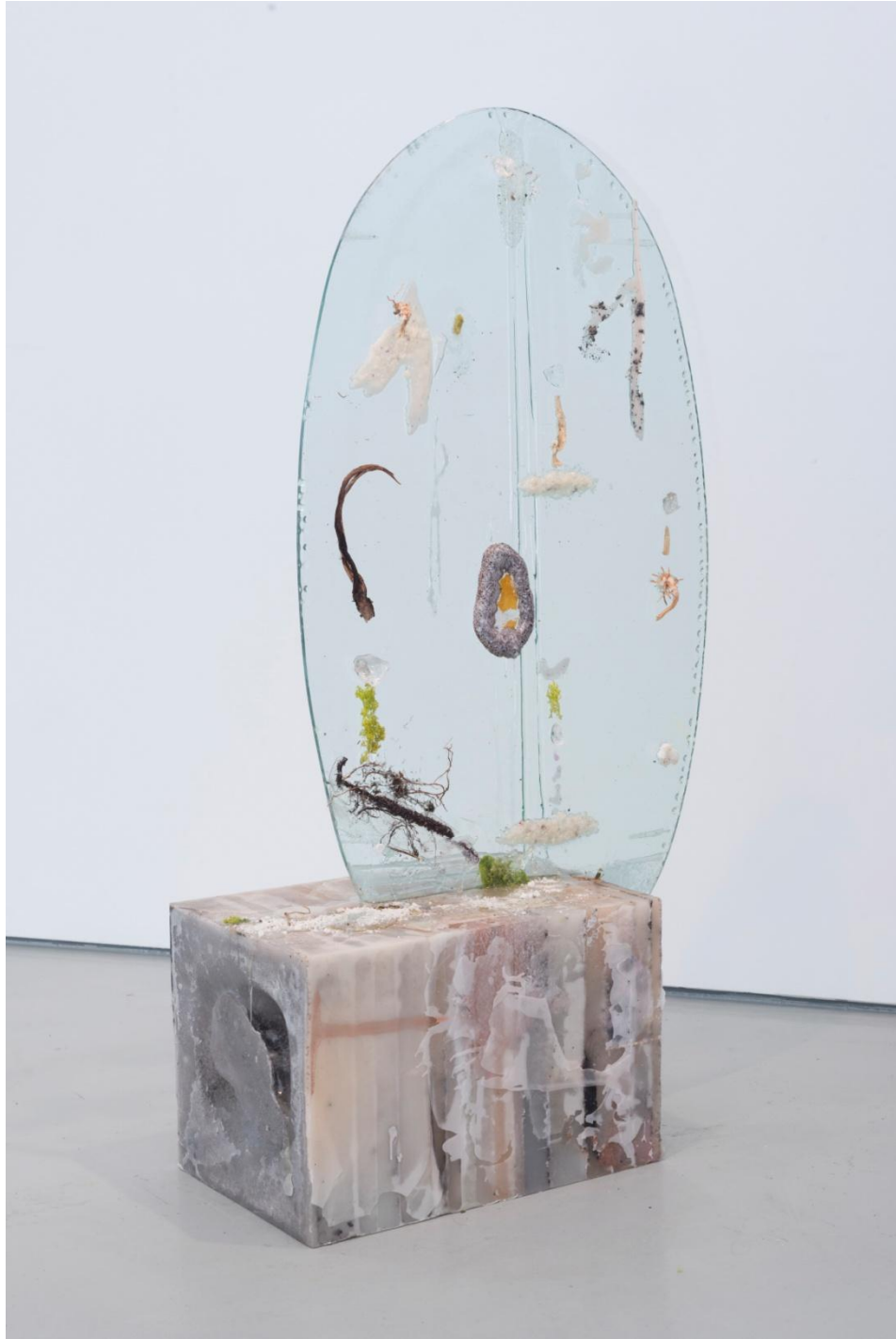
Ellipse with Nitrogen Fixers and Snake Plant Buds (dedicated to Tent Rocks, 2013-2014

Glass, wax, resin, plant materials, rock salt