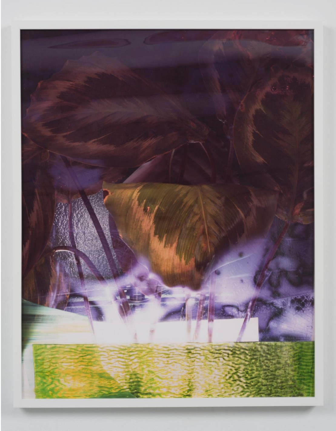
Ultraviolet Plant Shelter, 2014 Archival pigment print 30 x 24 inches