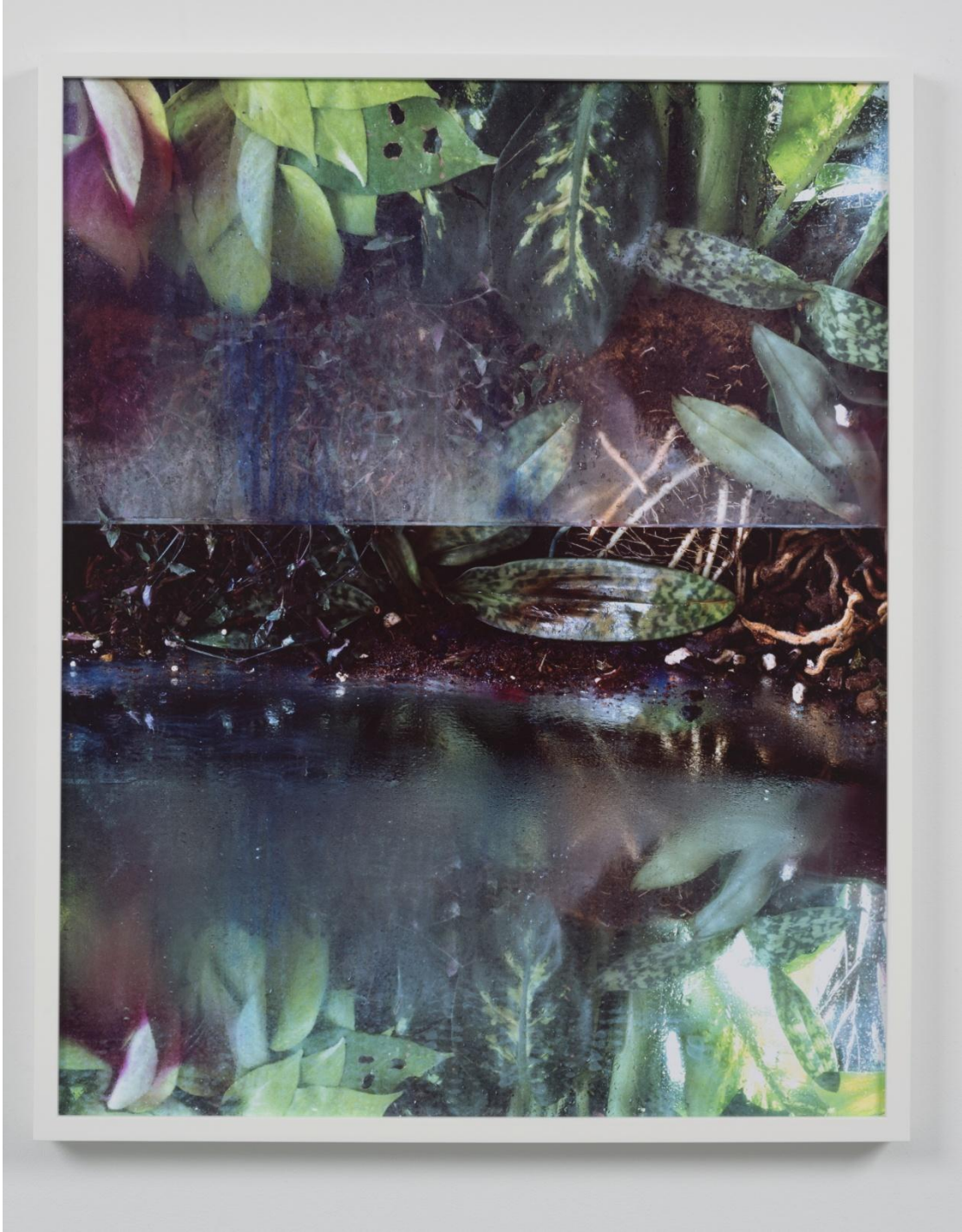
Radiation Jungle, 2014 Archival pigment print 30 x 24 inches