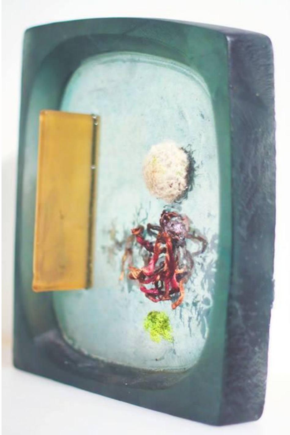
The Vitrification of Vegetation 6, 2014 Cast glass, resin, plant material, film, minerals 12 x 10 x 4 inches