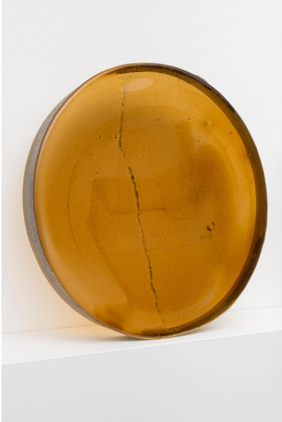
The Vitrification of Vegetation 4 , 2014 Cast glass, resin, plant material, film, minerals 14 inches in diameter