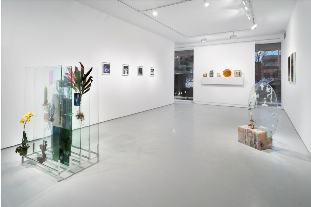
to Threptikon , 2014, Installation view

Aristotle postulated that plants have a vegetative soul called "to threptikon". Centuries later, Charles Darwin hypothesized that plants are cognitive organisms with a "root-brain" acting as a control center. These ideas are still hotly debated, but recent studies prove that plants are not just passive, immobile organisms; they're endowed with sophisticated abilities to communicate, signal, and detect danger-above ground and below.