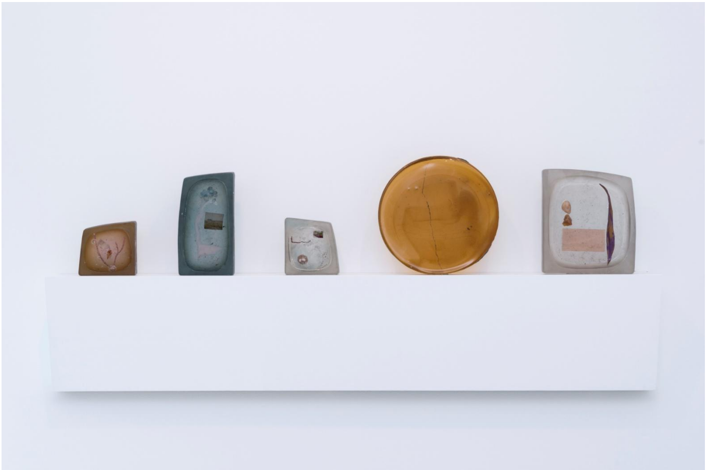
The Vitrification of Vegetation 1-5, 2014 Cast glass, resin, plant material, film, minerals Dimensions vary