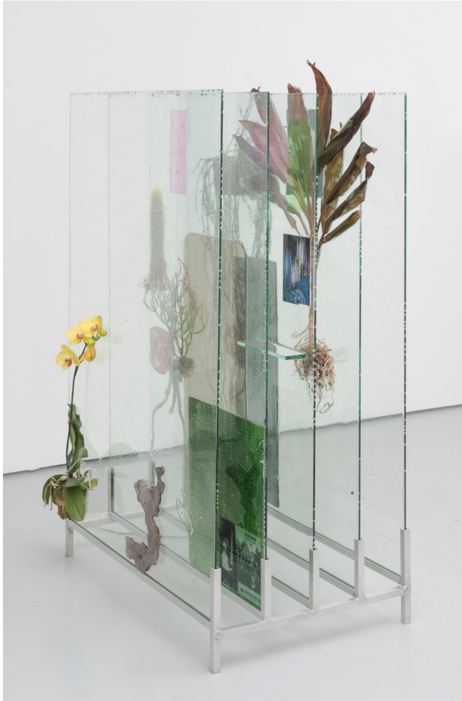
The Museum Archive (dedicated to Edward Steichen's Delphiniums, MOMA 1936) , 2014 Glass, resin, plants, beam splitter glass, photo gels, photographic prints and film 56 x 36 x 22 inches