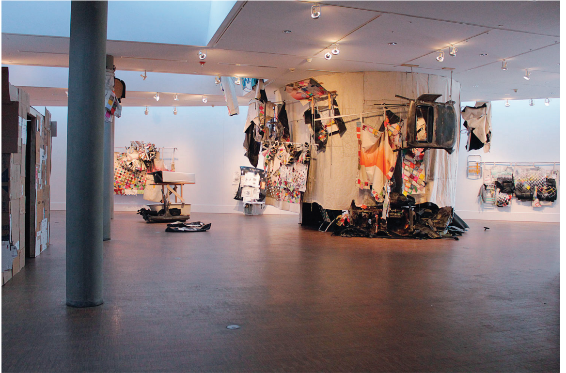
Installation View "Quality Uncertainty: The Market for Lemons", 2014 Faulconer Gallery, Grinnell College, IA