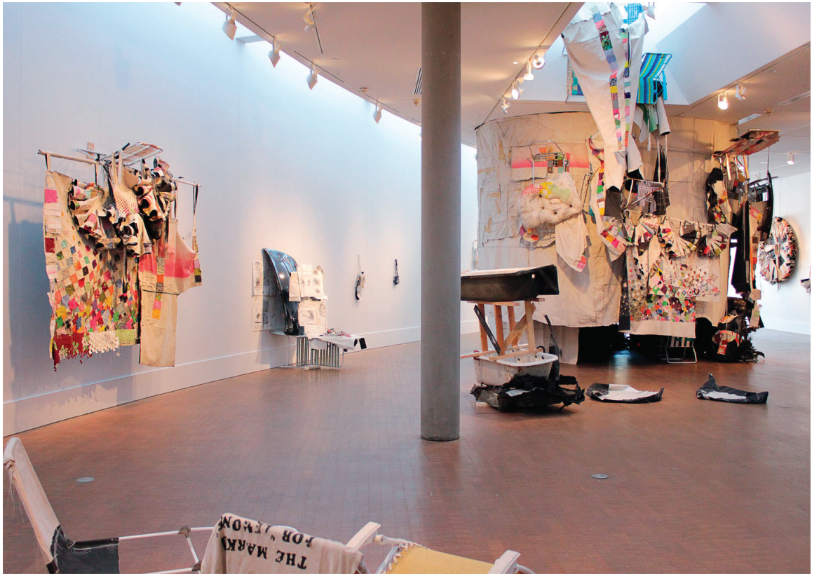
Installation View "Quality Uncertainty: The Market for Lemons", 2014 Faulconer Gallery, Grinnell College, IA